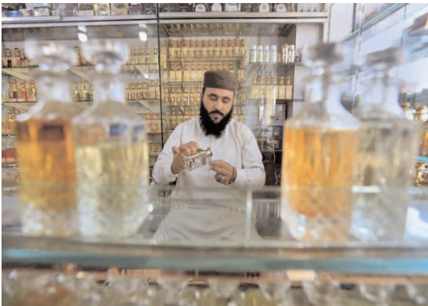
PESHAWAR: A vendor filling glass bottle with local perfume ‘itar’ for the customer at Hashtnagri area.