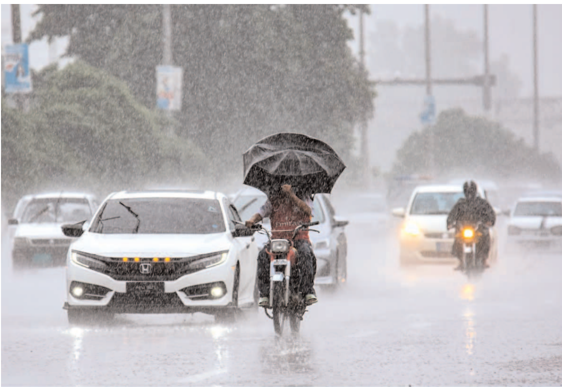
ISLAMABAD: A motorcyclist uses an umbrella to shield himself from torrential rain on the Islamabad Expressway in Federal Capital.

The CPO issued orders to the officers concerned to complete inquiries and send reports within given time frame. Syed Khalid Hamdani further said that all-out efforts were being made to ensure dispensation of speedy justice purely on merit to the people and improve service delivery standard in the region. The spokesman informed that the CPO was holding 'Khuli Kutcheries' here to provide relief to the citizens.