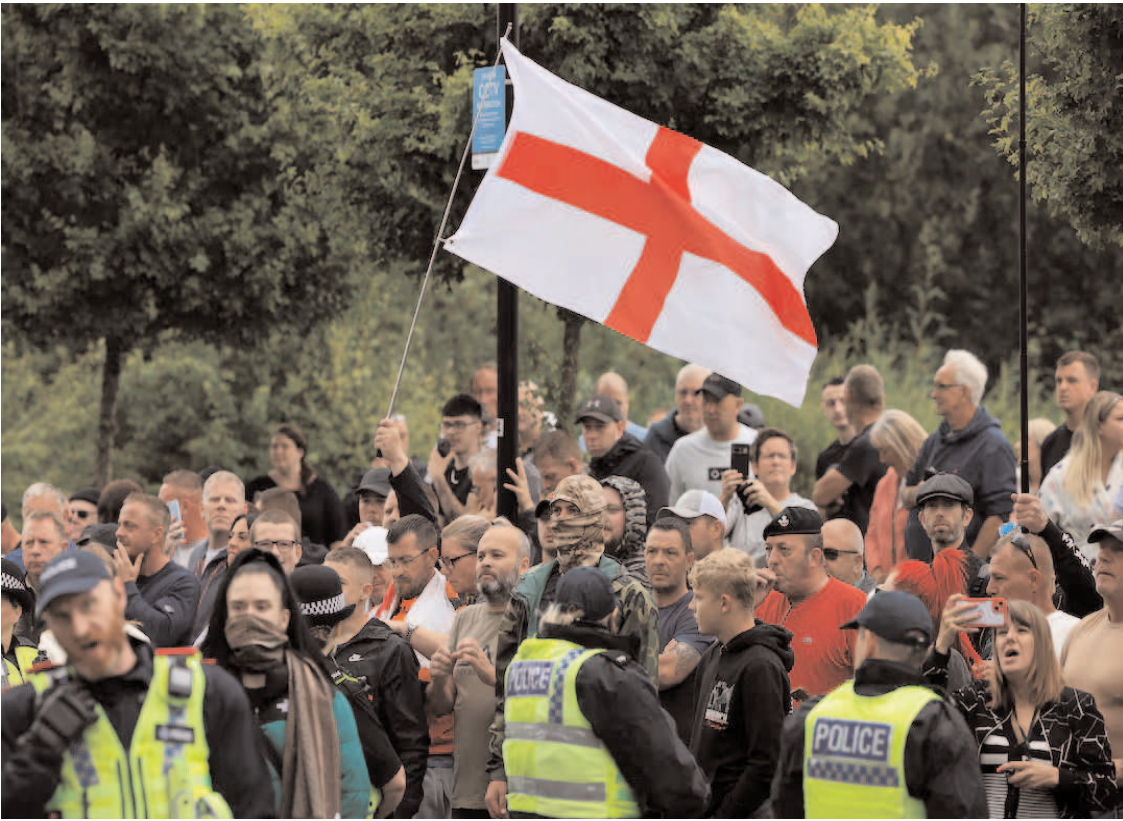
LONDON: Anti-immigration protesters gather outside a hotel in Rotherham, Britain, Sunday.

The last time violent protests erupted across Britain was in 2011 when thousands of people took to the streets after police shot dead a Black man in London.