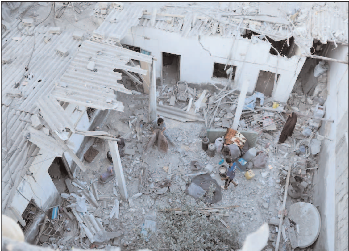
GAZA STRIP: Palestinians inspect the site of an Israeli strike on a house, amid the Israel-Hamas conflict, in Deir Al-Balah in the central Gaza Strip, on Sunday.