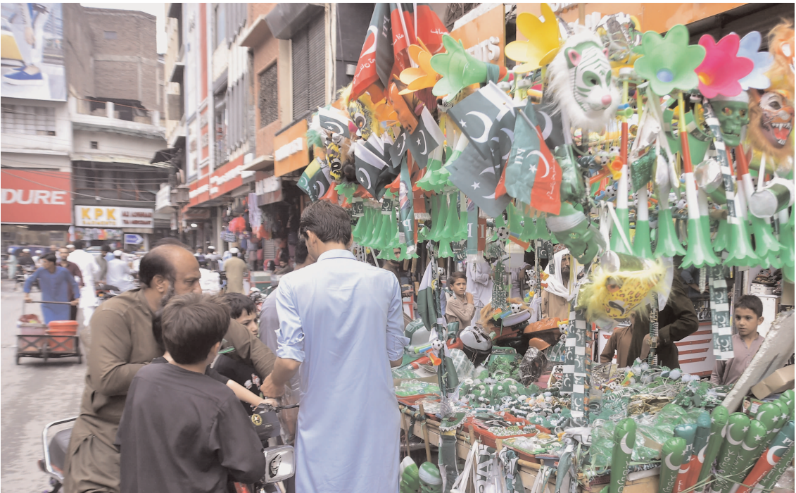
PESHAWAR: People buying flags and other stuff, from a cart at Qissa Khwani Bazaar, related to Independence Day celebrations.