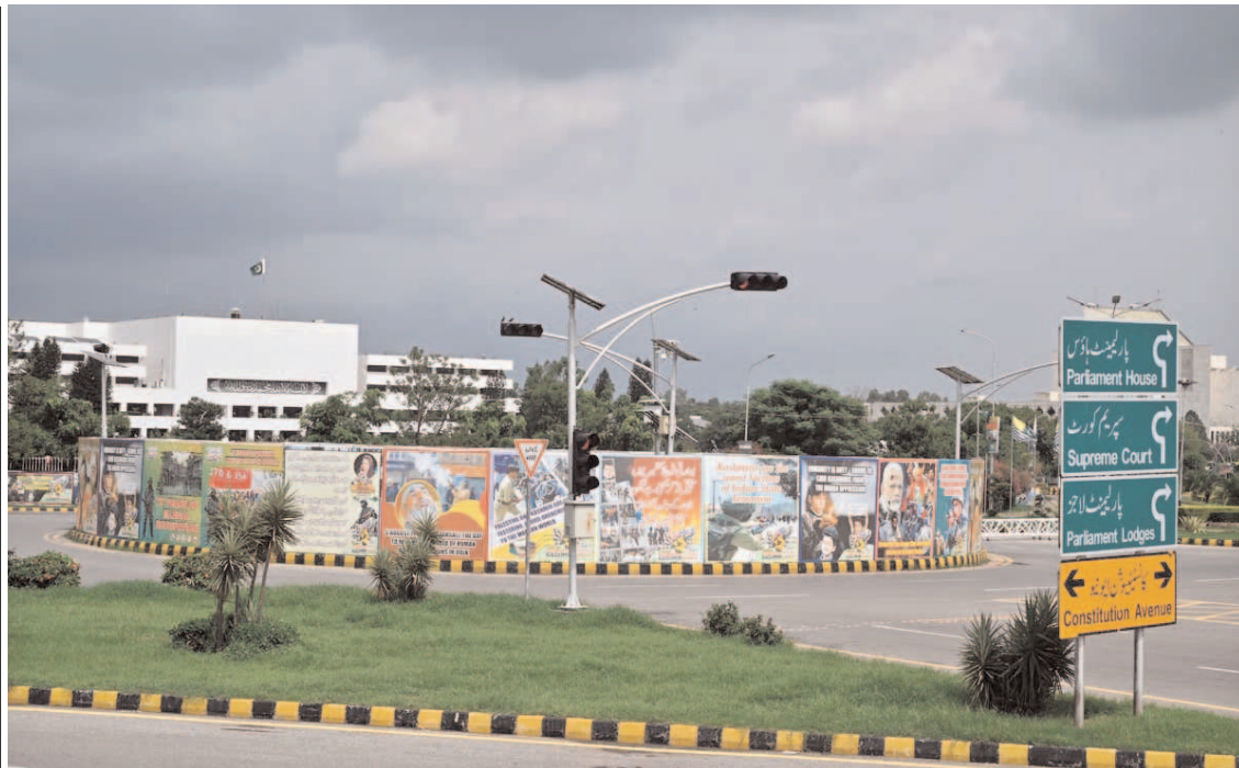
ISLAMABAD: To observe "Youm-e-Istehsal", banners and panaflexes displayed in front of Parliament House against Indian Government's decision of revocation of the special status of disputed territory of Indian Illegally Occupied Jammu & Kashmir (IIOJK).

The employees of PHA Rawalpindi, the Forest Department Rawalpindi Division, a large number of citizens and students participated in the campaign.