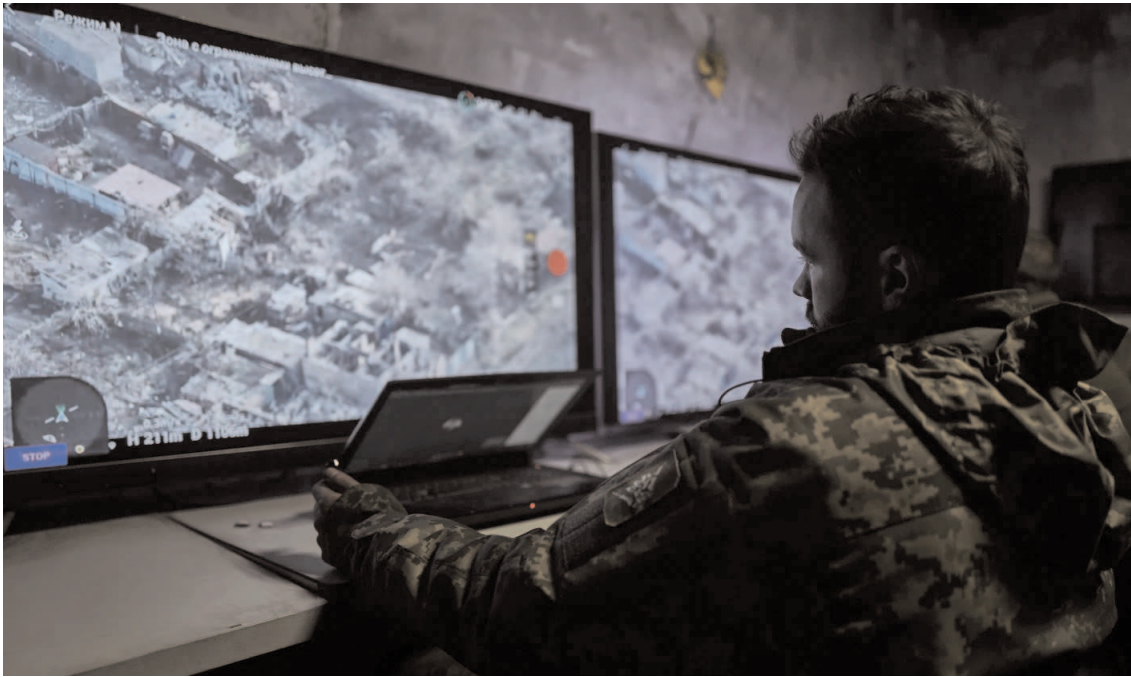
KYIV, Ukraine (AP) — Ukraine has sunk a Russian submarine and hit a Russian airfield in

the past 24 hours, in line with a surge of long-range attacks against Russian targets, officials said.