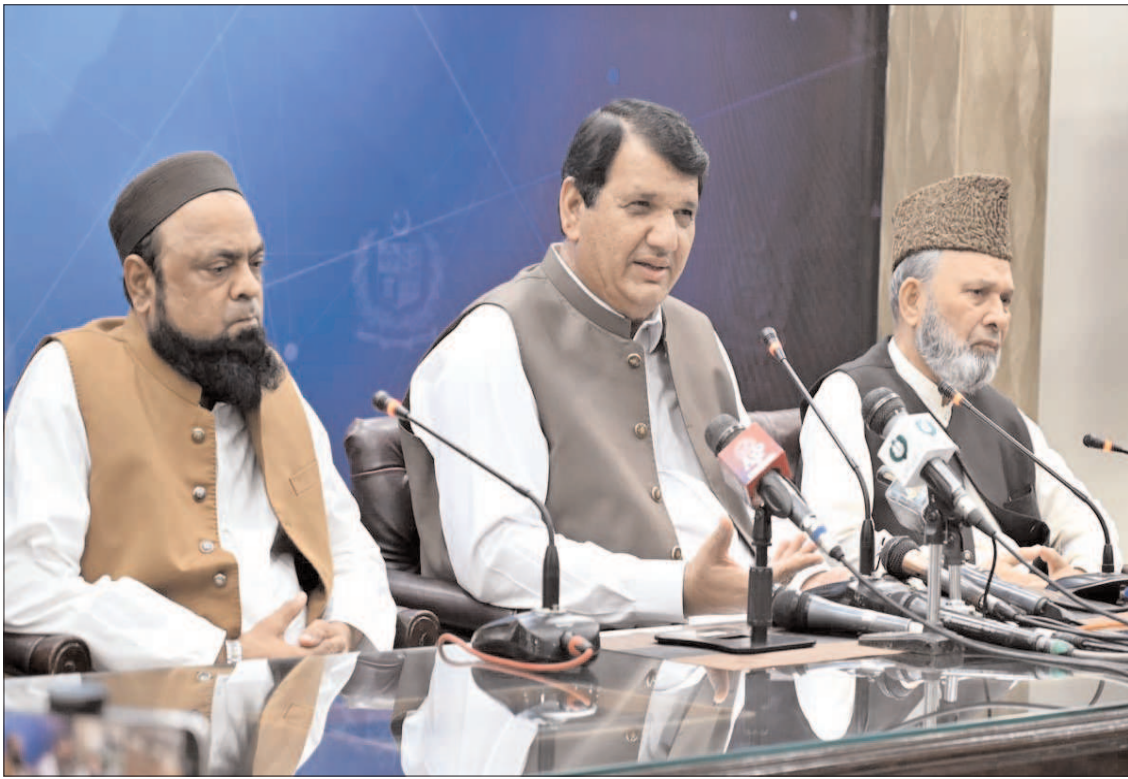
ISLAMABAD: Federal Minister for Kashmir Affairs Engineer Amir Muqam along with All Parties Hurriyat Conference (APHC) leadership addressing a press conference at PID Media Center.