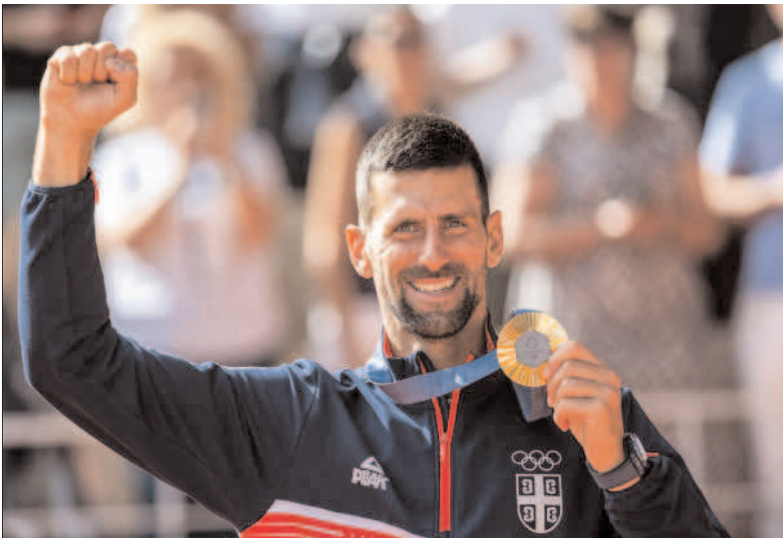
PARIS: Winner Novak Djokovic of Serbia presents his gold medal and celebrates while victory ceremony after men's single final on day nine of the Olympic Games Paris 2024.