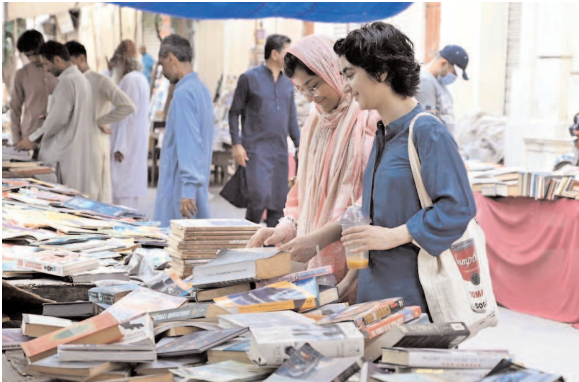
LAHORE: Women busy in selecting and purchasing old books from roadside stall at Mall Road.