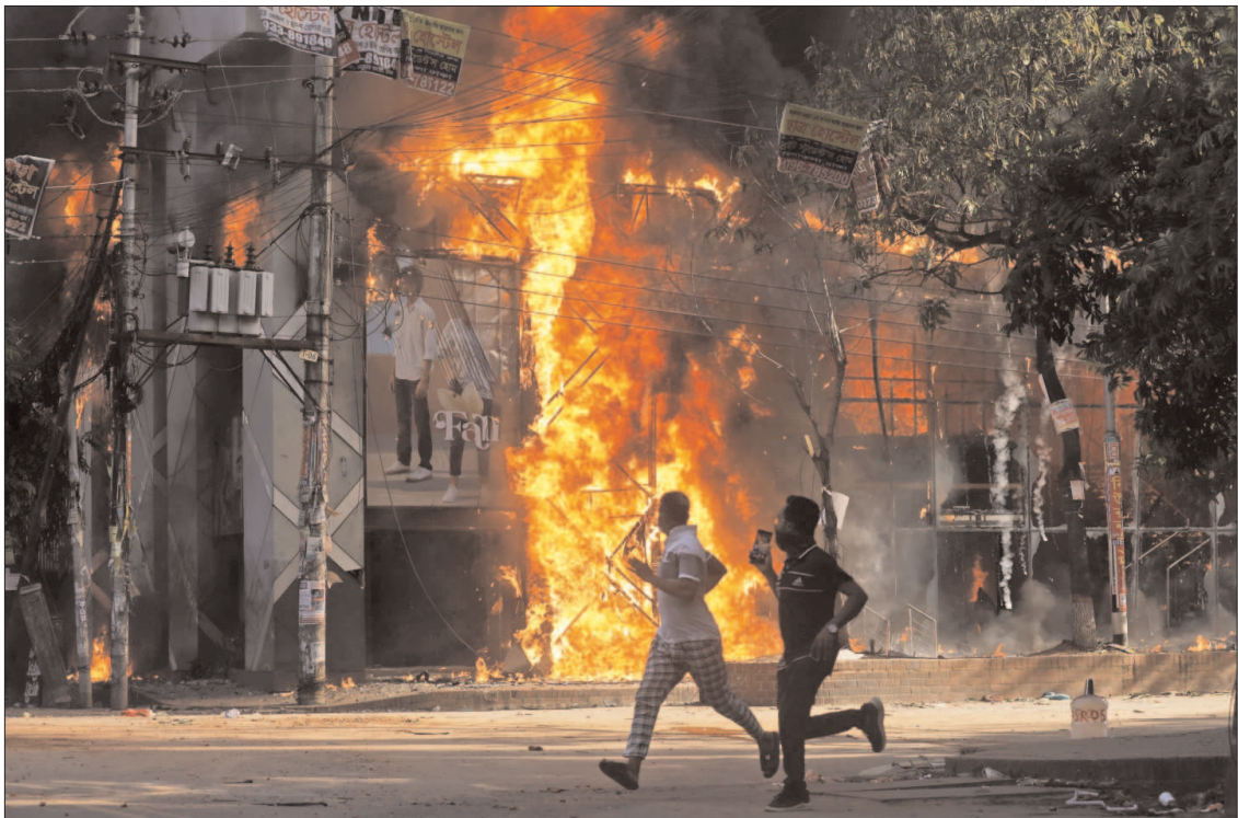
DHAKA: Men run past a shopping center which was set on fire by protesters during a rally against Prime Minister Sheikh Hasina and her government.