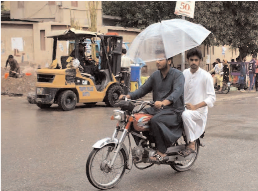
QUETTA: Motorcyclists travelling towards their destination during rain in provincial capital.