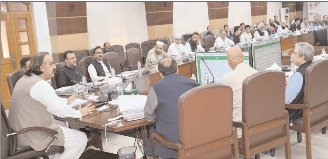
PESHAWAR: Chief Minister Khyber Pakhtunkhwa, Ali Amin Gandapur chairing the provincial cabinet meeting.

The provincial cabinet has approved non-ADP scheme titled 'Payment of Salaries for 395 Vaccinators (BPS-12)' for period from 1st July 2022 to 30th June 2024 at a cost of rupees 447.780 million. The vaccinators have already rendered services but their salaries have not been paid. The funds will be arranged through re-appropriation within Health sector ADP. The cabinet has allowed the transfer of provincial government land measuring 2 kanal and 11 marla for construction of office building for District Education Officer (F) Hangu.