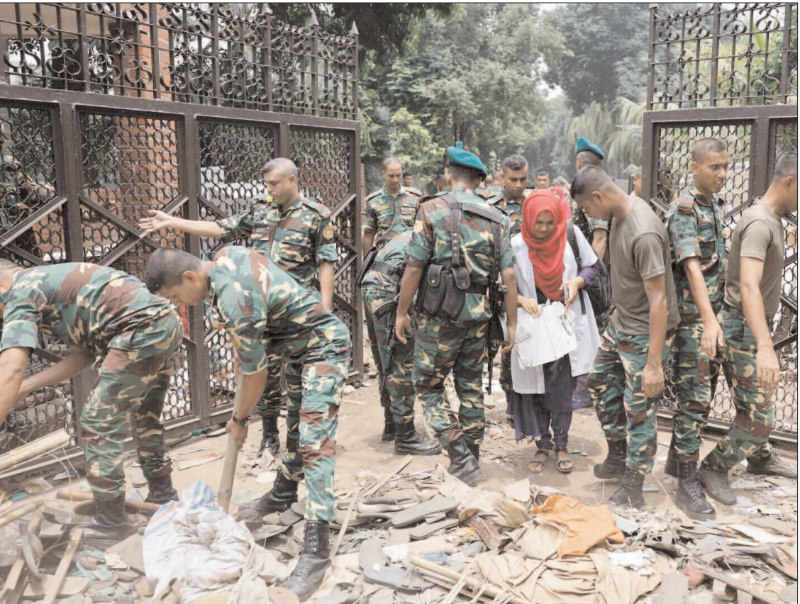
DHAKA: Members of army clearing an entrance of Ganabhaban, the Bangladeshi prime minister's residence, a day after the resignation of Prime Minister Sheikh Hasina.

F.P. Report RAWALPINDI: Jamaat-e-Islami (JI) Ameer Hafiz Naem said on Tuesday that the government wasn't taking any steps instead only making announcements despite our multiple calls. Speaking to media, the JI emir said that they expected the government to resolve the issues of inflated bills, adding that the capacity payments given to the Independent Power Producers (IPPs) were unacceptable to the people and that the government was not serious in reforming this sector. He demanded forensic audits of all the IPPs, suggesting that chairman of the Water and Power Development Authority (WAPDA) should also be a member of the forensic committee. He deplored that people living in rented houses were paying more electricity bills than their house rents. "The JI's Peshawar sit-in will be historic. We will also announce strike after Aug 14. We want to give you a message that we don't accept this bill." The tax net shouldn't be increased unnecessarily. The government has included those people in the committee who are responsible for the problem. We don't want committees and announcements rather actions. Our committee can fight the case of 250 million people. We won't retreat as we plan to move towards the Murree Road on Aug 8", he announced.