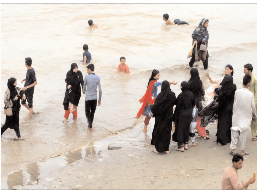
HYDERABAD: People enjoying pleasant weather at Indus River.

They said the account was opened for two day in a month only for drawing salaries of the concerned officials. The contractors' representatives said the closure of PLA caused difficulty to the contractors. They said the concerned high ups had been contacted but to no avail. They demanded the district administration to take notice of the matter and keep open the personal ledger account in the district.