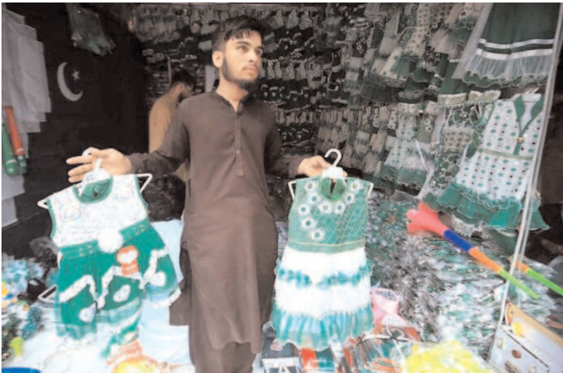
PESHAWAR: A garment vendor selling beautiful outfits for tiny Patriots with big style on upcoming celebrating Independence Day, 14th August, at Qissa Khawani Bazar.