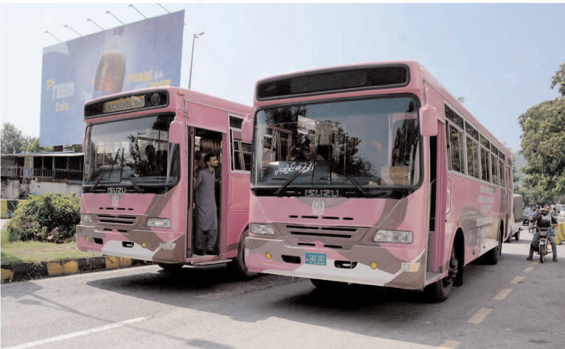
RAWALPINDI: The 'Pink Bus Service' to facilitate female students, teachers and other women commuting from rural to urban areas, announced by the Ministry of Federal Education and Professional Training in Islamabad.

"Moreover, plastic bags and other debris accumulate in storm-water drains, causing them to overflow and inundate our cities," he added. The Director emphasized that the consequences of plastic pollution are far-reaching, from damaging infrastructure and property to threatening human life and public health. "It is imperative that we address this critical issue by reducing plastic use, increasing recycling, and promoting sustainable practices," he urged. By working together, we can mitigate the risk of urban flooding and create a safer, more resilient environment for our communities," he mentioned.