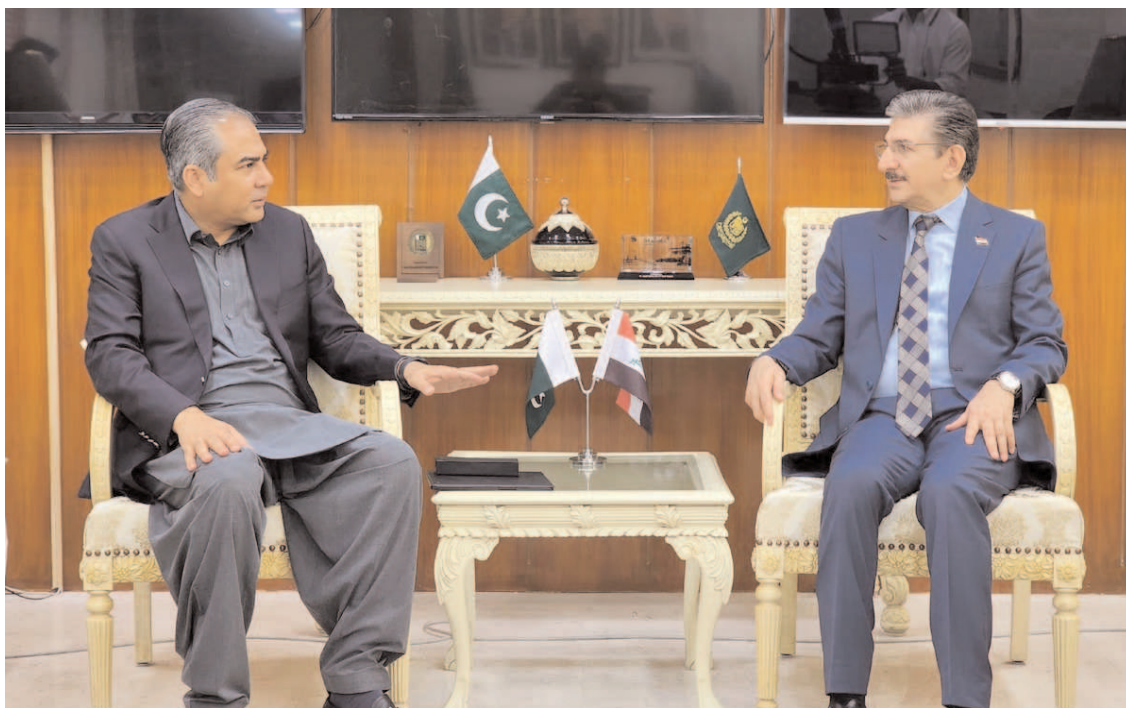
ISLAMABAD: Federal Minister for Interior Mohsin Naqvi in a meeting with Ambassador of Iraq Hamid Abbas Lafta.

ISLAMABAD (APP): As the countdown has started for the celebration of Independence Day, falling on August 14, a large number of stalls displaying national flags, bunting, dresses and other accessories of the capital city are attracting buyers. A large number of patriotic youngsters especially children can be seen around these stalls daily for buying flags, bunting, badges and Jashan-i-Azadi dresses to finalize their preparations. While to keep the interest of kids intact in these celebrations, the flag-coloured toys are also on display for the attraction.