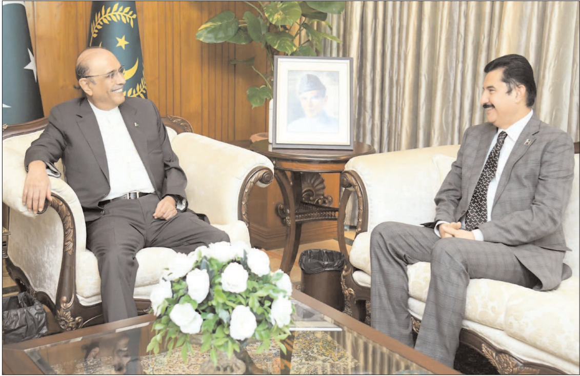
ISLAMABAD: Governor Khyber Pakhtunkhwa, Faisal Karim Kundi, called on President Asif Ali Zardari, at Aiwan-e-Sadr.