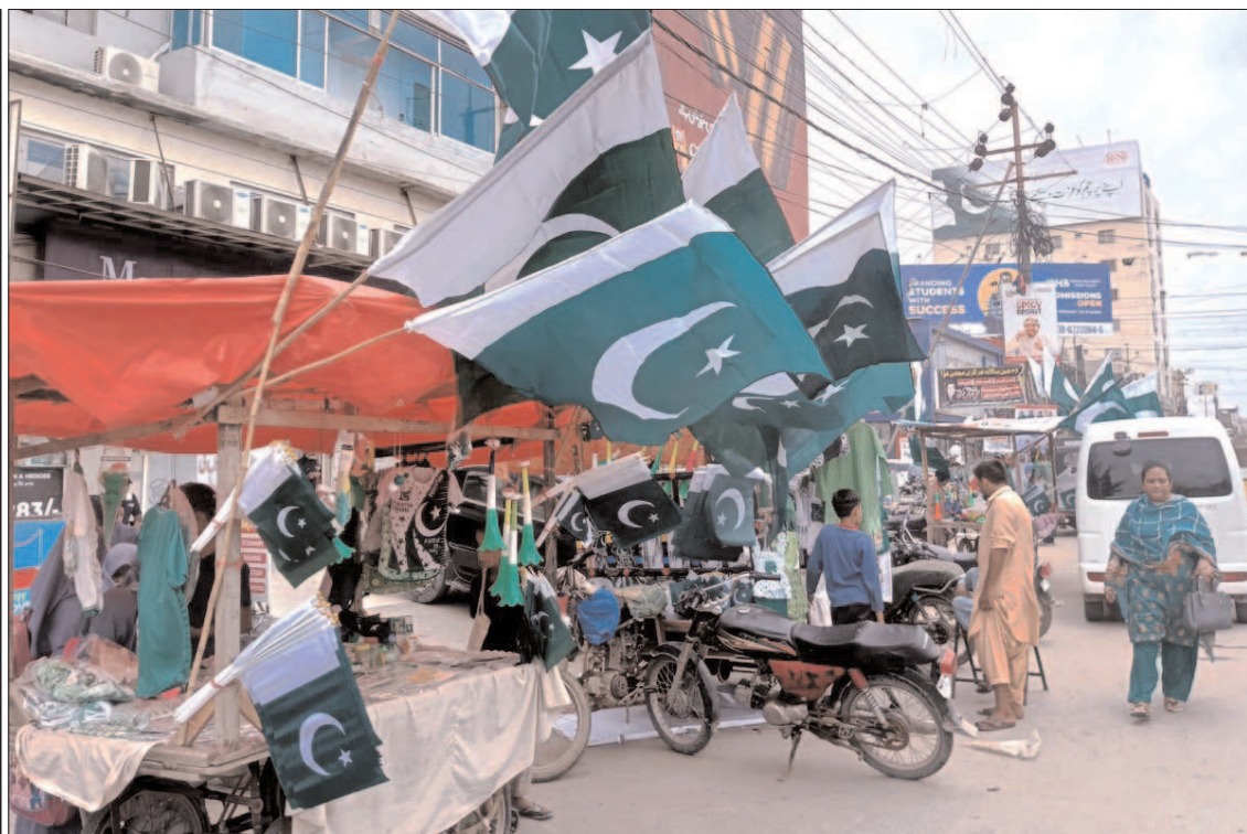
KARACHI: A vendor displays national flags, badges, and other items as the nation prepares to celebrate Independence Day in a befitting manner.

The Sundar Police had registered a case of robbery and abduction against several accused based on a complaint by Khalilur Rehman Qamar.