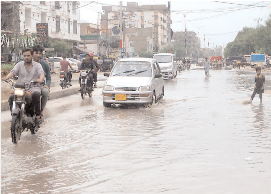
HYDERABAD: A view of accumulated rainwater at Latifabad after heavy downpour.

HYDERABAD (INP): Police in its continued drive against narcotics and criminals on Wednesday arrested an accused and recovered prohibited raw material. Hyderabad Police along with excise police conducted an intelligence-based raid on Pak International Goods Transport and recovered 185 bags of raw material used in the manufacturing of gutka and mainpuri and held an accused Ejaz. In another drive, Hatri Police acting on a tip-off raided a warehouse and recovered a huge quantity of the bags of raw material from a container.