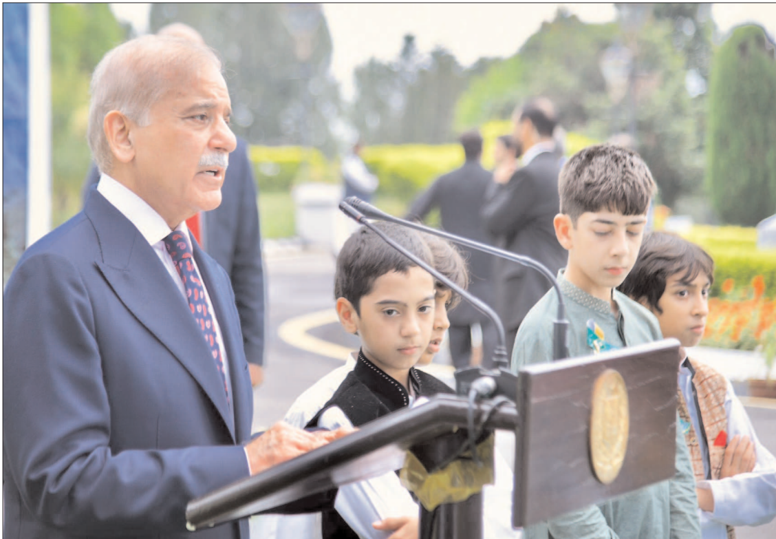
ISLAMABAD: Prime Minister Shehbaz Sharif addressing the launching ceremony of monsoon tree plantation campaign.