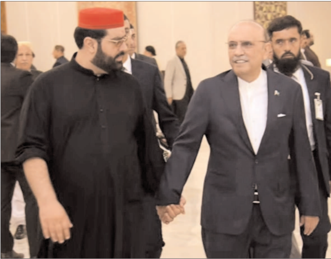
ISLAMABAD: President Asif Ali Zardari interacting with ANP leader, Senator Aimal Wali Khan during a dinner hosted at Aiwan-e-Sadr.

Speaking about inflated power bills and discrimination meted out to smaller provinces in the electricity bills, the JI emir said that the Independent Power Producers (IPPs) brought the country on the cusp of danger, adding that former PM Nawaz Sharif announced reduction in power bills alongside his daughter as if he was giving it as a charity.