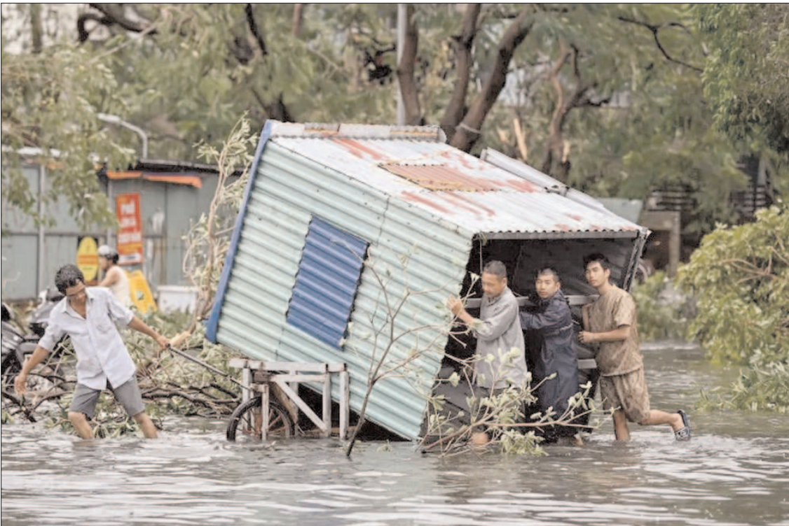
HAI PHONG: Men collecting debris on a flooded street after Super Typhoon Yagi hit the city of Hai Phong, Vietnam.