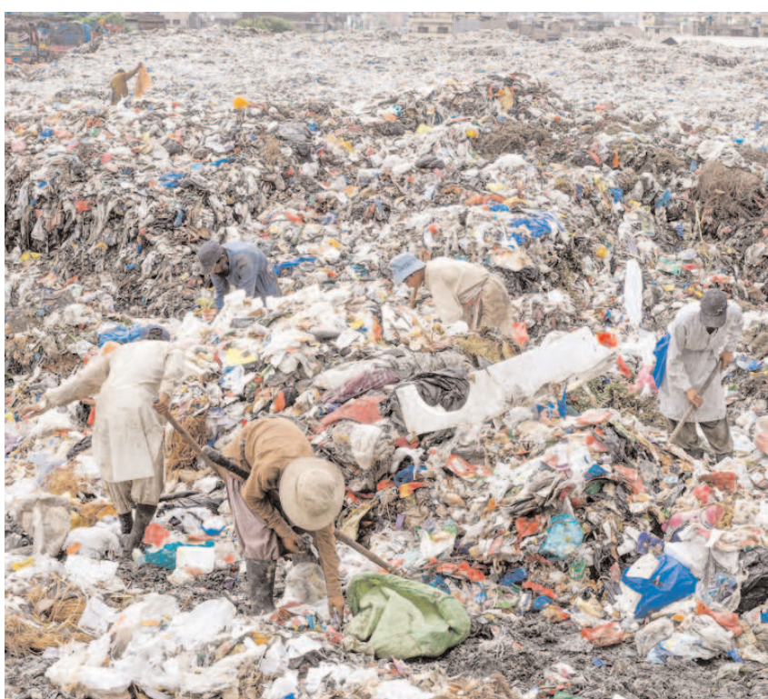
ISLAMABAD: Scavengers collect recyclables from a garage dump near the Fruits and Vegetables market.

He said the ministry was engaged with all stakeholders including provinces and we were all on the same page.