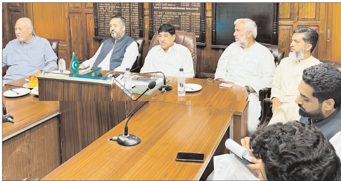
MARDAN: KP Minister for Food, Zahir Shah Toru chairing a meeting of ongoing development projects

They provided information about the machinery and human resources available to carry out cleaning and drainage work under the Clean Punjab Programme. The Deputy Commissioner stated that efforts should be made to improve sanitation arrangements in urban and rural areas under the Clean Punjab Programme and to ensure the collection of sanitation fees. On this occasion, relevant officials presented suggestions for enhancing the cleanliness and drainage work under the Clean Punjab Programme.