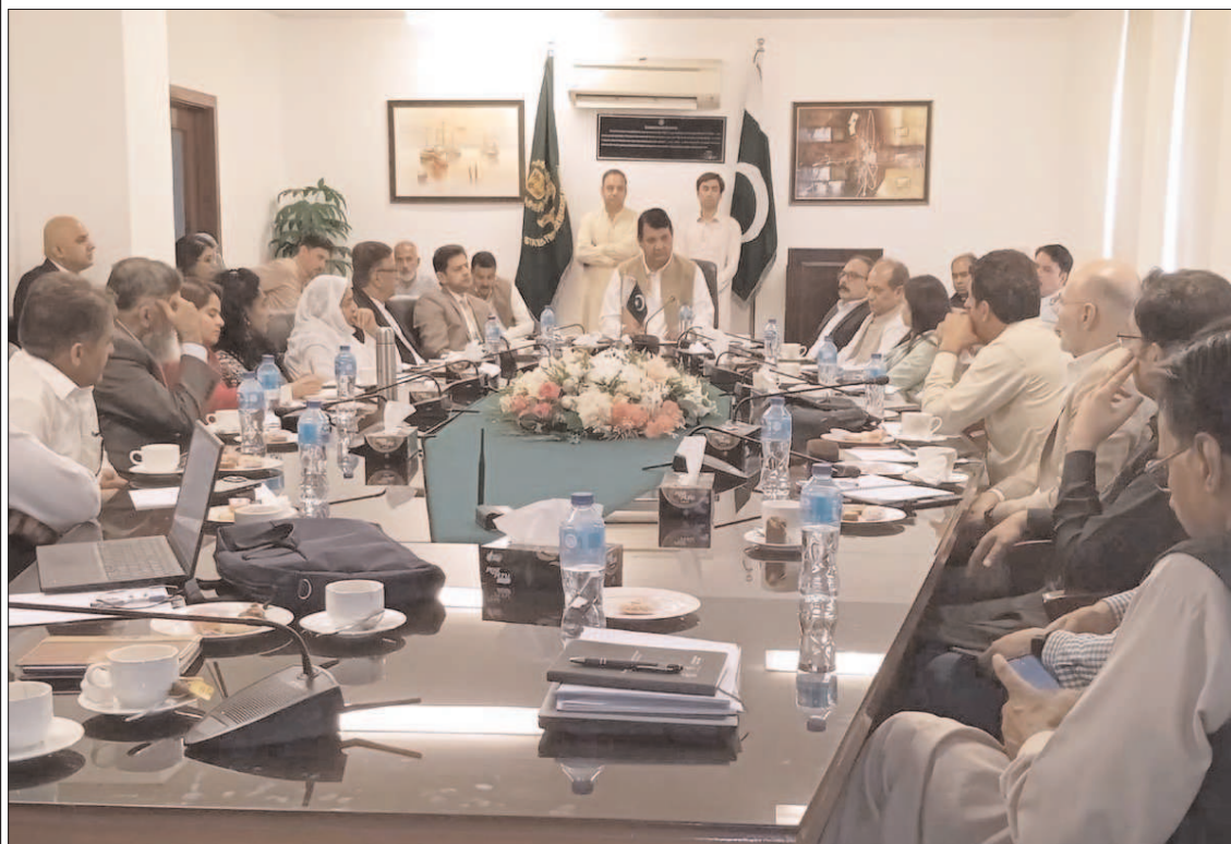
ISLAMABAD: Federal Minister for States and Frontier Regions Engr Amir Muqam chairs a meeting of representatives of different NGOs.

Muqam blamed that PTI did massive used rescue vehicles, ambulances, government funds for yesterday PTI public gathering and forced the government employees of the province to attend the public gathering otherwise they will be fired.