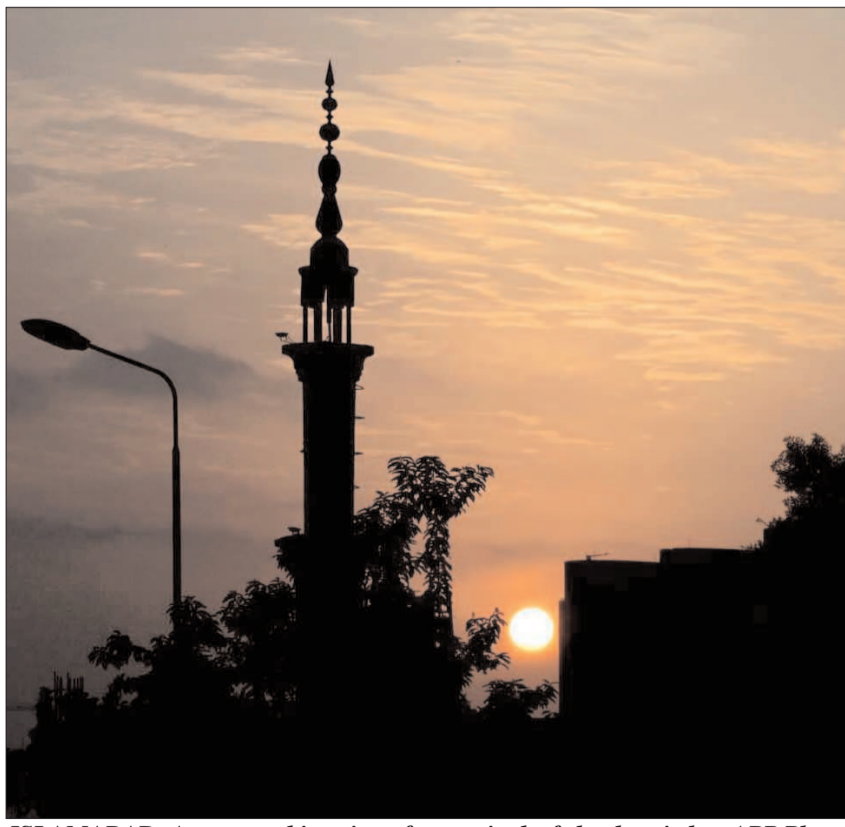
ISLAMABAD: An eye catching view of sunset in the federal capital.

Superintendent of Police, Pothohar said the accomplices and facilitators of the accused would also be sent behind bars.