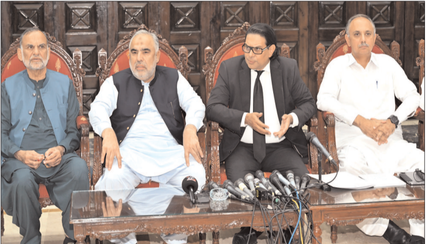
PESHAWAR: PTI senior leadership addressing a press conference.

Asif said: "I don't want to talk to you or you'll complain you are a woman." In response, when Ali Muhammad Khan told Asif to mind his manners, the latter retorted, "I learnt these manners from you." Federal Minister for Industries and Production Rana Tanveer Hussain extended an offer to the opposition, urging them to unite to strengthen parliament, democracy, and the country's overall progress. Speaking on the floor, he said that this is the right time to work together for the common people's prosperity, development, and upliftment. Recalling events from the Pakistan Tehreek-e-Insaf (PTI) government, he said that during the PTI sit-in, institutions like pvt and parliament were attacked. He also said the civil disobedience campaign initiated by PTI leaders, during which people were asked not to pay their bills. The minister also recounted the incident where the doors of Maryam Nawaz's hotel room were broken in Karachi. He said that opposition leaders were arrested on fabricated charges during the PTI government. He said that PTI founder avoided meeting opposition members in the National Assembly. He also recalled that during that time, parliamentarians urged the PTI leadership to refrain from victimizing opponents.