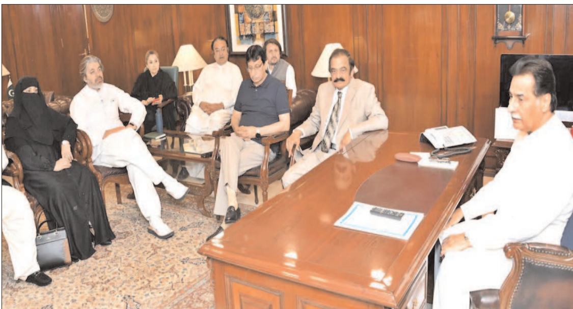
ISLAMABAD: Speaker National Assembly Sardar Ayaz Sadiq presiding over the meeting of Treasury & Opposition Members in National Assembly at Parliament House.