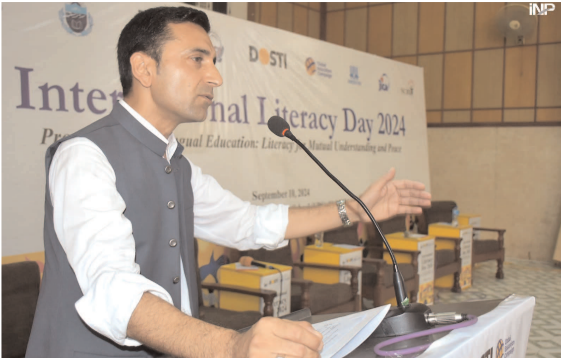
PESHAWAR: Provincial Minister Faisal Khan Tarakai addressing a seminar on International Literacy Day at a local school.