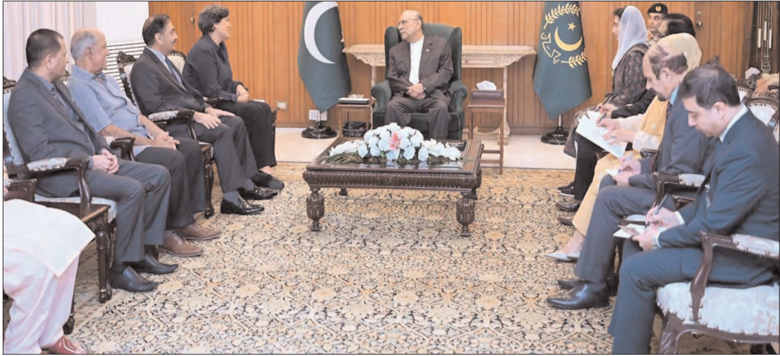
ISLAMABAD: A delegation of Dr. A Q Khan Hospital Trust called on President Asif Ali Zardari, at Aiwan-e-Sadr.