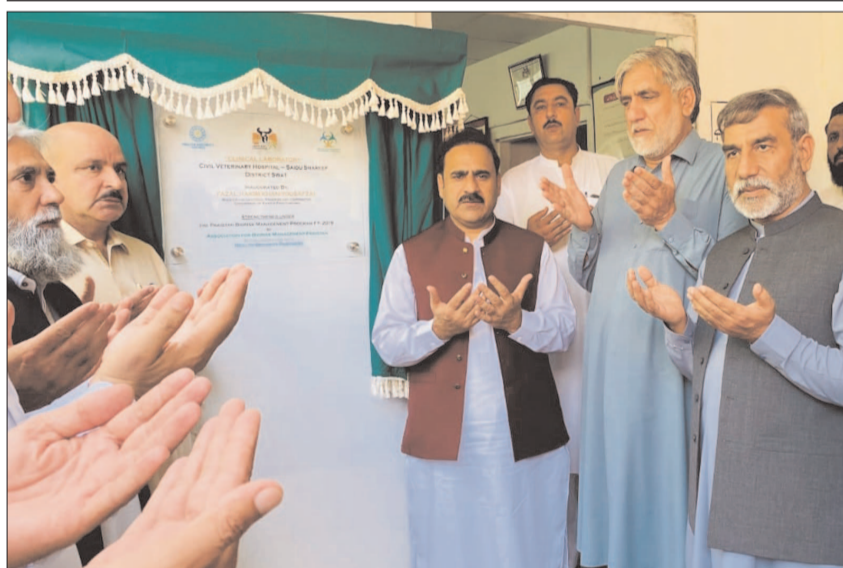
MINGORA: KP Minister for Livestock and Fisheries Cooperative, Fazal Hakeem inaugurating clinical laboratory at Saidu Sharif hospital.

The residents of Karez Kot Gangi Khel have now urged local authorities and security forces to take immediate action. They are calling for a crackdown on those responsible for creating the unrest and a swift resolution to ensure the safety of the community.