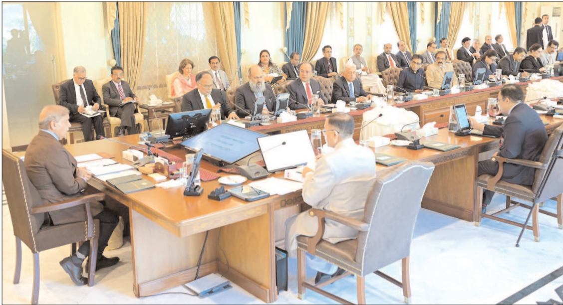
ISLAMABAD: Prime Minister Shehbaz Sharif chairing the federal cabinet meeting.