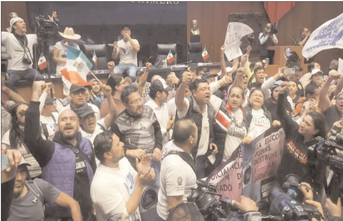
MEXICO CITY: MPs and Senators holding flags as they hold protest against judicial reforms.