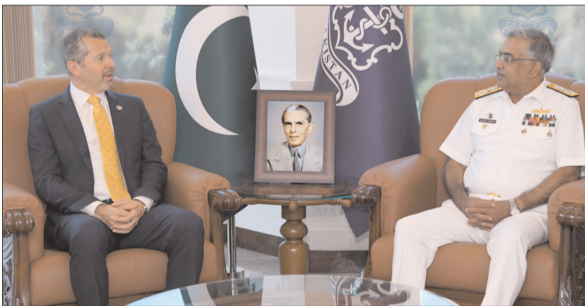
ISLAMABAD: Secretary General International Maritime Organization, Arsenio Antonio Dominguez Velasco called on Chief of Naval Staff, Naveed Ashraf at Naval Headquarters.

The police officials requested the protesters to end their demonstration, promising that the culprits would be apprehended within an hour. Earlier this week, at least two police officers were injured in an attack on a police vehicle escorting a polio team in South Waziristan. The incident occurred in Wana and resulted in injuries to three individuals, including the two officers.