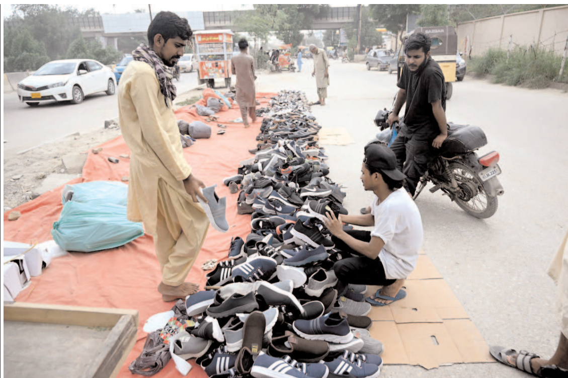
KARACHI: Youngsters selecting and purchasing local made shoes from a roadside vendor.

He expressed fear that imposition on cess on exports from KP would also extremely hurt Pak-Afghan bilateral trade, particularly the transit trade.