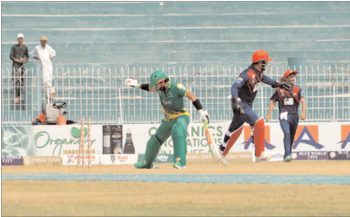
FAISALABAD: Cricket match playing between UMT Markhors and Dolphins teams during one-day Champions' Cup 2024 at Iqbal Stadium.

pool for the six teams in 2023 was $180,000, shared equally. Teams who finish third or fourth in their group will take $270,000 each while the teams who finish fifth in their group will both receive $135,000. All 10 participating teams are assured of $112,500. The increase in prize money for the ICC Women's T20 World Cup 2024 comes in line with the prize pot for the ICC Women's Cricket World Cup 2022 also increasing to $3.5 million in total. The ICC Women's T20 World Cup 2024 will open on October 3 with Bangladesh taking on Scotland at Sharjah Cricket Stadium. There has been a minor change to the match order for the double header on Saturday October 5 in Sharjah, with Australia now facing Sri Lanka in the afternoon at 14h00, followed by the Bangladesh versus England match taking the evening slot at 1800 local time. Ten teams will play 23 matches in Dubai and Sharjah to decide the 2024 champions.