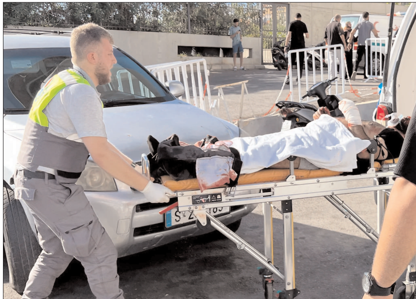
BEIRUT: A civil defence first responder carries a wounded man whose hand-held pager exploded, at hospital in Lebanon.

For his part, Asad Qaiser castigated the incumbent rulers for 'concealing' the draft of the constitutional package, which he said contained at least 56 amendments, even from its own parliamentarians. "We do not accept this legislation in any respect." The PTI leader further said that the future course of action will be decided after consultation with all opposition parties. However, he mentioned, they will table this matter in tomorrow's lawyers' convention in Lahore.