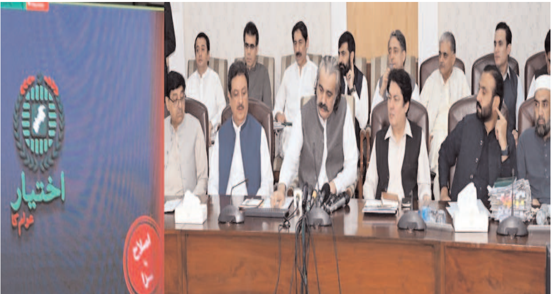
PESHAWAR: Chief Minister Sardar Ali Amin Khan Gandapur launching Ikhtiyar Awam Ka portal as an important initiative towards promoting good governance and addressing public issues in the province.