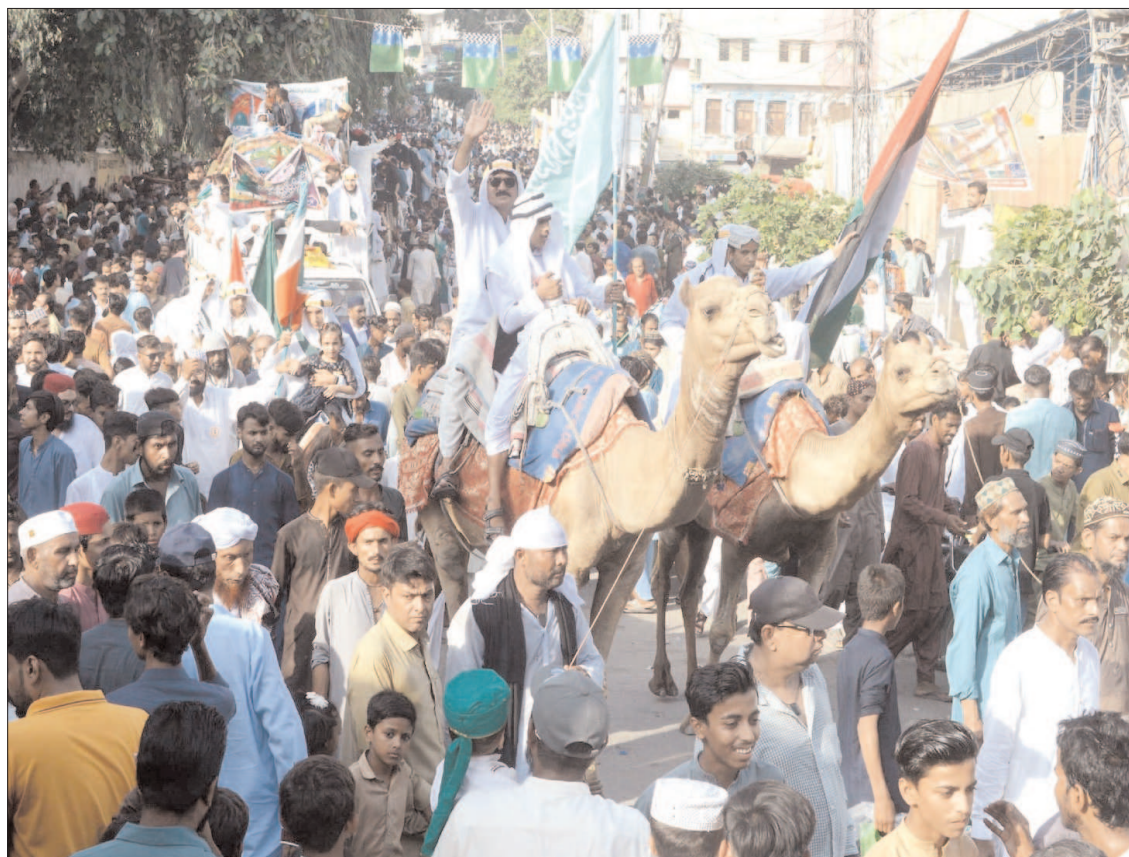
HYDERABAD: A large number of people participating in Eid Milad Un Nabi celebrations.

and Coordination Department (S&GAD). The District Health Officer has also been relieved of his duties due to the lapse in ensuring the safety of polio workers. The government remains committed to ensuring the safety of polio workers and will not tolerate any lapses in this regard.