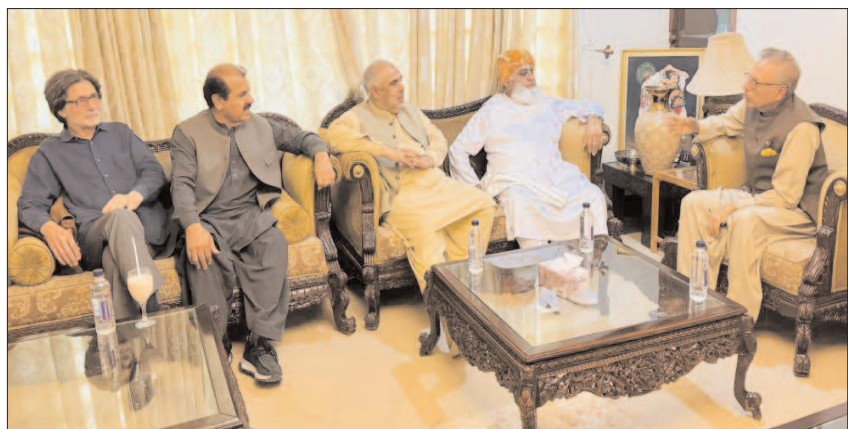
ISLAMABAD: Pakistan Tehreek-e-Insaf delegation called on JUI-F Ameer, Maulana Fazlur Rehman.

comment. In its defense of two cases, one before the International Court of Justice and one in Berlin brought by the European Center for Constitutional and Human Rights (ECCHR), the government has said no weapons of war have been exported under any license issued since the Oct. 7 Hamas attacks on Israel, apart from spares for long-term contracts, the source added. Israel's assault on Gaza has killed more than 41,000 Palestinians since Oct. 7, according to the local Hamas-controlled health ministry.