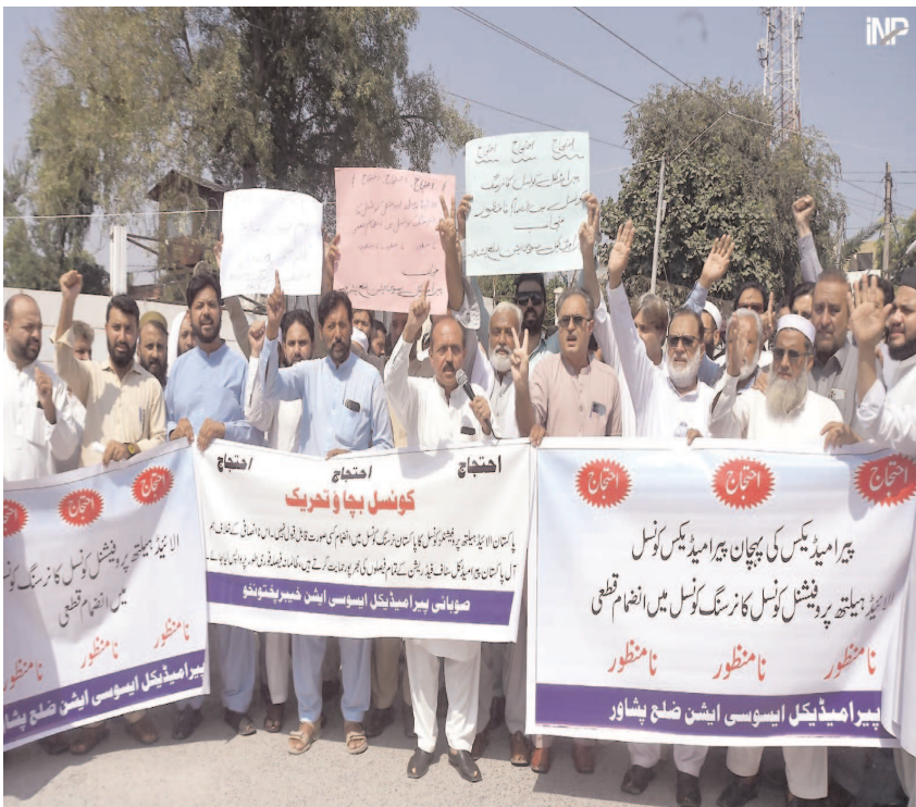
PESHAWAR: Activists of Paramedical Association holding protest outside Peshawar Press Club.