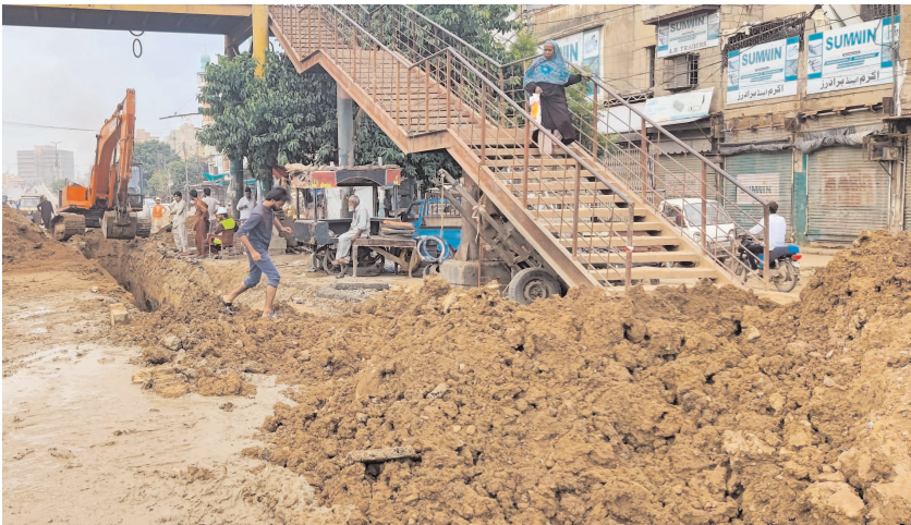
KARACHI: Labourers busy in digging for laying pipeline at Liaquatabad.