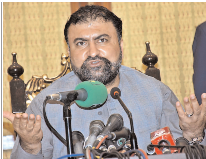
LAHORE: Chief Minister Balochistan Mir Sarfraz Bugti addressing a press conference.