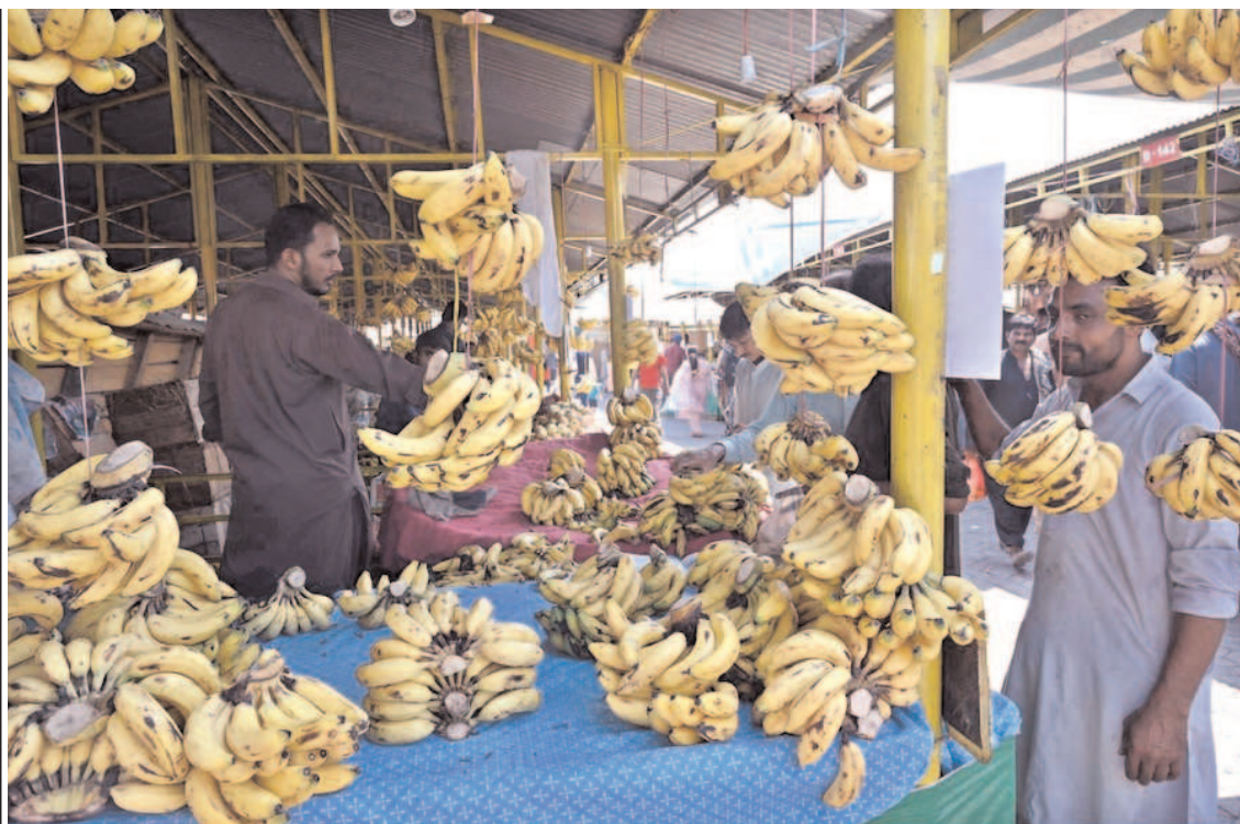
ISLAMABAD: A vendor displaying bananas to attract customers at his stall in Sunday Bazaar.