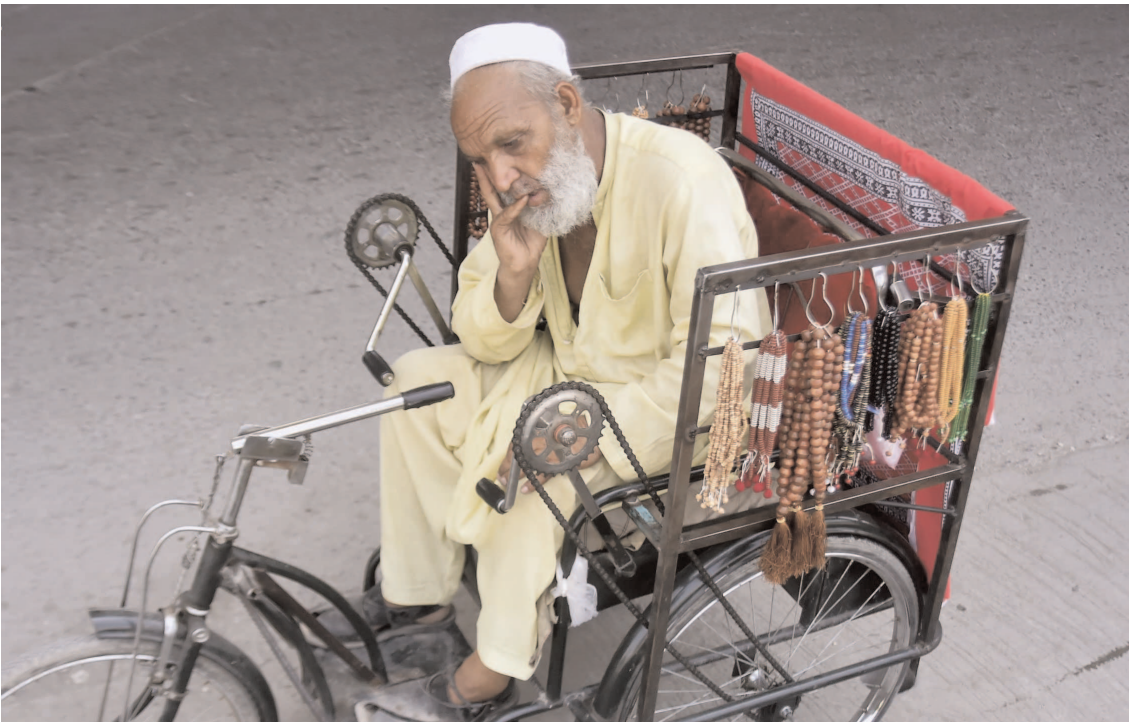
PESHAWAR: An old man waiting for the customers as he sells prayer beads at Ashraf Road.