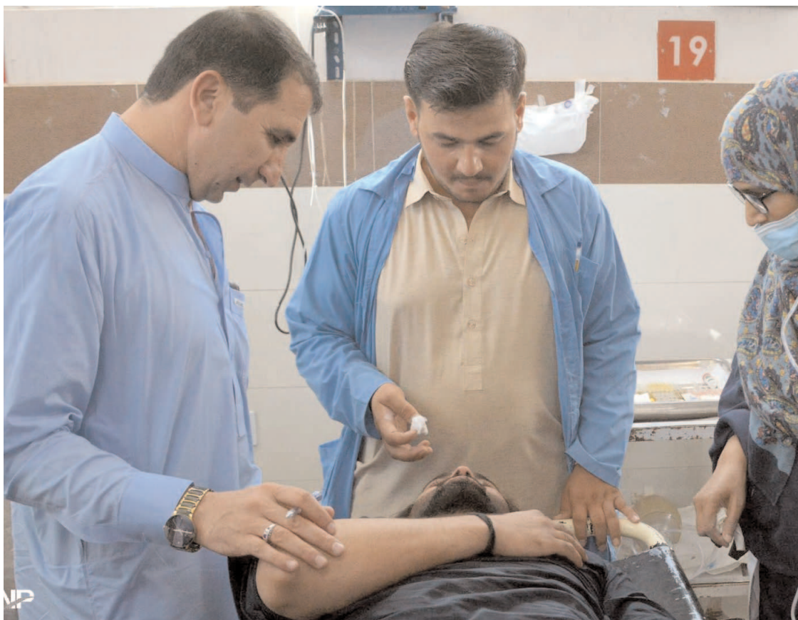
QUETTA: An injured of explosion near security forces check post at Chaman Phatak being treated at Civil Hospital.

NAROWAL (INP): Monkeys roam freely on roads in city, stealing food from homes; Wildlife Department unresponsive despite calls; Rescue 1122 fails to capture wild animals. In Narowal, wild monkeys have created chaos, making life difficult for residents, the 24NewsHD TV channel reported on Sunday. According to the report, women and children, terrified by the monkey menace, have confined themselves to their homes. The channel reported that despite numerous phone calls, the Wildlife Department remains absent from the scene, while Rescue 1122 personnel attempted but failed to capture the monkeys. The wild monkeys have been roaming freely in the streets, neighbourhoods, and even on the rooftops of homes, often stealing food and other items. The channel reported that the presence of wild monkeys has caused panic among the residents, with women and children screaming in fear whenever they spot the monkeys. So far, the district administration has been completely unsuccessful in capturing or controlling the monkeys, leaving the community distressed and uncertain about when the situation will be resolved.