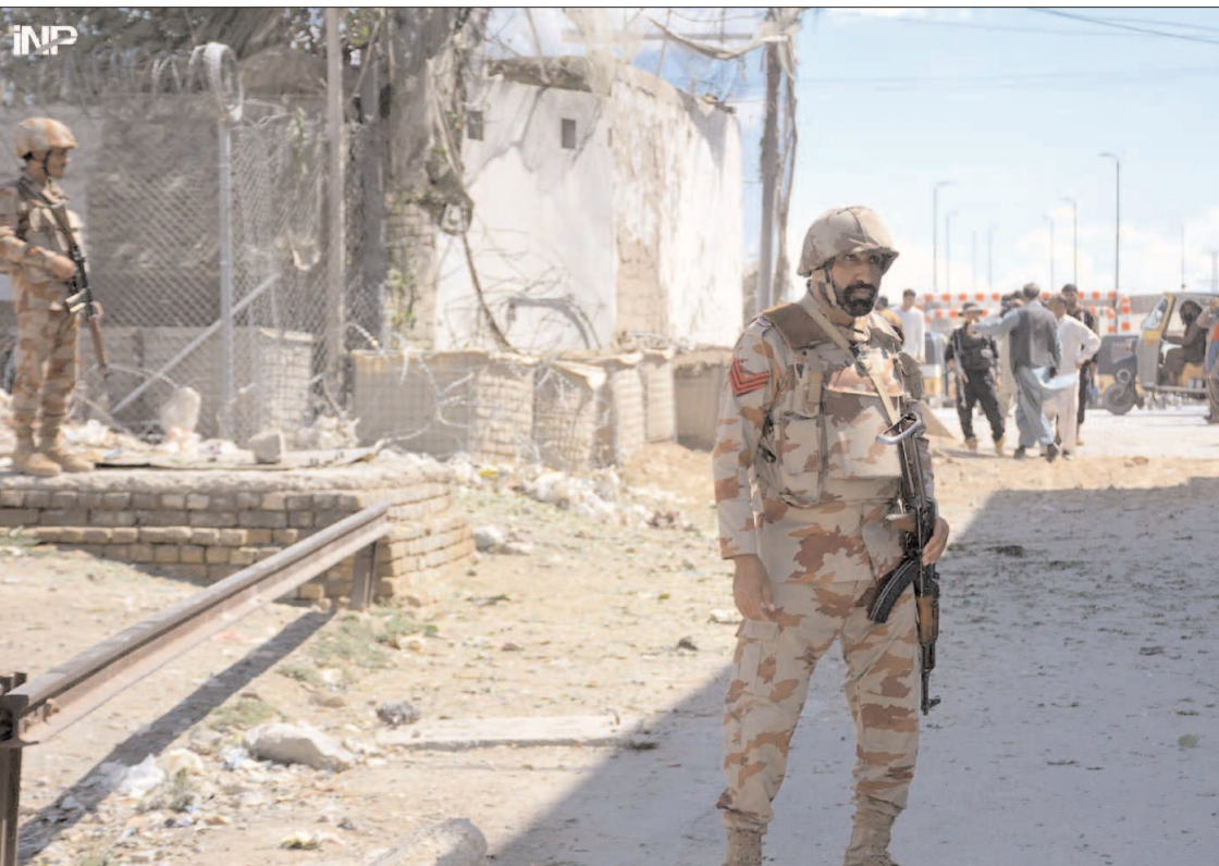
QUETTA: Security personnel standing guard at the site of the explosion near security forces check post at Chaman Phatak.

Prince Mohammed also called Turkish President Recep Tayyip Erdogan on Sunday.