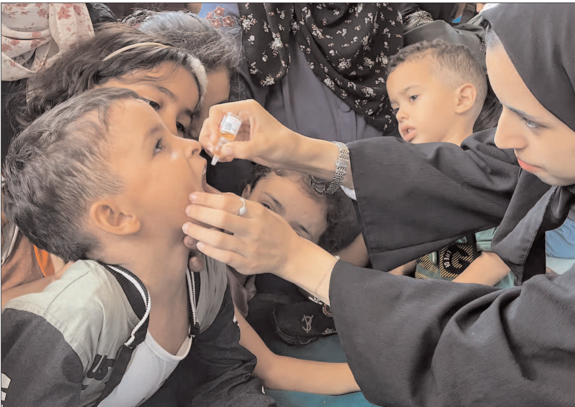
GAZA: A child is being administered with polio vaccination in central Gaza Strip on Sunday during the UN-led campaign.

Ukraine's top commander Oleksandr Syrskyi said the situation was "difficult" around Russia's main line of attack in eastern Ukraine.