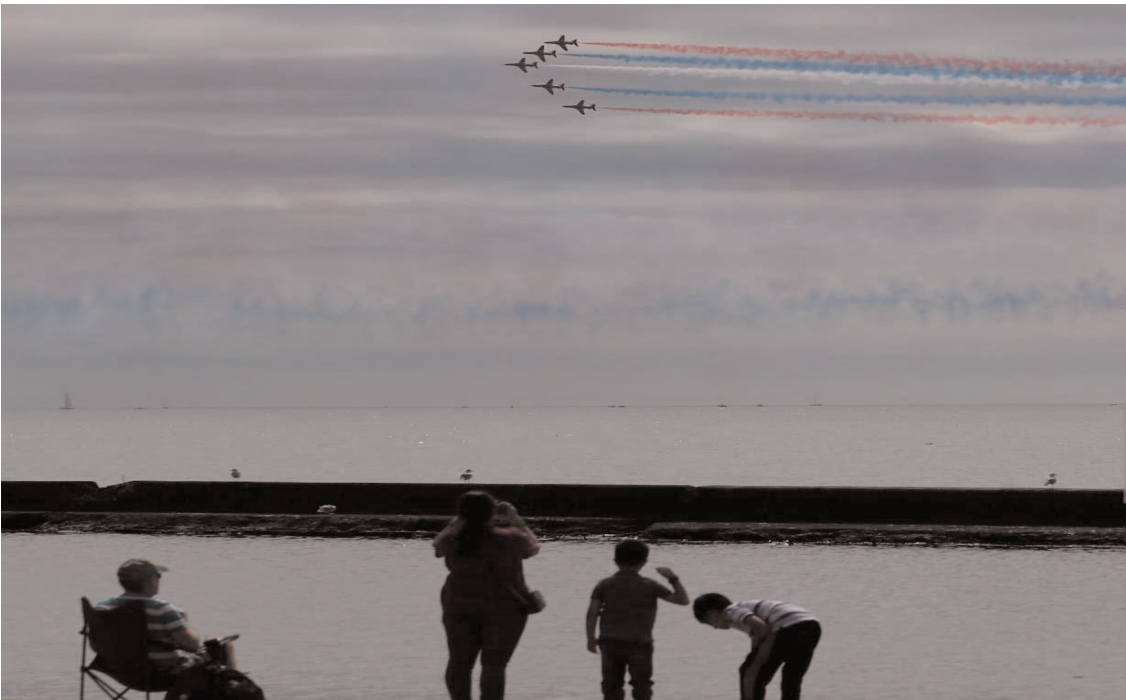
TORONTO: The military aerobatics flight demonstration team of the Royal Canadian Air Force, the Snowbirds, showcase their skills at the 75th Canadian International Air Show in Toronto.

groups. Its leader in Thuringia, Björn Höcke, has been convicted of knowingly using a Nazi slogan at political events, but is appealing. Scholz's center-left Social Democrats at least appeared set to remain in the two state legislatures, despite some election fears that they wouldn't. But the environmentalist Greens appeared set to lose their seats in Thuringia. The two parties were the junior coalition partners in both outgoing state governments. A third state election follows Sept. 22 in another eastern state, Brandenburg, currently led by Scholz's center-left Social Democrats. Germany's next national election is due in a little over a year.