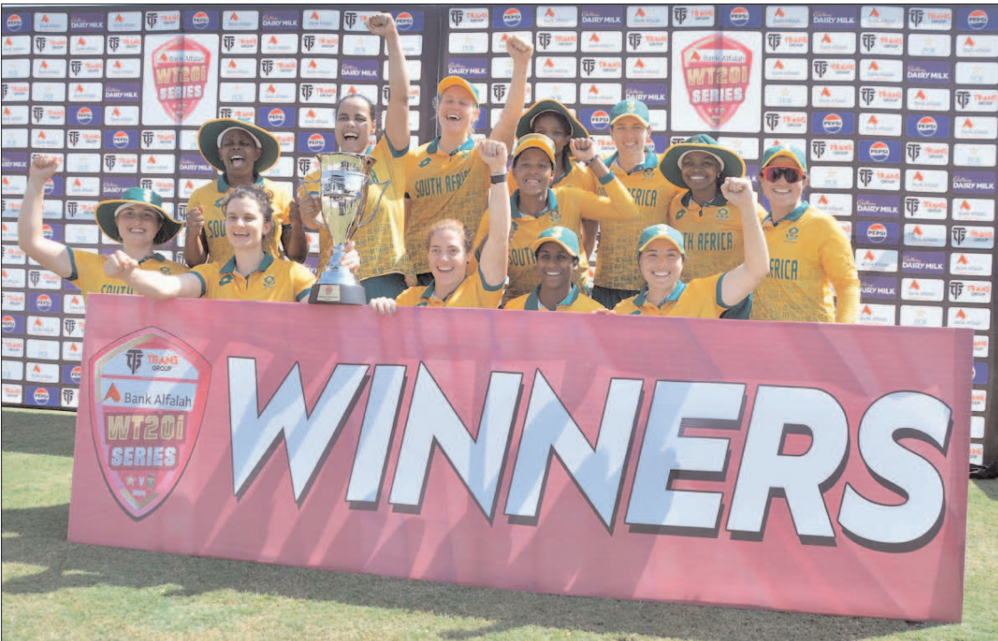
MULTAN: The South Africa Women's cricket team celebrates with the trophy after winning the series 2-1 against Pakistan Women at Multan Cricket Stadium.