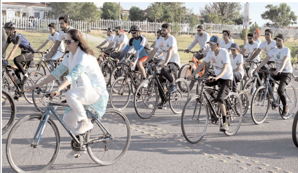
ISLAMABAD: A large number of youth participating in a cycle rally "Cycle for life" to promote environmental preservation, raise awareness about the dangers of drug use among youth organized by the PM's Youth Program.

He said the protection of life, property and self-respect of citizens comes first, DIG maintained.