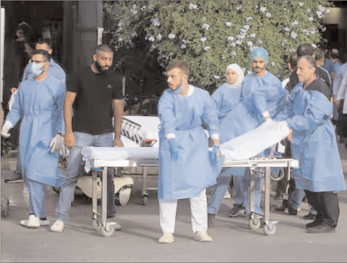
BEIRUT: Medical staff waiting for arrival of an ambulance outside of a hospital, after an Israeli strike in Lebanon.

He said that our legal experts have completed their homework regarding the Constitutional Court. However, the issue of Constitutional Court has not been yet discussed in the party meeting, he added. The JUI leader said that the Supreme Court was responsible for resolving the dispute about reserved seats as the reserved seats were distributed as per decision of the apex court. He said that change in decision of Supreme Court created a dispute. Whatever decision was made by the Election Commission, JUI will follow it, he concluded.