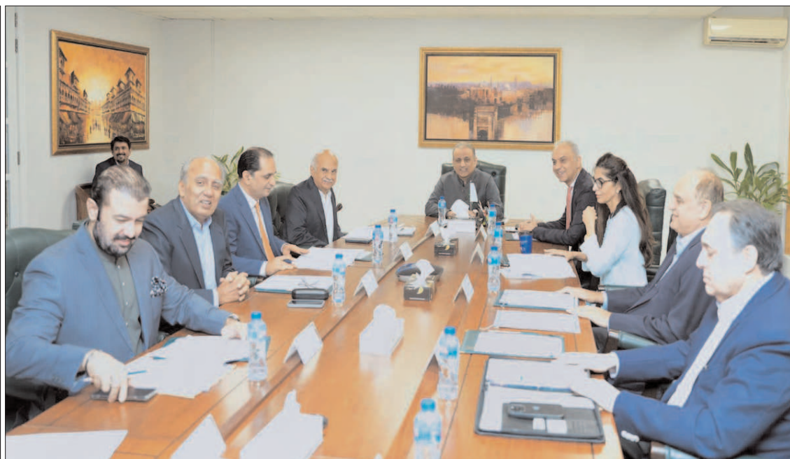
ISLAMABAD: Federal Minister for Privatisation, Abdul Aleem Khan presiding Privatisation Commission Board Meeting.

He said that uniform laws should be adopted for those vehicles who wanted to use motorways. He said that all those officials who will bring reforms for betterment of NHA will be awarded honorary certificates.