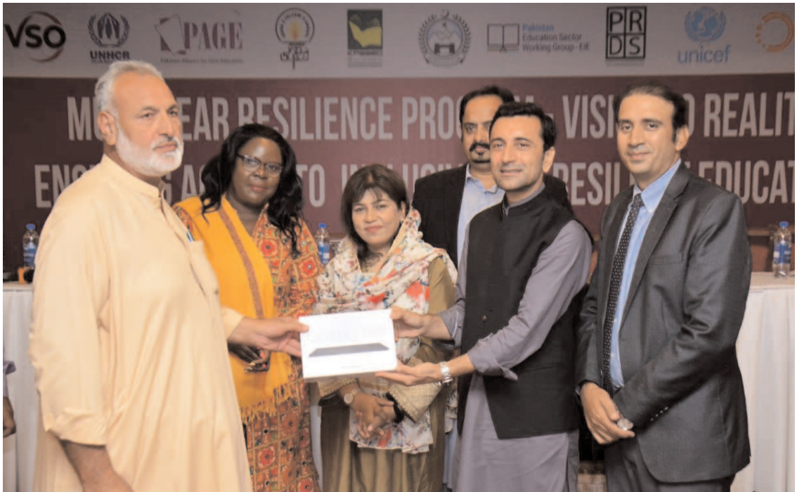
PESHAWAR: Minister of Elementary & Secondary Education KP Faisal Khan Tarakai distributing computer tablets under Multi Year Resilience Program.