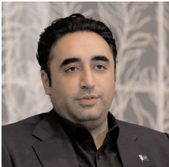
Kudos to Bilawal Bhutto Zardari! Political foresightedness, wisdom and shrewdness of Bilawal Bhutto Zardari is not only endorsed by sitting Prime Minister Shehbaz Sharif but all parliamentarians and stakeholders of