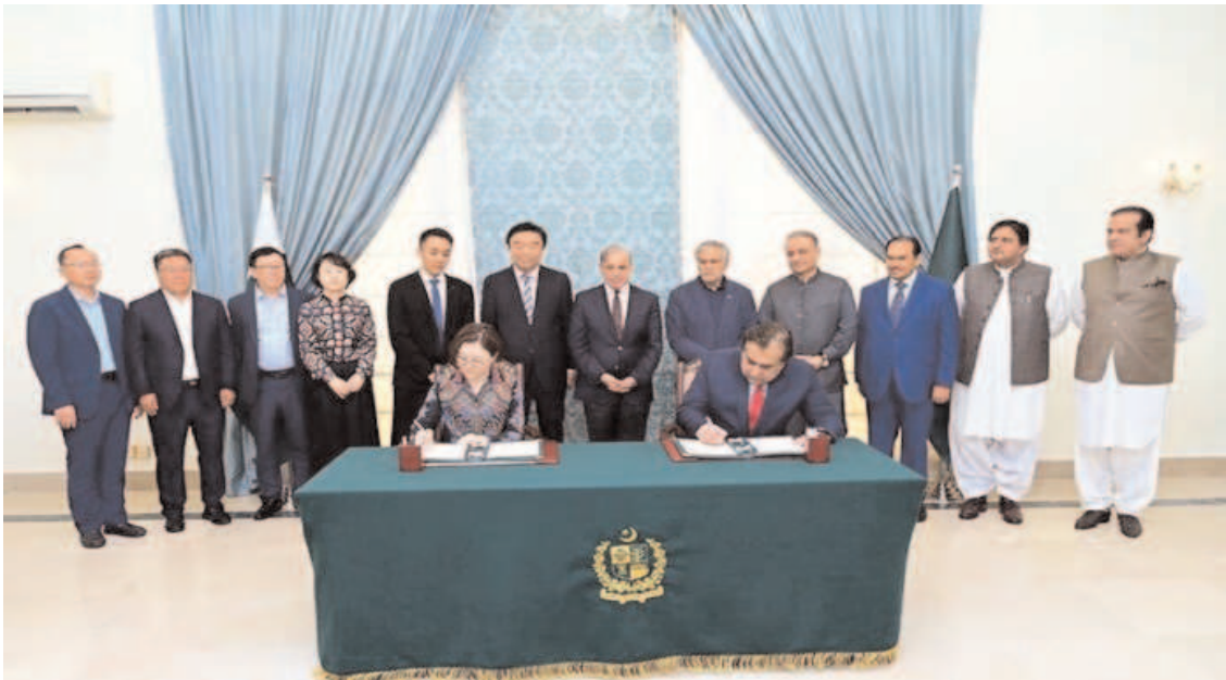
ISLAMABAD: Prime Minister Muhammad Shehbaz Sharif witnesses signing of an MoU between Board of Investment and RUYI Shangdong.