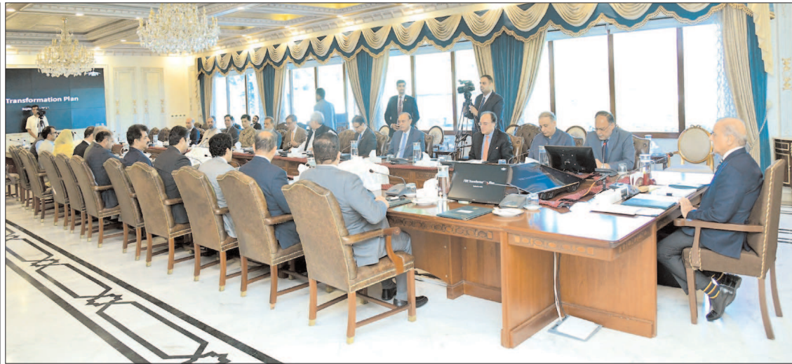
ISLAMABAD: Prime Minister Shehbaz Sharif chairing a meeting on transformation plan of Federal Board of Revenue.

Furthermore, it stated that an application pleading urgency or seeking interim relief, filed in a cause, appeal, or matter, shall be fixed for hearing within 14 days from the date of its filing. However, the law had the provision that this right of appeal would also extend retrospectively to those aggrieved persons against whom an order was made under Article 184(3) prior to the commencement of the Act, but the court has struck it down.