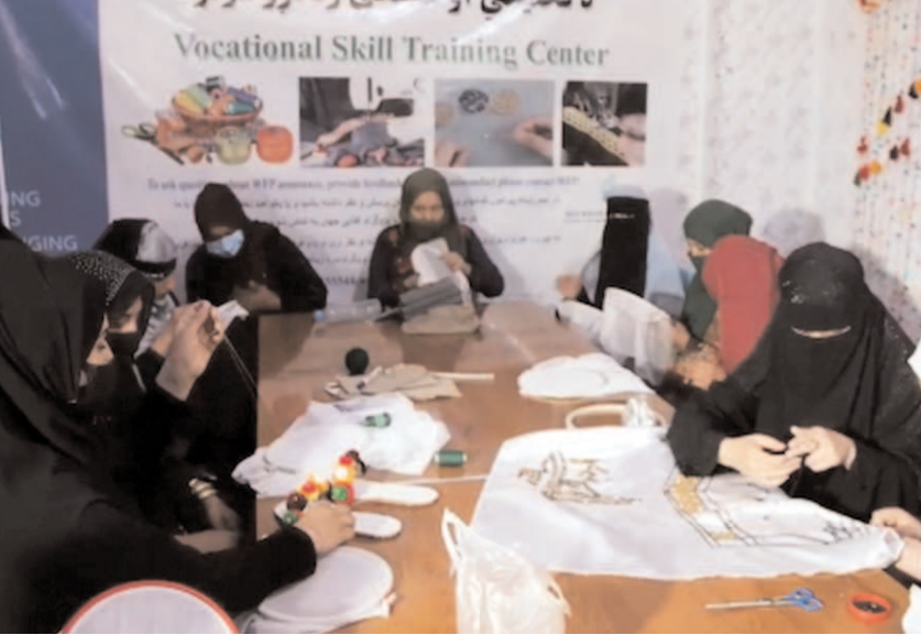
BAGHLAN (TOLONews): The Baghlan Directorate of Information and Culture said that after the return to power of the Islamic Emirate, over 2,000 businesswomen in the province are engaged in