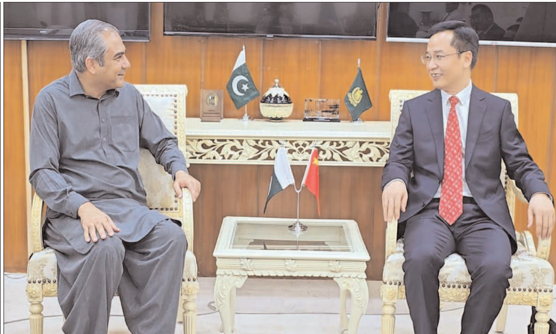
ISLAMABAD: Federal Interior Minister, Mohsin Naqvi in a meeting with Chinese Minister for Political and Legal Affairs Chen Mingguo.

The CM prayed that may there be peace and prosperity in Pakistan at all times and everywhere. She also articulated that peace in Kashmir, Palestine, and around the world is a collective dream.