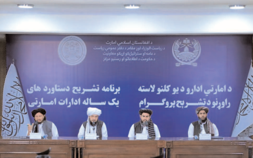
KABUL (Ariana News): In the past year, the Ministry of Mines and Petroleum has signed 13 large mining contracts worth $8 billion, officials said on Saturday. Addressing a press conference, officials said that 167 small-scale mining projects are ongoing with an investment of 10 billion afghanis. They emphasized that in the past year, the ministry conducted a new survey of

647 deposits in 28 provinces. Officials also announced that 1,700 emerald deposits have been surveyed and registered in Panjshir province, and 575 permits have been issued for its extraction, employing 15,000 people. According to them, in the past year, 78,000 carats of emeralds worth more than $5.5 million have been sold to local and foreign businessmen.