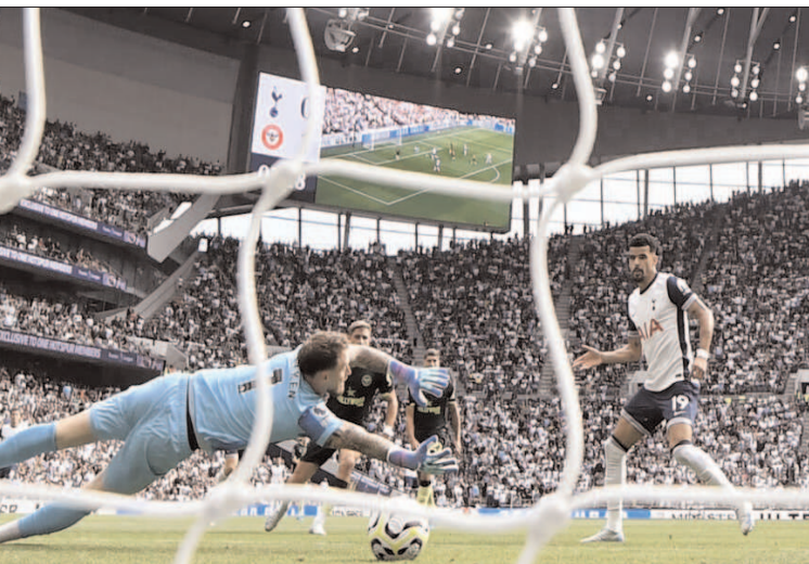
Dominic Solanke (right) scored his first Tottenham goal against Brentford.