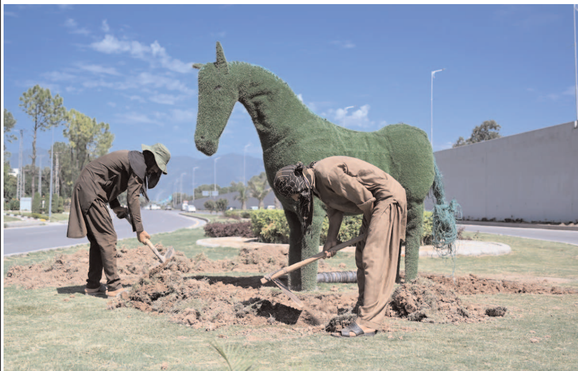
ISLAMABAD: CDA workers preparing ground for planting saplings on green belt area at Rawal Chowk.

He underlined the need to adopt immediate dengue control measures and preventive and long-term strategies to protect the environment and public health.