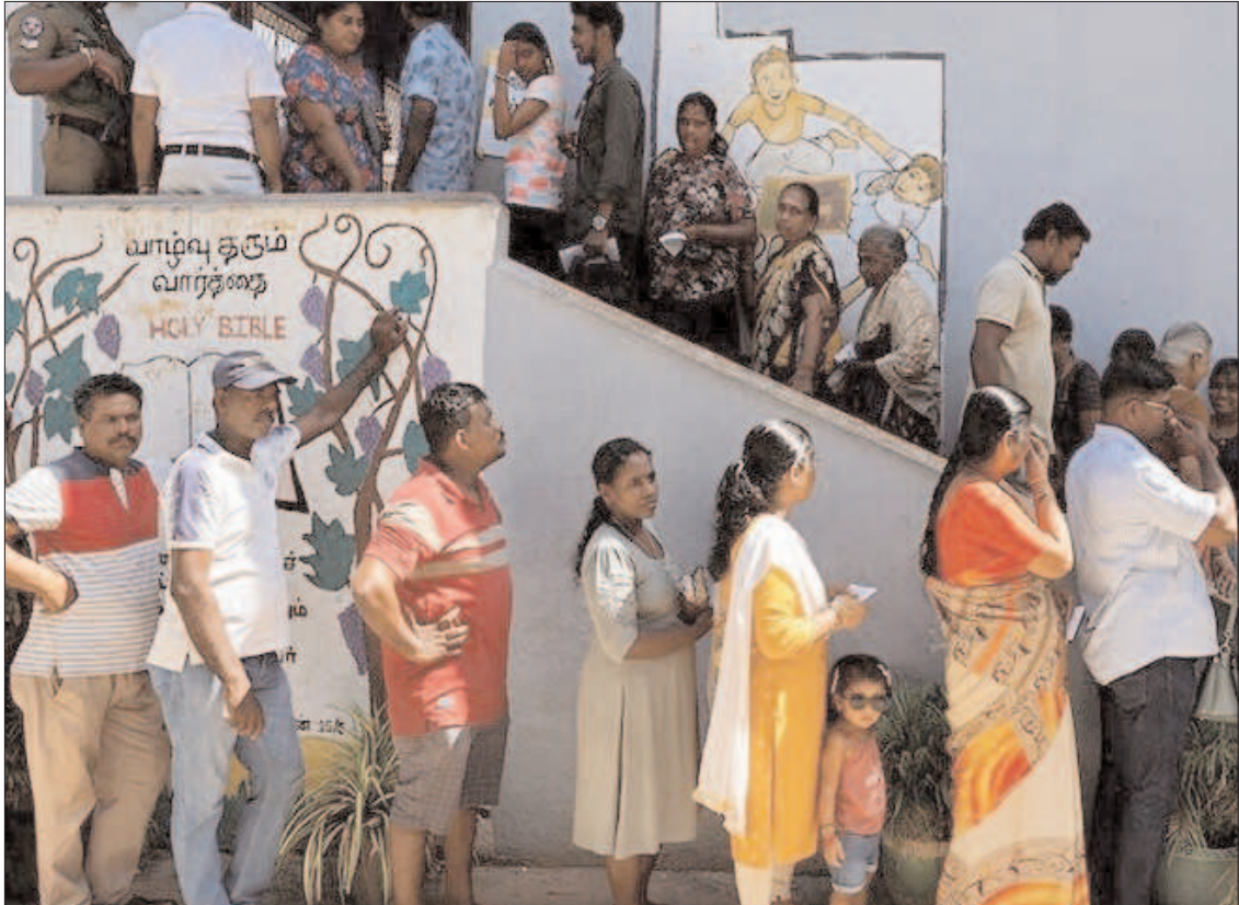
COLOMBO: Voters queue outside a polling station to vote on the day of the presidential election, in Sri Lanka.