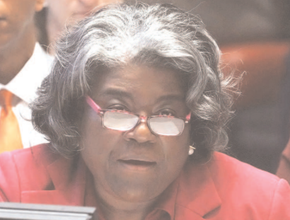
KABUL (Ariana News): US Ambassador to the United Nations Linda Thomas-Greenfield said on Friday that any meaningful steps toward normalization of ties with the Islamic Emirate of Afghanistan (IEA) will be based on its actions, including its treatment of women and girls.

She said on X that the IEA's restrictions on women and girls are "deeply troubling." "The United States has been clear: Any meaningful steps toward normalization will be based on the Taliban's actions – including its treatment of women and girls," she said. Earlier on Wednesday, Thomas-Greenfield said that the situation for women and girls in Afghanistan continues to worsen under the Islamic Emirate. "We think we need to do more to hold them accountable, but also to push them to change," she said while addressing reporters at the Washington Foreign Press Center on UN Reform. The Islamic Emirate has repeatedly emphasized that it is committed to ensuring the rights of women and girls in accordance with Sharia law, and this is an internal matter of Afghanistan.