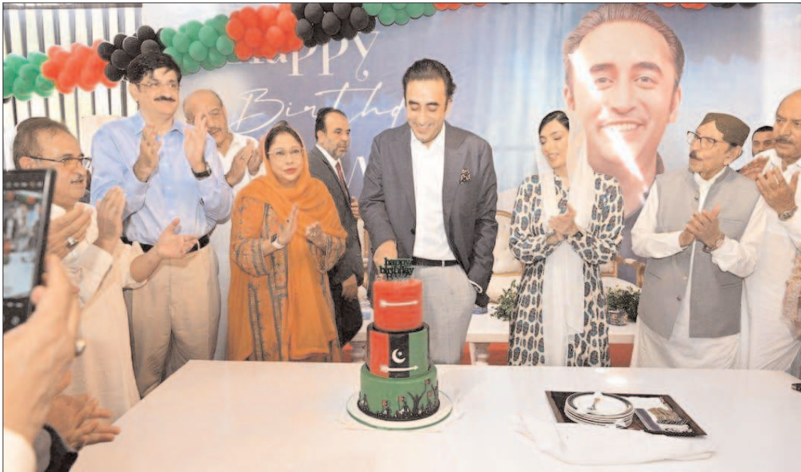
KARACHI: PPP Chairman Bilawal Bhutto Zardari cutting cake on the occasion of his 36th birthday.