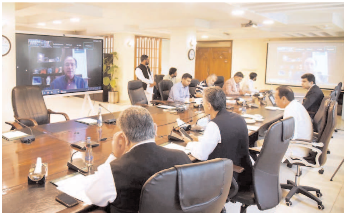
ISLAMABAD: Federal Minister for Finance and Revenue Senator Muhammad Aurangzeb chairing virtual meeting of Cabinet Committee on State-Owned Enterprises (CCSOEs) at Finance Division.

The increase in both domestic and external debt underscores the need for comprehensive economic reforms and prudent fiscal management to ensure long-term financial stability. The government's strategy will need to focus on enhancing revenue generation, controlling expenditures, and fostering economic growth to mitigate the impact of this growing debt.