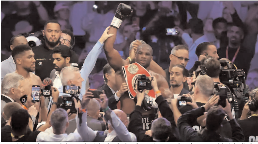
Daniel Dubois celebrated with the belt after winning his first world-title fight.

but instead faces an uncertain future with Dubois sending a seismic ripple through the familiar heavyweight landscape. Dubois said he hoped for another shot at Usyk, who beat him in nine rounds in Wroclaw, Poland, last year. Usyk previously held the IBF belt but vacated it for the Fury rematch, with Dubois the interim holder and upgraded to world champion in June. "Credit to him and his team. We rolled the dice of success, but we came up short," said Joshua after his 13th world heavyweight title fight left him with a record of four defeats from 32 bouts. He had first won the IBF belt in 2016 from Charles Martin at London's O2 Arena. Joshua then lost it to Andy Ruiz in 2019 but won it back later that year. Usyk then took it from him in 2021. "We keep rolling the dice. I had a sharp opponent, a fast opponent and a lot of mistakes from my end, but that's the game." Joshua's promoter Eddie Hearn said he expected to exercise a rematch clause. "It's a dangerous fight because he's growing in confidence all the time but he'll believe he can beat him," he said.