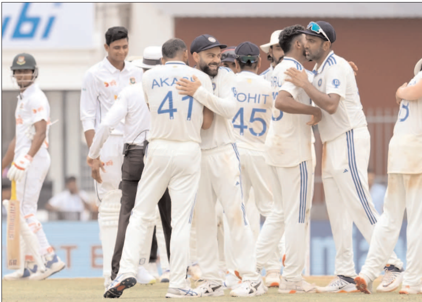
CHENNAI: India gather to celebrate victory in the first Test.

returning Pant, who made 109, flattened the opposition. Gill and the left-handed Pant, who was playing his first Test since a serious car crash in December 2022, put on 167 runs for the fourth wicket. "I just enjoyed batting and got a little bit emotional," Pant said of his celebration after his sixth Test ton. "But at the end of the day, being in the field gives me more pleasure than anything else." The Test was Virat Kohli's first since the birth of his second child made him miss India's 4-1 victory over England at home this year. Kohli scored just six and 17. The home bowlers led by Jasprit Bumrah handed India an early advantage after they bundled out Bangladesh for 149 in their first innings. Bangladesh have to work on their first innings batting ahead of the second Test, said skipper Najmul. "Top of the order we have to be careful and put some runs, that is one learning from this match. Going forward all the batters think that they can come back." Bangladesh pace bowler Hasan Mahmud claimed five wickets in the first innings and reduced India to 34-3 in the first hour of play. The two teams now head to the northern Indian city of Kanpur for the second Test starting on Friday.