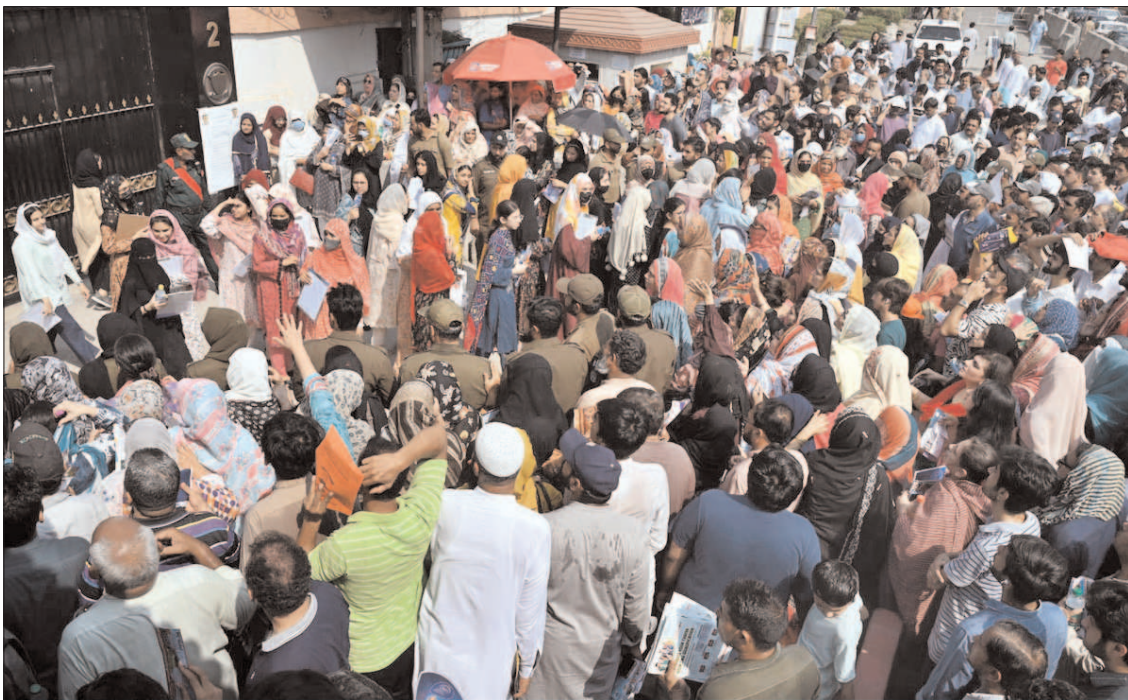
LAHORE: A large number of students gather outside LCWU Jail Road to participate in the medical entrance test (MCAT).

He said that through dialogue and cooperation, we can enhance economic partnerships, promote cultural exchange, and foster mutual collaboration. Today, we must renew our commitment to strengthening Pak-Iran relations.