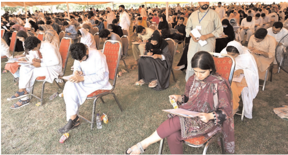
PESHAWAR: Students busy in MDCAT test conducted country-wide on Sunday for admissions in medical and dental colleges.