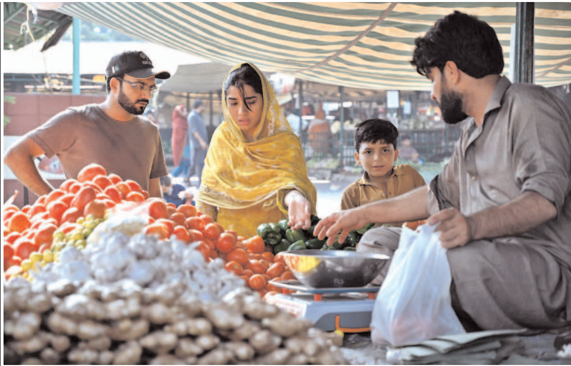
ISLAMABAD: A couple purchasing vegetables from vendor at Sunday Bazaar.