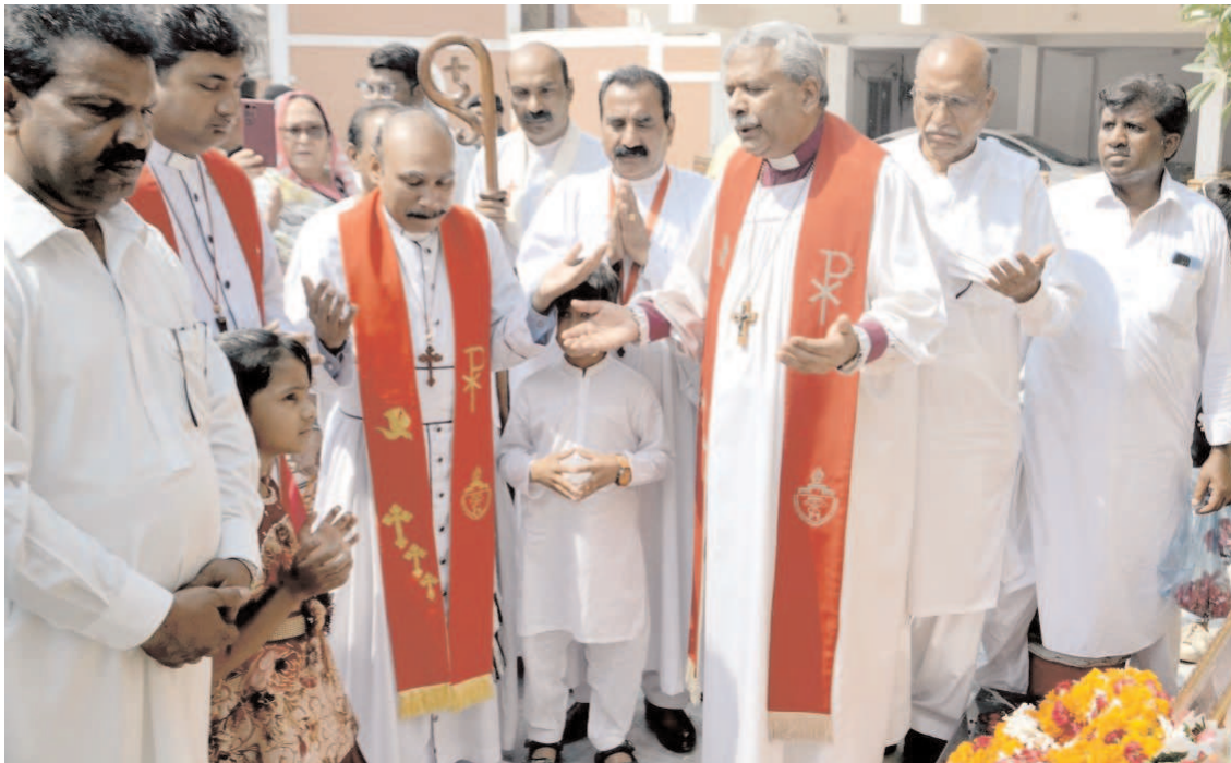
PESHAWAR: Members of Christian community attending a prayer ceremony to mark the 11th anniversary of blast at All Saints' Church near Kohati Gate.

He asserted that the attack on the police was part of a conspiracy by the enemies of Islam and Pakistan.