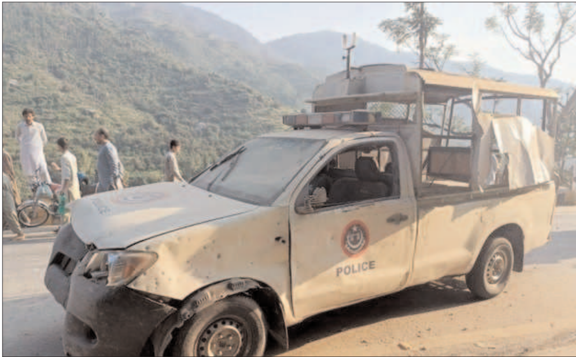
SWAT: View of the police van damaged in blast targeting foreign envoys travelling to Malam Jabba from Mingora.