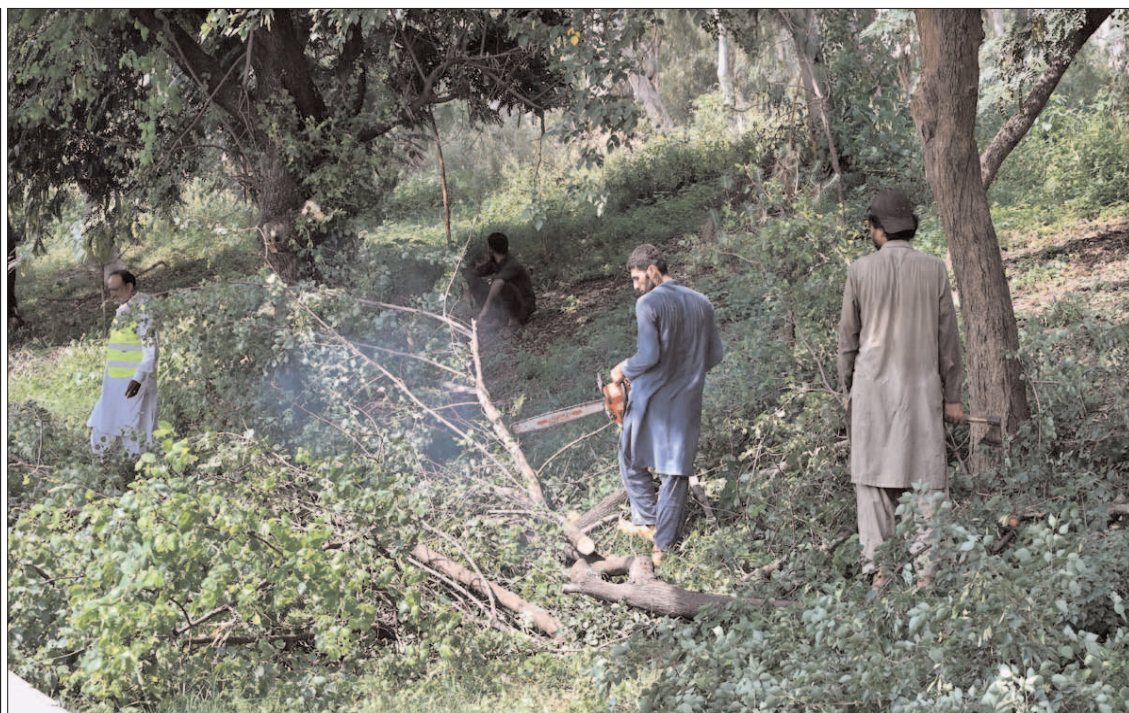
ISLAMABAD: CDA staffer cutting the tree branch at roadside in Federal Capital.

"By lowering fares, we aim to provide relief to commuters, especially those from lower-income backgrounds and encourage more people to choose rail travel," he stated.