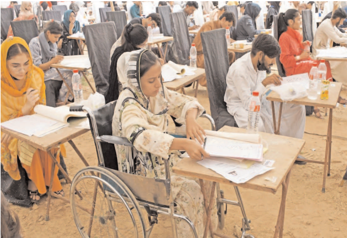
JAMSHORO: Students appearing in Medical and Dental College Admission Test (MDCAT) at Liaquat University of Medical and Health Sciences.

FAISALABAD (APP): The Faisalabad Electric Supply Company (FESCO) has issued a shutdown program for Monday due to necessary repair, maintenance and expansion of electricity lines. According to the program issued by the company, power supply from Bahaduray Wala, Meeranwala, Mansooran and Industrial Estate-I feeders linked with 132-KV Industrial Estate grid station, WASA-II and Dholan Wal feeders attached with 132-KV Kamal Pur grid station, Kathoo feeder connected with 132-KV Gojra grid station, Tariq Abad, Cardiology and Shadman feeders originating from 132-KV Tariq Abad grid station will remain suspended from 7 a.m. to 12 noon while DHQ, Aasiyan, Muazzam Shah, Hindoana, Lahore Road, Chenab Nagar, Abdullah Fiber, Faisalabad Road, Beeranwala, Lahore Road, Usman Abad, Muslim Bazaar, Jhumra Road/Raza, City and Badshahi Masjid feeders linked with 132-KV Chiniot grid station, Mad-doana, al-Mehmood and new Satiana feeders attached with 132-KV Satiana grid station will observe shutdown from 7 a.m. to 1 p.m. on Monday (September 23).