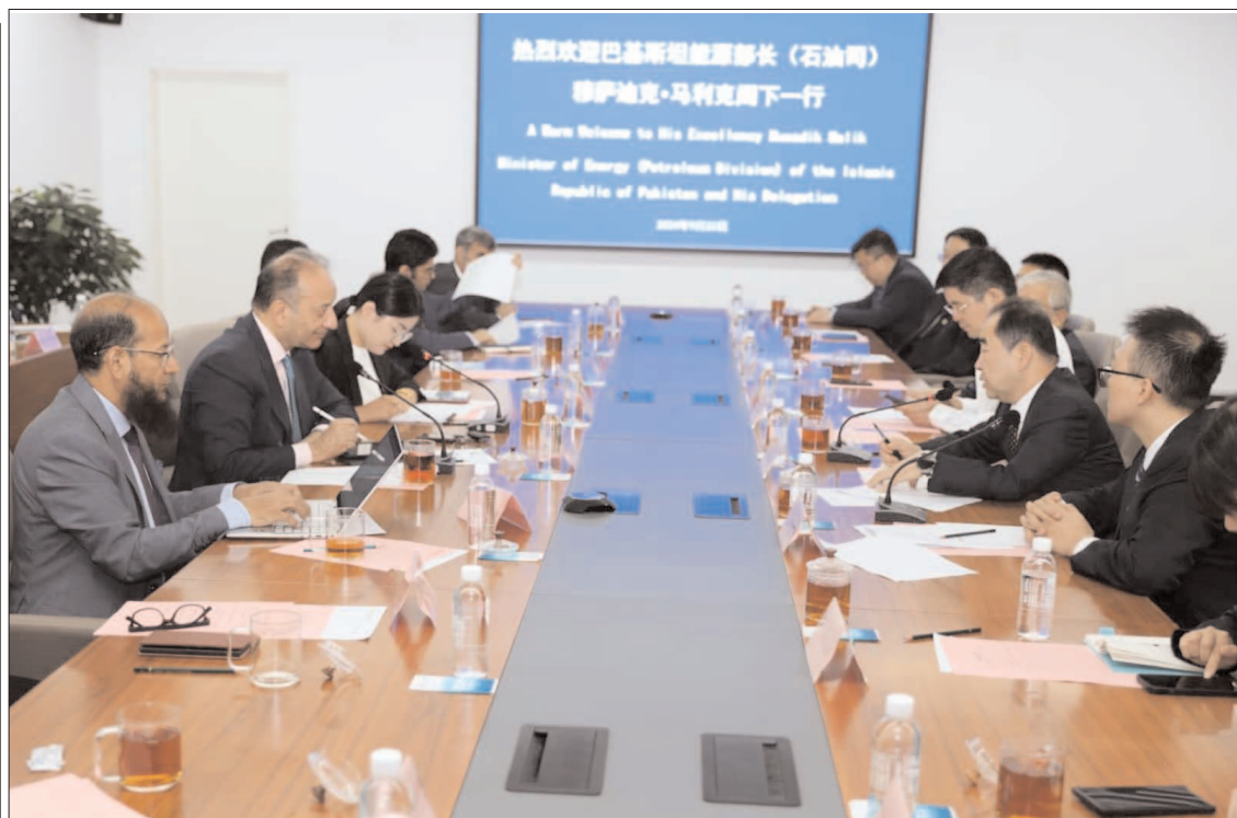
XIAN, CHINA: Minister for Petroleum Dr Musadik Malik holding meeting with Shaanxi Coal and Chemical Industry Group to expand partnership in coal sector.

President Masoud Pezeshkian expressed condolences to the victims' families. "I spoke with ministers and we will do our best to follow up," Pezeshkian said in televised comments.