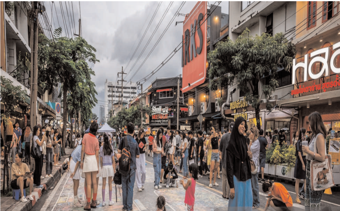
BANGKOK, THAILAND: People take photos on Banthat Thong Road's main intersection on Car Free Day on Sunday in Bangkok, Thailand.