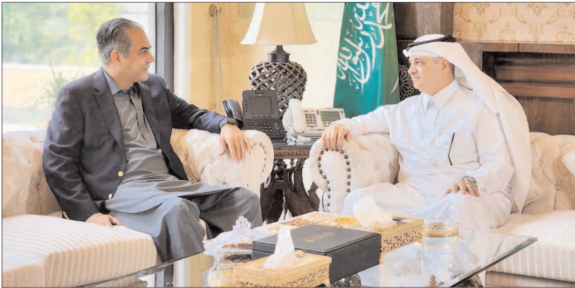
ISLAMABAD: Federal Minister for Interior Mohsin Naqvi in a meeting with Ambassador of Saudi Arabia Nawaf bin Said Ahmed Al-Malilki.