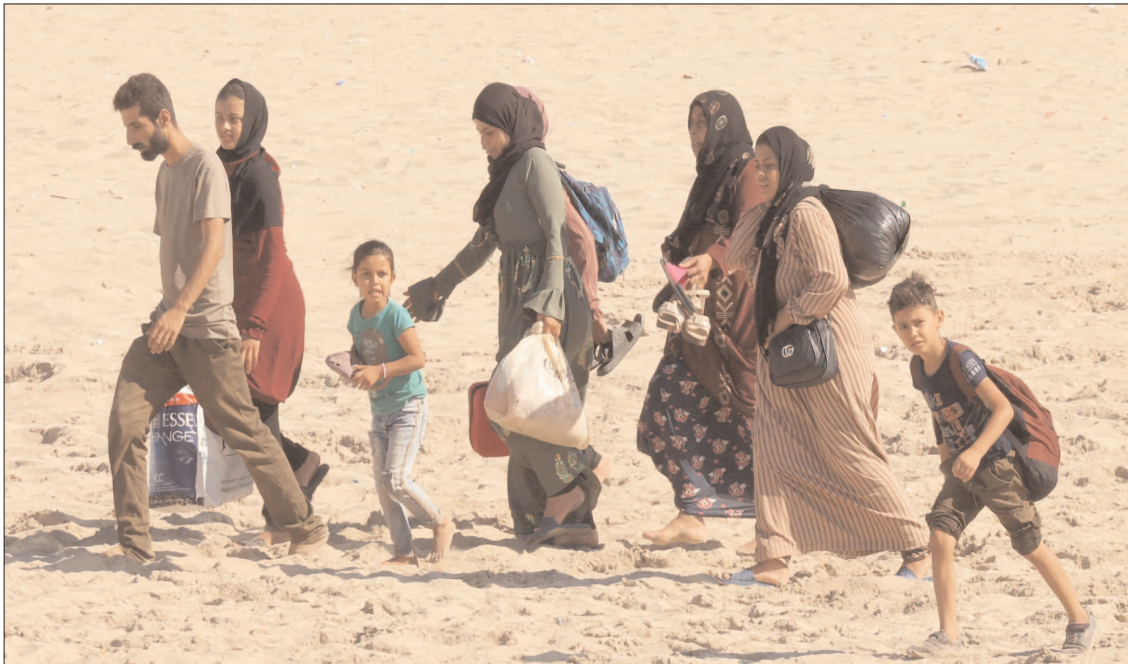
BEIRUT: People carrying belongings at a beach as they flee in Tyre, southern Lebanon.

Vol. XXXIXI No. 240 Regd. No. 241 RABI-UL-AWWAL 19 1446 -- TUESDAY, SEPTEMBER 24 2024 PESHAWAR EDITION 12 PAGES PRICE. 30