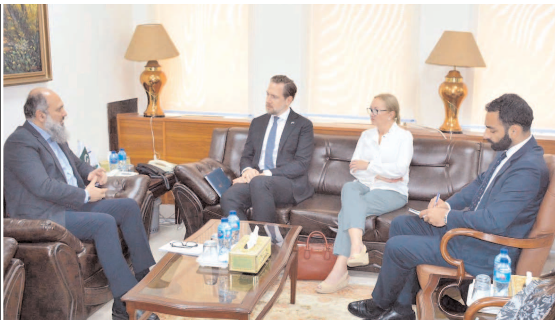
ISLAMABAD: Federal Minister Jam Kamal and UK Trade Commissioner Oliver Christian discuss strengthening bilateral trade and exploring new avenues for partnership.

This discussion marked a significant step in strengthening trade ties, with both parties expressing optimism for the future of UK-Pakistan trade relations.