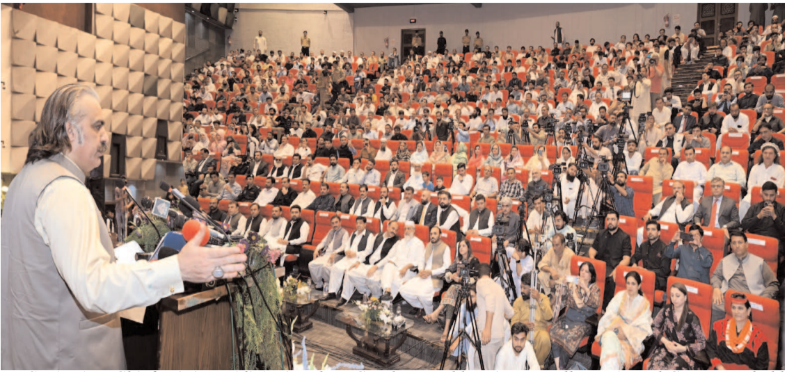
PESHAWAR: Chief Minister Ali Amin Khan Gandapur addressing Excellency Award Ceremony held in connection with World Tourism Day.