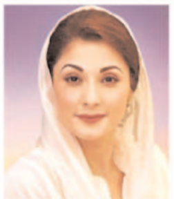
Maryam Nawaz Sharif Chief Minister Punjab

He assured that the government would provide more facilities to the newspaper industry.