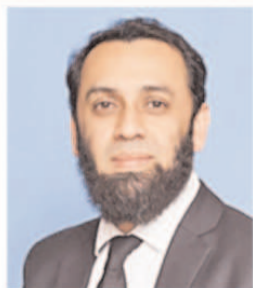
Attaullah Tarar Federal Minister Information & Broadcasting

Happy National Newspaper Readership Day!