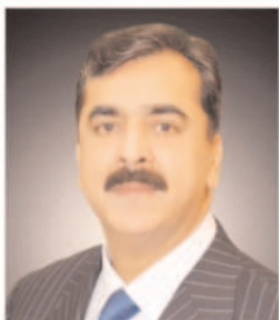
Syed Yousaf Raza Gilani Chairman Senate

On the occasion of National Newspaper Readership Day, I am pleased to extend warm felicitations to the All Pakistan Newspapers Society, journalists, media professionals and newspaper readers across Pakistan.