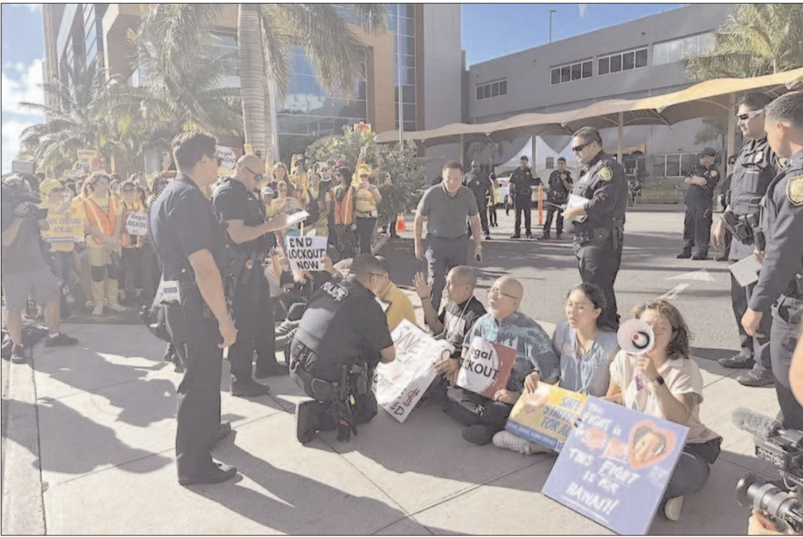
HONOLULU: Police officers talk to demonstrators sitting outside a medical center, where unionized nurses have been locked out since going on a one-day strike, United States.

Ukraine filed the case in 2016, two years after Russia annexed Crimea. It accuses Moscow of subsequently breaching a United Nations maritime treaty by building the bridge, barring Ukrainian fishermen from waters they traditionally fished, damaging the environment and plundering underwater archaeological sites. Kyiv is seeking unspecified compensation. Russia insists the arbitration court does not have jurisdiction. It says that if its five judges decide they do have jurisdiction, the court should dismiss Ukraine's claims. "Ukraine's accusations in this case are, of course, completely groundless and hopeless," Russian Agent Gennady Kuzmin told the panel. He argued that the Sea of Azov and Kerch Strait constitute "internal waters" that are not covered by the United Nations Convention on the Law of the Sea, the treaty Ukraine alleges Russia is breaching.