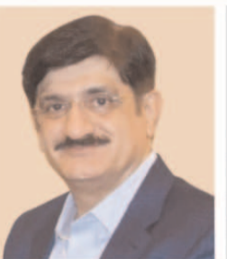
Murad Ali Shah Chief Minister Sindh

In this age of rapidly evolving digital media, where fake news can spread unchecked, the importance of newspapers in providing clarity and truth is even greater. I urge the people of Punjab, and indeed all of Pakistan, to develop a regular habit of newspaper reading, so that we can build a society rooted in knowledge, truth, and understanding. Let us also encourage the younger generation to engage with this time-honored tradition, equipping them with the critical tools they need to distinguish between fact and fiction in an increasingly complex and information-saturated world.