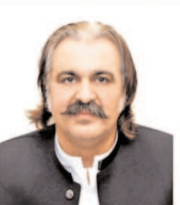
Ali Amin Gandapur Chief Minister Khyber Pakhtunkhwa

I commend APNS for this initiative and look forward to continued efforts to promote literacy, education, and responsible journalism in our province.