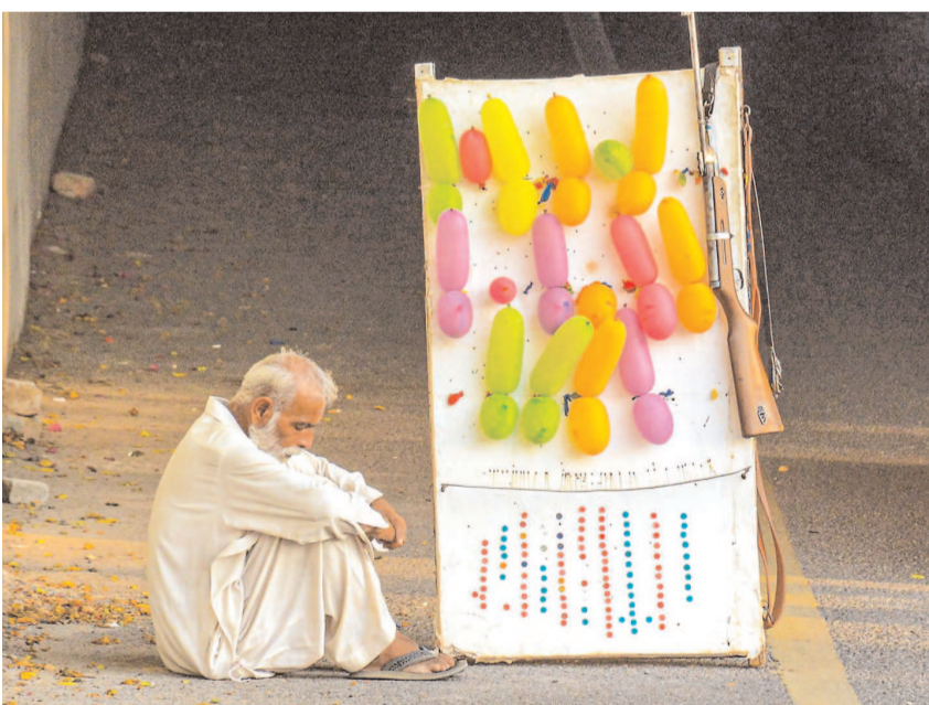
ISLAMABAD: A vendor waits for customers along roadside during hot day.

He said that two passenger trains Bolan Mail and Monjodaro Express are operating on the Larkana section to cater to the transportation needs of the area while the restoration of Khushal Khan Khattak will be examined once the availability of coaches is improved along with consideration of the operating cost and commercial viability.