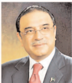
Asif Ali Zardari President Islamic Republic of Pakistan

I extend my heartfelt congratulations to the All-Pakistan Newspapers Society (APNS) on National Newspaper Readership Day. Newspapers play a vital role in raising political awareness and informing citizens about their rights and responsibilities, besides providing news and helping citizens make informed decisions.