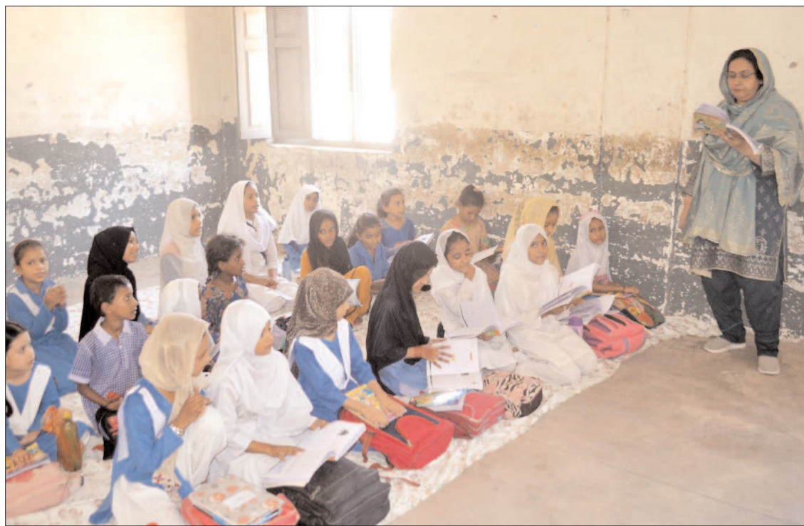
HYDERABAD: Students of Government Girls Urdu Primary School Hali Road studying on the floor, due to non availability of furniture.

The local dignitaries mentioned the collective problems being faced by them. They asked for uninterrupted supply of electricity, playgrounds, roads, streets, drinking water and electricity.