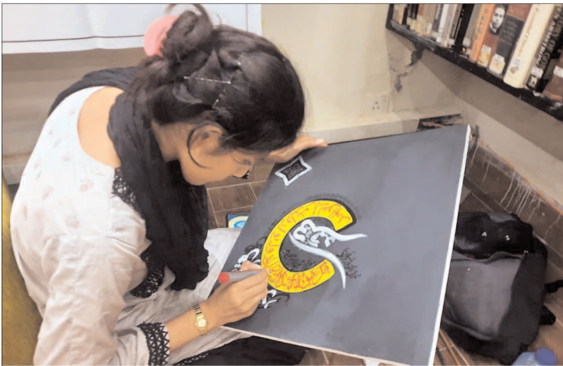
LAHORE: Artist gives final touches to her artwork during the Calligraphy Competition organized by The Knowledge of Art Academy in collaboration with The Book Studio and The Formanite School System.