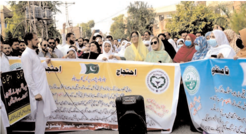
PESHAWAR: Members of Peshawar Nursing Action Committee protesting in favour of their demands.

The briefing also highlighted that the EPI program has allocated PKR 237 million for POL in the current fiscal year, out of which PKR 9 million has already been released.