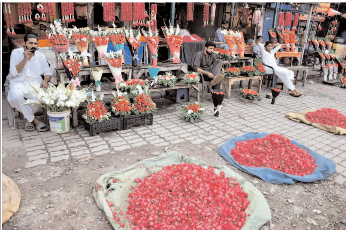
LAHORE: Vendors displaying and selling flower bouquet and flowers garlands to attract customers outside his shop in flower market.

The exchange rate of the Emirates Dirham decreased by 02 paise and closed at Rs 75.63 and the Saudi Riyal remained stagnant at Rs 74.04.