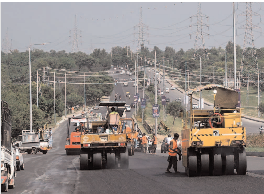
ISLAMABAD: Labourers busy in road construction with the help of heavy machinery during development work near Faizabad.

ISLAMABAD (APP): Indus River System Authority (IRSA) on Tuesday released 205,400 cusecs water from various rim stations with inflow of 143,800 cusecs. According to the data released by IRSA, water level in River Indus at Tarbela Dam was 1535.99 feet and was 137.99 feet higher than its dead level of 1,398 feet. Water inflow and outflow in the dam was recorded as 88,100 cusecs and 120,000 cusecs respectively. The water level in River Jhelum at Mangla Dam was 1721.25 feet, which was 173.25 feet higher than its dead level of 1,050 feet. The inflow and outflow of water was recorded as 15,300 cusecs and 45,000 cusecs respectively. The release of water at Kalabagh, Taunsa, Guddu and Sukkur was recorded as 116,000, 113,600, 88,500 and 36,400 cusecs respectively. Similarly, from River Kabul, a total of 18,100 cusecs of water released at Nowshera and 3,800 cusecs released from River Chenab at Marala.