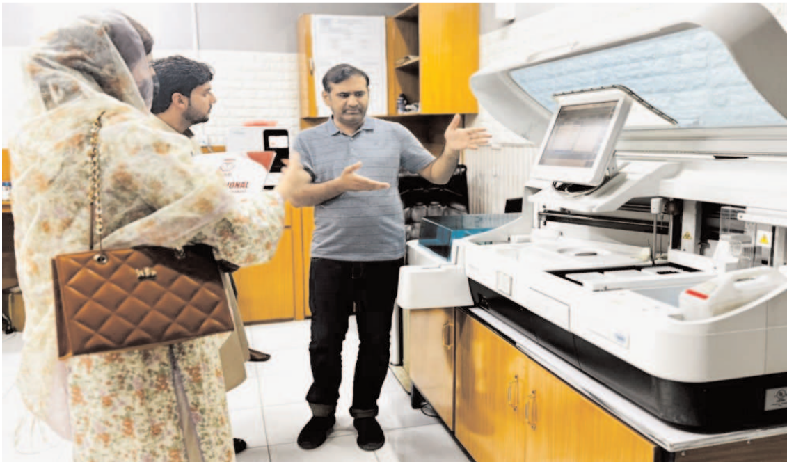
PESHAWAR: A delegation of Professional College of Medical Sciences Peshawar, visited Hamza Foundation Welfare Thalassemia Center and blood transfusion services Peshawar. They visited different sections of Hamza Foundation, took great interest in digital Laboratory, Blood bank and highly appreciated the welfare services of the organization. Delegation also requested to the management of Hamza Foundation to sign a MOU to provide technical training support to their students of BS MLT final and previous year.

PESHAWAR: The Khyber Pakhtunkhwa Women Entrepreneurs Network (KPWEN) has called for immediate amendments to the KP Commerce and Trade Act 2021 to formally open easy window of registration with the Women Chambers of Commerce and Industry (WCCI) in the province. This critical demand was voiced during the first quarterly meeting of the network held with the participation of key stakeholders, including government officials, private sector representatives, and women entrepreneurs and business community. The meeting aimed to strengthen and empower women-led businesses across KP by fostering collaboration and advocating for policy and legislative reforms. The network stressed the need for a dedicated KP Commerce and Trade Statistics Act, which would facilitate the formal registration of Women Chambers of Commerce and ensure a supportive policy framework for women entrepreneurs. Such measures would not only enhance women's representation in business but also unlock opportunities for growth and development in the provincial economy and revenue generation.