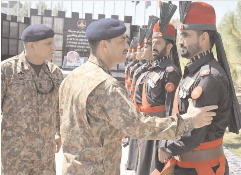
General Syed Asim Munir, Chief of Army Staff interacting with troops during his visit to South Waziristan.

Russia controls just under a fifth of Ukraine, including about 80% of the Donbas area. Russian forces have begun storming the eastern Ukrainian town of Vuhledar, a stronghold that has resisted Russian attack since the beginning of the war, according to Russian war bloggers and state media. Biden is due to hear from Zelenskyy about a new Ukrainian peace plan when they meet in Washington on Thursday.