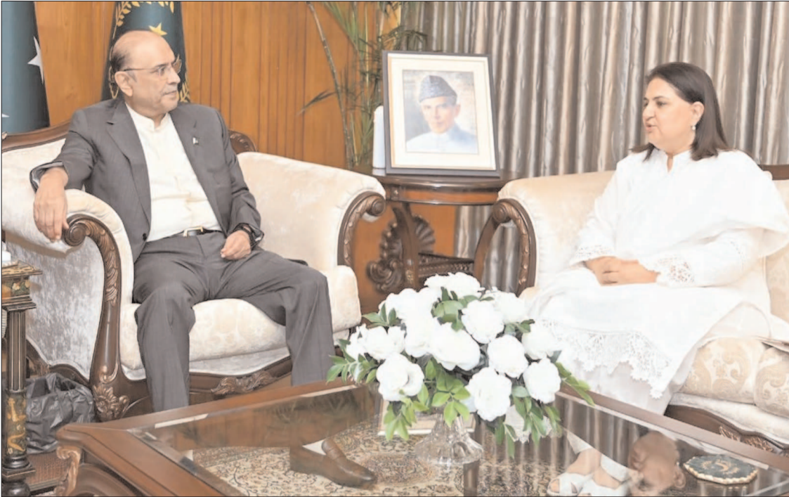
ISLAMABAD: Chairperson Benazir Income Support Program, Senator Rubina Khalid, called on President Asif Ali Zardari, at Aiwan-e-Sadr.