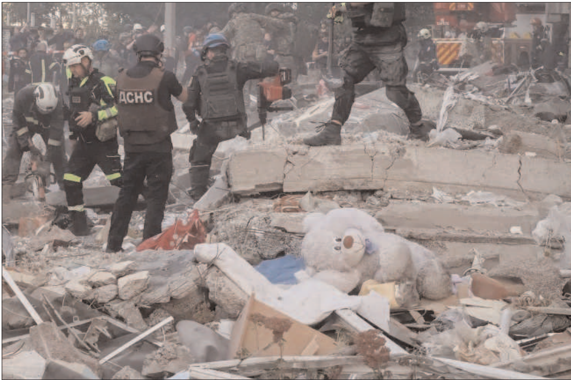
KYIV: Rescuers work at the site of an apartment building hit by a Russian air attack on northeastern Ukrainian city of Kharkiv.