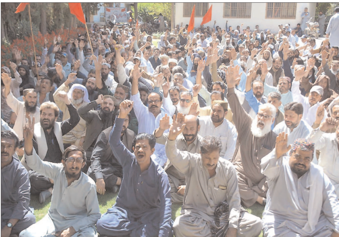
QUETTA: WASA employees holding a protest for acceptance of their demands.

TAXILA (INP): Four passengers died while several others were injured when a dumper went out of control, overturned and fell on a Hiace van on Wah Cantt Road near Taxila on Wednesday.