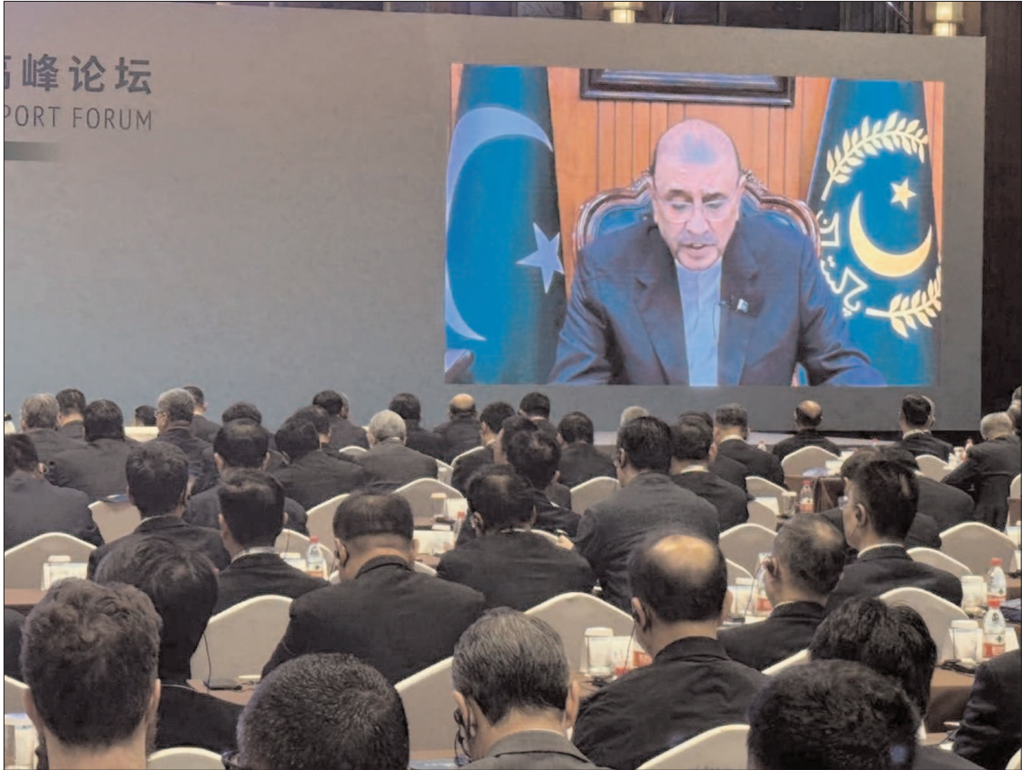
ISLAMABAD: President Asif Ali Zardari addressing the Global Sustainable Transport Forum-2024, through video message held in Beijing.