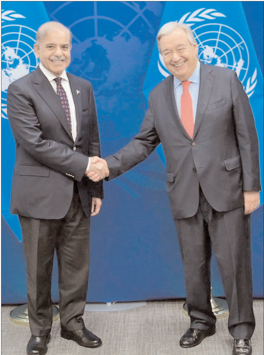
NEW YORK: Prime Minister Shehbaz Sharif shaking hands with Secretary General of United Nations, Antonio Guterres on the sidelines of 79th session of United Nations General Assembly.