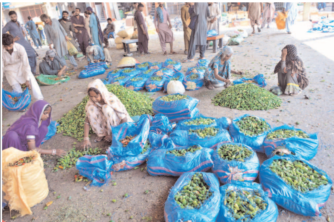
HYDERABAD: Women laborers sorting fresh green chilies, ensuring top quality for sale at local Sabzi Mandi.

While appreciating to the Chinese Authorities for organizing the Global Forum in Beijing expressed the expectation that the long association and deep friendship between the two countries of Pakistan and China will be further cemented in future.