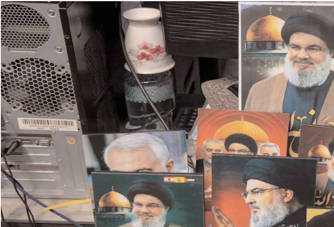
TEHRAN, IRAN: Posters of Hassan Nasrallah, (R) the slain leader of Lebanon's Hezbollah, are seen at a religious-cultural production mall on Sunday, in Tehran, Iran.