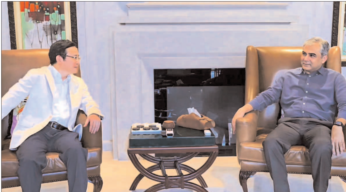
LAHORE: Federal Minister for Interior Mohsin Naqvi in a meeting with Chinese Consul General Zhao Shiren.

Zhao Shiren called Pakistan China's best friend and assured continued cooperation. During the meeting matters of mutual interest and bilateral relations were discussed. Senior consular officials were also present in the meeting.