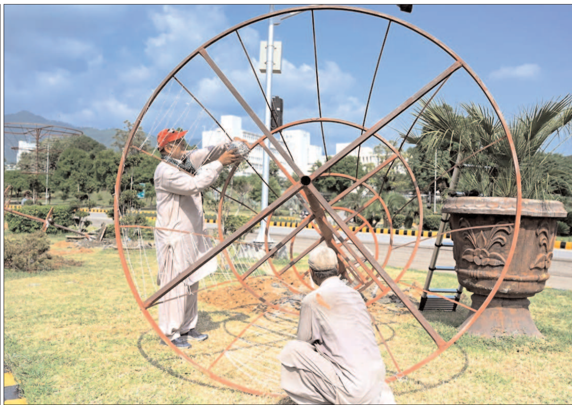
ISLAMABAD: CDA workers busy fixing a tree stand to enhance beauty of Federal Capital in front of Parliament House.

The official said that any railroad operating below 100 percent is considered financially viable and Pakistan Railways was able to achieve operating ratio of about 98 percent for the financial year 2023-24. He said that Pakistan Railways has skewed expense as it is running 57 percent of its passenger trains under Public Service Obligation (PSO) to cater the transportation need of masses of remote areas and thus has to absorb operating cost for all such trains.