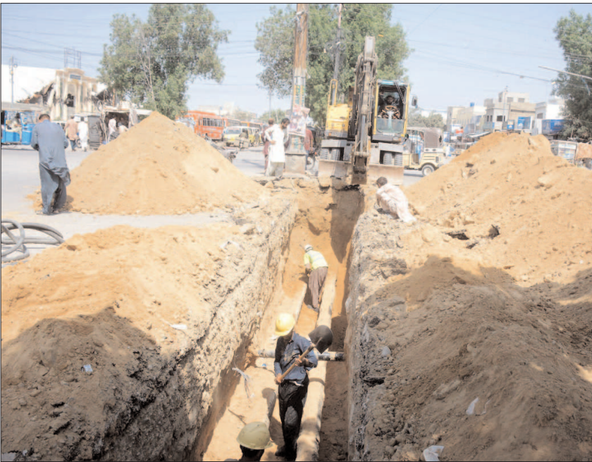
KARACHI: Machinery in use to repair the pipeline of Pak-Arab Refinery Company Ltd at Korangi Road.