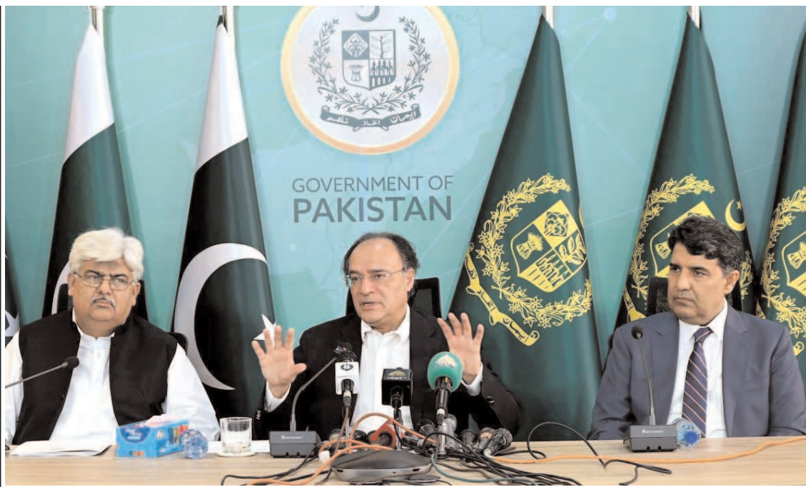
ISLAMABAD: Federal Minister for Finance and Revenue Senator Muhammad Aurangzeb addressing a press conference.