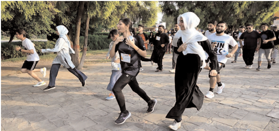
ISLAMABAD: Participants take part in 8th edition of ‘Save Tomorrow’ Run & Walk.