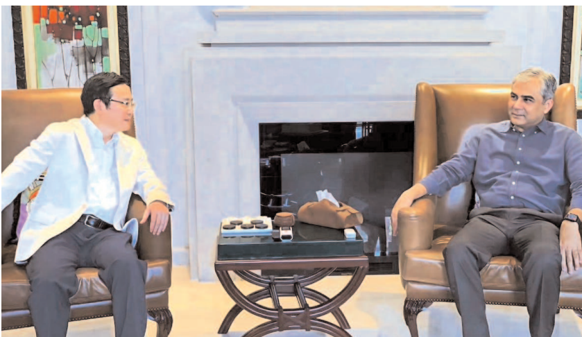
LAHORE: Federal Minister for Interior Mohsin Naqvi in a meeting with Chinese Consul General Zhao Shiren.

LAHORE (APP): Punjab Chief Minister Maryam Nawaz Sharif on Sunday strongly condemned the shooting incident in Panjgur that resulted in the deaths of seven innocent laborers. Expressing her deep sorrow over the tragic loss of life, she conveyed her heartfelt condolences to the grieving families affected by this senseless act of violence. The CM expressed her solidarity with the families during this difficult time, affirming that the government stands with them and would support them in their time of need. Mewanwhile, Punjab Chief Minister Maryam Nawaz Sharif has underscored the pressing issue of food wastage, highlighting it as a significant global challenge that negatively impacts both the economy and the environment. In her message on the International Awareness Day for Food Loss and Waste being observed on Sunday, the CM emphasizing the need for urgent action to address this critical concern. The CM highlighted that millions of people worldwide suffer from hunger while millions of tons of food go to waste. She noted that Pakistan was also grappling with food loss and scarcity to some extent. The chief minister declared that reducing food waste was not only a moral and religious obligation but also essential for effective resource management. She stressed the need for careful planning to prevent resources from being wasted, which could help support those affected by hunger.