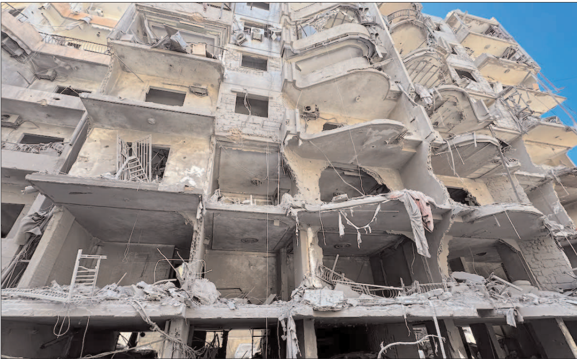
BEIRUT: Site of the Israeli air strike that killed Hezbollah leader Sayyed Hassan Nasrallah, in Beirut's southern suburbs on Sunday.

The fate of the remaining two drones was not specified.