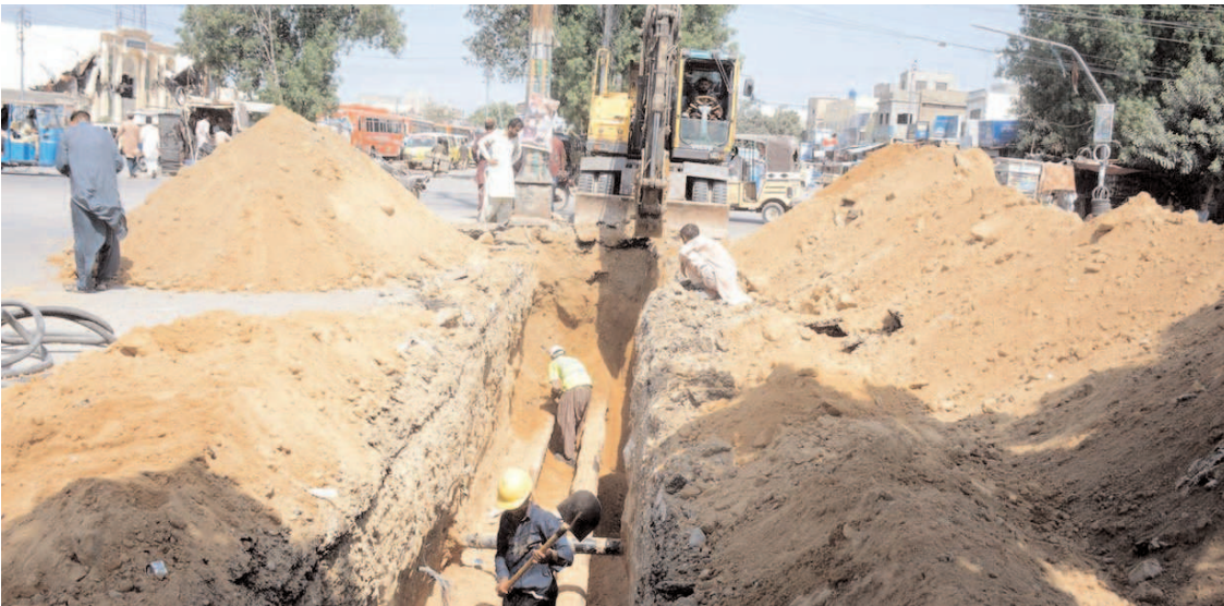
KARACHI: Machinery in use to repair pipeline of Pak-Arab Refinery Company Ltd at Korangi Road.

He also expressed his condolences to the families of the deceased labourers.