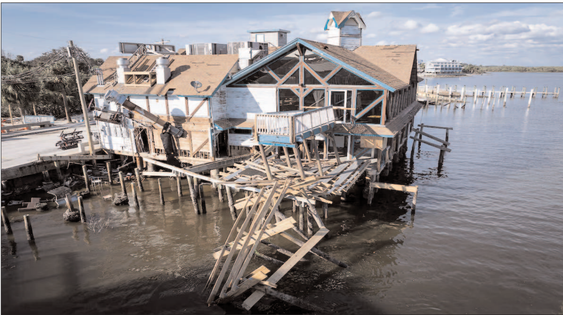
FLORIDA: A drone view of a damaged business around Cedar Key Fishing Pier following Hurricane Helene in Cedar Key, Florida, US.