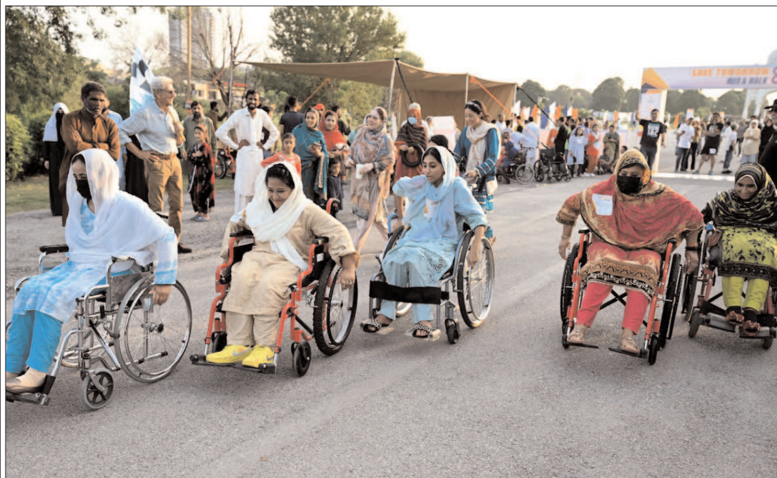
ISLAMABAD: Disabled individuals participate in the 8th edition of the 'Save Tomorrow' Run & Walk, highlighting the issue of drug abuse in society, hosted by the Karim Khan Afridi Welfare Foundation (KKAFF) at Fatima Jinnah Park (F-9) in the Federal Capital.

The PMD has urged all relevant stakeholders, including national health agencies and dengue control centers, to take immediate preemptive measures in the affected districts. The authorities have been advised to remain vigilant and regularly consult the PMD website for updates and guidance on controlling the outbreak.