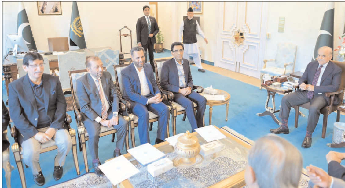
ISLAMABAD: A delegation of MQM (P) called on Prime Minister, Shehbaz Sharif.