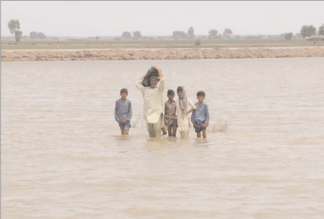
DADAR: A man along with children shifting towards safer place after flood hit various areas of Sindh.