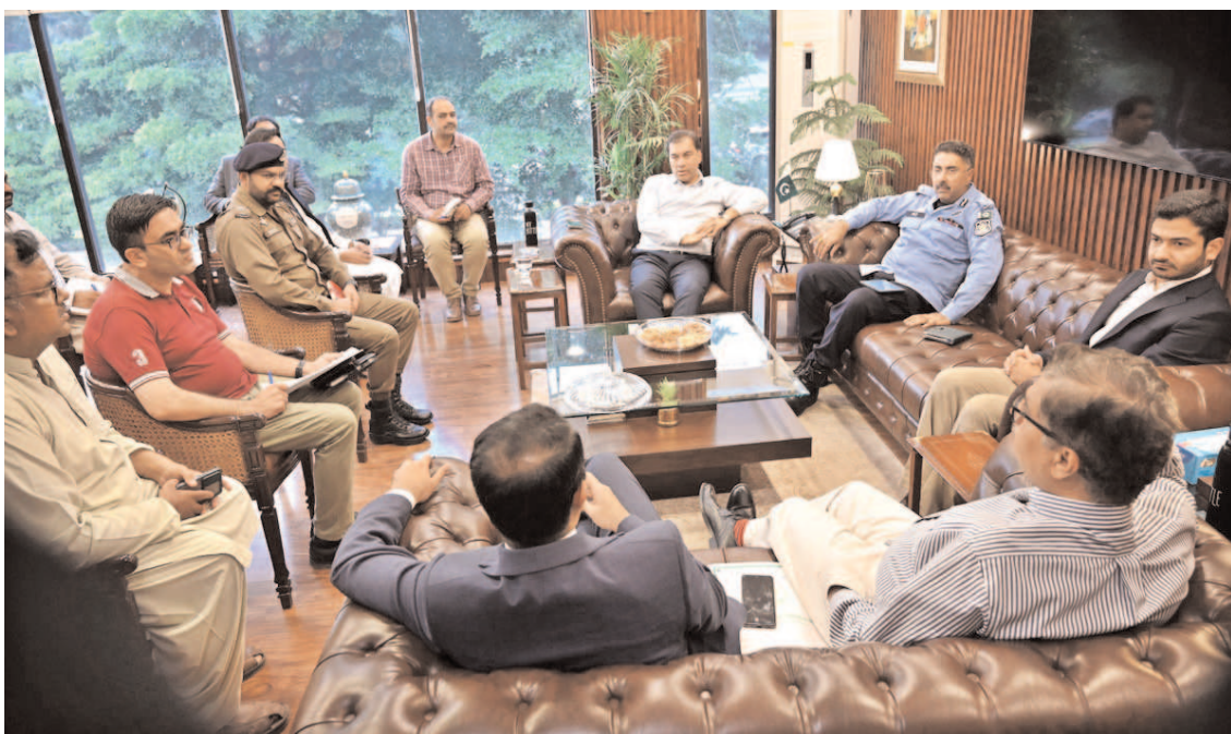
ISLAMABAD: Chief Commissioner Islamabad and Chairman CDA Muhammad Ali Randhwa presiding over the meeting regarding measures taken for the prevention of Dengue.

Investments in the early years of life are the foundation of human capital, and human capital is a key driver of economic development in the modern economy.