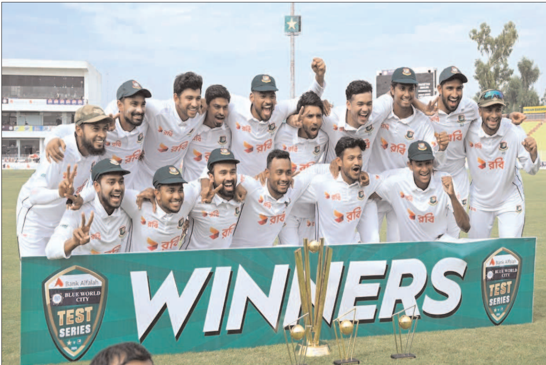
RAWALPINDI: Bangladeshi team players pose for a photograph with trophy after winning Test series against Pakistan at Rawalpindi Cricket Stadium.

NEW DELHI (Web Desk): Renowned commentator and Cricket Author Harsha Bhogle shared his two cents on Pakistan's humiliating Test series defeat against Bangladesh at home. Bangladesh outclassed Pakistan by six wickets in the second Test match to complete the clean sweep and win their first-ever series against the Green Shirts. The touring side had won the first Test thumpingly by 10 wickets. Meanwhile, Bhogle, who highlights Pakistan's men's cricket team's strengths and shortcomings exceptionally well, recalled his verdict when he claimed that Pakistan are stronger in the shorter formats but will be exposed in longer formats. He, however, acknowledged that he did not expect Pakistan to lose from Bangladesh. "I remember saying some time ago that the shorter the game, the more dangerous Pakistan would be, and, almost as consequence, that the longer the game, the more vulnerable they would be," he wrote on Twitter. "But I didn't expect it to be this stark. Well as Bangladesh played, this is embarrassing for Pakistan," Harsha Bhogle added. Set to chase a modest 185, Bangladesh knocked the winning runs in the second session of the final day, just 25 minutes before the Tea Break.