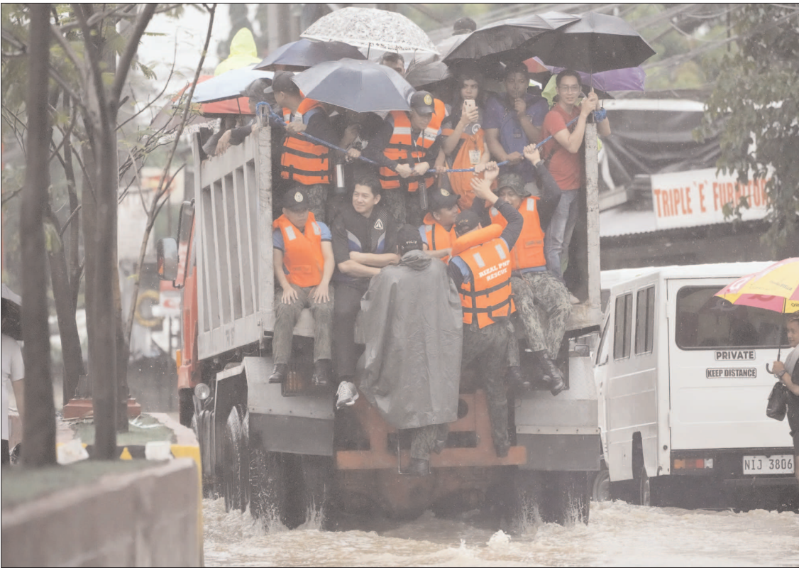
MANILA: Rescuers and residents ride a truck as they cross a street flooded by heavy rains from Tropical Storm Yagi, locally called Enteng, in Cainta, Rizal province, Philippines.

"The regulations are aimed at preventing possible hostile influences against Finland," Hakkanen told a press conference. Finland is already monitoring some 3,500 properties in the country linked to Russian owners, the minister said without elaborating.