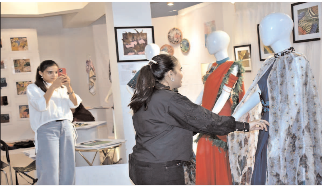
LAHORE: Textile Design show of Lahore College for Women University 2024 by the students at Al Hamra Art Gallery.

LAHORE (APP): Provincial Minister for Minorities Affairs Sardar Ramesh Singh Arora on Tuesday chaired a review meeting on arrangements for the pilgrimage to Mariamabad during his visit to Sheikhupura. The deputy commissioner and other relevant officers briefed the minister on the arrangements for the pilgrimage. Minister Ramesh Singh Arora directed that best and foolproof arrangements be ensured for the pilgrimage, which will take place from September 6 to 8. The minister said that in line with the vision of Chief Minister Maryam Nawaz Sharif, the Punjab government is taking extensive measures to protect the rights of religious minorities and added that Pakistan has always promoted peace, and minorities play a vital role in nation-building. The provincial minister emphasised that providing a peaceful environment for all religions to practice their worship and celebrate their festivals is the top priority of the Punjab government. He directed the district administration and the police department to ensure best and fool-proof arrangements during the pilgrimage.