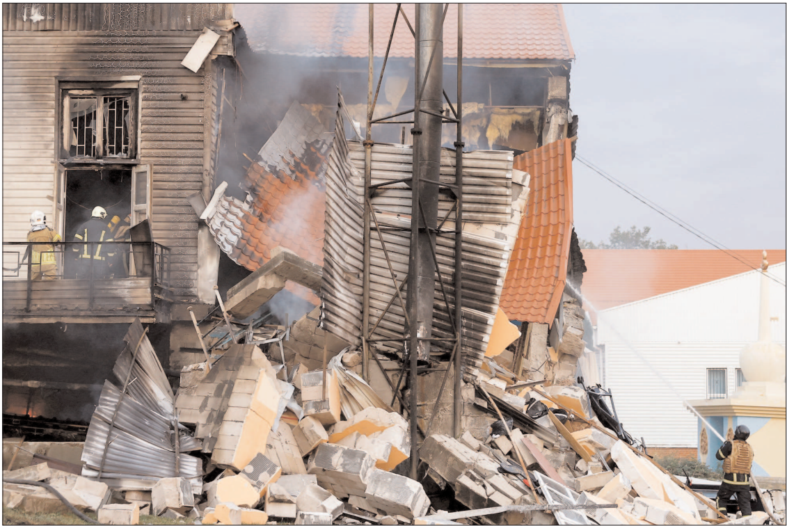
KYIV: Firefighters working at a site of a sports complex of a university damaged during a Russian missile strike.