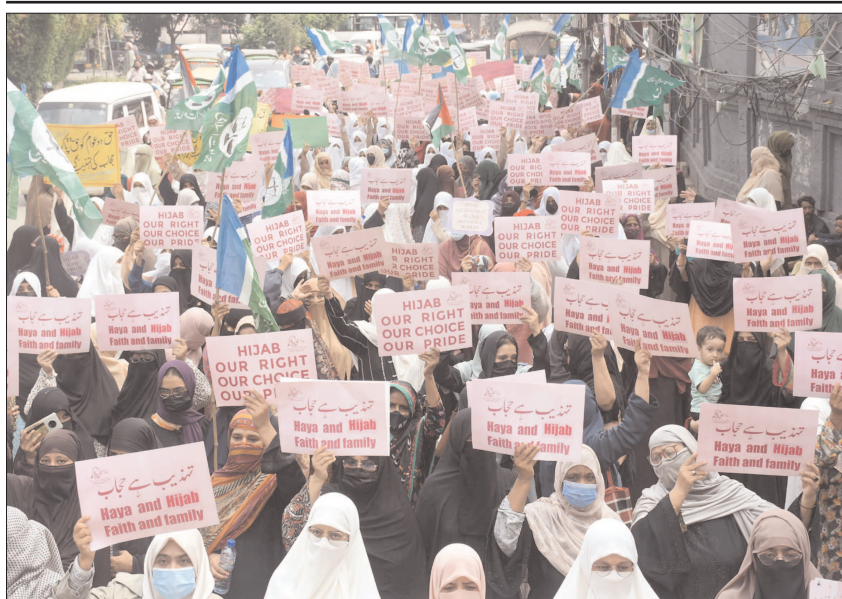
LAHORE: Participants holding a walk on the occasion of International Hijab Day.