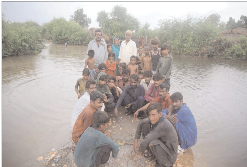
BADIN: People sitting in open sky due to rain water accumulated in their villages.