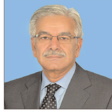
Khawaja Muhammad Asif

Pakistan Armed Forces Zindabad! Pakistan Paindabad