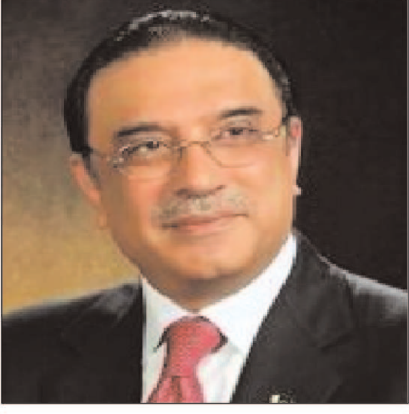
Asif Ali Zardari President of the Islamic Republic of Pakistan

Message on the occasion of Defence and Martyrs' Day of Pakistan, 06 September 2024