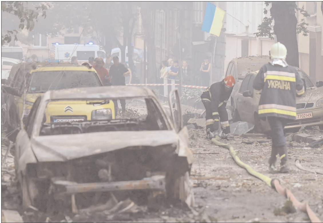
KYIV: Rescuers work at the site of a residential building damaged in the Russian strike in Lviv.

In July, Washington and Berlin announced that the "episodic deployments" of long-range US missiles, including Tomahawk cruise missiles, to Germany would begin in 2026.