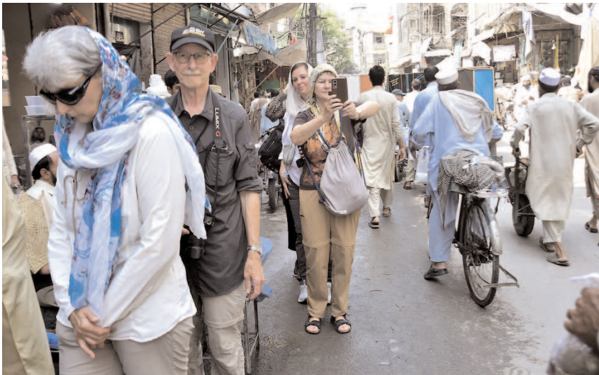
PESHAWAR: Delegation of Germany visiting historical place Ghanta Ghar Bazaar.

PESHAWAR: (APP): Partly cloudy weather with trace rain was recorded in the city on Saturday while the MET office predicted similar weather conditions for the next 24 hours. The MET officials said a continental air was prevailing over most parts of the country while a shallow westerly wave was present over Kashmir and it was adjoining hilly areas. They predicted that mainly hot and dry weather was expected in most parts of the country. Meanwhile, Meteorological Department informed on Saturday that a continental air is prevailing over most parts of the country. A Shallow westerly wave is present over Kashmir and it is adjoining hilly areas. On Saturday, hot and dry weather is expected in most parts of the country. However, rain or thunderstorm is likely at isolated places in upper Khyber Pakhtunkhwa, Potohar region, northeast/central Punjab, Kashmir and Gilgit-Baltistan. On Sunday, hot and dry weather is expected in most parts of the country. However, rain or thunderstorm is likely at isolated places in Gilgit-Baltistan, Kashmir and adjoining hilly areas.