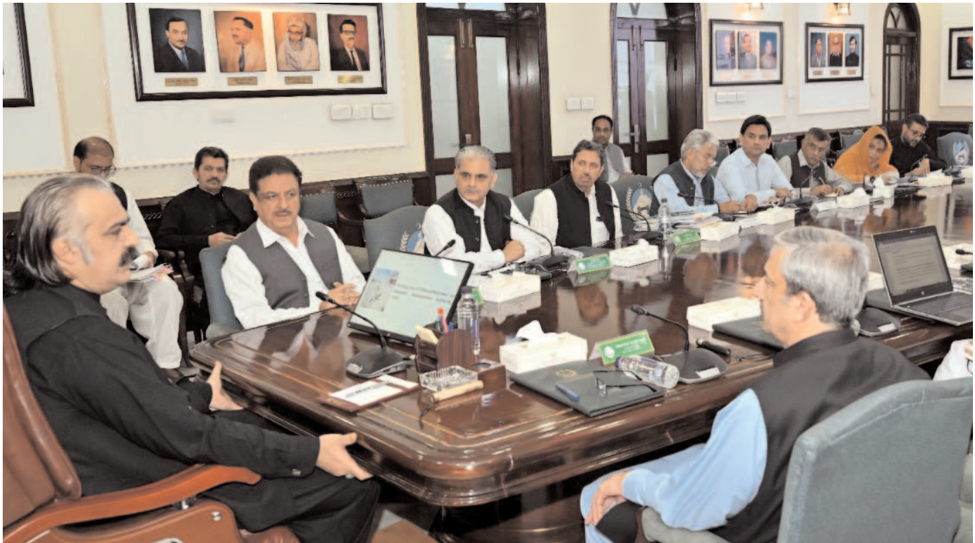
PESHAWAR: Chief Minister Khyber Pakhtunkhwa Sardar Ali Amin Khan Gandapur chairing a meeting of Local Government Department.