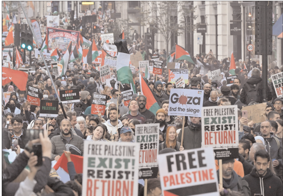
LONDON: Thousands holding placards during a protest against Israeli attacks on Palestinians.

lasting ceasefire and peace in Gaza, Erdogan's office said in a post on X. Erdogan condemned Israel's war in Gaza, the statement said, accusing some Western countries of remaining silent and continuing to support Israel. Erdogan also told Abbas that all countries, especially in the Muslim world, should step up efforts to ensure an immediate ceasefire in Gaza and the uninterrupted delivery of humanitarian aid to Palestinians. Abbas is set to address an extraordinary session of Türkiye's parliament on Thursday. Israel's assault on Gaza started after the Palestinian Islamist militant group Hamas attacked Israel on Oct. 7. Türkiye has denounced the war and has halted all trade with Israel. It submitted a request to join South Africa's case at the International Court of Justice accusing Israel of genocide. Türkiye's invitation to Abbas came after Israeli Prime Minister Benjamin Netanyahu addressed the US Congress on July 25, which Ankara has condemned. "We will show that Mr. Abbas has the right to speak in our parliament just as Netanyahu has the right to speak in the US Congress," Erdogan told members of his ruling AK Party on Wednesday before meeting Abbas. Erdogan, who has been a staunch supporter of Hamas, said Türkiye had also planned to invite the political leader of Hamas, Ismail Haniyeh, who was assassinated in Tehran.