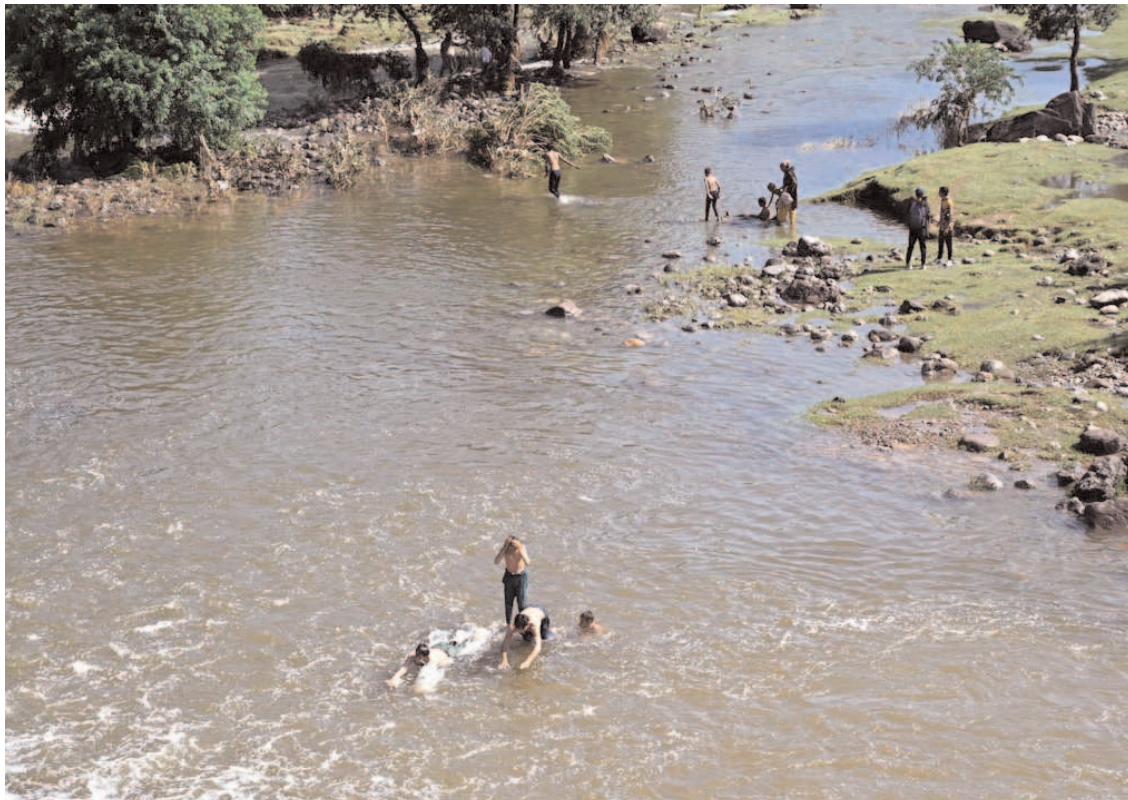
ISLAMABAD: A view of youngsters bathing and swimming in the Rawal Dam spillway water.