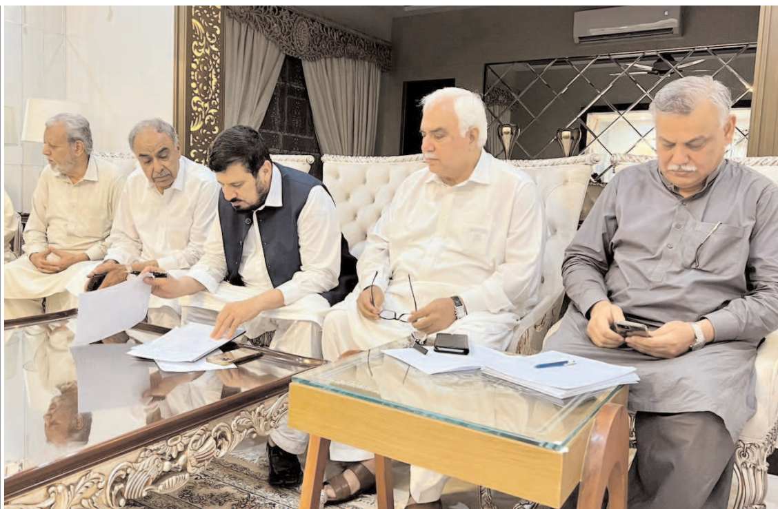
PESHAWAR: Members of Sarhad Business Alliance committee finalizing names of candidates for SCCI's elections during a meeting.