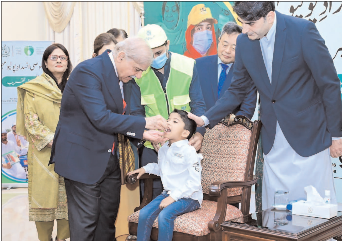
ISLAMABAD: Prime Minister Shehbaz Sharif administering anti-polio drops to a child to inaugurate the anti-polio campaign.