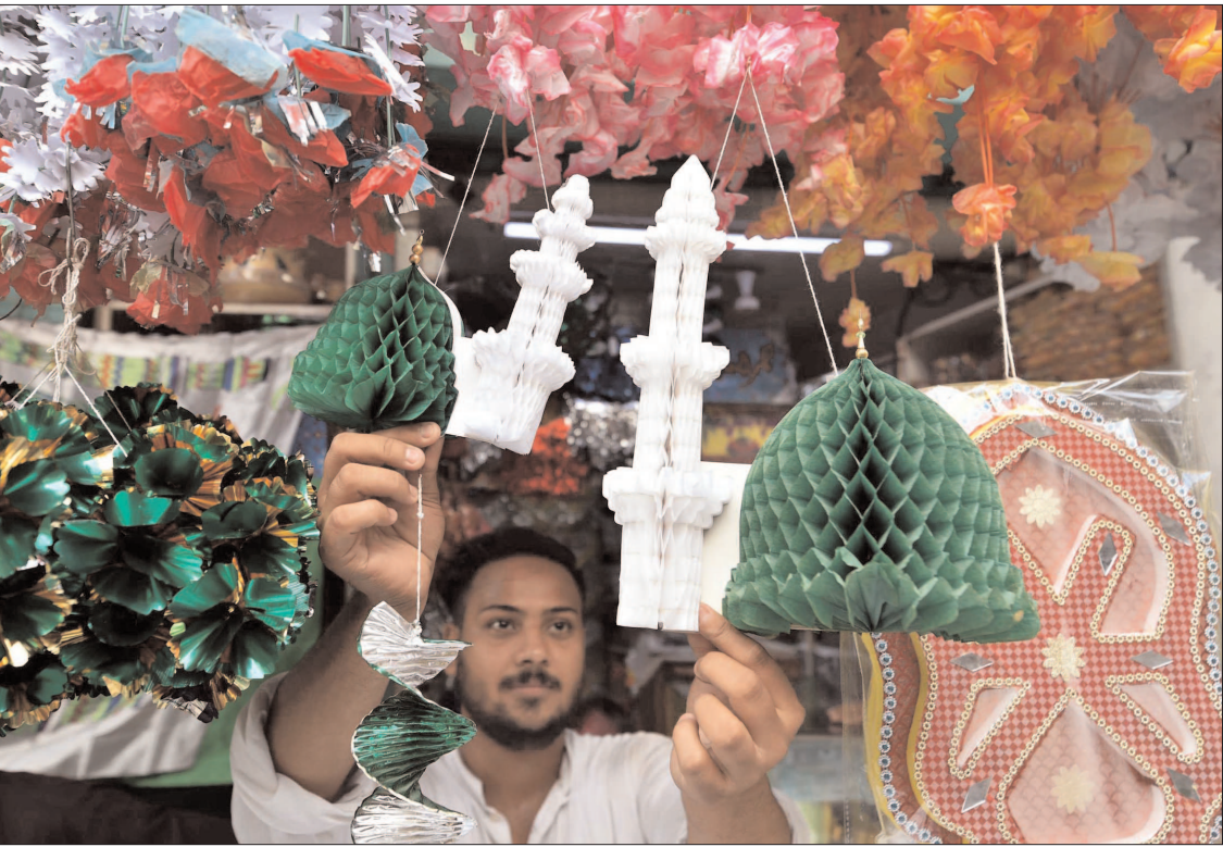
KARACHI: A vendor displaying decorations items at Jhanda Gali in connection with Eid Milad-un-Nabi (SAW), will be celebrated.