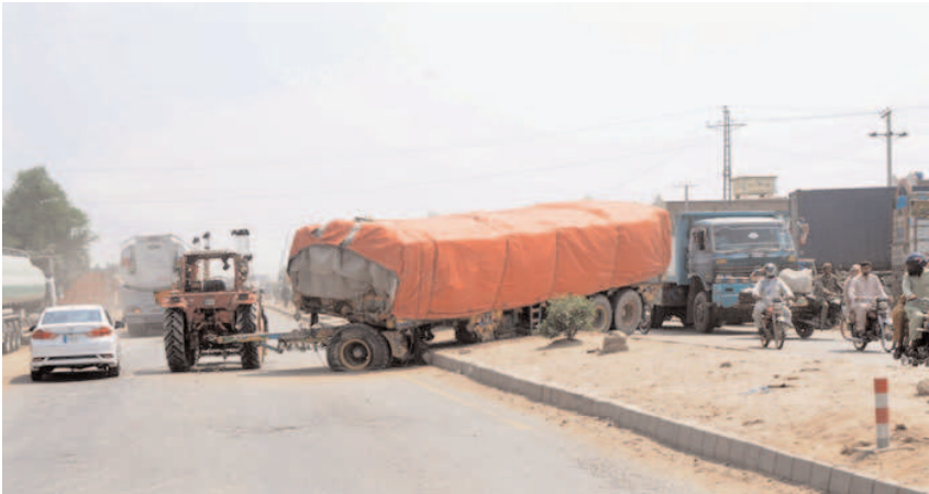
MULTAN: A heavy loaded trailer met an accident and crossed over the road divider creating a hurdle in the smooth flow of traffic near Bahawalpur bypass Chowk.

They demanded of the authorities to ensure early recovery of the snatched vehicle and measures to provide security to public lives and properties.