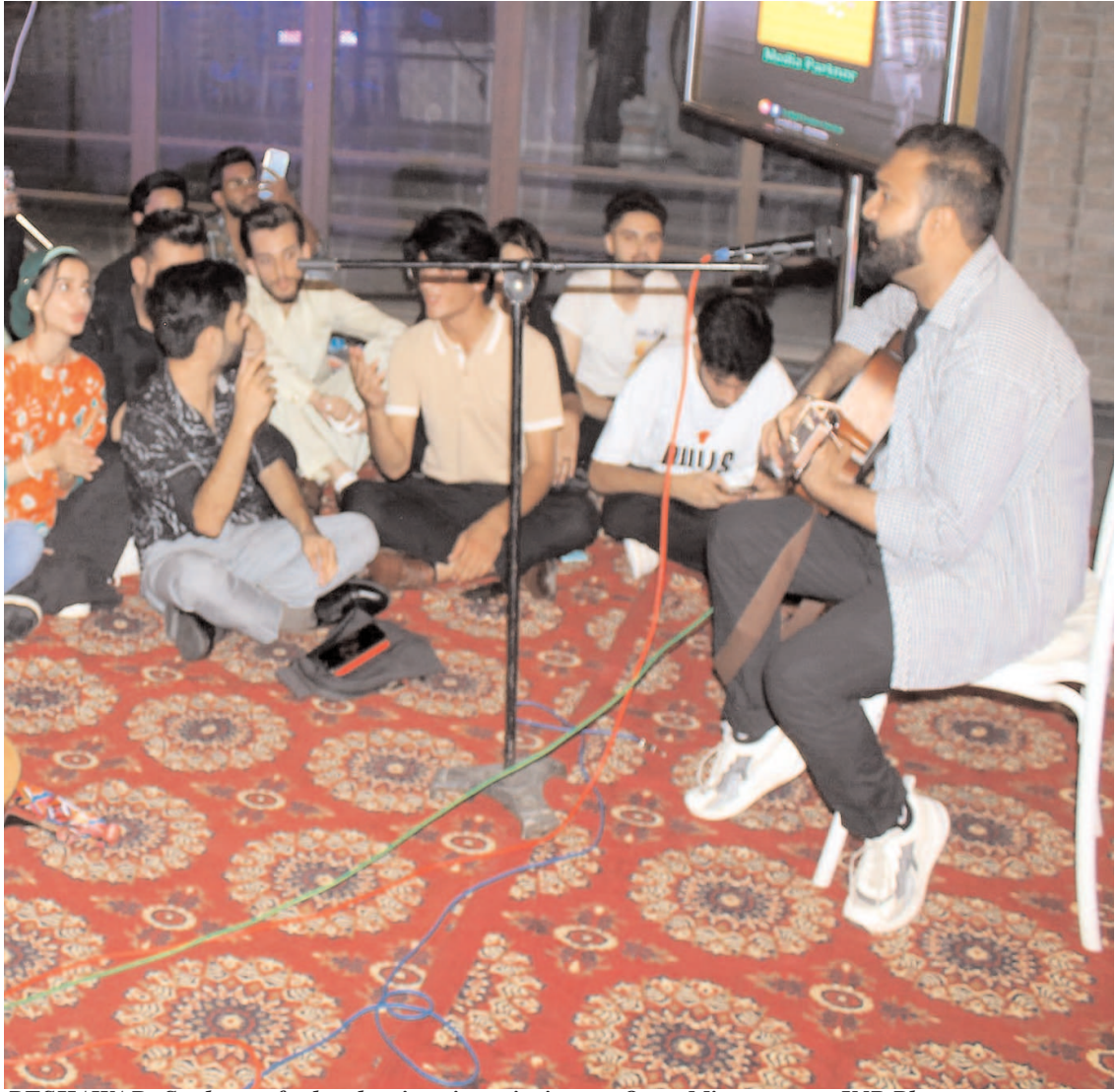
PESHAWAR: Students of a local university enjoying an Open Mic event.