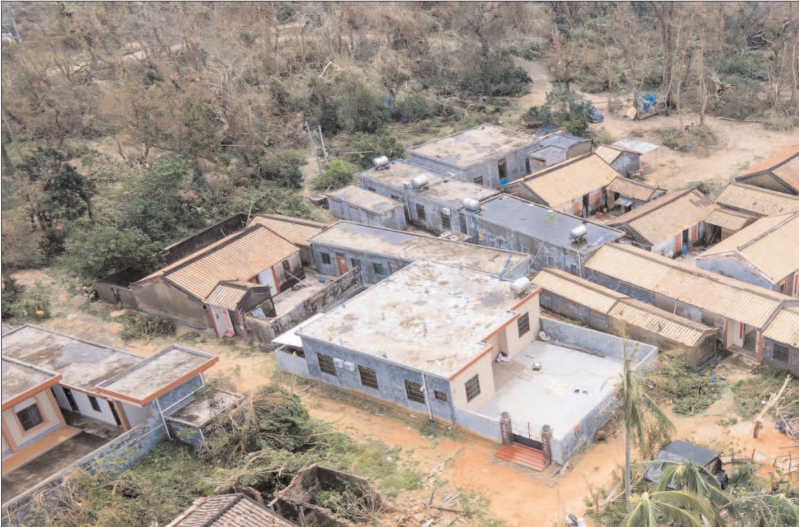
WENCHANG, CHINA: Aerial view of damaged houses after typhoon Yagi on Sunday in Wenchang, Hainan Province of China.

Addressing Federal Minister Khawaja Asif, he remarked, "Not even your father can conduct a military trial of Imran Khan."