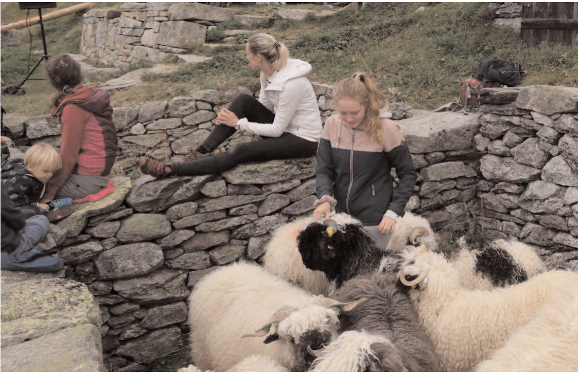
BELALP, SWITZERLAND: A Catholic priest leads an outdoor mass as sheep stand sorted in pens according to their owners in a stone enclosure dating back to the Middle Ages called a Färricha at the conclusion of the annual "Schäful" sheep drive on September 8, 2024 in Belalp, Switzerland.

Pokrovsk, which had a prewar population of about 60,000, is one of Ukraine's main defensive strongholds and a key logistics hub in the Donetsk region. Its capture would compromise Ukraine's defense and supply routes, and would bring Russia closer to its stated aim of capturing the entire Donetsk region.