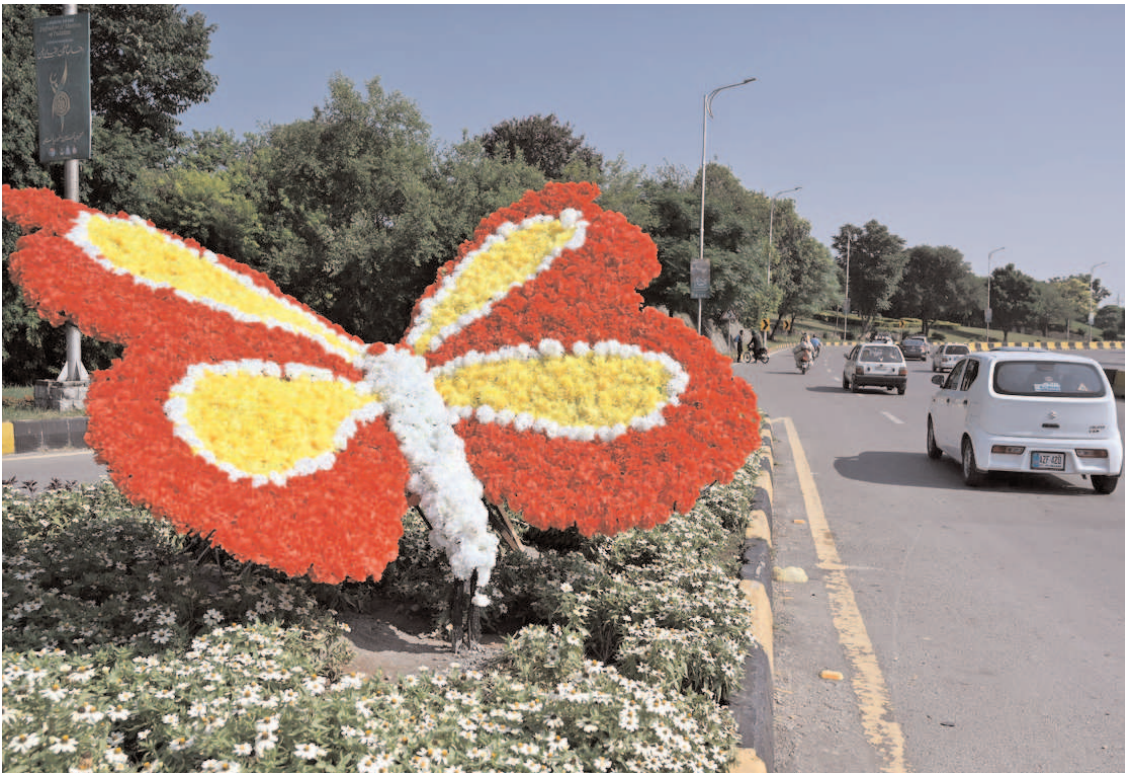
ISLAMABAD: A replica of butterfly installed at Kashmir Chowk in connection of beautification of the city.

ISLAMABAD (APP): Indus River System Authority (IRSA) on Sunday released 222,900 cusecs water from various rim stations with inflow of 243,800 cusecs. According to the data released by IRSA, water level in River Indus at Tarbela Dam was 1550.00 feet (maximum conservation level) and was 152.00 feet higher than its dead level of 1,398 feet. Water inflow and outflow in the dam was recorded as 132,300 cusecs and 131,800 cusecs respectively. The water level in River Jhelum at Mangla Dam was 1227.45 feet, which was 179.45 feet higher than its dead level of 1,050 feet. The inflow and outflow of water was recorded 28,800 cusecs and 8,000 cusecs respectively. The release of water at Kalabagh, Taunsa, Guddu and Sukkur was recorded as 162,000, 131,700, 185,100 and 137,000 cusecs respectively. Similarly, from River Kabul, a total of 31,500 cusecs of water released at Nowshera and 22,200 cusecs released from River Chenab at Marala.