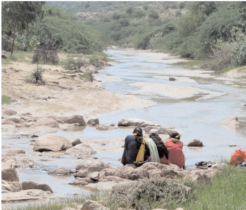
THARPARKAR: A family enjoying the nature during visit to the tourist spot in Nagarparkar. Rains have enriched Karoonjhar hills with lush green patches and have revived natural water course in the area, which is part of Thraparkar desert region.