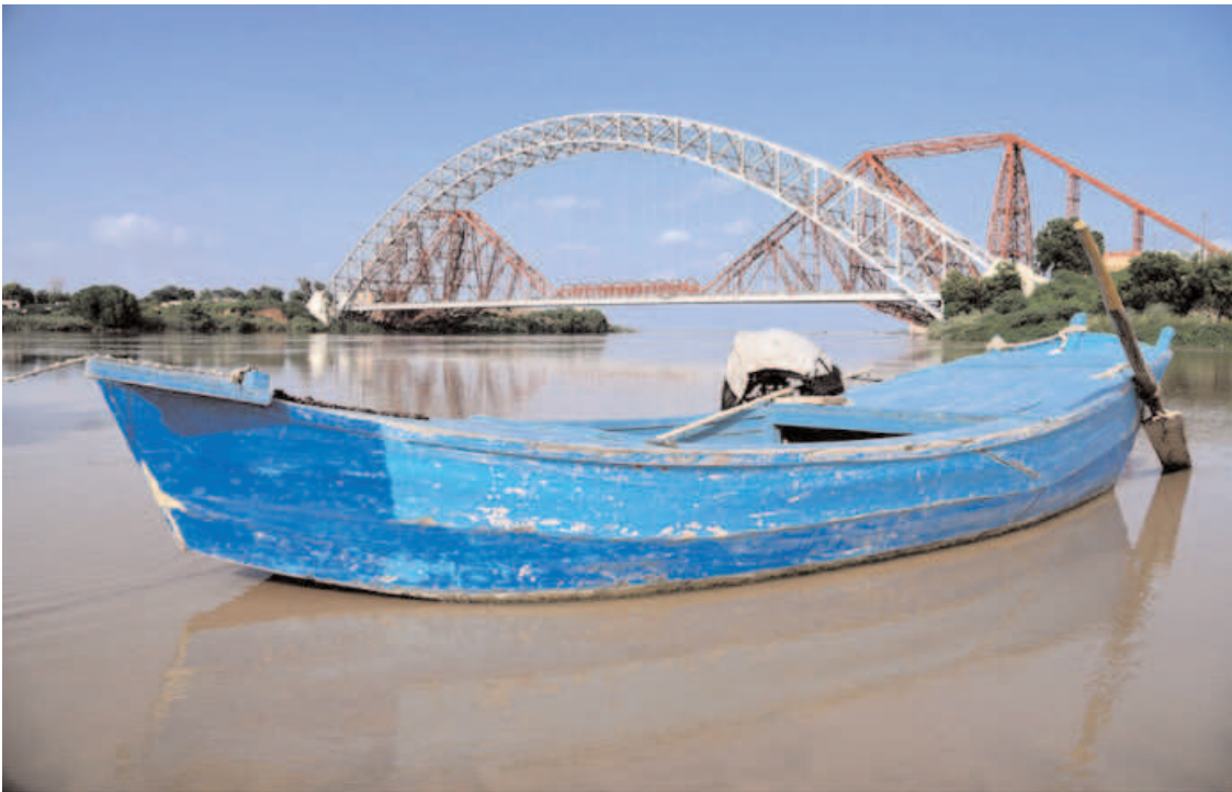
SUKKUR: A view of boat parked in front of Lansdowne Bridge and Ayub Bridge at Left Bank of Indus River near Rohri.

LAKKI MARWAT (INP): Three people, including two head constable brothers, were killed, and three others injured in two separate terror incidents in Wana and Lakki Marwat. In the first incident, an explosion occurred in Kadikoy Bazaar, a village near Wana in Lower Waziristan district, leaving one person, identified as Shamsuddin, son of Malik Jameel, killed, and three others injured. The explosion targeted a vehicle, which was completely destroyed. The injured individuals were immediately transported to the hospital for medical attention. In a separate attack, terrorists opened fire in Abba Khel, Lucky Marwat, killing Head Constables Safiullah and Naveedullah.