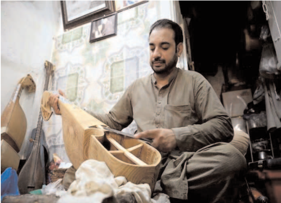
PESHAWAR: A man crafts traditional Rabab instruments at their workshop in the historic Dabgari area.