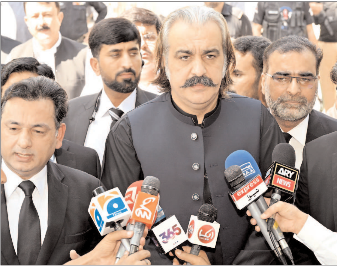
PESHAWAR: Chief Minister of Khyber Pakhtunkhwa, Ali Amin Gandapur talking to media persons.

land transactions and various services for its residents, DHA Islamabad had argued that the recent amendment imposed Excise Duty on property transfers without a corresponding change in the Act's charging section. They claimed that Excise Duty should apply only to goods and services, and that property transfers did not fit this definition.