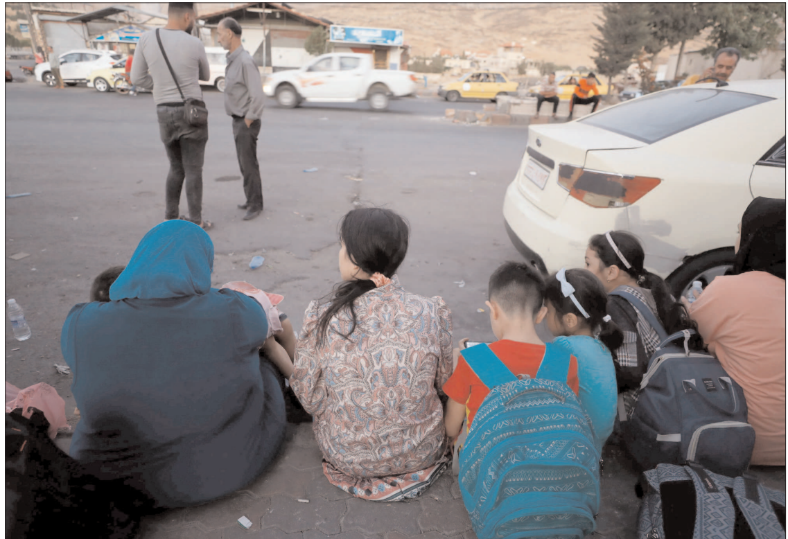
BEIRUT: Lebanese people, fleeing the Israeli bombardment, at the border crossing in Jdaidet Yabous, Syria.