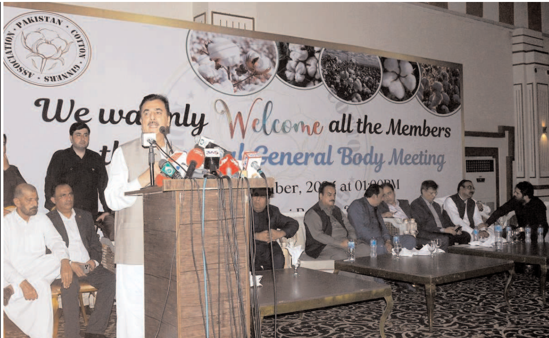
MULTAN: Chairman Senate Syed Yousaf Raza Gillani addressing during oath-taking ceremony of Pakistan Cotton Ginners Association.