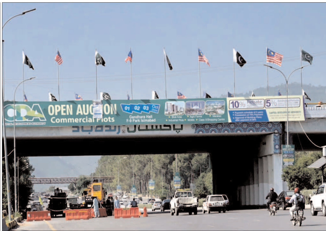
ISLAMABAD: Flags of Pakistan and Malaysia adorn Zero Point Interchange, welcoming Malaysia's Prime Minister Datuk Seri Anwar Ibrahim for to Pakistan in the first week of October.

Recognizing the multifaceted risks that Pakistan faces, including frequent flooding, droughts, and seismic activity, she said that empowering local communities through a holistic approach that integrates environmental sustainability, disaster risk reduction, and community engagement is crucial.