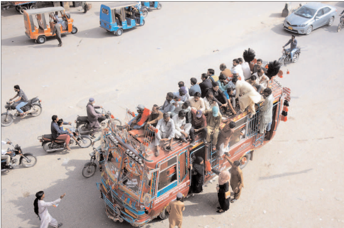
KARACHI: An overloaded bus with men precariously perched on its roof maneuvers through the busy streets of Korangi, posing a serious risk of a potential mishap in the city.

In Lahore, fitness checks were conducted on 8,000 vehicles, with 5,000 receiving fitness certificates. Citizens have been urged to report smog and environmental pollution complaints through the Green Punjab App or by calling 1373. A WhatsApp number 0321-0980980 has also been provided for complaints regarding smoke-emitting vehicles.