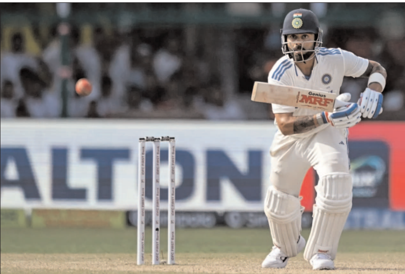
KANPUR: Virat Kohli got some boundaries going.

"It's special," said Jadeja. "I've been playing Test cricket 10 years and I've finally reached this milestone. Feeling proud of myself." Bangladesh had resumed at 107-3 under clear skies after rain and a soggy outfield had washed out the whole of Saturday and Sunday. Only 35 overs had been possible on Friday's opening day. Left-hander Mominul, who began the day on 40, reached his 13th Test hundred before lunch with a boundary off Ashwin. India led the two-match series 1-0 after they won the opener in Chennai by 280 runs.