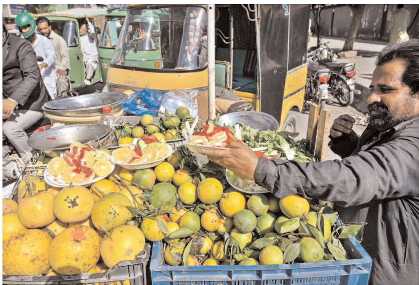
RAWALPINDI: A vendor slices and arranges fresh citrus fruits onto plates outside Benazir Hospital.