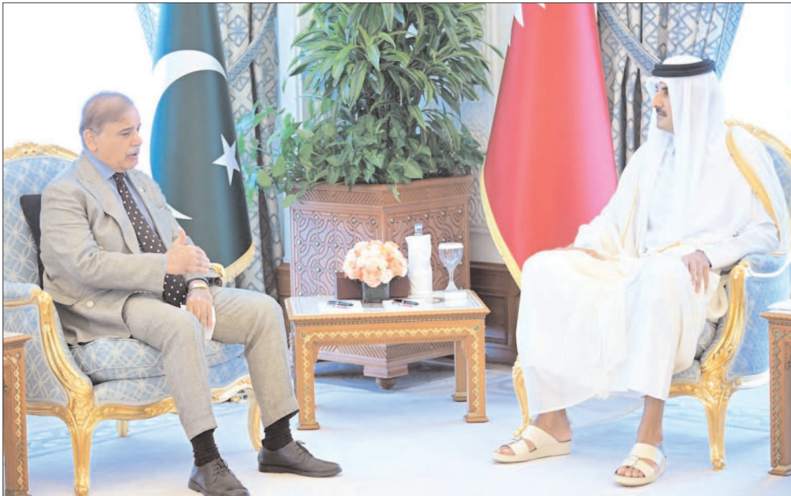
DOHA: Prime Minister Shehbaz Sharif meeting with Amir of Qatar, Sheikh Tamim bin Hamad Al Thani.