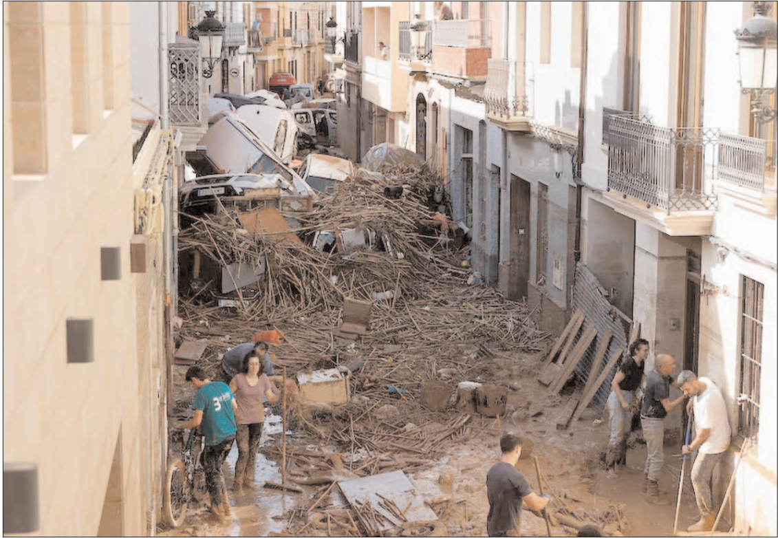
MADRID: People working to clear a mud-covered street with piled up cars in aftermath of torrential rains that caused flooding, in Paiporta, Spain.