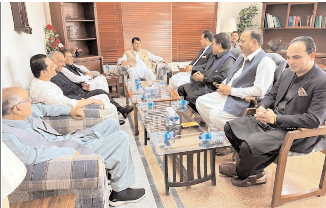
ISLAMABAD: Minister Kashmir Affairs Gilgit-Baltistan and SAFRON Amir Muqam meeting with PML-N leadership Azad Jammu Kashmir.

IoU reaffirmed their commitment to working alongside community councils and local authorities to improve waste management practices in Islamabad. The event concluded with a networking session, solidifying partnerships and shared commitments towards a sustainable future for Islamabad.