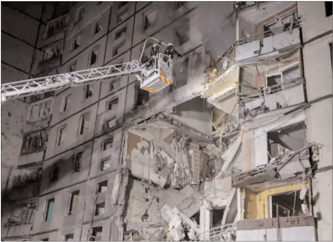
KYIV: Rescuers work at the site of an apartment building hit by a Russian air strike in Kharkiv, Ukraine.