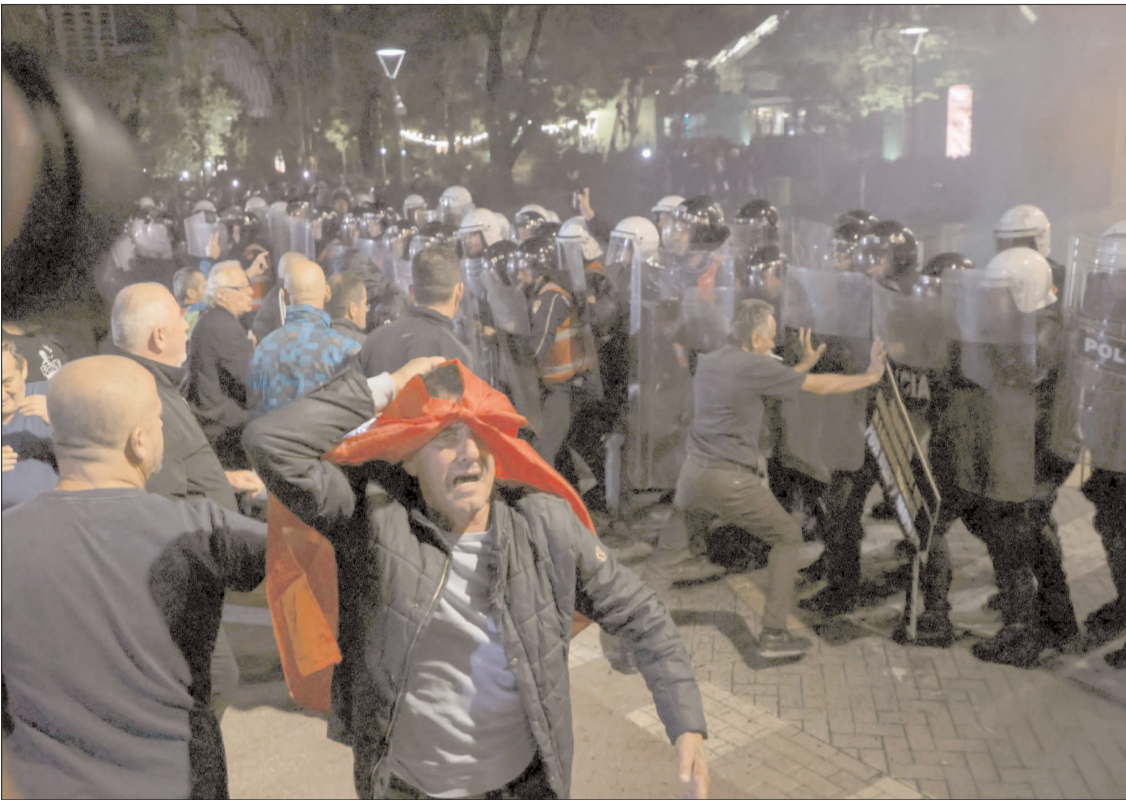
TIRANA: Opposition supporters scuffle with riot police during protest in Albania.

Preliminary results from some areas are expected from Thursday, and the full results must be delivered to the Constitutional Council within 15 days of polls closing to be validated and formally declared. Around 17 million people are registered to vote. The credibility of the election will be under scrutiny, with the leftist Frelimo party accused of ballot-stuffing and falsifying results in previous votes, including last year's local elections, where it was declared the winner in 64 out of 65 municipalities. Frelimo has consistently denied the accusations of election tampering. Teams of regional and international election observers are in Mozambique, including from the European Union.