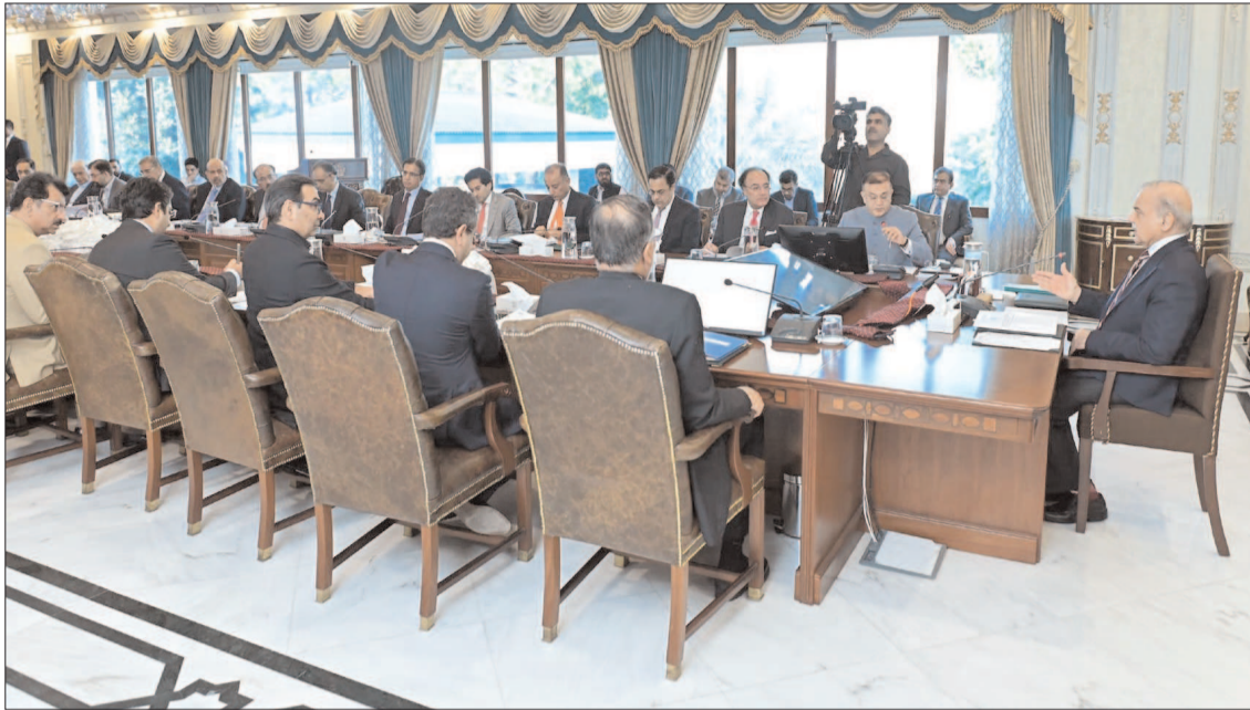
ISLAMABAD: Prime Minister Shehbaz Sharif chairing a meeting of Cabinet Committee on Energy.

He concluded by saying that anyone who takes up arms against the state and talks of separation would be considered an enemy, while those who speak within the legal framework, no matter how bitter, will be engaged in dialogue. In response to a question, Naqvi said that the chief minister of Khyber Pakhtunkhwa should clarify whether or not he met with the IG of Islamabad. "On one hand, it is said that the meeting was avoided, while on the other, it is claimed they met". The Interior Minister emphasized that the Khyber Pakhtunkhwa government must realize the poor state of law and order in the province, and the police's primary task should be to improve security conditions.