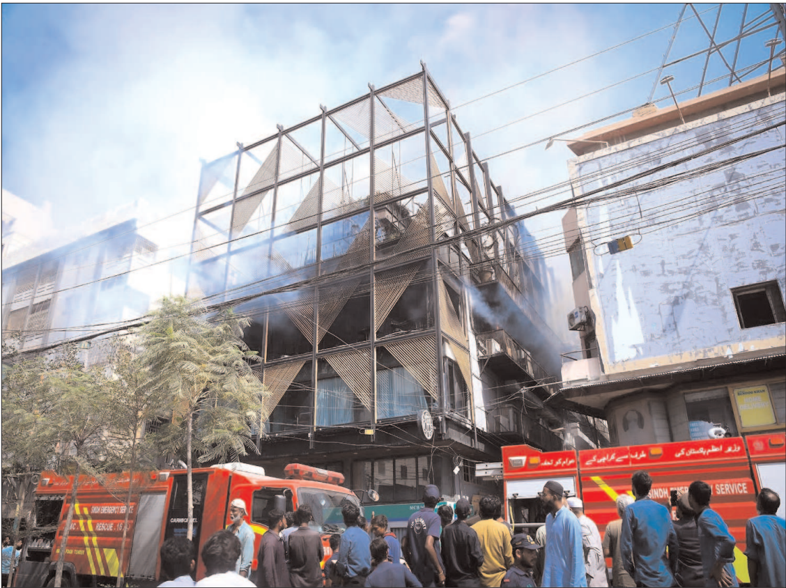
KARACHI: A view of smoke raise from burning restaurant after fire caught at Karachi Sindh Muslim Society locality.