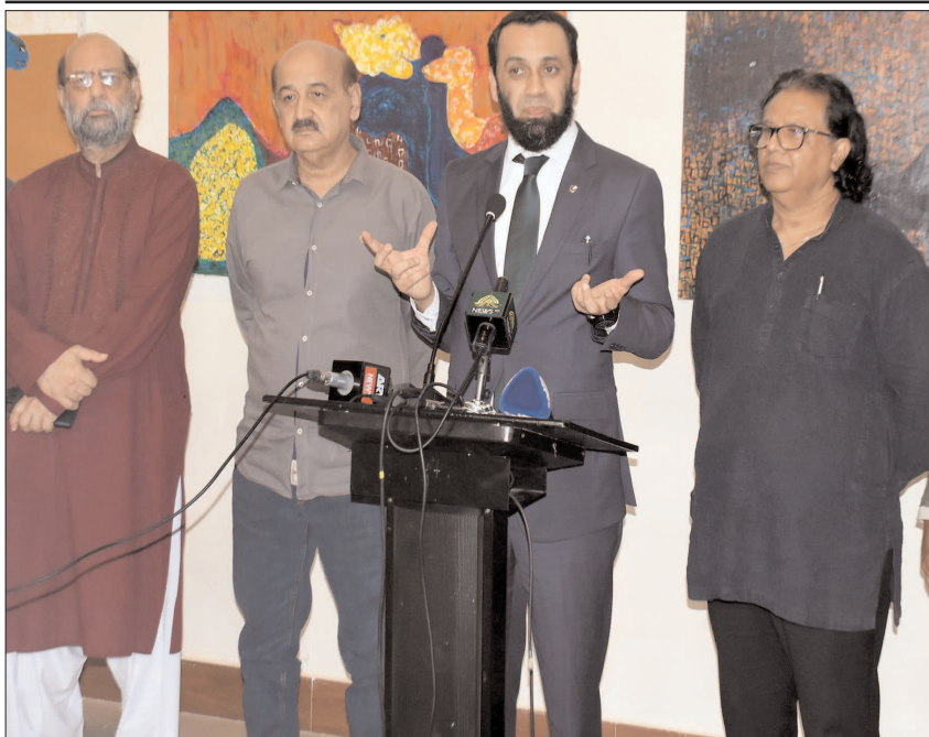
ISLAMABAD: Federal Minister for Information and Broadcasting, Attaullah Tarar talking to media persons.

Concerns over oil facilities and the potential for a wider regional conflict were also central to talks between Emirati officials and their US counterparts, said another Gulf source. In 2022, the Iran-aligned Houthis in Yemen fired missiles and drones at oil refuelling trucks near an oil refinery owned by UAE's state oil firm ADNOC and claimed the attack.