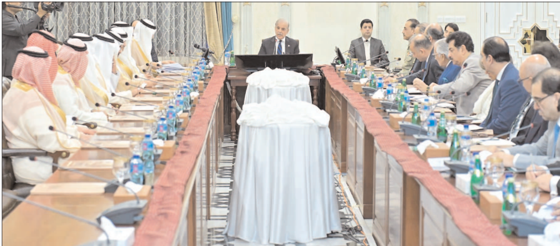
ISLAMABAD: A delegation of Saudi Arabia led by Investment Minister, Khalid Bin Abdul Aziz Al Falih called on Prime Minister Shehbaz Sharif.