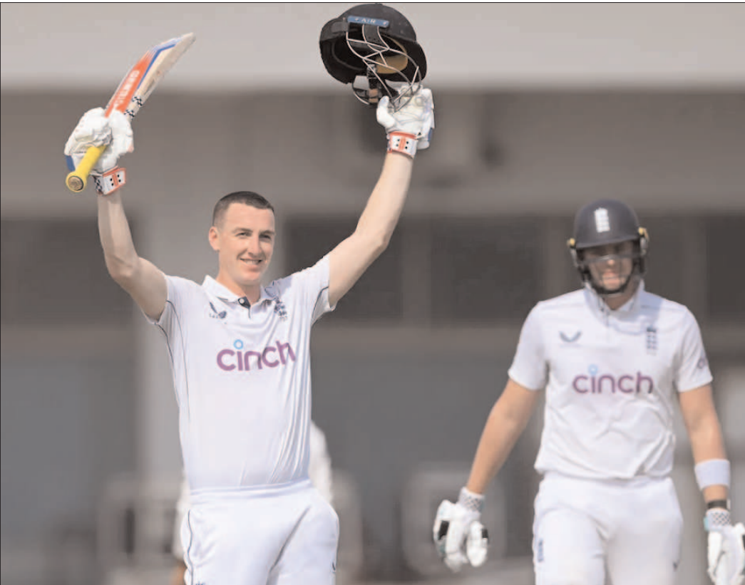
Harry Brook became the first England batter in 34 years to score a triple-century

MULTAN (Monitoring Desk): England dominated the fourth day's play against Pakistan as the hosts were 152 for six in their second innings, trailing by 115 runs to avoid an innings defeat in the first Test match at the Multan Cricket Stadium.