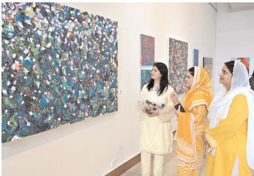
ISLAMABAD: An art enthusiast keenly observing the exhibits during the inauguration of "PASSAGES OF LIGHT," an exhibition featuring paintings by Sri Lankan artists Mueen Saheed and Bilaal Raji Saheed.

He urged all political parties to support the government's efforts for the country's betterment and prosperity, enabling Pakistan to move toward progress.