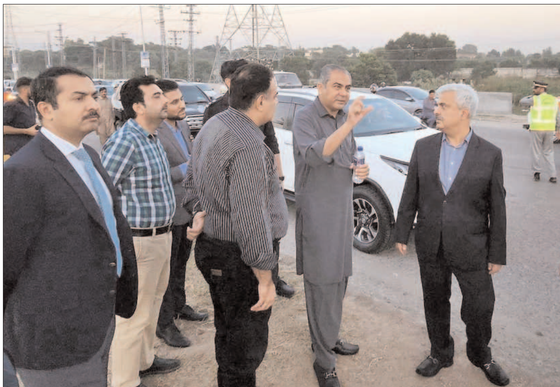
ISLAMABAD: Interior Minister Mohsin Naqvi overseeing the preparation of SCO Summit in Islamabad City.