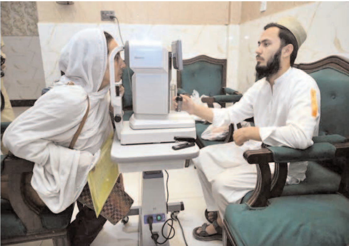
PESHAWAR: Doctors examining a journalist during free eye camp organized by Peshawar Press Club for journalists' families.

Muzammil Aslam said that the health card will be operated under biometric mechanism very soon and the biometric functionality will make the health card more efficient. He said that the health card is taken as a case study at the world level and doctors and health experts can use the card data for health research. Muzammil Aslam said that he congratulates Khyber Pakhtunkhwa Government and Khyber Medical University for successfully conducting MDCAT test and said that students of government institutions, have secured 10 positions among the top 20, which is a testament to the excellent performance of government colleges.