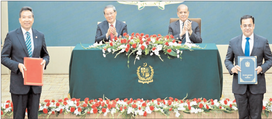
ISLAMABAD: Prime Minister Shehbaz Sharif Chinese Premier, Li Qiang during MoU exchange ceremony.