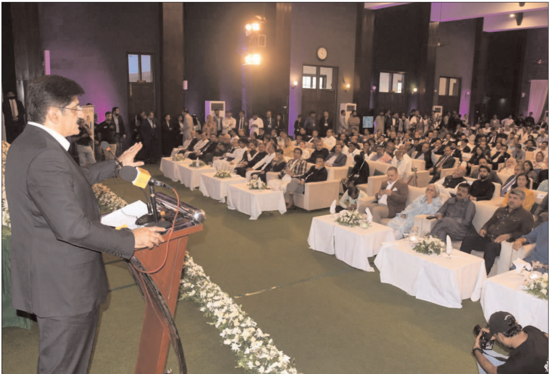
KARACHI: Sindh Chief Minister Syed Murad Ali Shah speaks at the Benazir Hari Card launching ceremony at CM House.