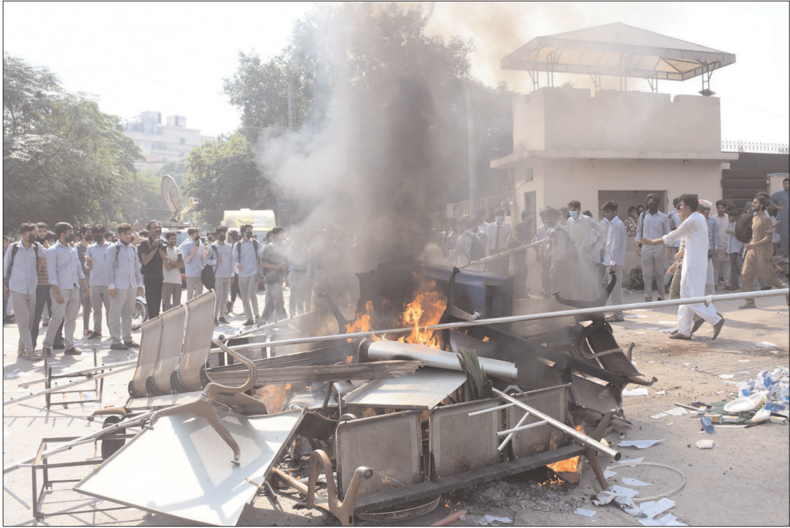
LAHORE: Angry students burning various items during a protest against alleged rape of a female student by security guard.