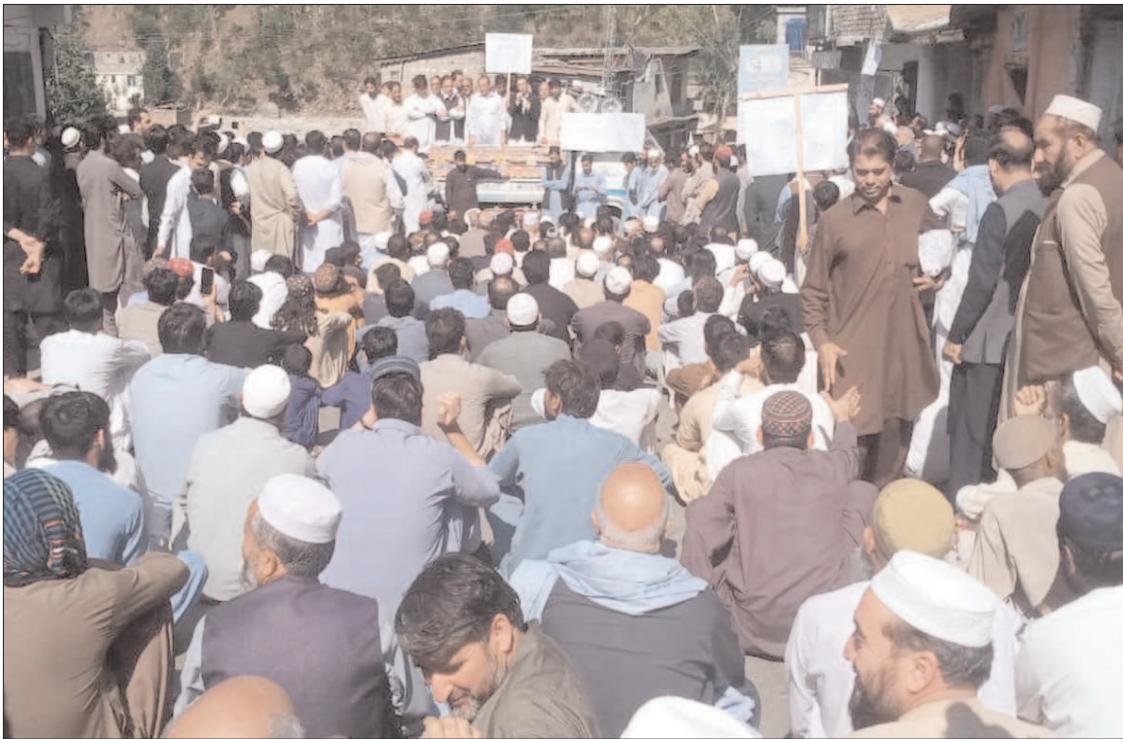
SHANGLA: Residents holding a protest for acceptance of their demands.