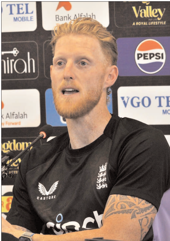
England's Captain Ben Stokes addresses a press conference.

Pakistan will be aiming for a strong performance in this must-win match, after a competitive first Test, and the selection of three spinners indicates their strategy to exploit the conditions in Multan. The second Test promises to be an intriguing battle between the two sides.