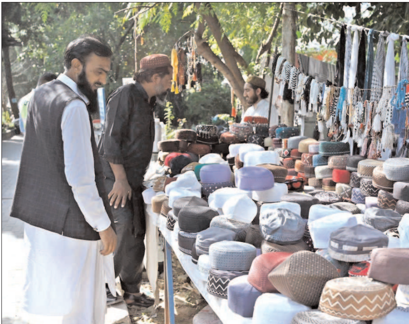
ISLAMABAD: A customer selecting to purchasing cap from a roadside vendor.

Private businesses, including plazas, petrol stations, and restaurants, are prepared to accommodate the needs of international guests during the summit. At night, the city offers an even more impressive view, with lights illuminating the skyline and key areas across the city.