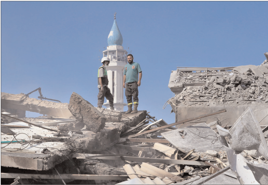
BEIRUT: Rescue workers standing on the rubble of destroyed buildings in southern Lebanese city of Nabatieh.