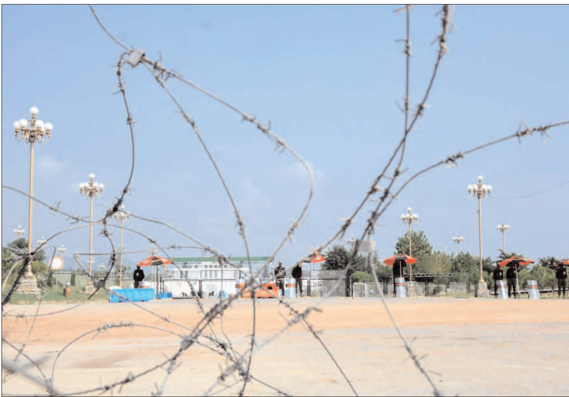
ISLAMABAD: Security officials are on high alert as security beefed up in the Federal Capital for the 23rd Shanghai Cooperation Organization (SCO) Summit.