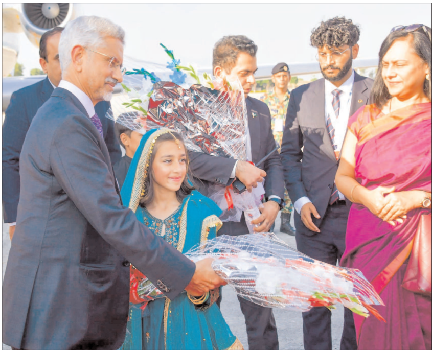
ISLAMABAD: Indian Minister of External Affairs, Subrahmanya Jaishankar being presented flower bouquet by children on his arrival at Nur Khan Airbase.

The chief minister said that the provision of justice and protection to the rights of such oppressed class of the society is the responsibility of the government and directed the concerned authorities to register brick kilns and compile data of labourers working in them. The chief minister also directed the authorities of the Labour Department to prepare a line of action to protect all rights of the brick kiln workers and ensure the provision of incentives announced by the government for them. He has also directed the speedy completion of the digitization process for better management of the Employees Social Security Institute (ESSI).