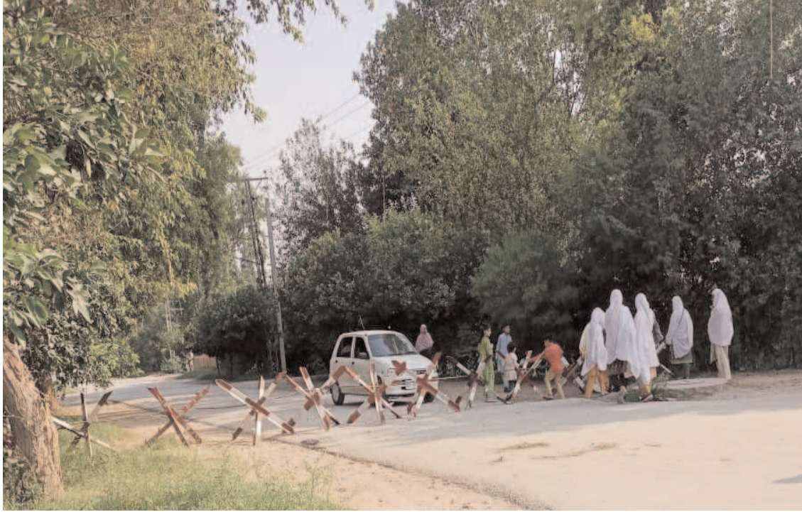
PESHAWAR: In a shocking move director Admin Peshawar University closes two main roads leading to his house in campus with sharp barricades causing inconvenience for families, children & female students.