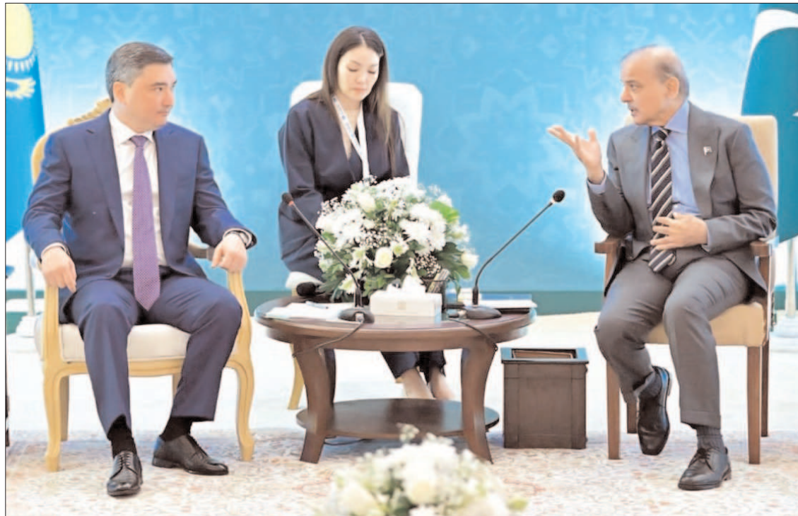
ISLAMABAD: Prime Minister Shehbaz Sharif meeting with Kazakhstan's counterpart, Olzhas Betenov on the sidelines of Shanghai Cooperation Organization Head of Government meeting.

Meanwhile, Prime Minister Shehbaz Sharif while reiterating Pakistan's strong desire to further strengthen cooperation with Kyrgyz Republic, stressed the need to enhance new avenues of collaboration in the areas of trade, investment, people-to-people contacts and regional connectivity. The prime minister held a bilateral meeting with Chairman of the Cabinet of Ministers of the Kyrgyz Republic Akylbek Japarov on the sidelines of SCO Council of Heads of Government (CHG) Meeting, being held in Islamabad.