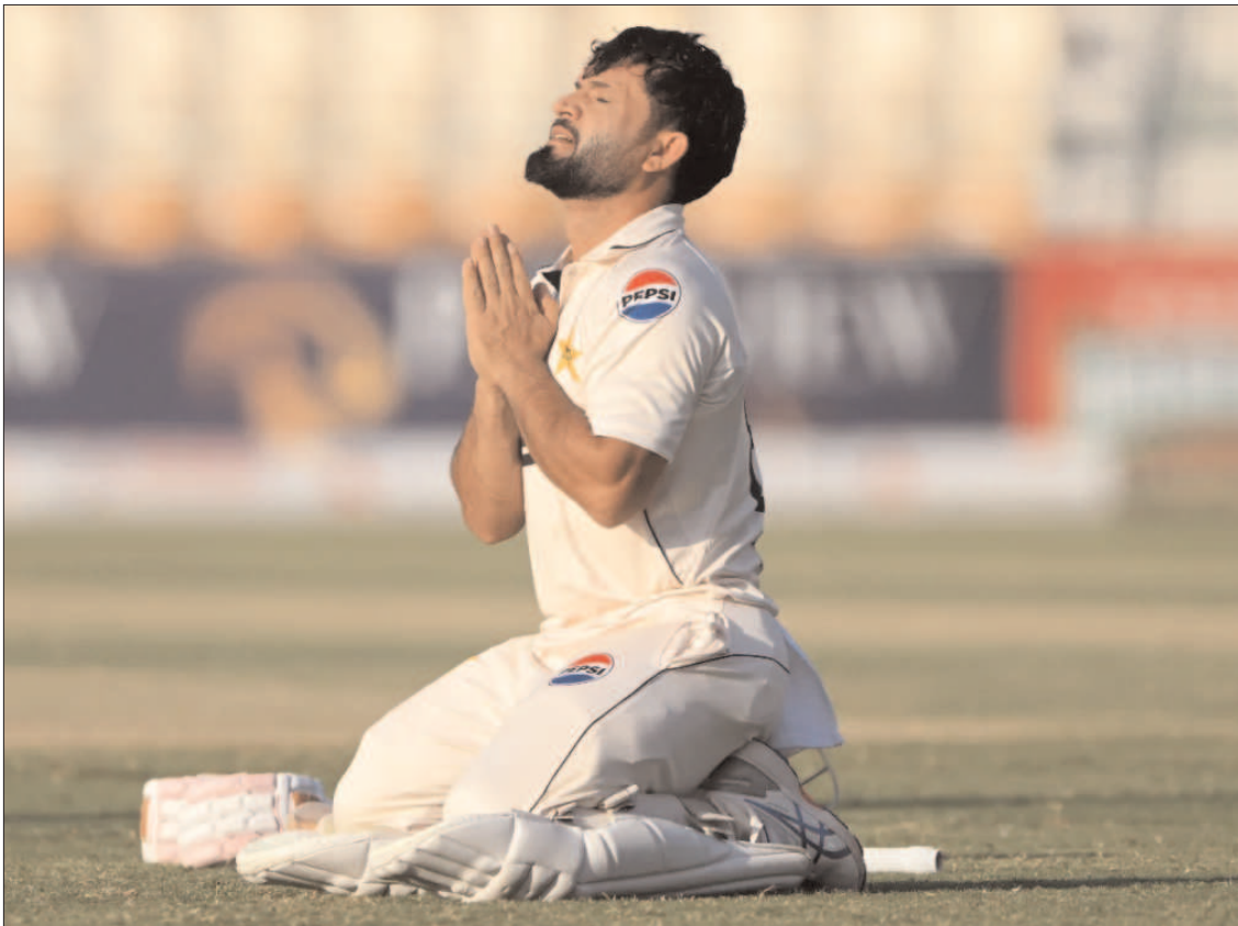
MULTAN: Pakistan batter Kamran Ghulam celebrates his debut century (100 runs) during day one of the Second Test Match between Pakistan and England at Multan Cricket Stadium.

MOSCOW (AFP): The head of Russia's Olympic Committee announced his resignation on Tuesday, a surprise move that comes as Moscow faces isolation from international sport over its Ukraine offensive. Stanislav Pozdnyakov, a five-time Olympic medalist, said in his resignation letter there were "timely" reasons why Russian sport needed a new leader, without going into detail. "Geopolitical challenges faced by our country dictate the need to optimise and centralise the management of key spheres of activity, including top-level sports," he said. A professional fencer, Pozdnyakov was elected as the committee chief in 2018 as Russia faced a string of doping scandals that saw it barred the following year from a number of Olympic sports for four years. Pozdnyakov condemned the International Olympic Committee (IOC) ruling, following Moscow's 2022 invasion of Ukraine, that Russian athletes could only compete at the Paris Olympics as neutrals and urged Russian athletes not to take part.