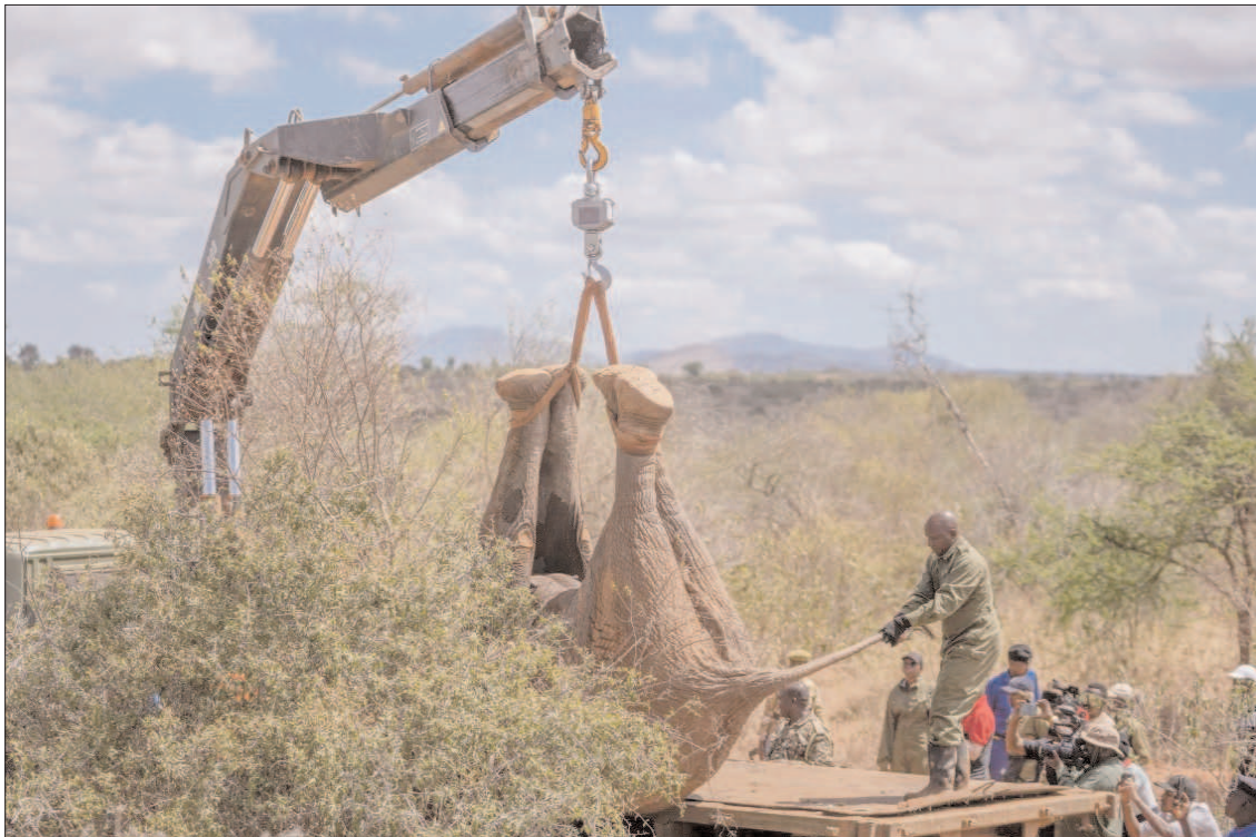
NAIROBI: Kenya Wildlife Service rangers and a capture team load an elephant into a truck at Mwea National Reserve.

"I don't see the difference between a national MP's task and a European MP's task, except the scale," Le Pen said. "We're doing politics!" If found guilty, defendants could face a potential jail sentence of up to 10 years and a one million euro ($1.1 million) fine. Those like Le Pen who were elected officials at the time risk being barred from public office for up to 10 years, while the unelected could face a five-year ban. If Le Pen was cleared, it would add credibility to her and political party, as they seek to leave behind a reputation for racism and anti-Semitism when her father, Jean-Marie Le Pen, 96, ran the National Front.