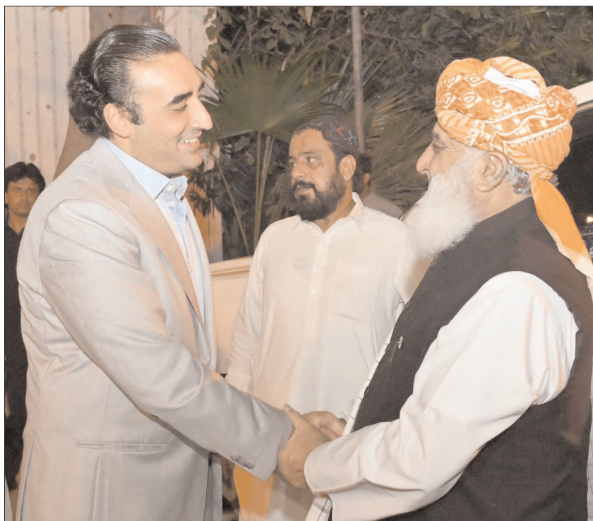
KARACHI: Chief of JUI-F, Maulana Fazlur Rehman shaking hands with PPP Chairman, Bilawal Bhutto Zardari prior to a meeting.

The deal follows talks that began in 2018. It is expected to significantly increase India's surveillance and intelligence capabilities and is in line with US efforts to coax India away from buying Russian military equipment and counter China's growing dominance. India's apex defence body approved the procurement last year just before Prime Minister Narendra Modi's state visit to Washington, while the Pentagon approved it in February.