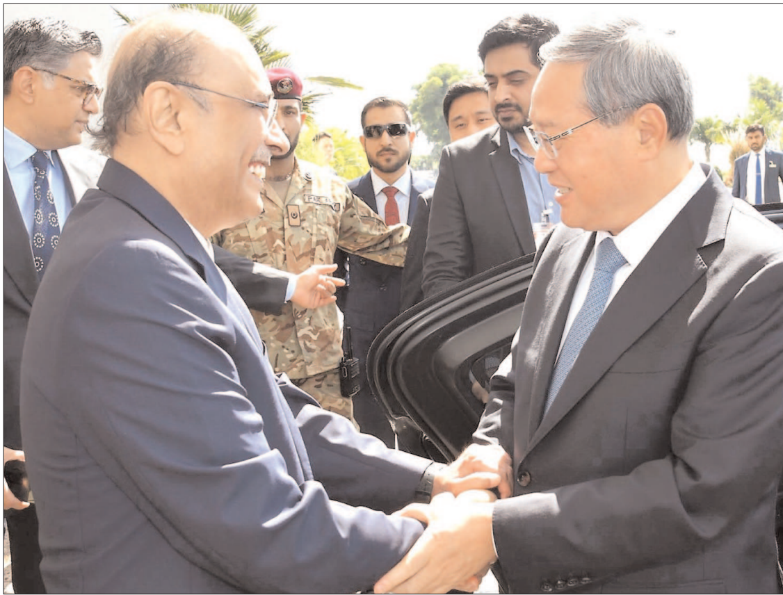
ISLAMABAD: President Asif Ali Zardari welcoming the visiting Chinese Premier, Li Qiang, at Aiwan-e-Sadr.