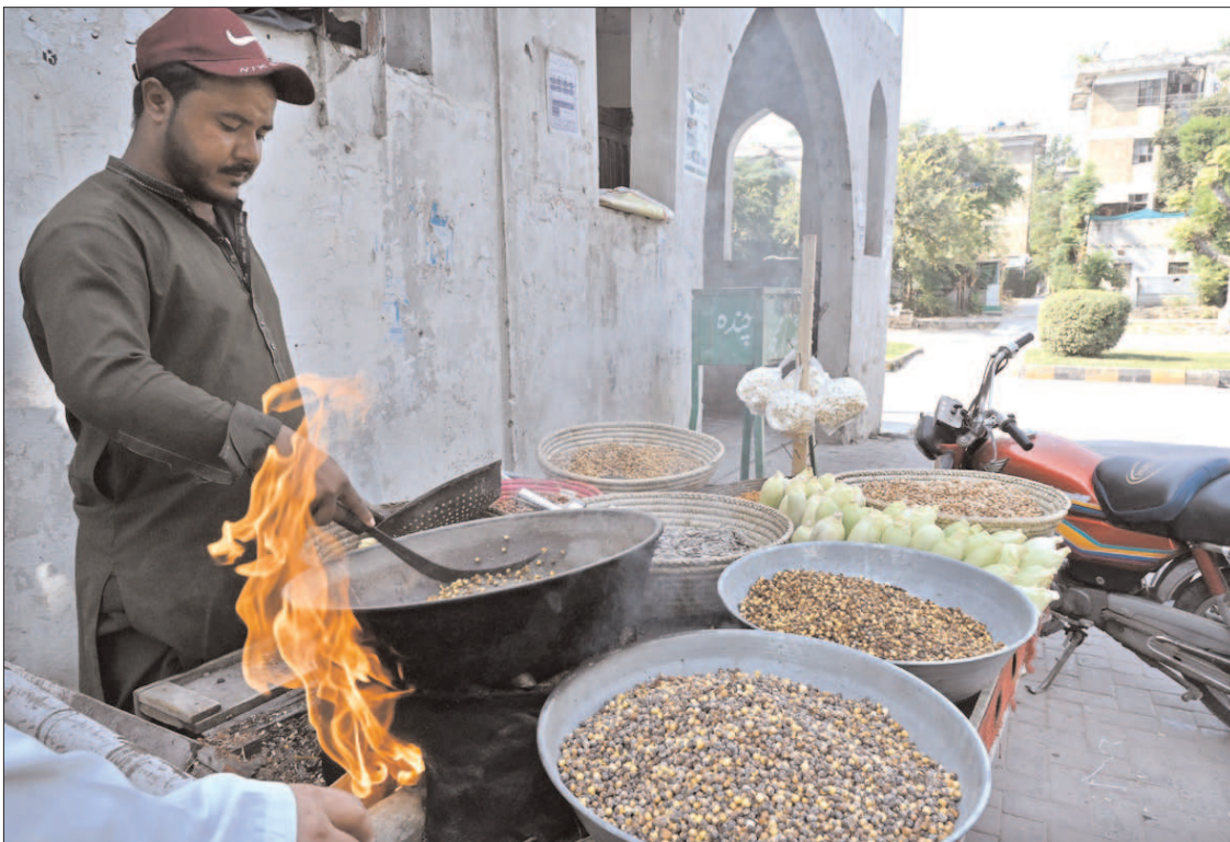
ISLAMABAD: A vendor busy roasting grams for customers at Peshawar Mor.

She concluded that diverse cropping systems can enhance ecological performance, soil health, and biodiversity, ultimately playing a critical role in achieving food security amidst climate change challenges.