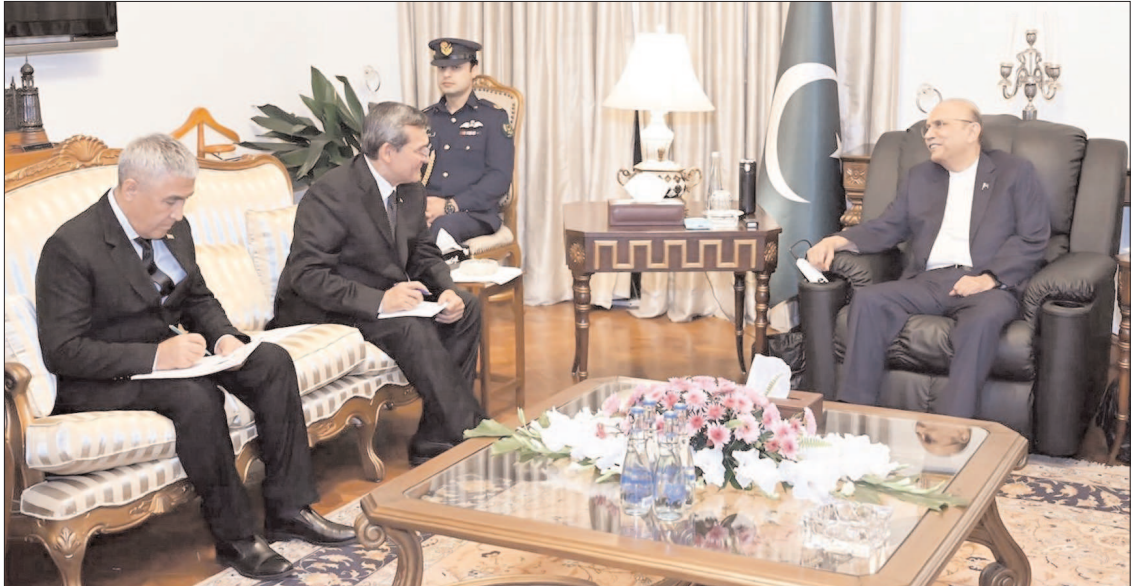
ISLAMABAD: Deputy Chairman of the Cabinet of Ministers/Minister of Foreign Affairs of Turkmenistan, Rashid Meredov, called on President Asif Ali Zardari, at Aiwan-e-Sadr.