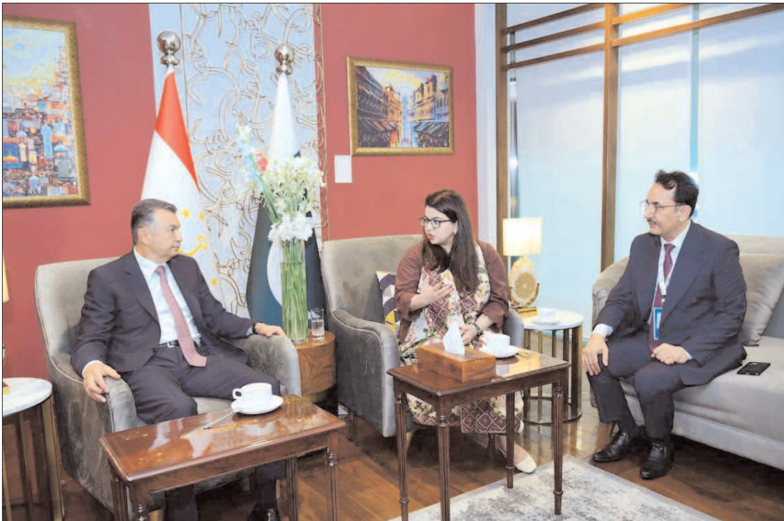
ISLAMABAD: Tajikistan's Prime Minister, Kokhir Rasulzoda, has wrapped up his visit to Pakistan after attending the 23rd Shanghai Cooperation Organization (SCO) conference. Minister of State for Information Technology and Telecommunication, Shaza Fatima Khawaja, bid him farewell at Islamabad Int'l Airport.