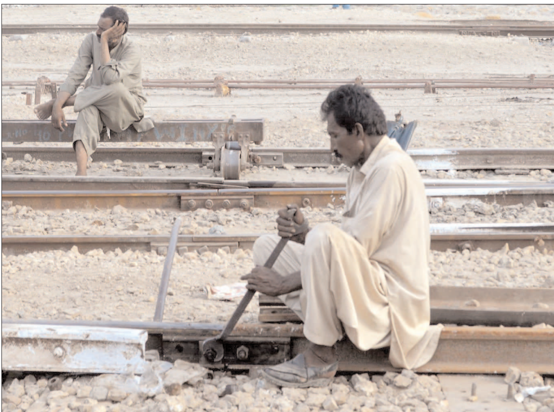
HYDERABAD: Workers busy in repairing of railway tracks.

MULTAN (INP): Another Nadra center was setup at Sher Shah Adhiwala here on Wednesday. Pakistan People's Party Leader, Member National Assembly (NA-157), Syed Ali Kasim Gillani, inaugurated the new Nadra office. According to the spokesperson, locals of four union councils would get benefit as they had to travel far to Katcheri chowk office.