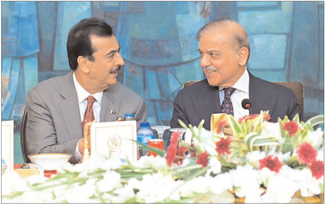
ISLAMABAD: Prime Minister Shehbaz Sharif exchanging views with Chairman Senate Syed Yousaf Raza Gillani at a banquet organized in honour of senators.

He said all political parties and the people had made sacrifices to help the country overcome difficulties. "All political parties and institutions are working together for the national development," he added. He said foreign remittances have also been witnessing consistent increase for last several months which reflected the confidence of the overseas Pakistanis on the incumbent government. Chairman Senate Syed Yousaf Raza Gilani, DPM Ishaq Dar, and government allied parties's senators attended the event.