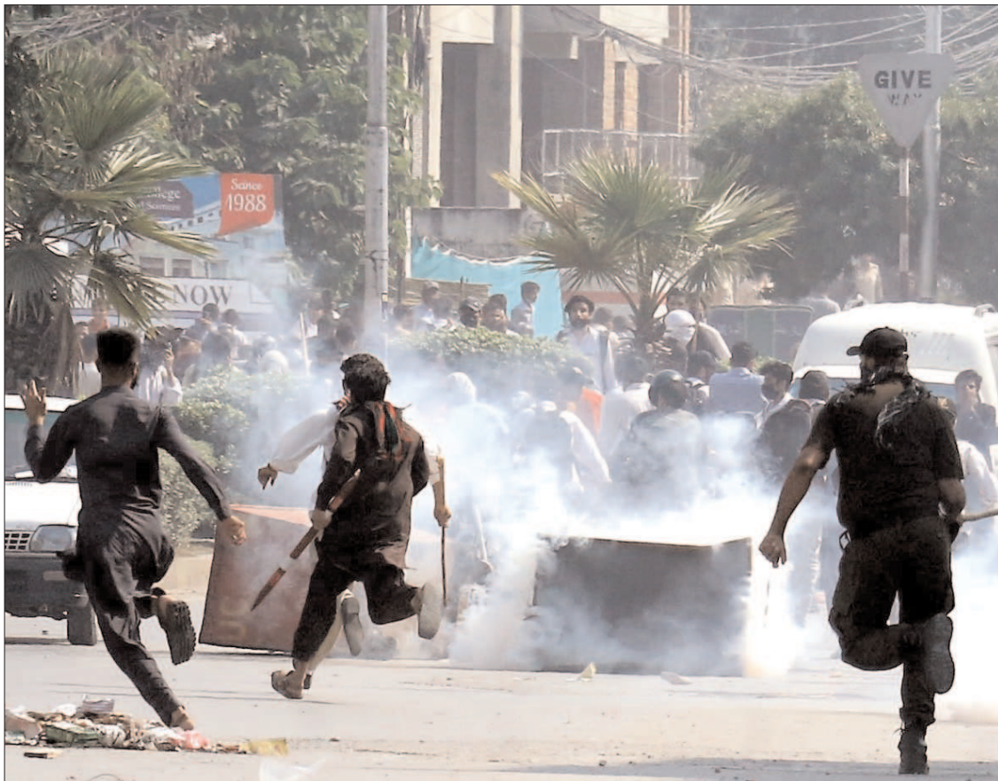
RAWALPINDI: A view of clash between police and students during a protest against alleged rape of girl in Lahore.

He called upon the nation to honor the sacrifices of the Karsaz martyrs by continuing their legacy and reaffirming their dedication to a democratic and just Pakistan. "As we mark this solemn day, we renew our pledge to safeguard democracy, to combat extremism, and to ensure that no force can derail the progress of our beloved country," he added. Bilawal Bhutto Zardari concluded his message by extending his deepest condolences to the families of the victims, promising that the PPP will forever honor the memory of their loved ones and carry forward the mission for which they laid down their lives.