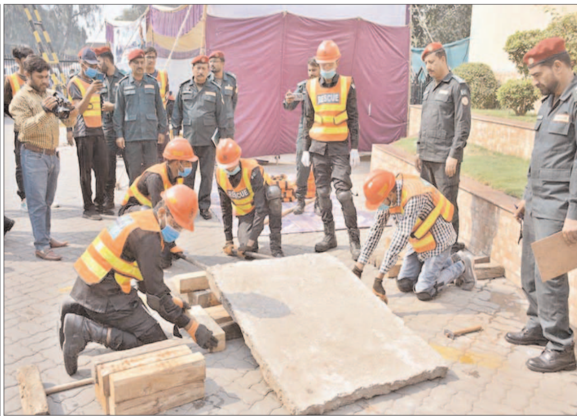
FAISALABAD: Rescue 1122 Faisalabad CERT (Community Emergency Response Team) performing rescue skills during annual CERT Challenge competitions at Central Rescue Station GTS Chowk.

The Colleges and universities should also start working on maintaining the data about employability of their students who graduate out of their institutes. This data may comprise the details as what is the employability rate, what salary they are earning currently and they are being properly gratified for the time and money which their parents spent during their education. This will add to the value addition of their work.