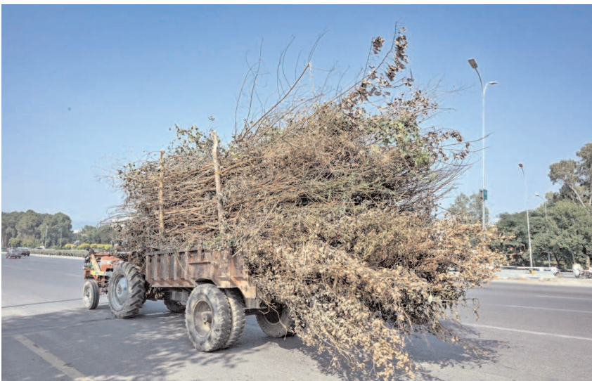
ISLAMABAD: A tractor trolley on way loaded with dry branches of tree near Zero Point.

President of IIUI, while addressing the gathering, expressed deep sorrow, stating, "The university has lost a great asset. His passing is not just a personal loss but a collective grief for all of us who have benefited from his leadership and commitment."