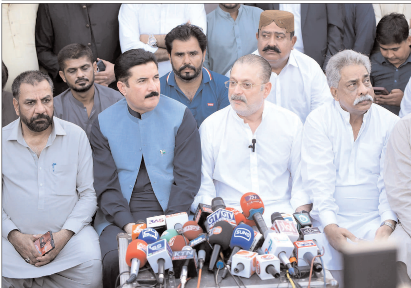
HYDERABAD: Sindh Minister for Excise and Transport Sharjeel Inam Memon and KP Governor, Faisal Kareem Kundi addressing a press conference.

The meeting also Okayed the project of 120 Km long 220 KV Power Transmission Line to be constructed from Swat to Chakdara. This project will facilitate evacuation of clean and environment friendly power to be produced through Hydro Power projects of the provincial government. It will generate Rs. 54 billion annually for the provincial kitty leading self-sustainability of the province. Moreover, it will not only boost economic activities by providing electricity at cheaper rates to the industries but will also provide relief to the poor people through provision of electricity at discounted prices. Moreover, it was also decided to establish Trade Corridors Hub at Torkham aimed at facilitating and streamlining the trade activities with Afghanistan and Central Asian Republics.