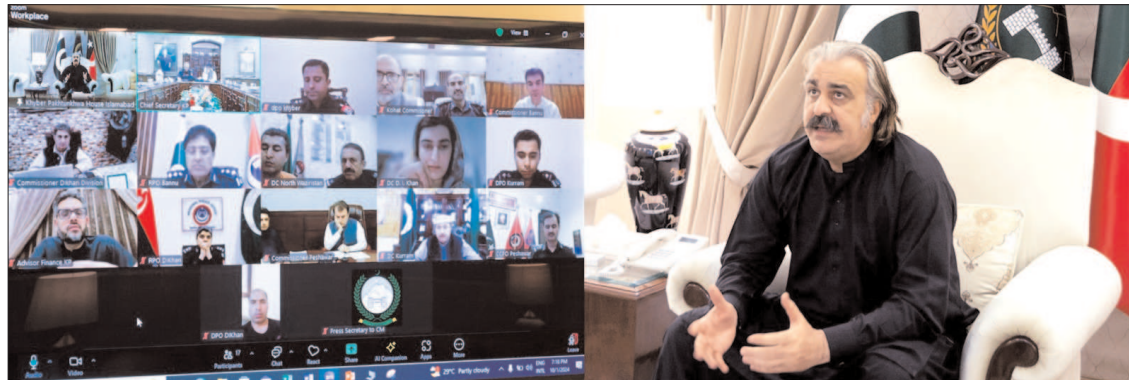
PESHAWAR: Khyber Pakhtunkhwa Chief Minister Ali Amin Khan Gandapur chairing meeting on law and order situation in the province.

He assured the media that the law enforcement agencies would be asked not to create hurdles for working journalists in performing their professional duties during any protest rallies.