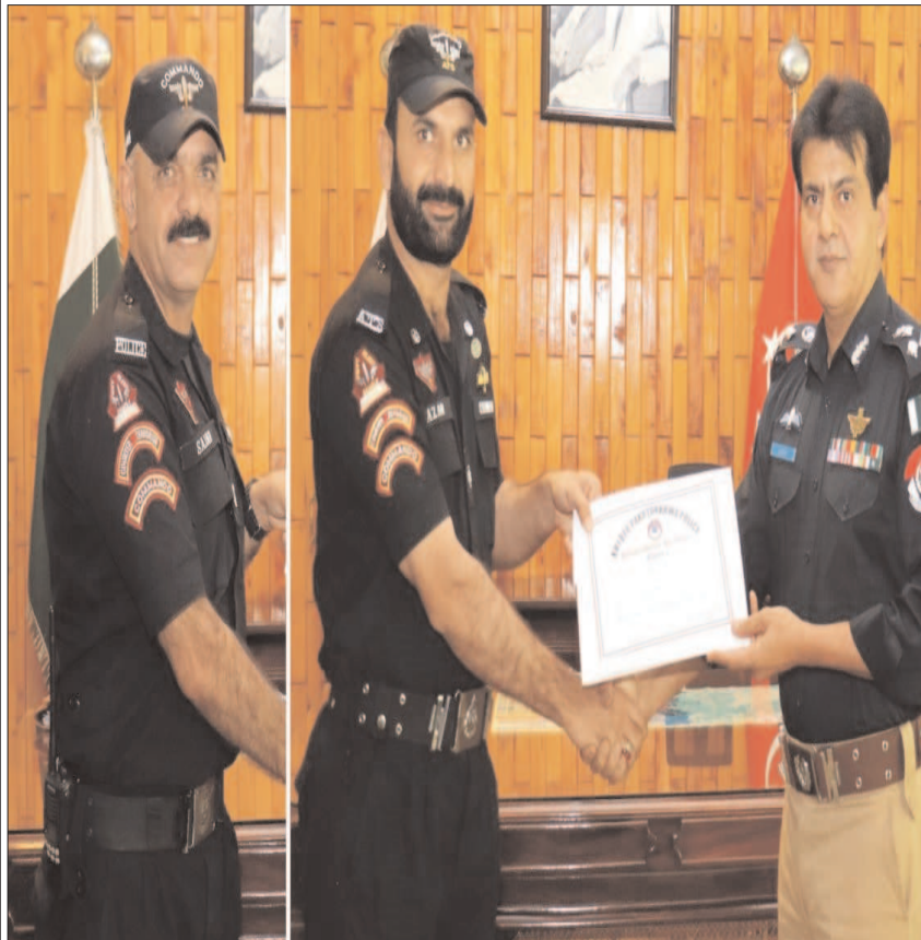
ABBOTTABAD: Deputy Inspector General of Police Hazara Region, Tahir Ayub Khan distributing certificates among policemen for best performance.

A s s i s t a n t Commissioner Hangu strictly directed the market owners where Dengue Larvae have been detected to immediately empty and clean the water tanks otherwise the market will be sealed.