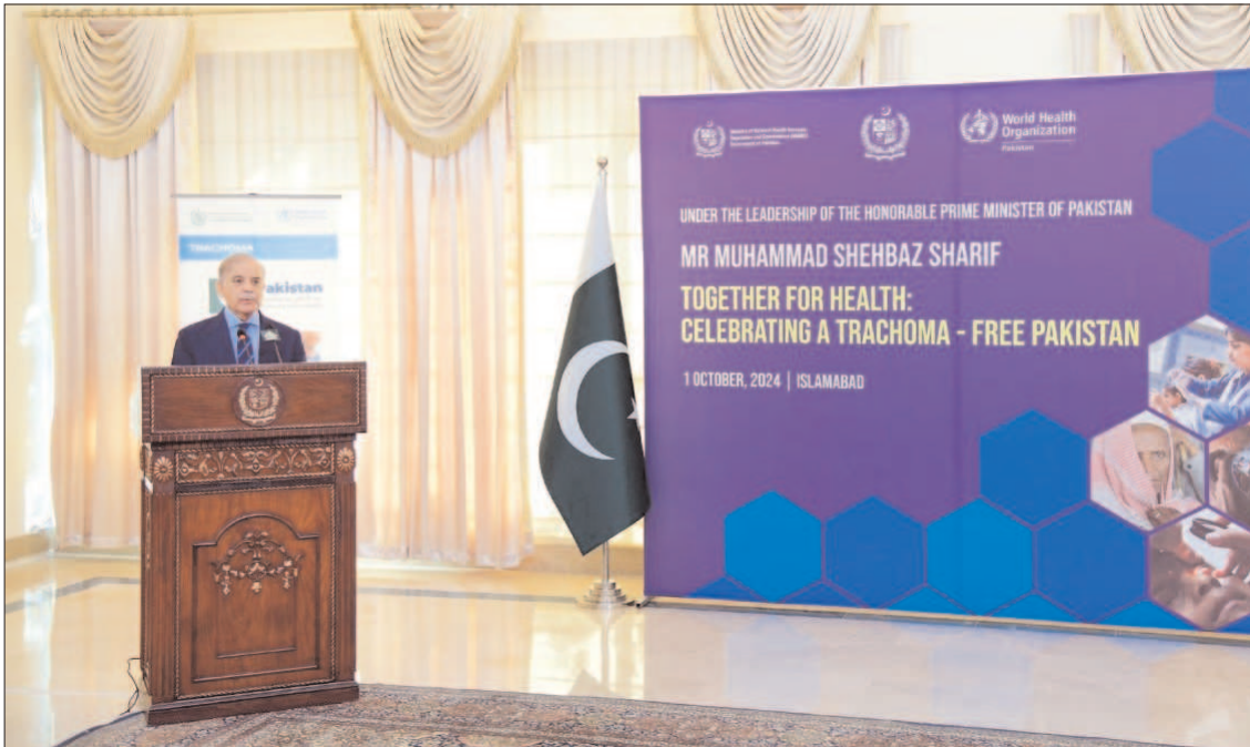
ISLAMABAD: Prime Minister Muhammad Shehbaz Sharif addressing a ceremony with regard to elimination of TRACHOMA as a public health problem from Pakistan.