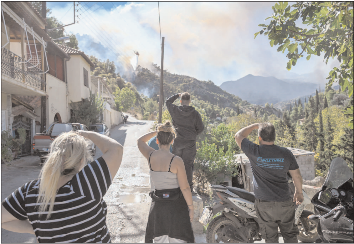
ATHENS: Locals watching a wildfire burning near the village of Helidori, near Corinth in Greece.