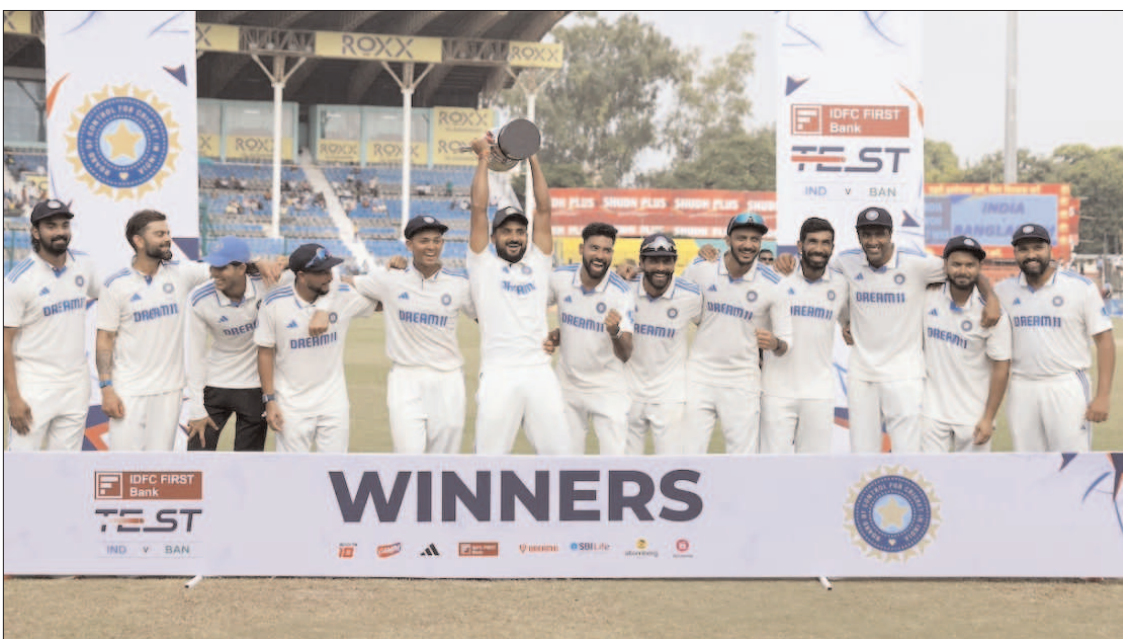
KANPUR: Akash Deep holds the series trophy aloft as the Indians celebrate.

Pakistan squad for first Test against England: Shan Masood (captain), Saud Shakeel (vice-captain), Aamir Jamal, Abdullah Shafique, Abrar Ahmed, Babar Azam, Mir Hamza, Mohammad Huraiera, Mohammad Rizwan (wicket-keeper), Naseem Shah, Noman Ali, Saim Ayub, Salman Ali Agha, Sarfaraz Ahmed (wicket-keeper), and Shaheen Shah Afridi, Zahid Mehmood.