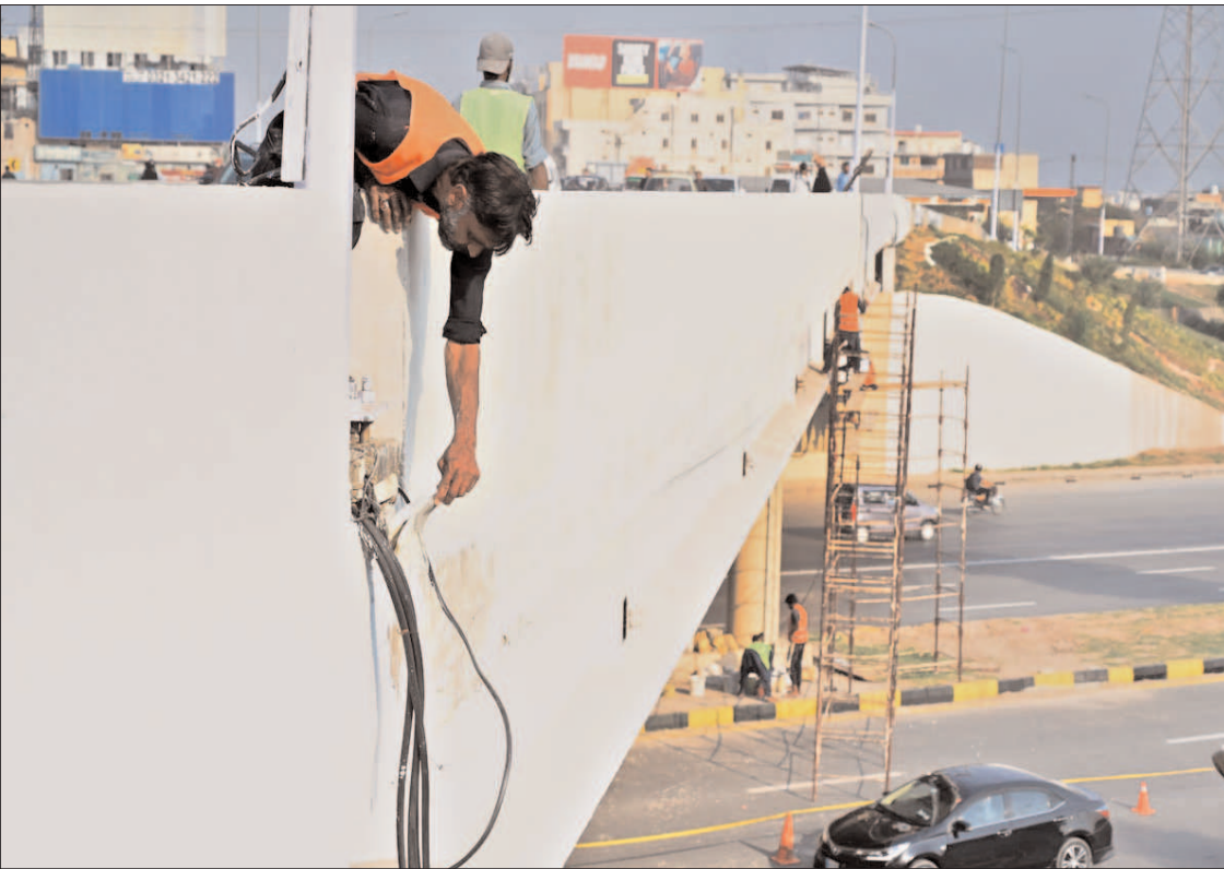
ISLAMABAD: Laborers hard at work painting a flyover bridge, adding a fresh touch to the Federal Capital infrastructure.

The successful operations in Pishin and Zhob mark another significant blow to the "Fitna al Khawarij" network and bring the nation one step closer to peace and stability in its conflict-affected regions.