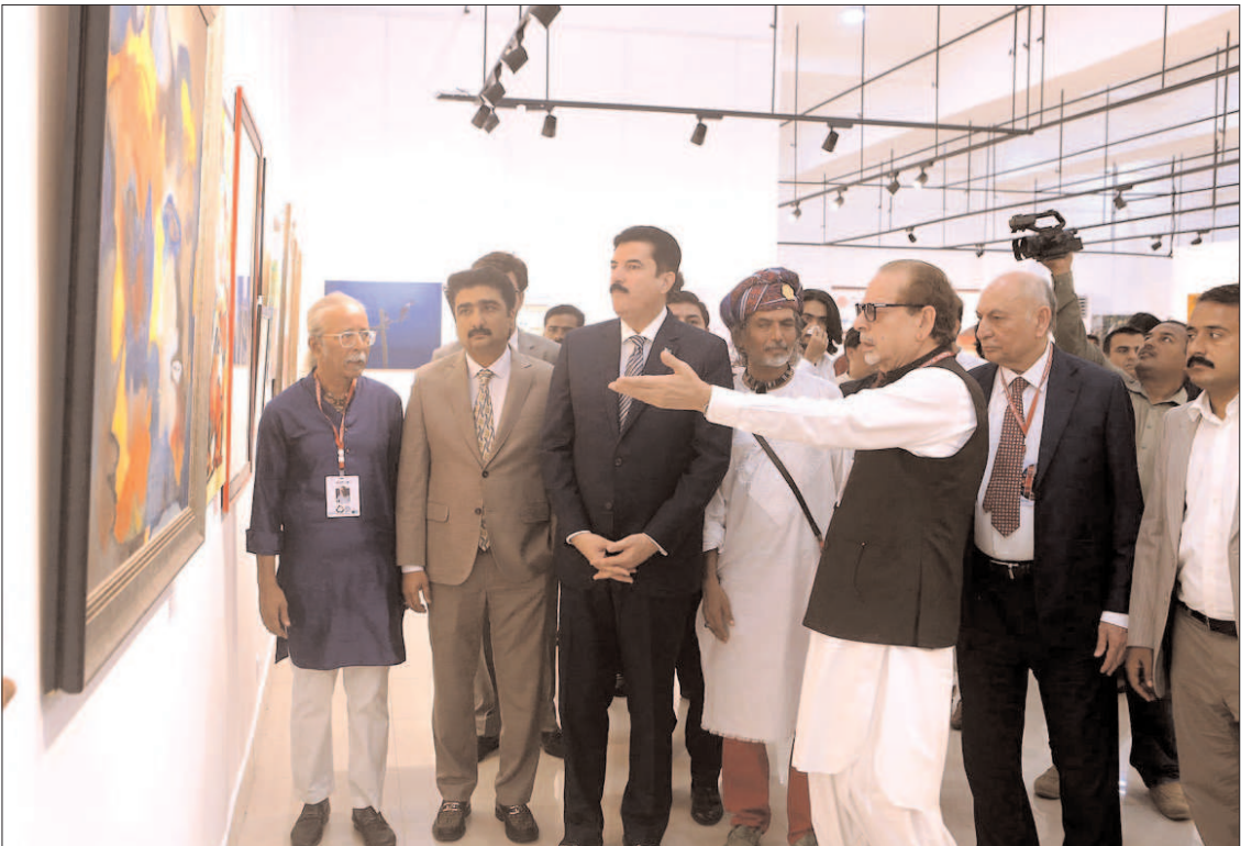
KARACHI: Governor of KP Faisal Karim Kundi, alongside Sindh Minister for Culture and Tourism Zulfikar Shah, views paintings after inaugurating the 'Sindh Artists Exhibition' at the World Culture Festival.