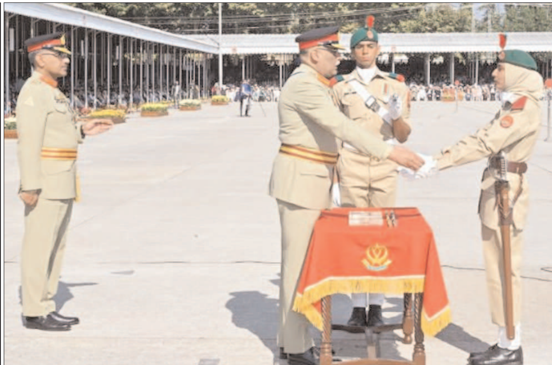
KAKUL: Chairman Joint Chiefs of Staff Committee, General Sahir Shamshad giving away awards to distinguished cadets during passing out parade held at Pakistan Military Academy.