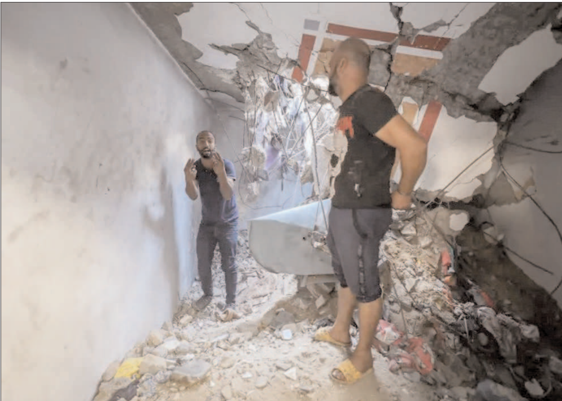
GAZA CITY: A Palestinian man reacting as he searches for casualties stranded under the rubble of a house hit in an Israeli strike.

BUCHAREST (AP): Romania raised fighter jets early on Saturday for the second time this week after an unidentified object breached its airspace by the Black Sea, the Ministry of Defense said. The small object was detected over the Black Sea moving toward Romania, a European Union and NATO member, at around 2:30 a.m. the ministry said in a statement. Romania shares a 650-kilometer (400-mile) border with Ukraine and has previously complained over Russian drones entering its airspace as Moscow attacks Ukrainian targets along the Black Sea and Danube River.