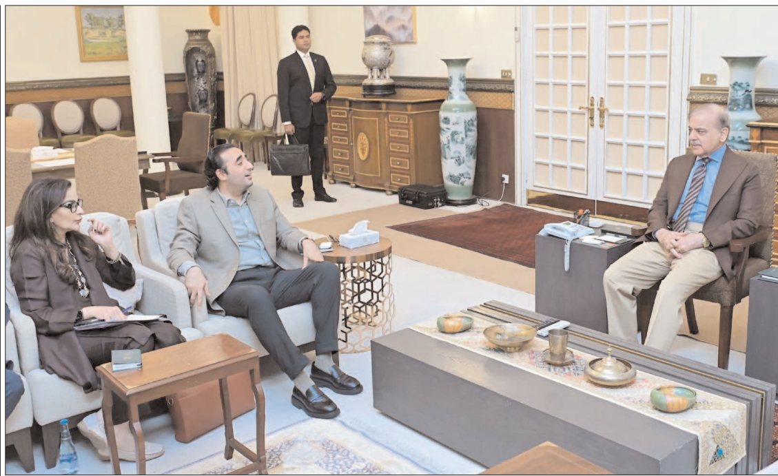
ISLAMABAD: Chairman PPP, Bilawal Bhutto Zardari called on Prime Minister, Shehbaz Sharif.

chief's residence. Mengal's meeting with Maulana Fazl in the present context is being termed very important. Political leaders from PPP and PML-N, in their bid to develop a consensus among political parties on the amendments, have been visiting Maulana Fazl's home for the last few days almost every day in order to enlist his support ahead of the passage of these amendments by both Houses of the parliament.