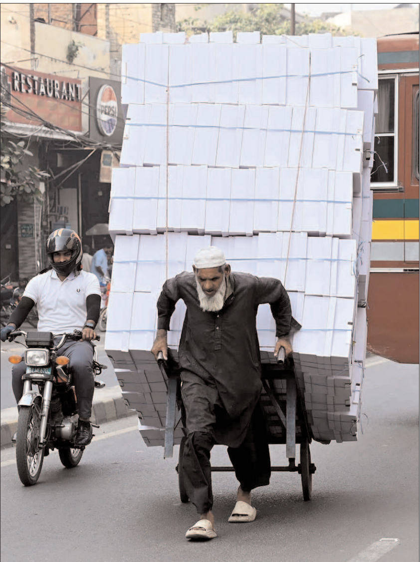
LAHORE: An elderly person is working hard to earn the livelihood of the children in the provincial capital.

The DC also met with dengue workers in the field, receiving updates on the status of dengue prevention in the Wagah zone. He urged them to promptly report any findings of dengue larvae or patients to prevent the spread of the virus.