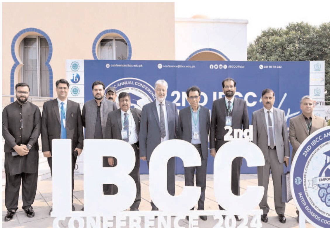
ISLAMABAD: Federal Minister for Federal Education and Professional Training Dr. Khalid Maqbool Siddiqui in a group photo at the "2nd Annual Conference 2024 of Inter Boards Coordination Commission (IBCC) at Zaki Auditorium Allama Iqbal Open University.

The IFC is mandated to respond to queries on all investment related opportunities, regulatory framework and incentives offered in Pakistan.