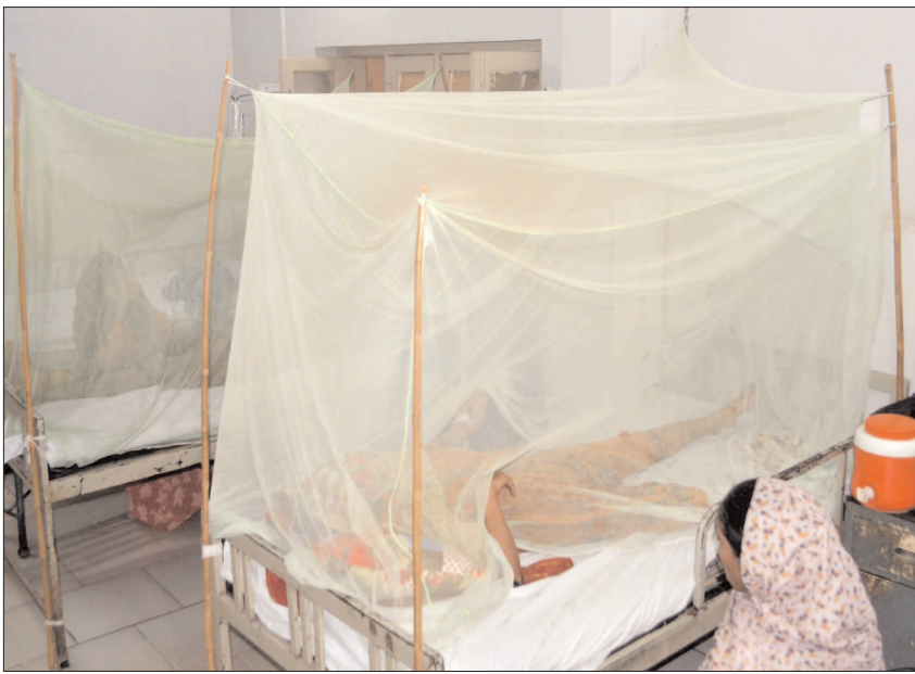
HYDERABAD: Dengue patients being treated at a hospital.