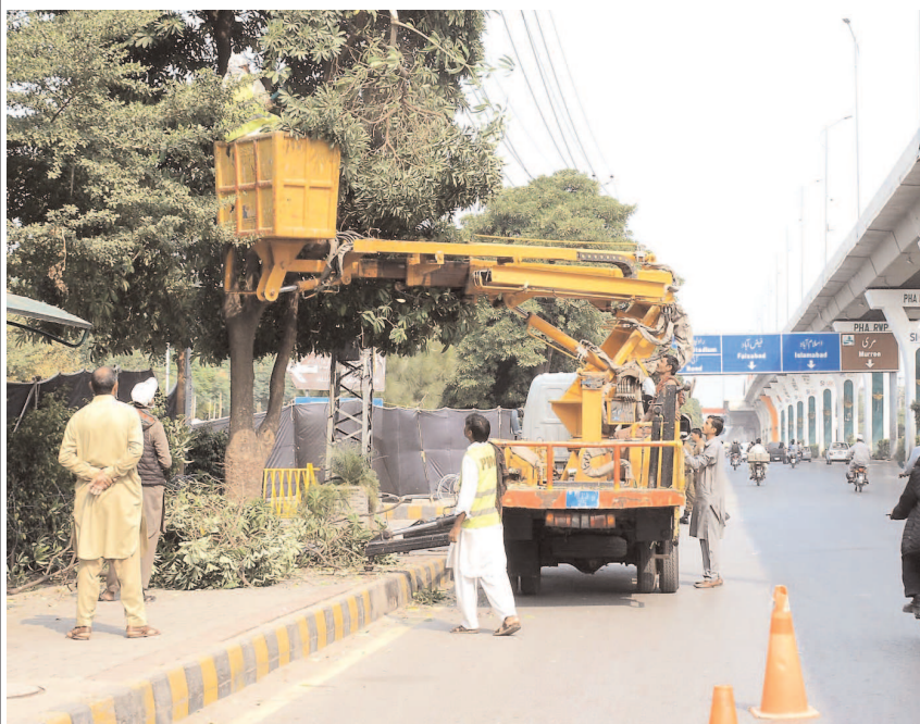
RAWALPINDI: RDA staffer busy in cutting extra tree branches near Rawalpindi cricket stadium.

He emphasized, "When the nation requires solidarity to overcome its challenges, PTI remains focused on advancing its political interests rather than prioritizing the welfare of the public."