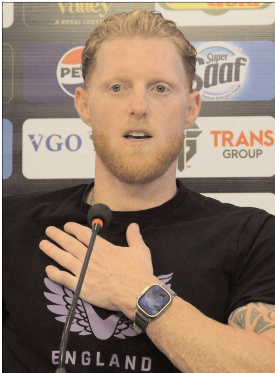
England captain Ben Stokes is holding a press conference.

Meanwhile, England Skipper Ben Stokes shared his thoughts on the Pindi