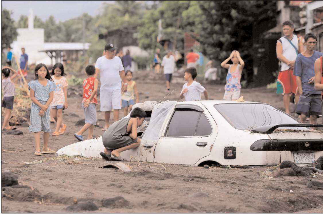
MANILA: Residents looking at a car buried by volcanic ash which cascaded into a village triggered by heavy rains brought about by Tropical Storm Trami in Guinobatan, Albay province in Philippines.