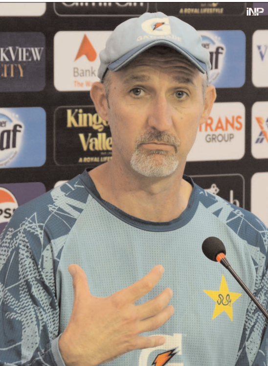
Pakistan Head Coach Jason Gillespie is holding a press conference.

ISLAMABAD (APP): Pakistan men's red-ball Head Coach Jason Gillespie has exuded confidence in his team's preparation ahead of the third and final Test against England at Rawalpindi Cricket Stadium, beginning Thursday.