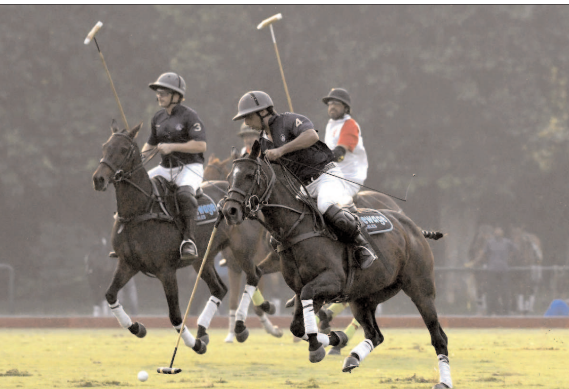
LAHORE: Players fiercely struggle to gain control of the ball during the polo match between Newage Cables and Olympia Polo Team in the Polo in Pink Cup 2024 at Lahore Polo Club.

HONG KONG (Agencies): World number 55 Emma Raducanu says she is making "good progress" in her recovery from a foot injury, despite pulling out of another tournament. The 21-year-old Briton announced on Wednesday that she would not feature at the Hong Kong Open, which is set to start on 28 October. Raducanu has not played since spraining ligaments in her foot during a Korea Open quarter-final against Daria Kasatkina on 21 September. The former US Open champion has now pulled out of five tournaments in a row and has played in only two events since July. "Whilst my foot is making good progress, I need a little more time before I am match fit," .