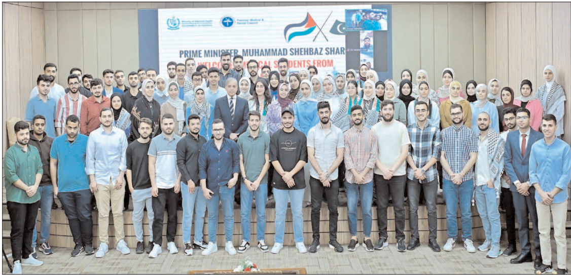
ISLAMABAD: Prime Minister Shehbaz Sharif in a group photo with students of Palestine, who recently arrived in Pakistan to complete their medical education.

WASHINGTON: Finance Minister Muhammad Aurangzeb Wednesday hinted State Bank of Pakistan (SBP) might further slash interest rate in November's Monetary Policy. "SBP has cut its benchmark interest rate for three consecutive meetings by 450 basis points to 17.5 per cent from a record 22 per cent. The next meeting on Nov 4 may see the central bank reduce the policy rate, Muhammad Aurangzeb in an interview. — Agencies