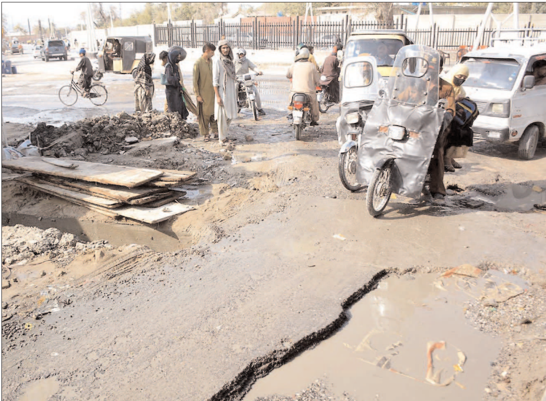
QUETTA: A view of broken Stewart Road, creating problems for people.

HYDERABAD (INP): Sindh province is facing a growing public health crisis, with more than 226,000 dog bite cases reported this year alone, according to official data. The increasing number of stray dogs has contributed to a surge in dog bite incidents, with 12 citizens losing their lives due to rabies and other diseases caused by dog bites. The most cases were recorded between January and September, with 27,333 incidents in January, 27,473 in February, and 29,426 in March. The numbers slightly decreased in the summer months, with 22,558 cases in July, 22,575 in August, and over 24,000 in September. On average, 120 cases of dog bites are reported daily across the province. Health experts advise immediate medical intervention following a dog bite. The wound should be washed thoroughly with soap and clean water for at least 15 minutes to remove dirt and germs. After drying, antiseptic cream should be applied, and the wound bandaged. Prompt consultation with a doctor is crucial, especially in cases involving stray dogs, as rabies vaccinations may be necessary. Sindh government is being urged to take measures to control the stray dog population and improve access to medical treatment and vaccinations to prevent further fatalities.