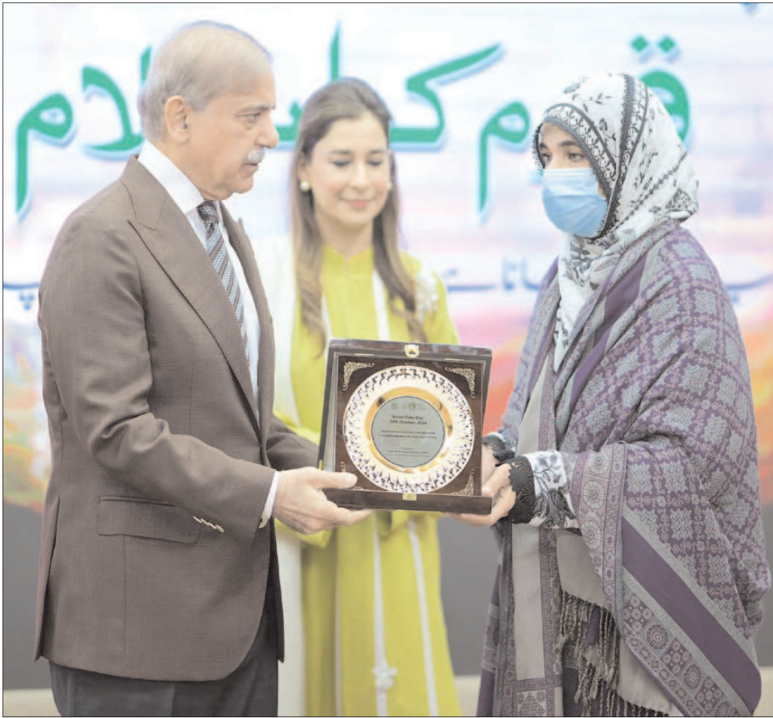
ISLAMABAD: Prime Minister Shehbaz Sharif presenting souvenirs to front line polio workers and relatives of those polio workers who embraced martyrdom in line of duty.

Vol. XXXIXI No. 271 Regd. No. 241 RABI-US-SANNI 21 1446 -- FRIDAY, OCTOBER 25 2024 PESHAWAR EDITION 12 PAGES PRICE. 30