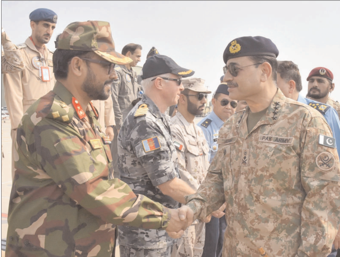
RAWALPINDI: General Syed Asim Munir, Chief of Army Staff interacting with jawans during his visit to operational air base of Pakistan Air Force.