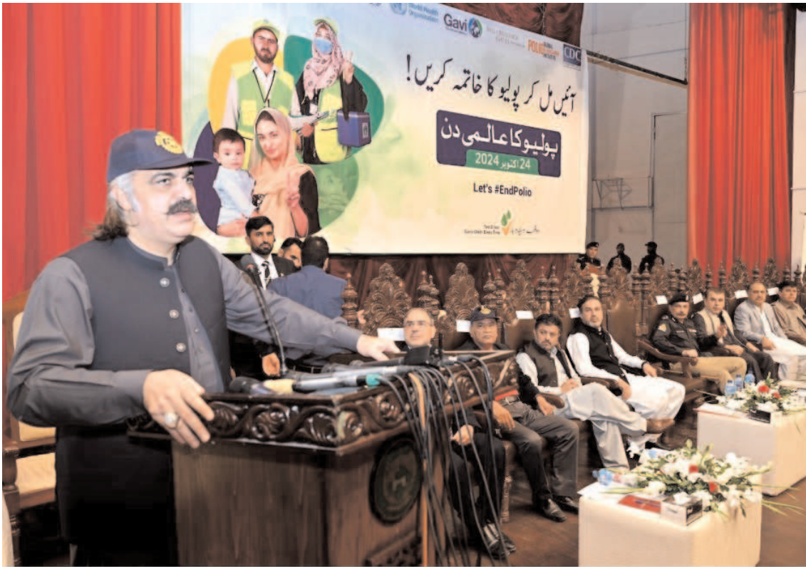
PESHAWAR: Khyber Pakhtunkhwa Chief Minister Sardar Ali Amin Khan Gandapur addressing a function in connection with World Polio Day.