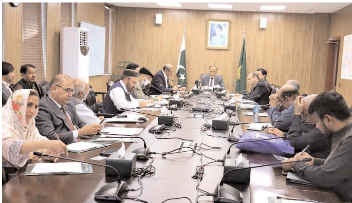
ISLAMABAD: Federal Minister for Planning, Development & Special Initiatives Ahsan Iqbal, chairing a meeting of PM's Committee for Planning and Execution of Foreign-Funded Development Projects.