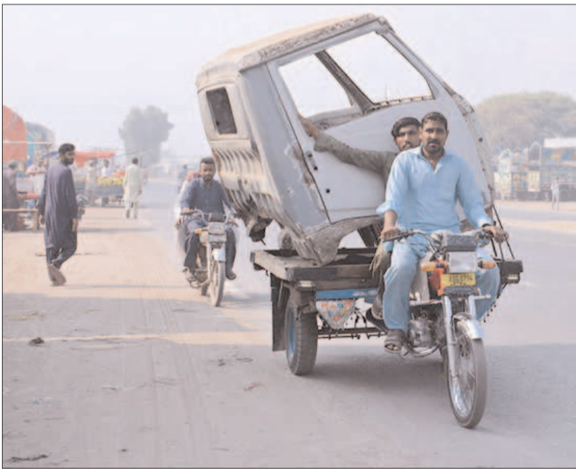
MULTAN: A tricycle rider transports the front body of a mini truck to a workshop, navigating with an unusual load in the city streets.

He emphasized the importance of Solarization of the Tube wells to control and minimize the increased electricity bills of Tube wells and operational costs. He stressed that elected representatives including the community elders of all the Urban Union Councils may be engaged to start a special cleanliness and awareness campaign to ensure the provision of a waste free and clean environment to the residents. He urged that beside than many financial constraints the company is still committed to provide improved sanitation services to the citizens and requested the community to extend their cooperation with the company to strive for a clean and waste free Mardan.