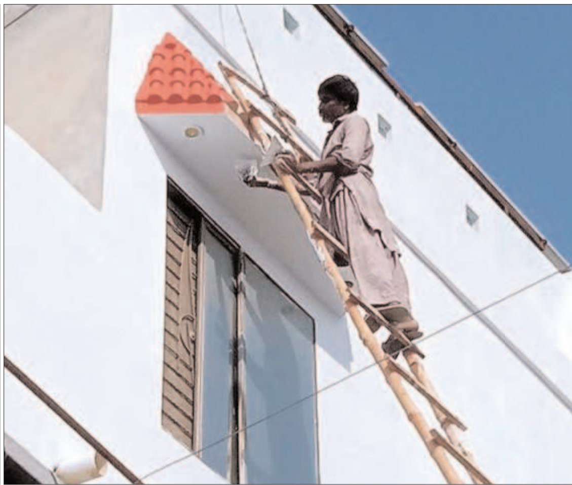
BAHAWALPUR: A worker painting a building along the roadside in the city.

The workshops aimed to enhance understanding and empower women on topics such as leadership, conflict management, peace promotion, workplace harassment, women's empowerment, and civic education. This training initiative is part of a larger project by IDEA Think Tank Punjab, under which two awareness seminars were also held, with over 120 selected students and faculty members from various departments participating.