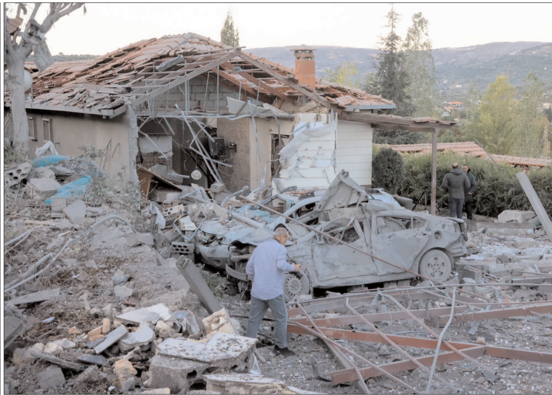
BEIRUT: People inspecting the damage at the site of an Israeli air strike that targeted an area where a number of journalists were located in Hasbaniya, southern Lebanon.