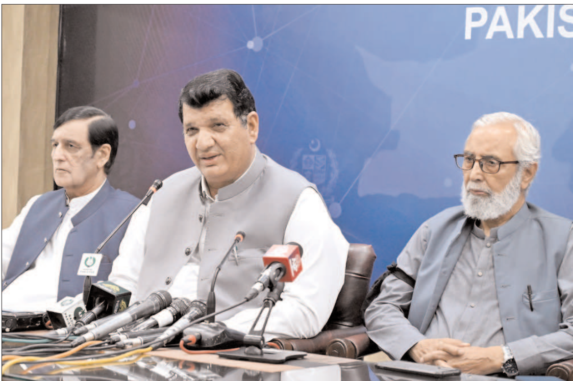
ISLAMABAD: Federal Minister for Kashmir Affairs, Engineer Amir Muqam addressing a Press Conference along with APHC leadership on Kashmir Black Day.