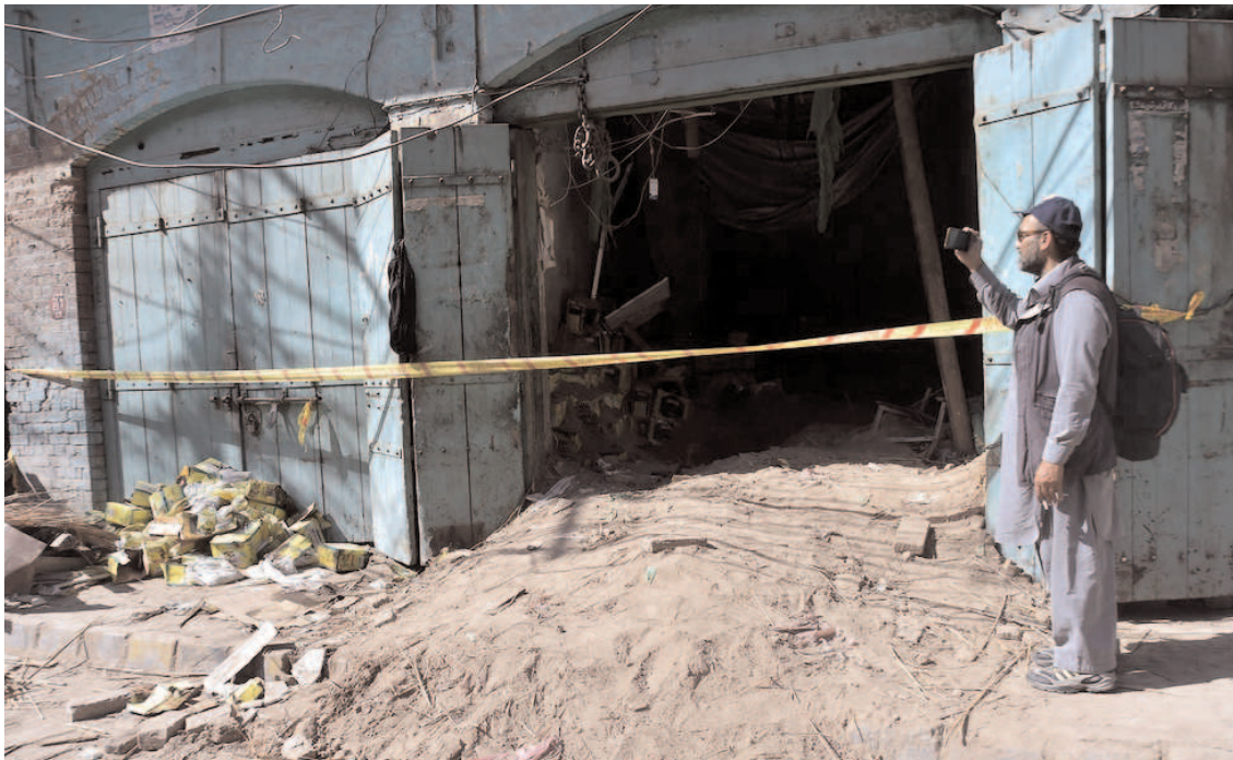
PESHAWAR: A view of collapsed building at Milad Chowk. One person dead while another injured in incident.

of the fire incident at Dain Factory Hayatabad. He contacted the Commissioner of Peshawar to ensure all necessary assistance. The Commissioner briefed the Governor on the details of the ongoing relief efforts. In light of the situation, Governor Kundi issued directives for the Pakistan Air Force to deploy helicopters to aid in firefighting efforts. He emphasized the need for all relevant departments to take emergency measures to address the incident effectively and efficiently.