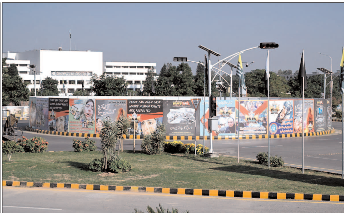
ISLAMABAD: Posters and banners are displayed on the eve of Kashmir Black Day in front of Parliament House in solidarity with the people of Jammu and Kashmir.

The CM said that the Coal Gasification Technology is successfully being used in many developed countries like South Africa, USA, China and others. He added that Pakistan has huge coal reserves (184 B.ton) that can be utilised by the application of appropriate technologies starting with the production of SNG.