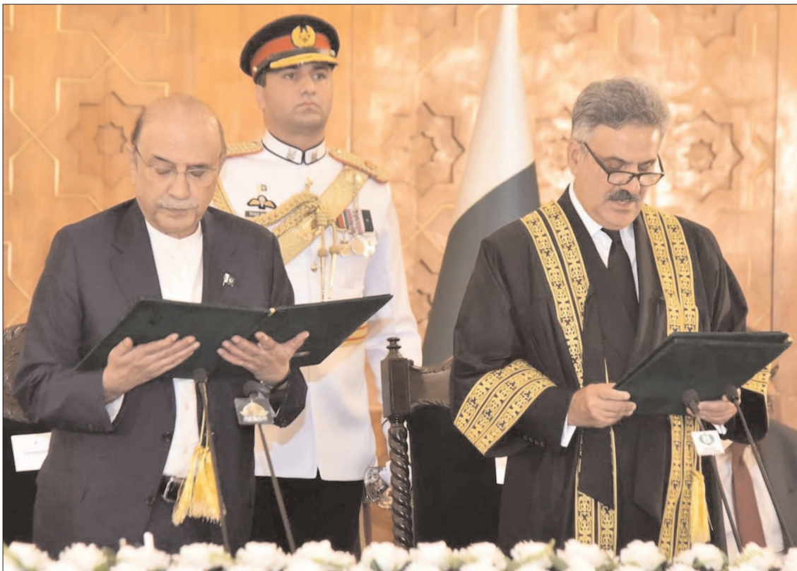
ISLAMABAD: President Asif Ali Zardari administering oath of office to Justice Yahya Afridi as Chief Justice of Pakistan a ceremony held at Aiwan-e-Sadr.

Saudi Arabia, which has mended fences with Iran after years of regional rivalry, and had been edging towards better ties with Israel before the war in Gaza, condemned the attack as a violation of Iranian sovereignty and international law. Efforts to secure a ceasefire and hostage-release deal in Gaza, which could help cool the wider conflict, are expected to resume in Doha when negotiators fly there on Sunday.