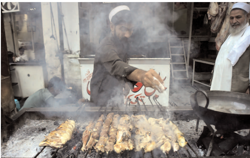
PESHAWAR: A man busy in making barbeque for customers.

pation of Kashmir valley by India negated multiple articles of the 30 fundamental human rights of the Universal Declaration of Human Rights (UDHR) drafted by representatives from all the regions of the world including India on December 10, 1948 and subsequently was adopted by the United Nations General Assembly. "This declaration was applied to all the signatory members of the UN including India and restrained them from all kinds of abuses, exploitation, maltreatment and violence besides violation of any fundamental rights protected in UDHR." He urged international community to look beyond trade and business interests and step forward with collective action to stop genocide of oppressed Kashmiris besides pressurize Modi government to reverse all its illegal actions of August 5, 2019 and give right of self-determination to them for lasting peace and stability in South Asia.