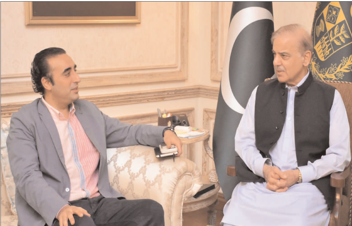
LAHORE: Chairman Pakistan People's Party Bilawal Bhutto Zardari called on Prime Minister Muhammad Shehbaz Sharif.

In a message on the occasion of Kashmir Black Day, the minister said that Pakistan would continue to provide moral and diplomatic support to the Kashmiri people in this difficult time.