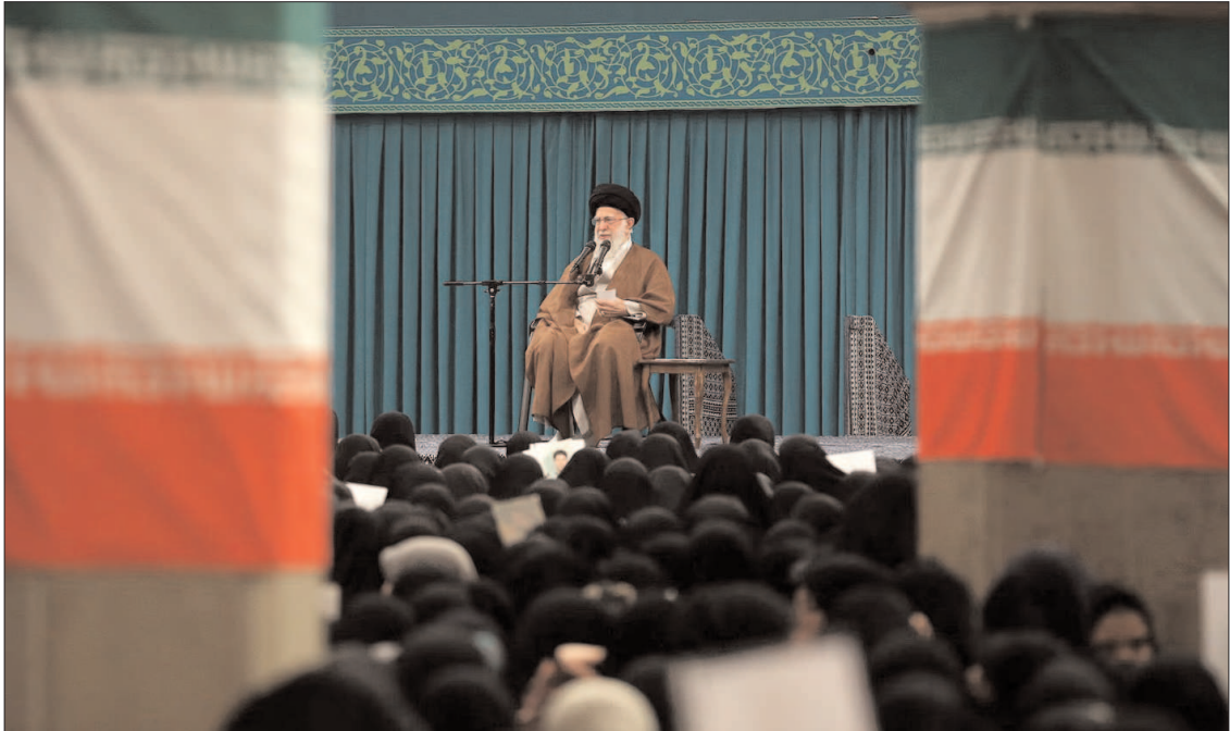
TEHRAN: Iran's Supreme Leader Ayatollah Ali Khamenei speaks during a meeting in Tehran.

Last Saturday, the Chief Election Commissioner participated in an important briefing hosted by the Uzbekistan Election Commission, which featured Election Commission Chairpersons from various countries.