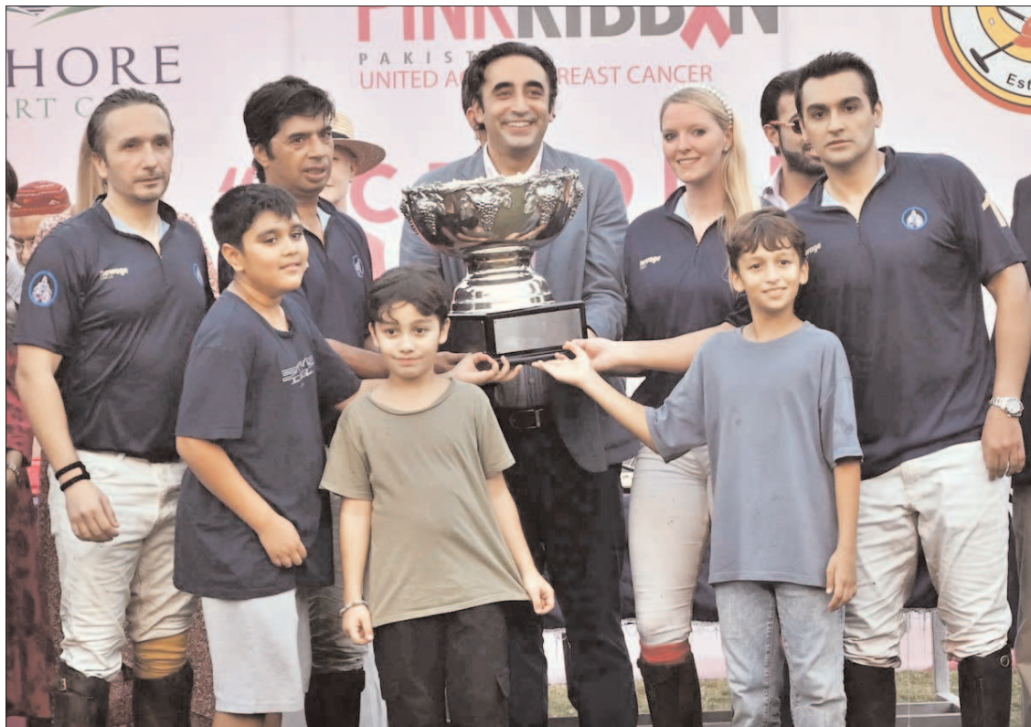
LAHORE: Chairman PPP Bilal Bhutto Zardari presenting the trophy to the successful team of polo match at Polo Ground.