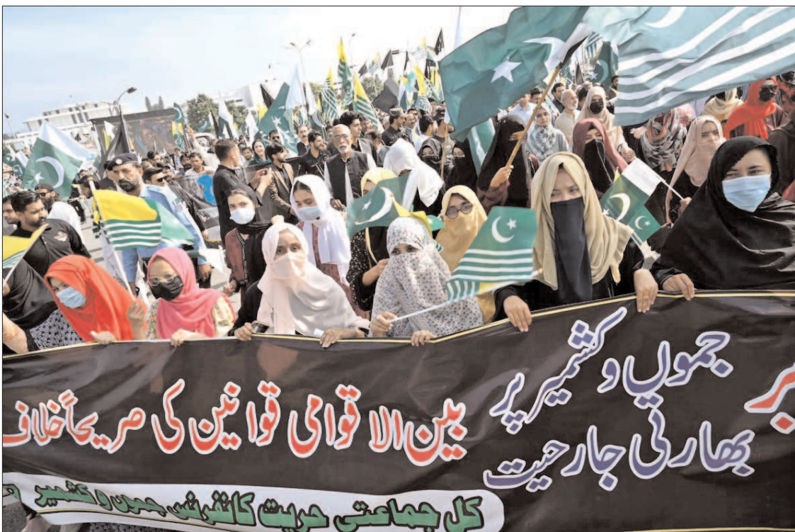
ISLAMABAD: A large number of people participating in a rally on the occasion of Kashmir Black Day to express solidarity with the people of Indian Illegally Occupied Jammu and Kashmir.