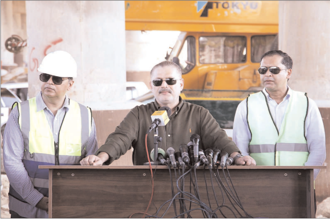
KARACHI: Sindh Senior Minister and Provincial Minister for Information, Transport, Mass Transit, Excise, and Taxation, Sharjeel Inam Memon, speaking to the media after inspecting the development work of the Yellow Line BRT.

Earlier, the provincial minister expressed gratitude to the media friends for visiting the project site.