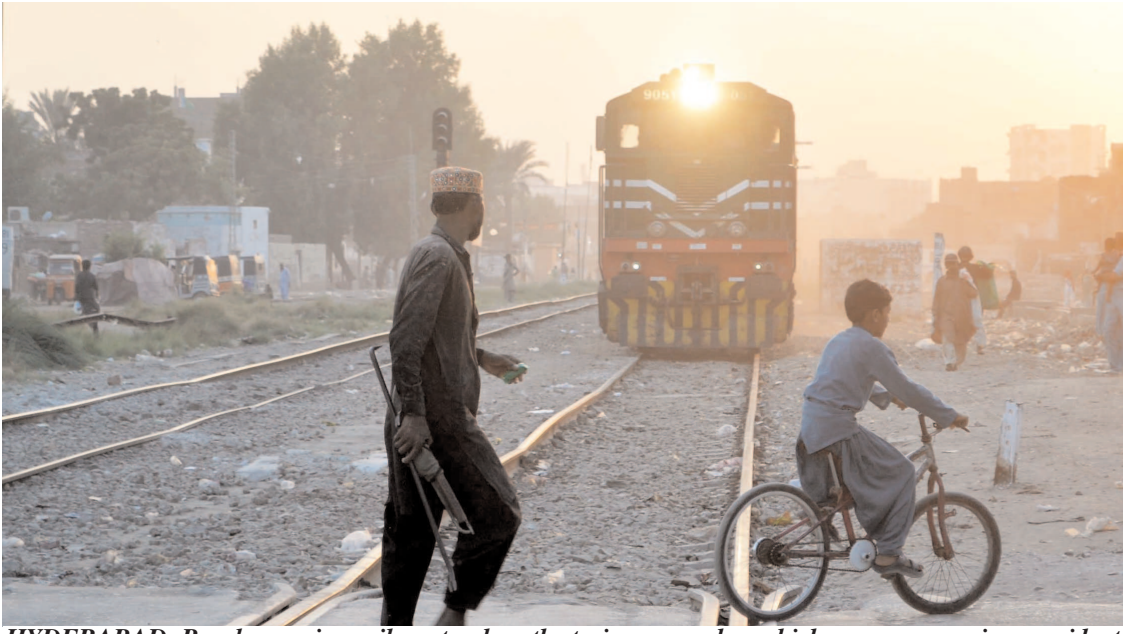
HYDERABAD: People crossing railway track as the train approaches which may cause serious accident.

release. The participants of the rally strongly condemned the cruelty and violence against the Kashmiri people and reiterate their determination to continue supporting their right to self-determination.