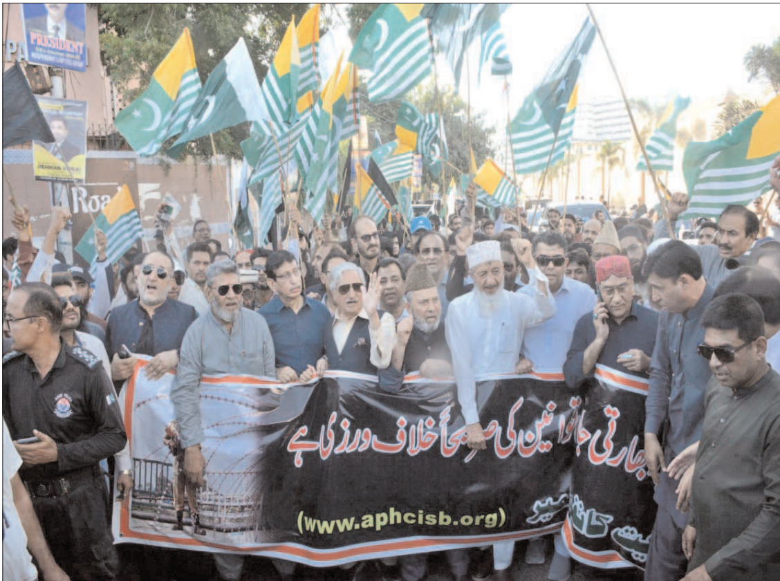
KARACHI: Participants of the All Parties Hurriyat Conference participate in rally and chant slogans against Indian atrocities in IIOJK on Kashmir Black Day.