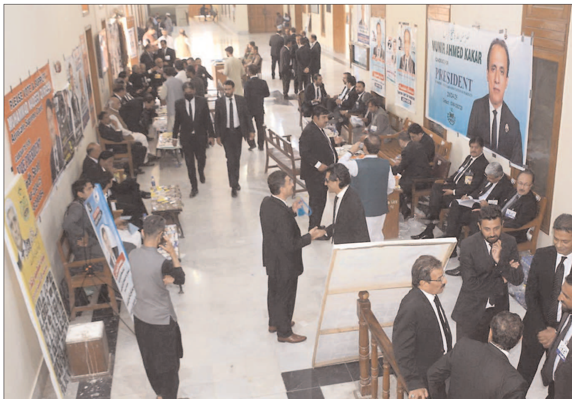
QUETTA: A view of rush during Supreme Court Bar Association election at Balochistan High Court.