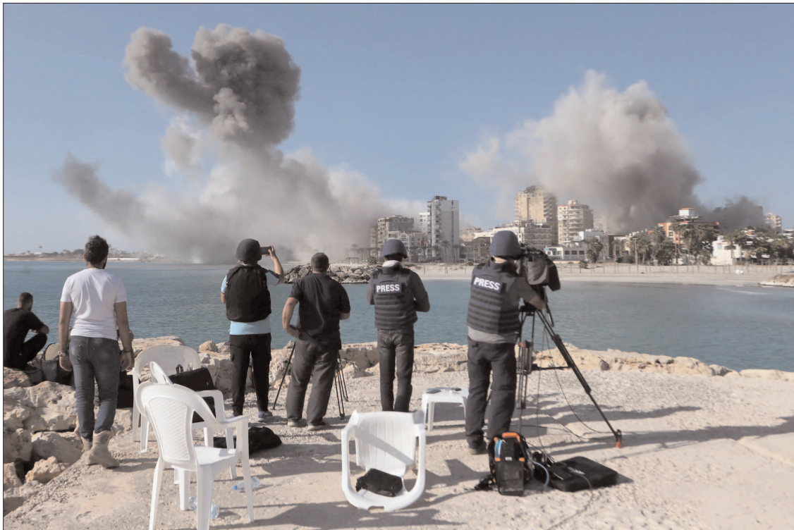
BEIRUT: Journalists filming as smoke rises from buildings hit in Israeli air strikes in Tyre, southern Lebanon.