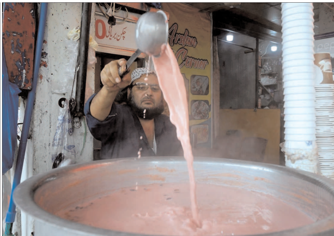
ISLAMABAD: A shopkeeper prepares traditional Kashmiri tea, a beloved winter season treat, to attract passerby at Abpara Market in federal capital.