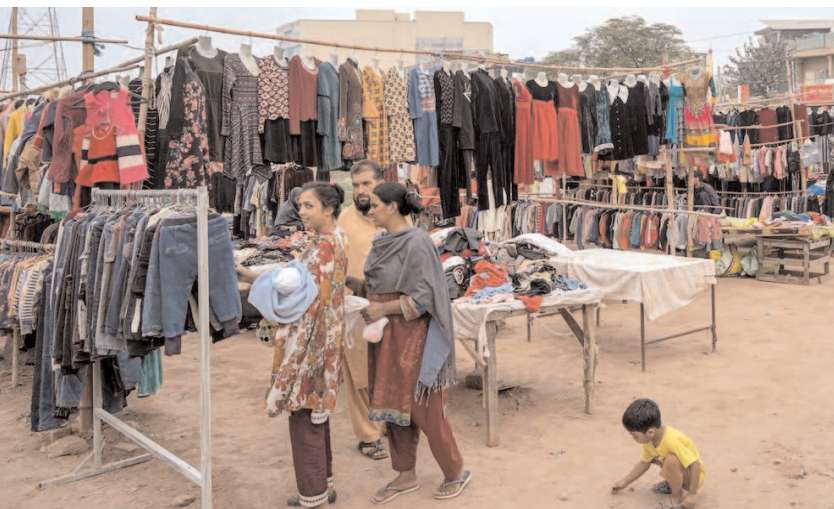
ISLAMABAD: People selecting and purchasing second-hand warm clothes at Kuri Road neighbourhood as winter season approaching.

Investors are awaiting the Bank of Japan's rate decision later this week, with the central bank expected to stand pat following two hikes earlier this year.