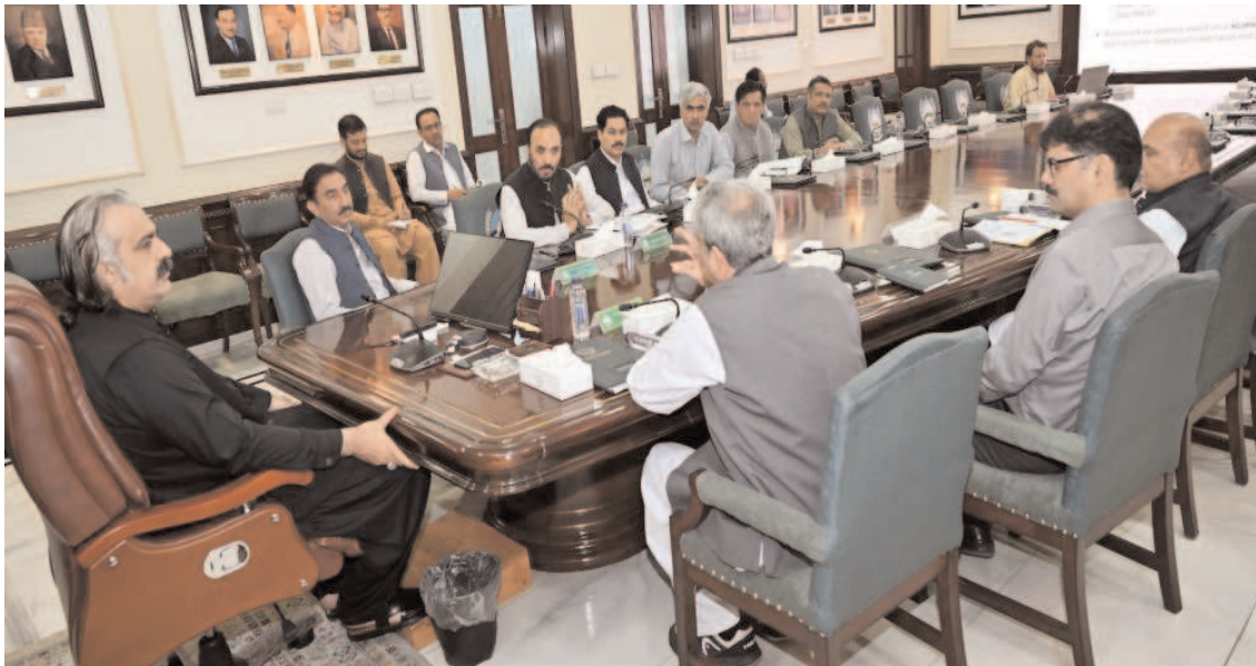
PESHAWAR: Khyber Pakhtunkhwa Chief Minister Sardar Ali Amin Gandapur chairing a meeting regarding tourism in province.