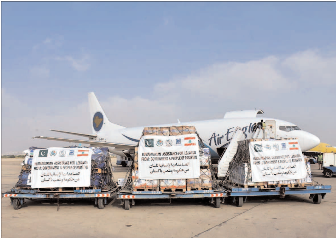
KARACHI: On instructions of Prime Minister, Pak NDMA Dispatched 17th Consignment of 17 tons of relief items for affected people of Lebanon through chartered flight from Jinnah International Airport.