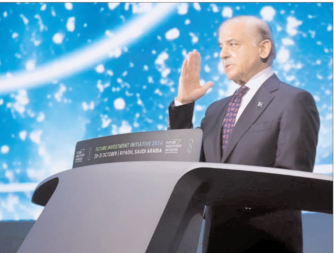
RIYADH: Prime Minister Shehbaz Sharif delivering keynote speech at the 8th meeting of Future Investment Initiative in Saudi Arabia.

F.P. Report ISLAMABAD: Pakistan Tehreek-e-Insaf (PTI) Chairman Barrister Gohar on Tuesday dismissed any divisions within the party by saying "there is no forward bloc in the party." He said there were no differences among the ranks of the PTI rather it was "difference of opinion". Speaking to media outside the Anti-Terrorism Court (ATC) Islamabad, the PTI chief said the PTI was a democratic party, claiming that leadership and workers of the party were treated equally. "We are receptive to concerns of everyone from leadership to a worker of the party. We don't endorse stifling the voices of the people," he reiterated. Responding to a question regarding former federal minister Fawad Chaudhry's remarks about the current party leadership, Gohar