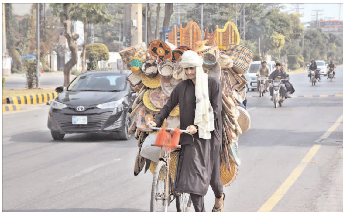
ISLAMABAD: A street vendor wanders the roads, selling handicraft items from his bicycle to earn livelihood in the federal capital.

The public relations officer emphasized that children are a valuable asset to society and urged parents to exercise greater care in ensuring their safety. The parents appreciated the police team's efforts, especially the SHO, and thanked the Islamabad Capital Police for their immediate assistance. Citizens are urged to dial the emergency helpline "Pucar-15" or report via the "ICT-15 app."