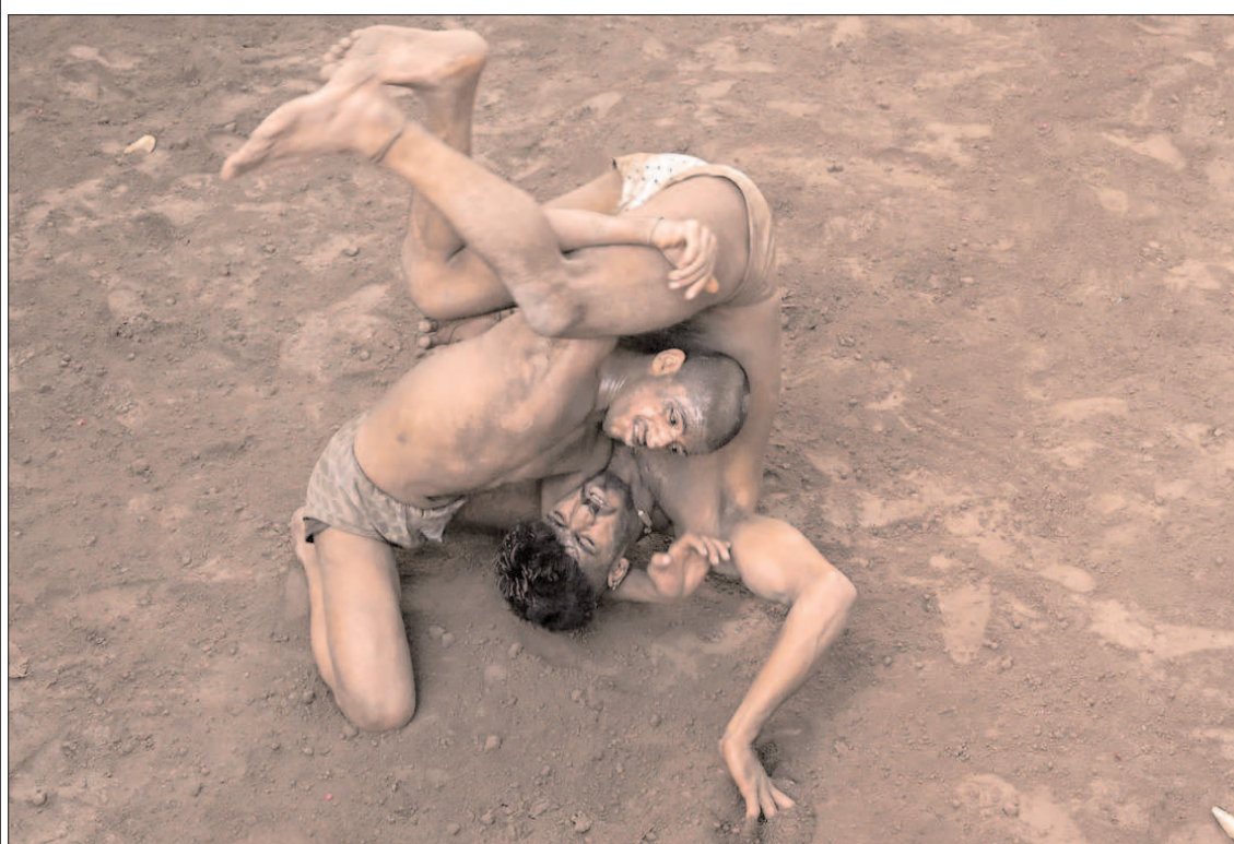
LAHORE: Traditional wrestlers (Pehalwans) are busy in practicing during a training session at an Akhara (wrestling pit). 'Kushti', the traditional wrestling is one of the most popular games in Pakistan.

Vinicius scored 24 goals and made 11 assists in 39 matches across all competitions for Madrid as he led the club to three titles last season.