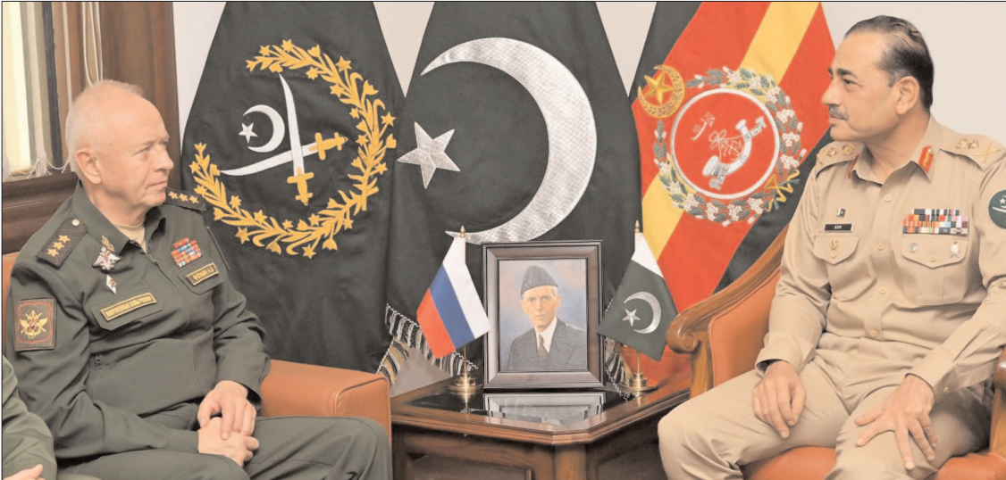
RAWALPINDI: Colonel General Alexander V. Fomin, Deputy Minister of Defence of Russian Federation, called on General Syed Asim Munir, Chief of Army Staff at the General Headquarters.

Khyber Pakhtunkhwa Assembly also passed a resolution demanding implementation of the Murree Accord for resolution of dispute between two warring tribes of Kurrum district. The resolution moved by member Provincial Assembly Muhammad Riaz was unanimously passed by the Assembly. The house through the resolution has urged the Khyber Pakhtunkhwa Government to take concrete measures for implementation of the Murree Agreement for maintaining peace between the warring tribes.