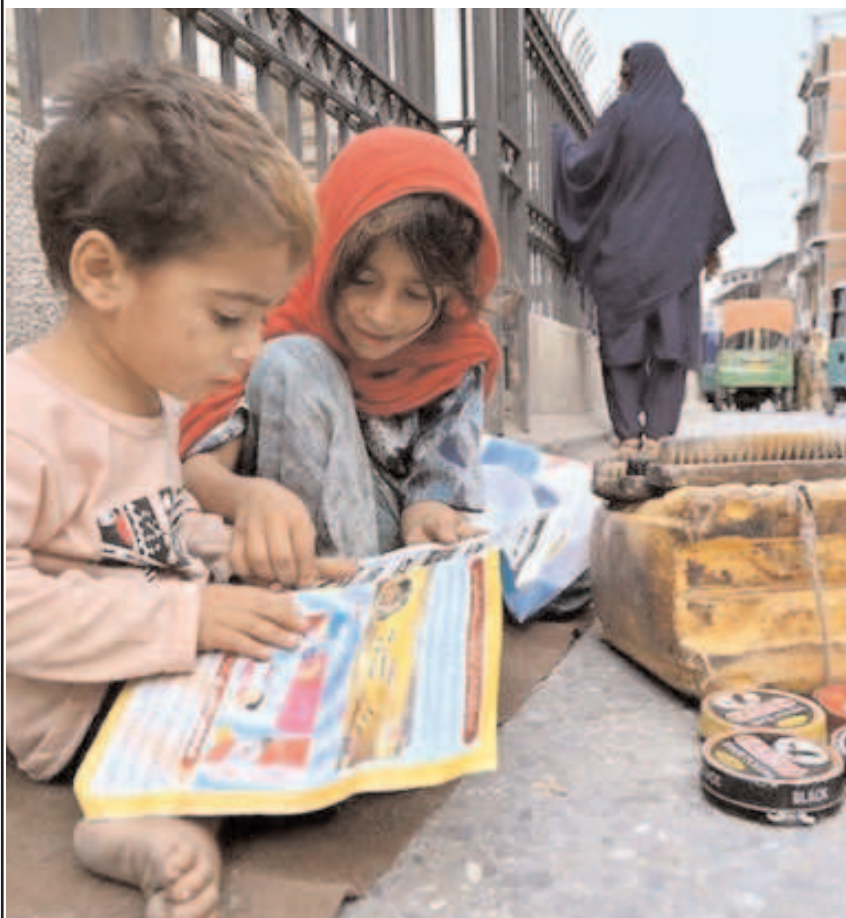
PESHAWAR: A young shoe polish girl balances study and work, teaching her brother while earning at Chowk Yadgar.