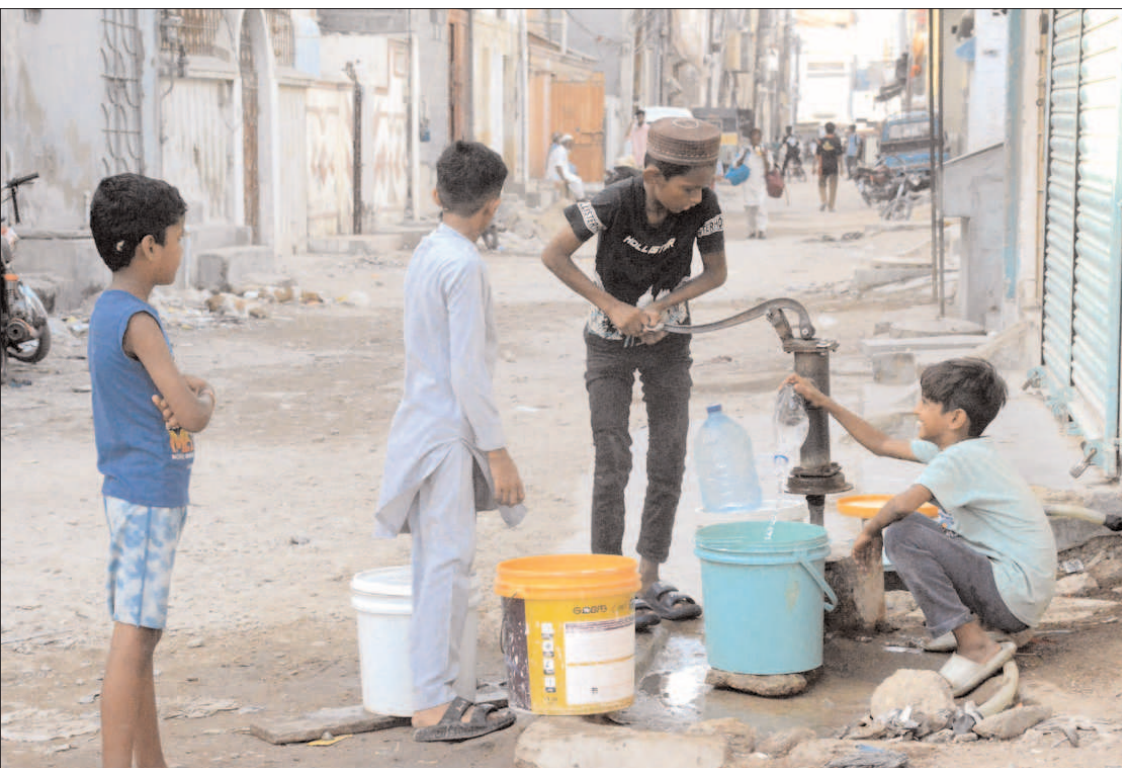
KARACHI: A boy pumps water with a hand pump to fill his pots for domestic use as the city faces a water shortage.