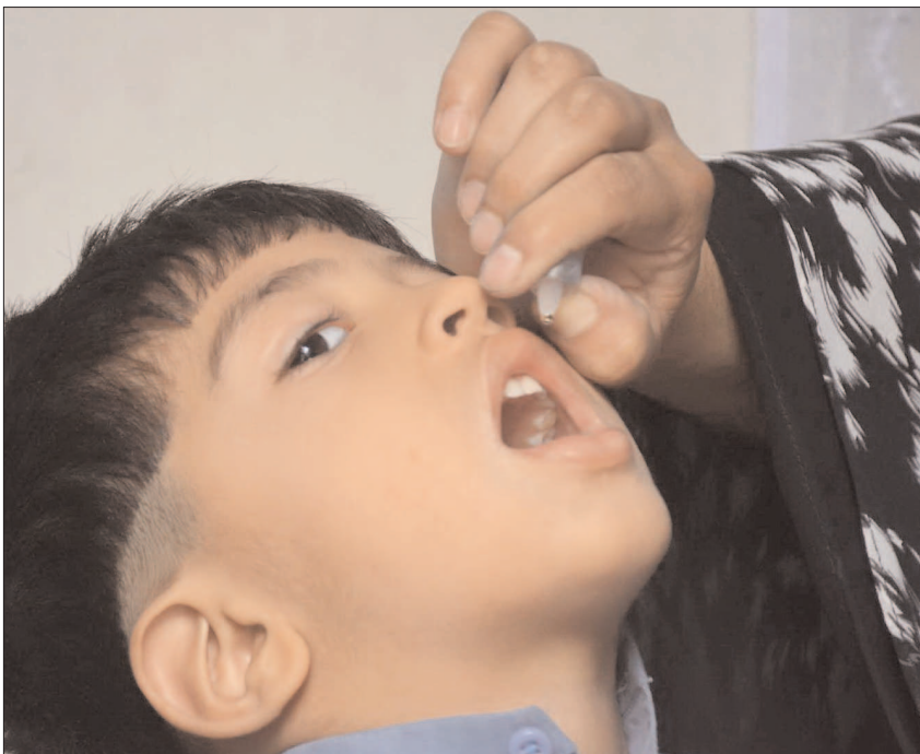
QUETTA: A polio worker administering drops to a child during anti-polio vaccination campaign.

TIP hopeful for accessibility of legal knowledge at the community level will bridge the gap between citizens and government, ensuring that public concerns are heard and addressed promptly. This initiative is a step towards fostering a transparent and accountable system where public grievances are not only heard but also acted upon, facilitators claimed while concluding the camp.