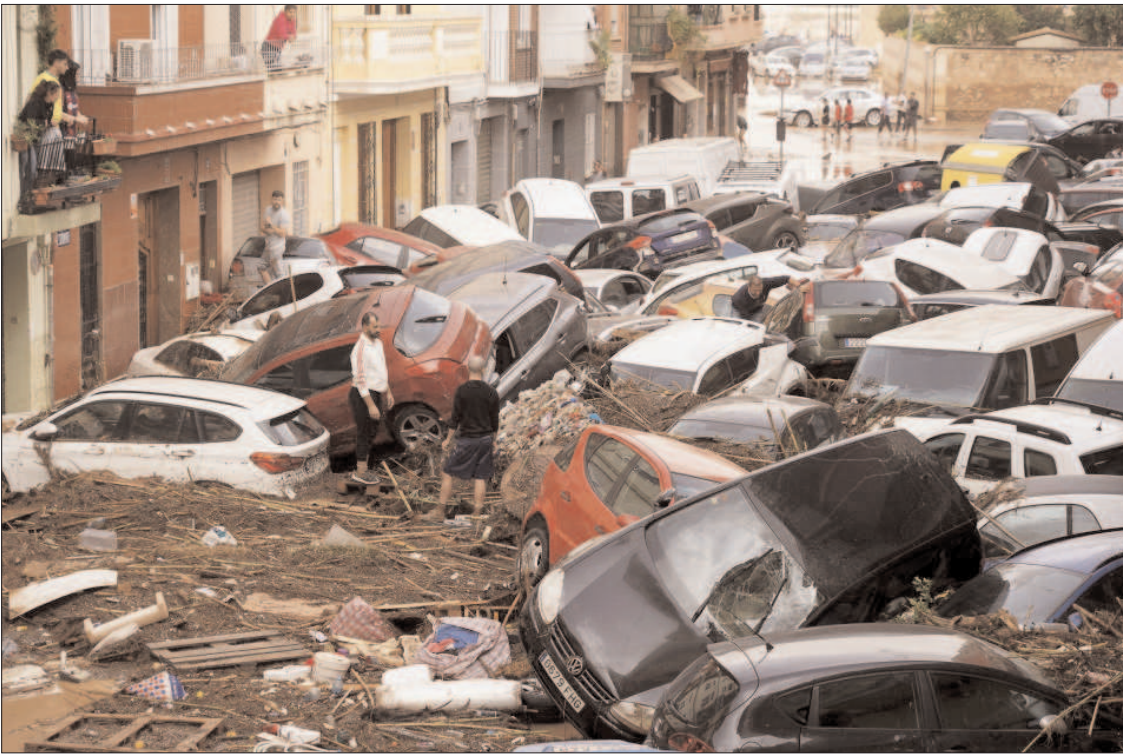
VALENCIA: Residents look at cars piled up after being swept away by floods in Valencia, Spain.

The storms also unleashed a rare tornado and a freak hailstorm that punched holes in car windows and greenhouses. Transport was also affected. A high-speed train with nearly 300 people on board derailed near Malaga, although rail authorities said no one was hurt. High-speed train service between Valencia city and Madrid was interrupted, and the transport ministry said it could take up to four days to restore highspeed service to the capital due to the damage done to the line. Bus and commuter rail lines were likewise interrupted. Many flights were cancelled Tuesday night, stranding some 1,500 people overnight at Valencia's airport. Flights resumed Wednesday.