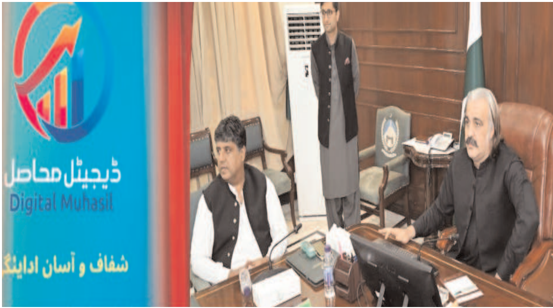
PESHAWAR: Khyber Pakhtunkhwa Chief Minister Ali Amin Khan Gandapur formally launching the e-fines portal under ‘Digital Mahasil’ initiative.

He urged upon the provincial government departments to fulfill their responsibilities diligently to achieve this purpose.