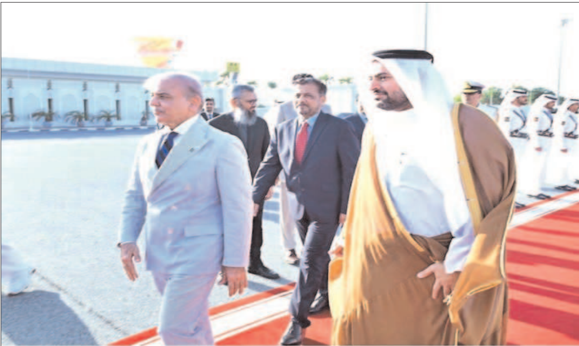
DOHA: Prime Minister Muhammad Shehbaz Sharif arrives at Doha International Airport for his official visit of Qatar. He is being received by Qatar's Minister of State, Muhammad bin Abdulaziz Al-Khulaifi.

RIYADH (APP): Prime Minister Shehbaz Sharif strongly condemned Israel's actions aimed at obstructing the operations of the United Nations Relief and Works Agency for Palestine Refugees. The prime minister, wrote on his X timeline that by preventing critical relief assistance from reaching millions of helpless Palestinians, Israel was committing yet another blatant violation of international humanitarian law.