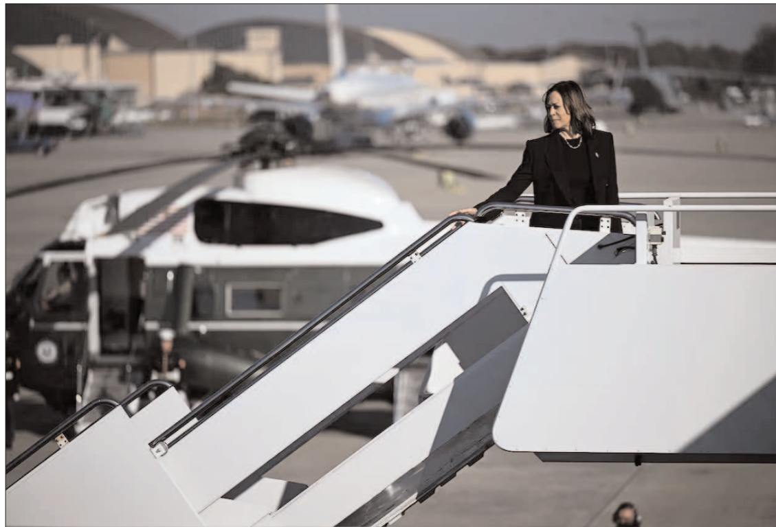
WASHINGTON: U.S. Vice President and Democratic presidential nominee Kamala Harris boards Air Force Two at Joint Base Andrews in Maryland, U.S.

Additionally, he said that local leaders' input will be included in development projects. He expressed his commitment to see underdeveloped districts like North Waziristan thrive and assured that all necessary measures will be taken to achieve this goal.