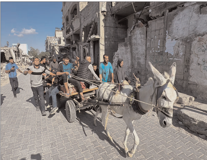
GAZA STRIP: Palestinian transport casualties following an Israeli strike, amid the Israel-Hamas conflict, in Beit Lahiya in the northern Gaza Strip.

He stated that the Government of Sindh has collected 125 billion in taxes, but some individuals have sought court orders to block its use. The Sindh government won the case, yet these individuals appealed to the Supreme Court, resulting in 120 billion rupees still being held there. He emphasized that it is everyone's responsibility to raise their voice on this issue, as the roads are being used and the infrastructure is deteriorating.