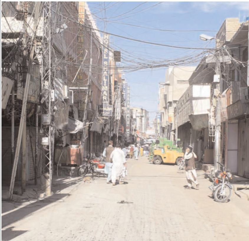
QUETTA: View of closed shops during shutter down strike called by Balochistan National Party.

All heads of schools are responsible to ensure cleanliness, tree plantation and to implement on Anti-Dengue SOPs in their respective schools and be deliver lectures about Anti-dengue SOPs on daily basis, she added.