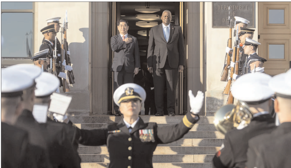
WASHINGTON: Defense Secretary Lloyd Austin, center right welcomes South Korean Defense Minister Kim Yong Hyun, Center left, to the Pentagon on Wednesday.

Tehran has repeatedly denied the accusations.