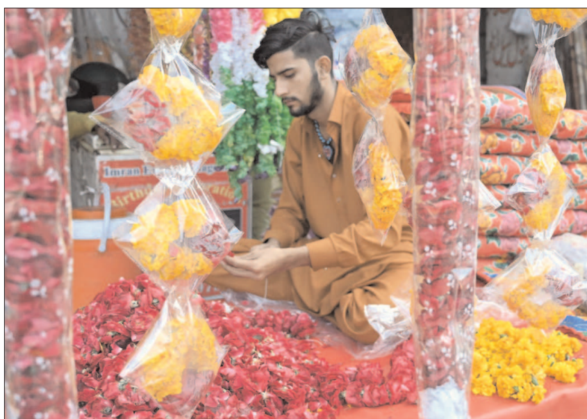
RAWALPINDI: A vendor arranging and displaying flower garlands to attract the customers at Banni Chowk.

This year on 17 January, the NDMA assumed the chair of INSARAG, reinforcing its leadership role in regional disaster management efforts. INSARAG is a global network dedicated to enhancing international disaster response, strengthening preparedness through Urban Search and Rescue (USAR) practices. INSARAG sets global standards to ensure teams are fully equipped for action during disasters.