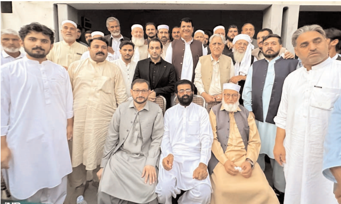
BUNER: Federal Minister for States and Frontier Regions and President of PML-N KP Engr. Amir Muqam in a group photo with party leaders after announcement of abolishment of Nazriyati Group.