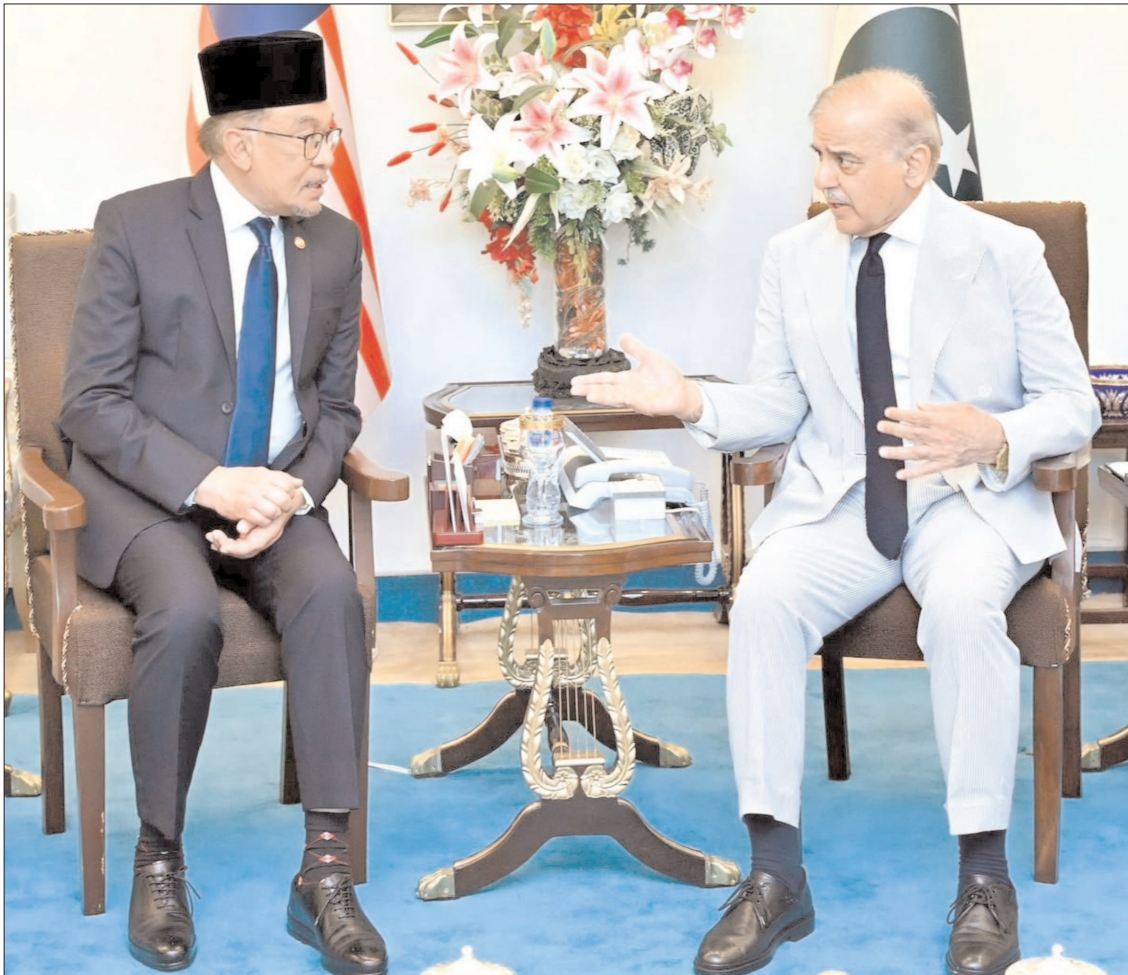
ISLAMABAD: Prime Minister Shehbaz Sharif exchanging views with Prime Minister of Malaysia YAB Dato' Seri Anwar Ibrahim.