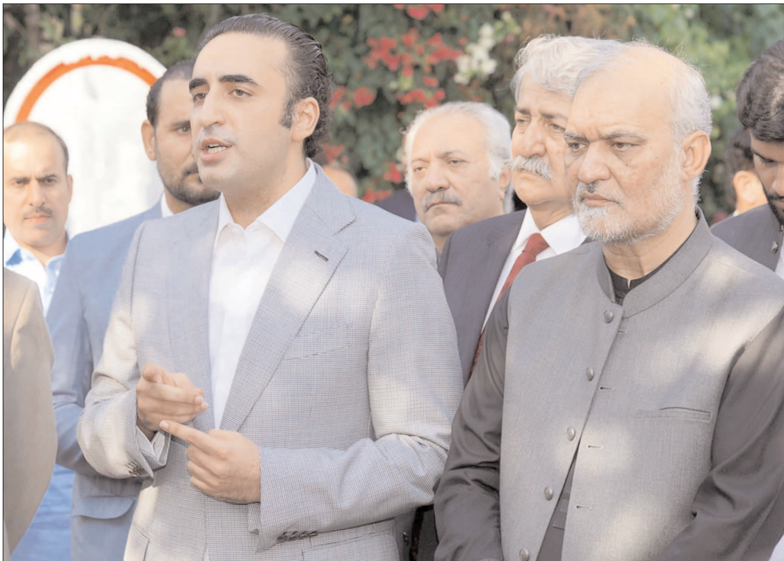
ISLAMABAD: Chairman Pakistan People's Party Bilawal Bhutto Zardari talking to media persons along with Chief of Jamaat-e-Islami Hafiz Naeem Ur Rehman after a meeting at Zardari House.