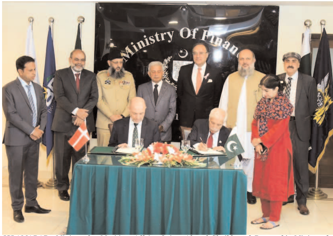
ISLAMABAD: Minister for Maritime Affairs Qaiser Ahmed Shaikh and Denmark's Minister for Industry, Business and Financial Affairs Morten Bodskov signing MoU.