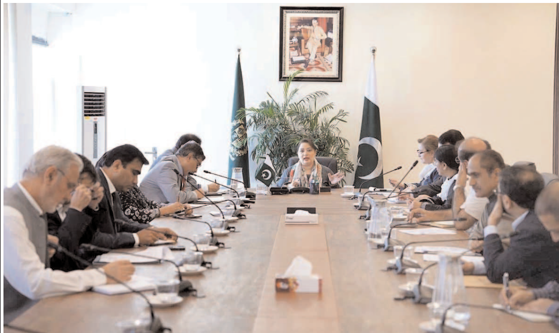
ISLAMABAD: Coordinator to Prime Minister on Climate Change Romina Khurshid Alam chairing a meeting on green Islamabad programme.

The administration's goal was to ensure that people from all walks of life have access to accurate information about the disease and preventive measures, helping to reduce the number of cases in the region.