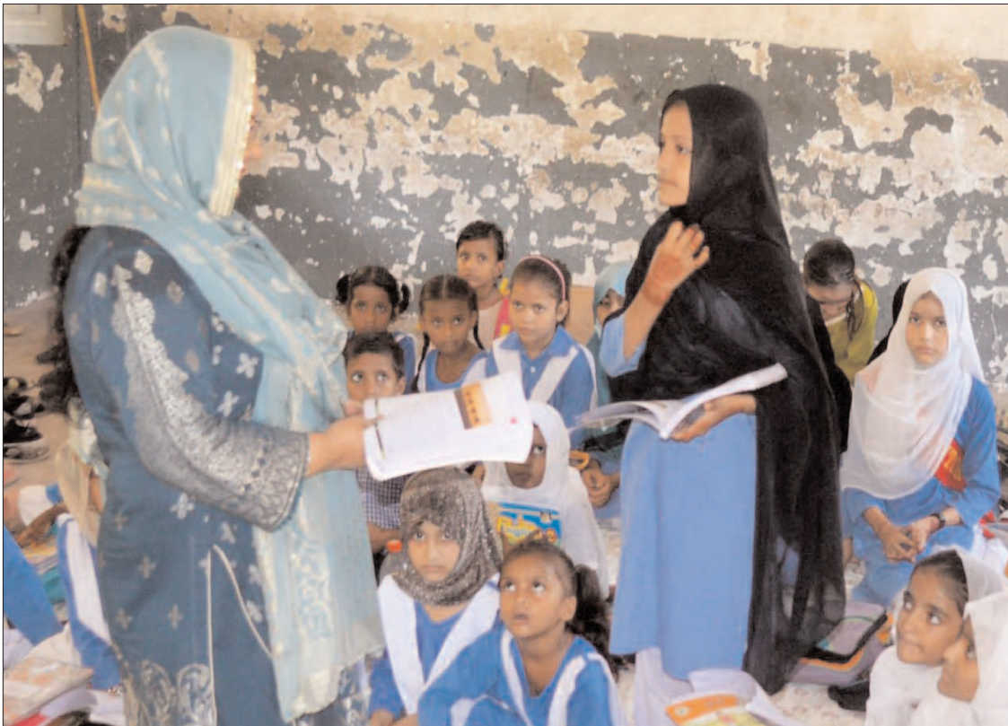
HYDERABAD: A teacher imparting knowledge to students on World Teachers' Day at a government school.