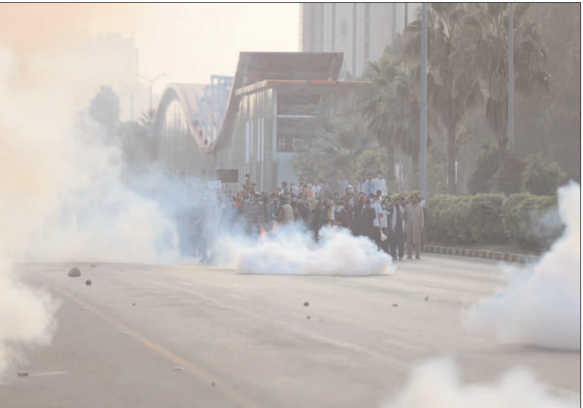
ISLAMABAD: Supporters of Pakistan Tehreek-e-Insaf, gathered for an anti-government rally amid tear gas smoke fired by police to disperse them.