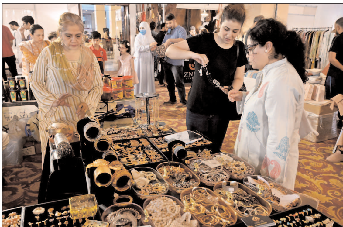
ISLAMABAD: People visiting stalls during the "Daachi Arts & Craft Exhibition" at Pak China Friendship Centre.

"It is because of the edifice that was laid at our wonderful alma mater that many of us could shine in life. Our gratitude, love and respect for our IMS teachers are bound to last forever till we land on the other side of the rainbow. May the Almighty Allah continue to shower His immense blessings and mercy on them all".