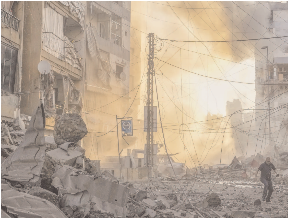
BEIRUT: A man runs for cover as smoke raises in the background following an Israeli attack in Dahiyeh, Lebanon.