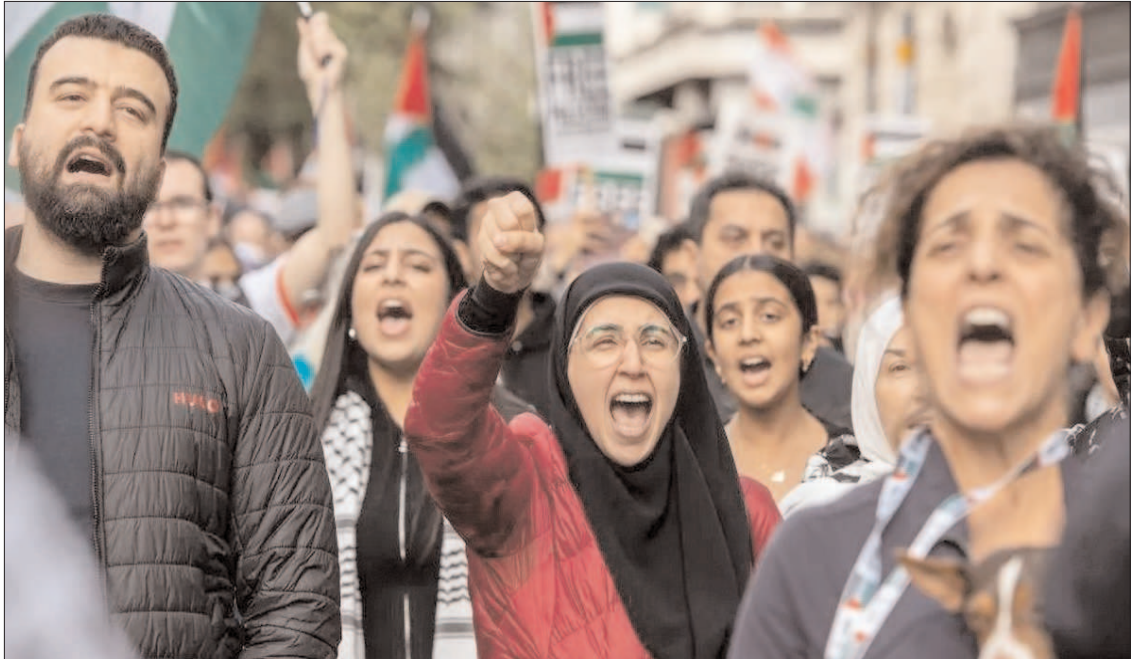
LONDON: Pro-Palestinian protesters shouting slogans during a protest against Israeli attacks on Gaza.