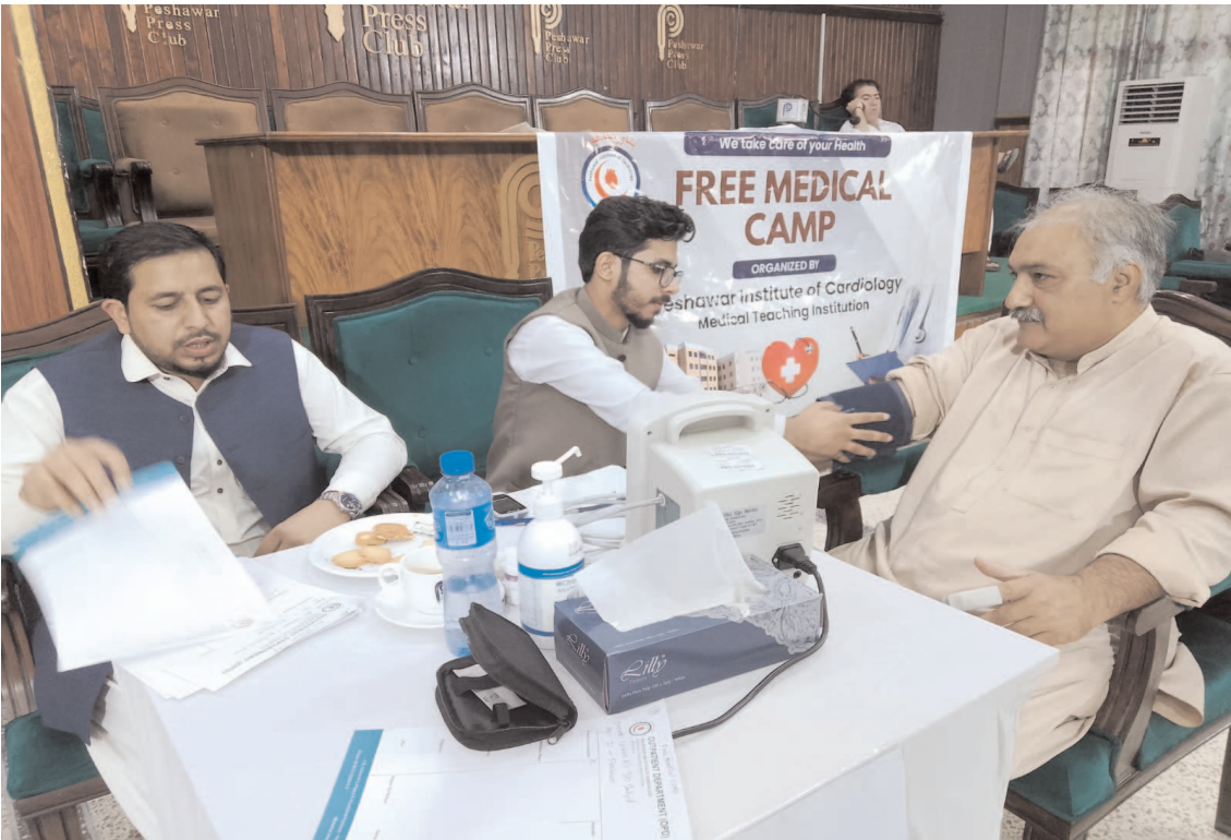
PESHAWAR: Senior journalists are being checked during free medical camp organized by Pakistan Institute of Cardiology at Peshawar Press Club.