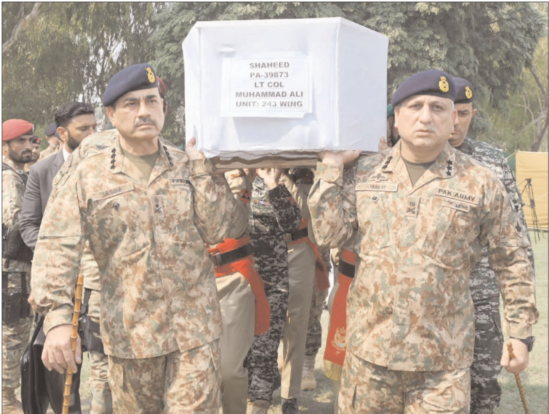
PESHAWAR: Chief of Army Staff, General Syed Asim Munir and other high ups of Army carrying coffin of Shaheed Lt. Col. Muhammad Ali Shoukat after funeral.

ISLAMABAD: Security measures have been intensified with the completion of military deployments in and around Islamabad in light of the upcoming Shanghai Cooperation Organisation (SCO) meeting. Sources indicated that Pakistan Army troops were now in control of D-Chowk, with ongoing patrols in the Red Zone. The Ministry of Interior issued deployment orders under Article 245 of the Constitution. The military presence in Islamabad is set to last from Oct 5 to 17 in accordance with the SCO meeting. The sources added that no miscreant would be allowed to disrupt peace and order.