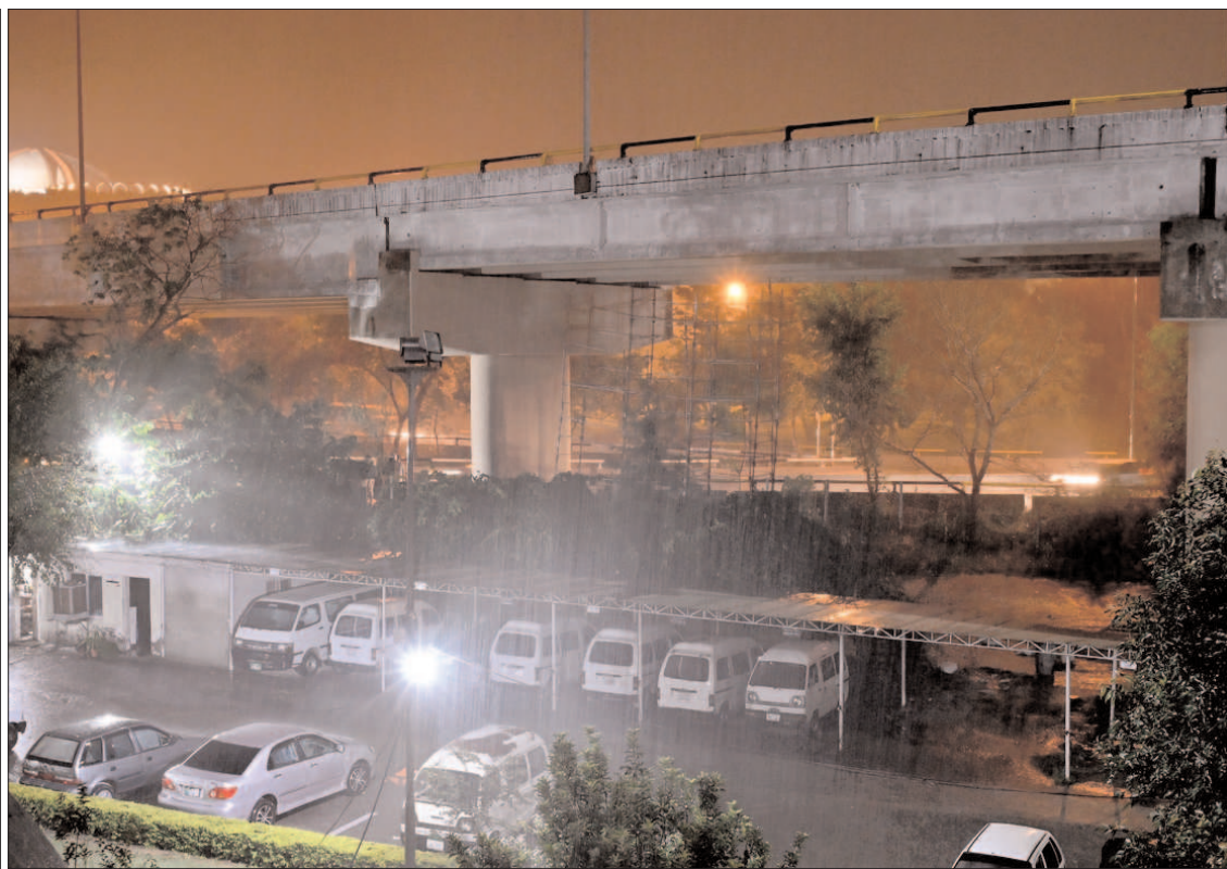
ISLAMABAD: A view of heavy rain in the federal capital.

After the Friday prayers, an anti-dengue walk was conducted in the main bazaars and streets of Chak Jalal Din. The CEO himself led the walk and made announcements regarding ongoing fight against the dengue challenge.