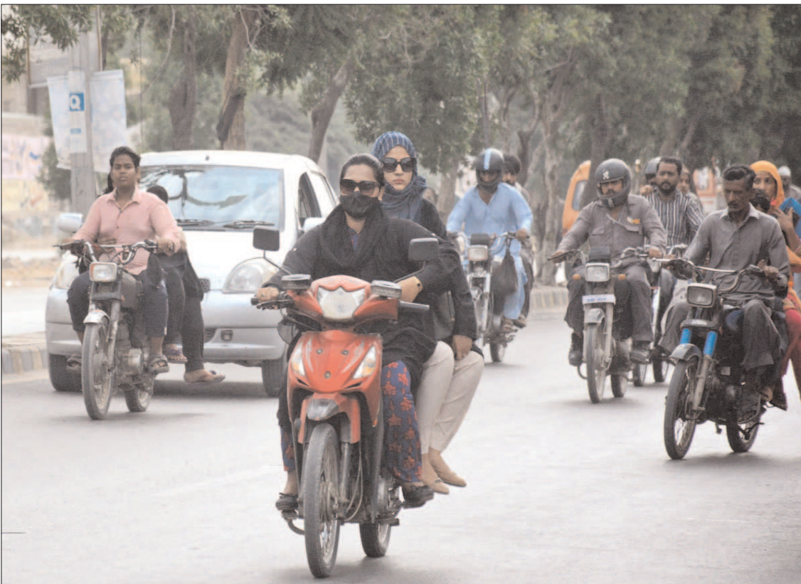
KARACHI: A lady drives motorcycle, is now a common practice in the city as women got more empower.