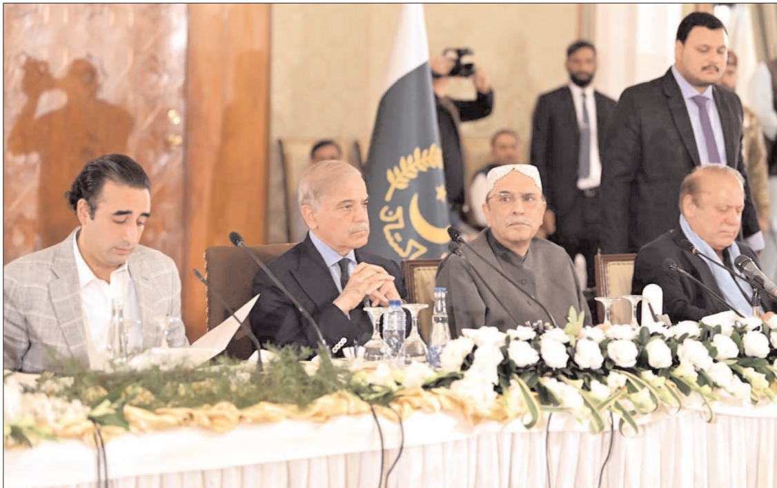
ISLAMABAD: Prime Minister Shehbaz Sharif addressing during All Parties Conference with regard to Palestine Solidarity Day.