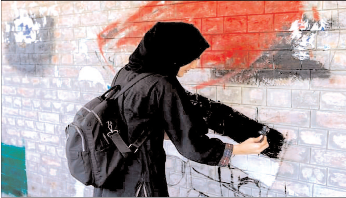
LAHORE: Students passionately create their vision of Al-Aqsa Mosque on the wall during a painting competition organized by Jamaat-e-Islami.