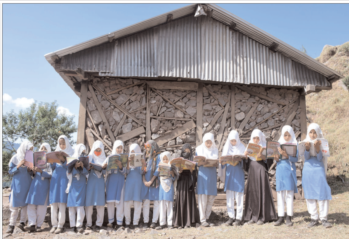
MUZAFFARABAD: Students busy in study under open air Government High School at Bani Langrial village.

Actions have not been taken by police to recover stolen goods while more thefts are continuing in the village Saindad Mugheri due to the continuous laziness of the police, but the police are busy protesting their carelessness. Traffic was flown by giving assurances of the SHO Police station Pakho and dispersing the sit-in.