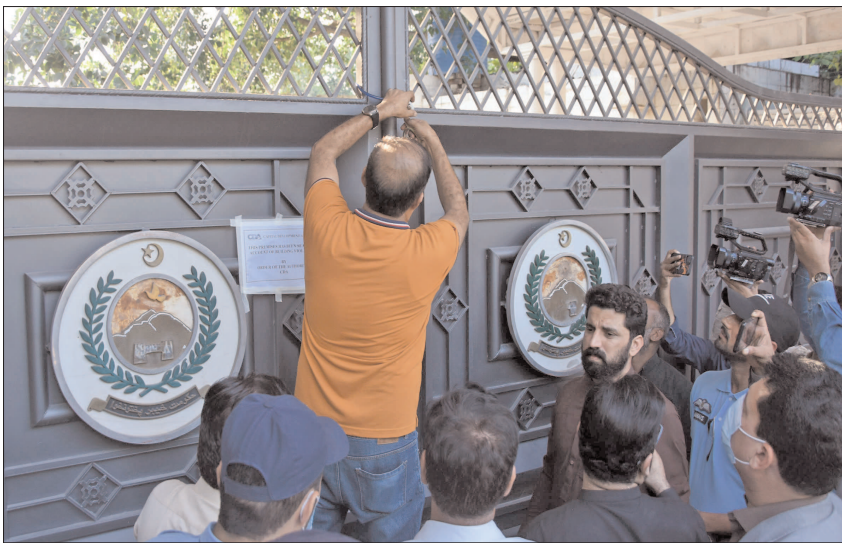
ISLAMABAD: Officials of Capital Development Authority sealing Khyber Pakhtunkhwa House.

The SCO summit holds key significance as it will also be attended by India's Minister of External Affairs Subrahmanyam Jaishankar — the first visit by an Indian foreign minister to Pakistan in nearly a decade. The federal government has called in the Pakistan Army as part of its comprehensive security plan with troops' deployment approved under Article 245 of the Constitution from October 15 to 17. This is not the first time that the authorities have barred meetings inside the Adiala facility previously, such a ban was imposed for two weeks in March due to security concerns. The compound has housed Khan for more than a year as the politician remained embroiled in multiple cases.