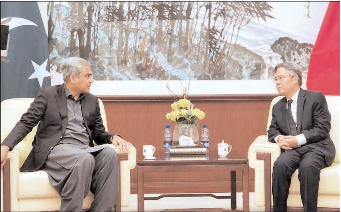
ISLAMABAD: Federal Minister for Interior Mohsin Naqvi in a meeting with Chinese Ambassador Jiang Zaidong in Federal Capital.