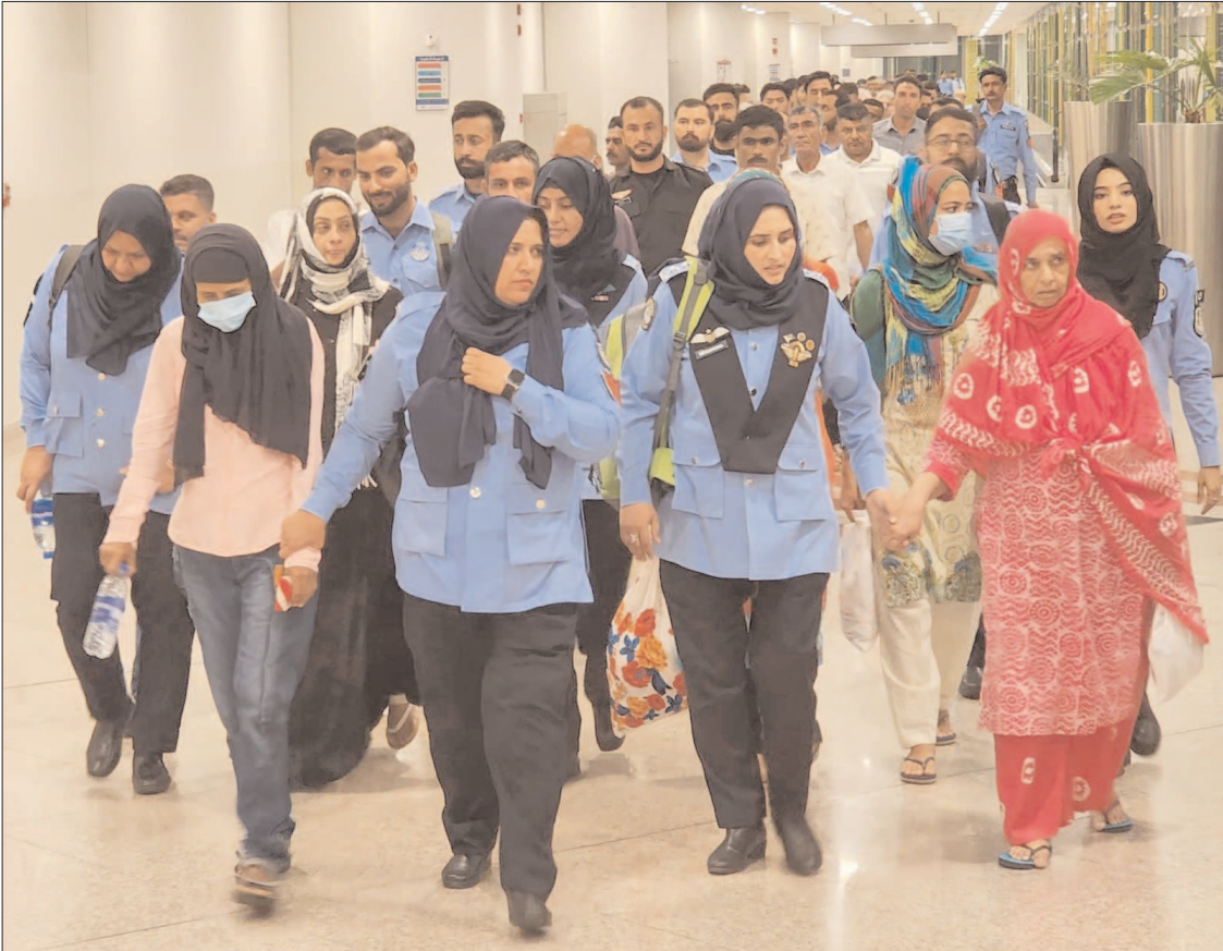
ISLAMABAD: Pakistani prisoners on their return from Sri Lanka at airport.

The group reported "unusual movement of Israeli enemy forces behind a UNIFIL position, on the outskirts of the border village of Maroun al-Ras," ordering fighters "not to take action... to preserve the lives of the peacekeepers", quoting a field commander in their statement. The group accused Israel of "trying to use UNIFIL forces as human shields". UNIFIL was created to oversee the withdrawal of Israeli soldiers from southern Lebanon after Israel's 1978 invasion. The UN expanded its mission after the 2006 war between Israel and Hezbollah, allowing peacekeepers to deploy along the Israeli border. — Aljazeera