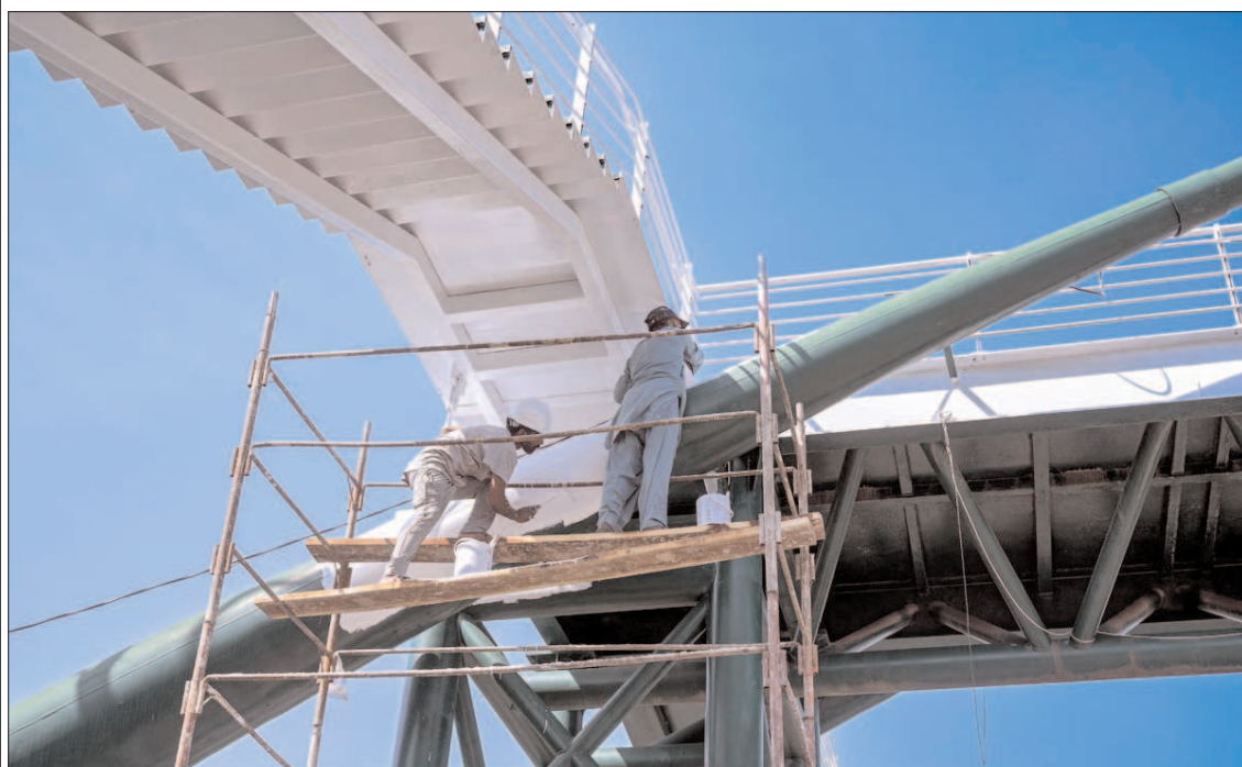
ISLAMABAD: CDA workers giving a fresh coat of paint to a bridge at Shakar Parian in the Federal Capital.

A detailed briefing was given to the meeting participants in which it was apprised that 1996 dengue patients have been reported in Rawalpindi in 2024. It was informed that presently there were 281 under treatment dengue patients in hospitals, whereas 1716 patients have been discharged from the hospitals after full recovery.