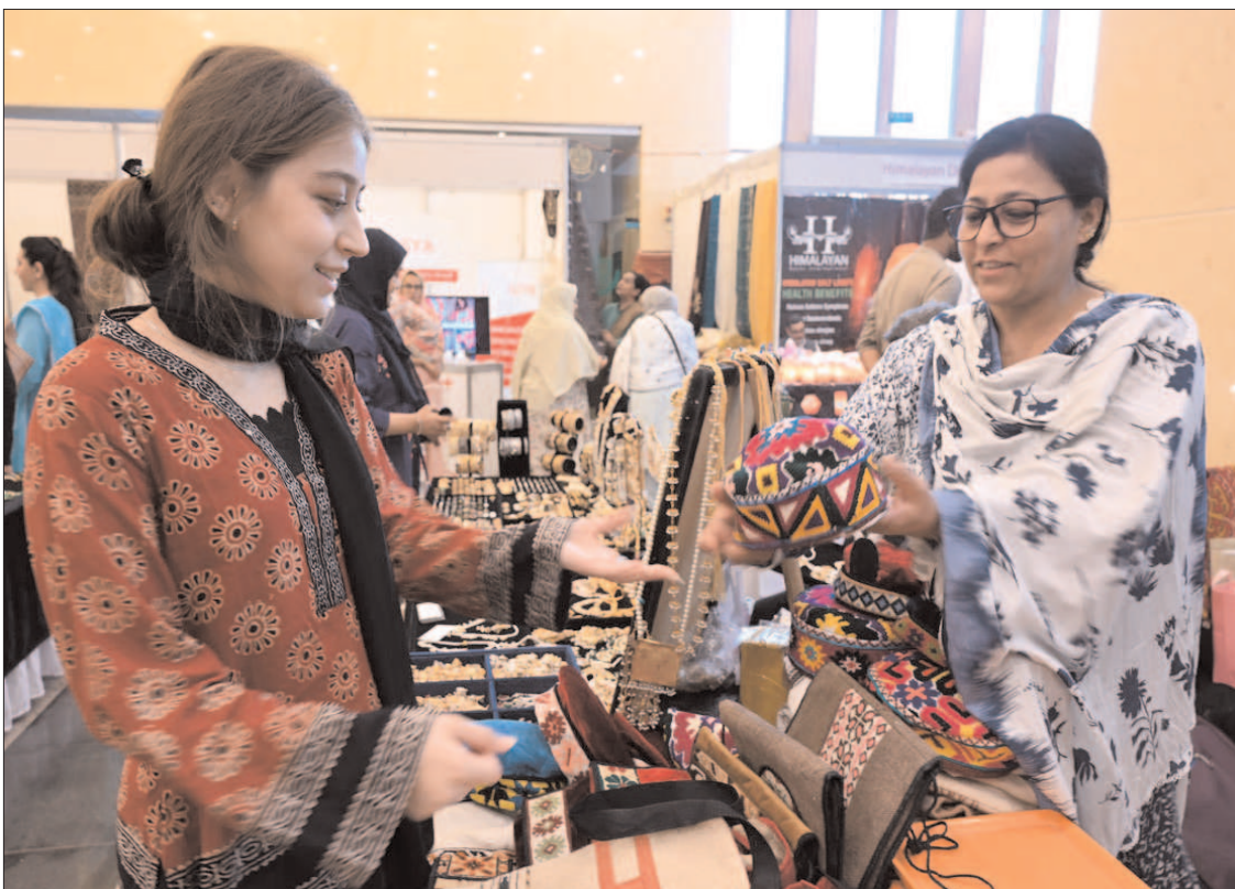
ISLAMABAD: Traditional hand-made caps of GB attracts the visitors at Behbud Art and Craft Bazar 9-10 November at PAK CHINA Friendship center.