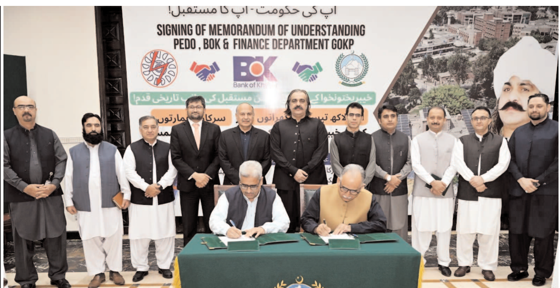
PESHAWAR: Chief Minister Khyber Pakhtunkhwa Ali Amin Khan Gandapur attending signing ceremony between PEDO, BOK and KP Finance Department.

PESHAWAR (APP): The Governor Khyber Pakhtunkhwa, Faisal Karim Kundi, on Saturday strongly condemned the bomb blast at Quetta Railway Station, describing it as a cowardly and heinous act by anti-Pakistan forces. In his statement, Governor Kundi expressed his deep sorrow over the loss of innocent lives in the attack, calling it a tragic incident that has caused immense grief to the nation. “The martyrdom of innocent passengers in the Quetta railway station bombing is heartbreaking and a significant cause of distress for all Pakistanis,” he said. The Governor also extended his prayers for the swift recovery of the injured, emphasizing that the entire nation shares in the pain of those affected. “We are praying for the speedy recovery of the wounded, and our hearts are with the victims and their families during this difficult time,” the Governor Khyber Pakhtunkhwa, Faisal Karim Kundi added. Kundi further urged members of the Pakistan Peoples Party (PPP) to actively participate in helping the victims by donating blood, as many of the injured require urgent medical care. “I call on all PPP workers to come forward and donate blood for the injured. It is our collective responsibility to stand by our fellow citizens in their time of need,” the Governor added. This blast, which targeted innocent civilians, has heightened tensions in the region, and the Khyber Pakhtunkhwa Governor reaffirmed the government’s commitment to eradicating terrorism and bringing the perpetrators to justice.