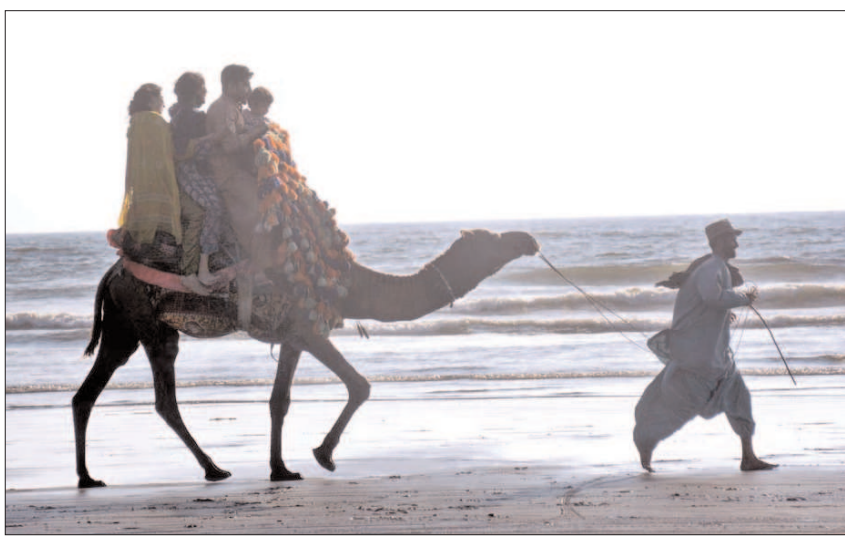
KARACHI: A family enjoying camel ride at Seaview Clifton.