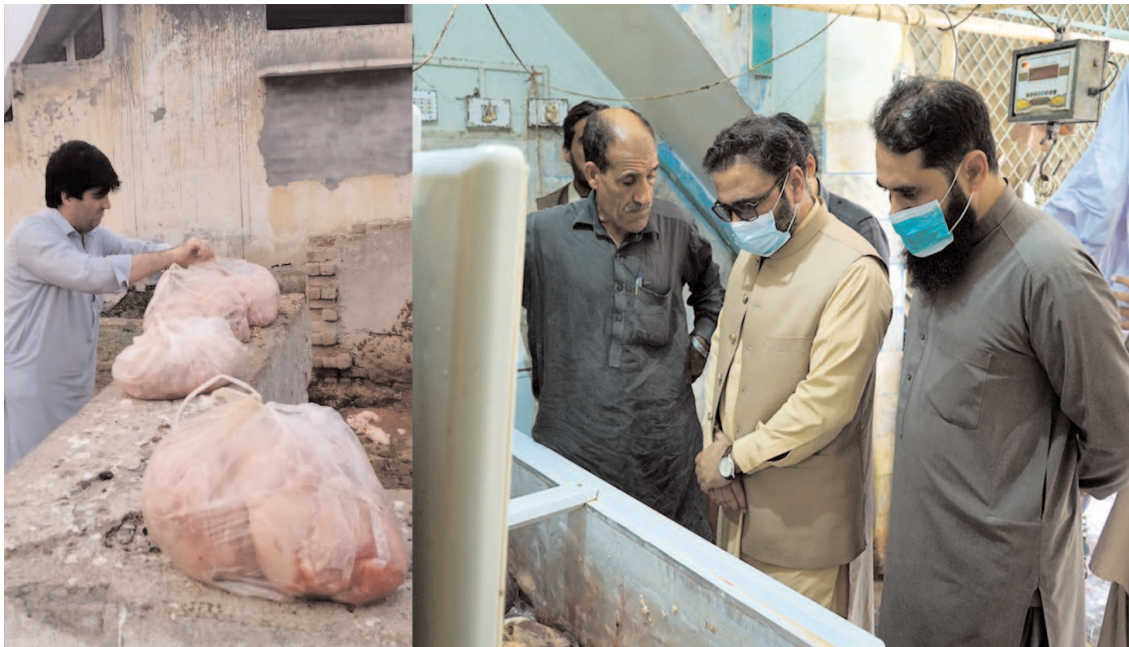
PESHAWAR: Khyber Pakhtunkhwa Food Safety and Halal Food Authority teams conducting inspections to verify compliance with food safety SOPs and to prevent sale of harmful or low-quality meat.

similar initiatives will continue in the future. Secretary for Food Department, Saqib Raza Aslam, added that these efforts aim to raise food quality standards and eliminate substandard products from the market. Meanwhile, Food Minister Zahir Shah Toru has lauded the campaign and issued a stern warning to those involved in the sale of unsafe meat, stating, "Strict action will be taken against anyone found violating health standards and no leniency will be shown."