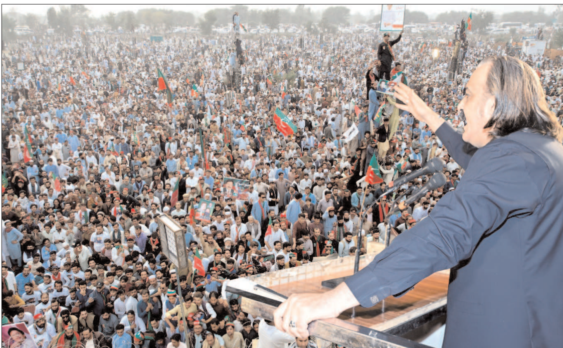
SWABI: Chief Minister of Khyber Pakhtunkhwa, Ali Amin Gandapur addressing during a public gathering.