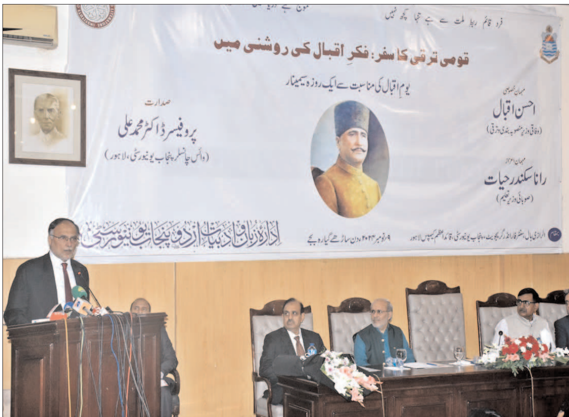
LAHORE: Minister for Planning Development & Special Initiatives for Pakistan, Ahsan Iqbal addresses a seminar on Iqbal Day at Raazi Hall New Campus Punjab University.

He called on citizens to support the new sanitation system, emphasizing that collective efforts are essential to building a better Pakistan for future generations.