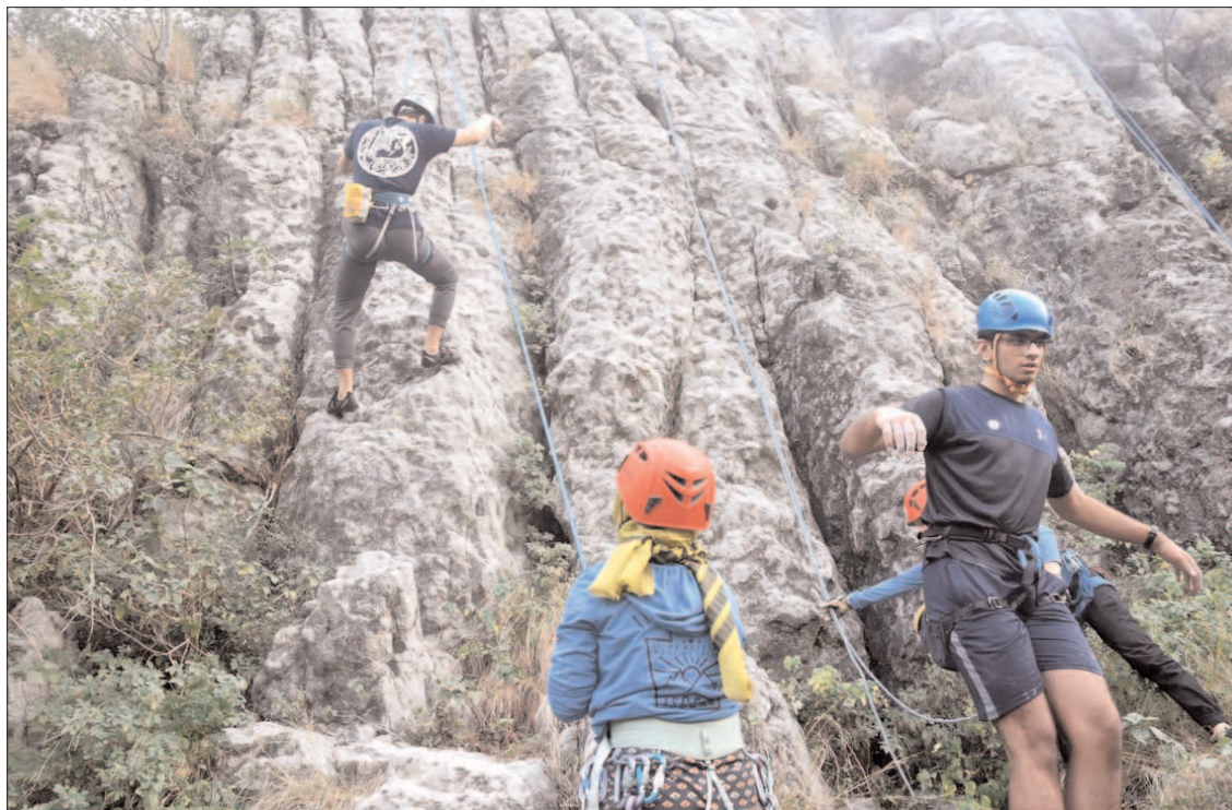
ISLAMABAD: Adventure lovers participating in rock climbing at Jasmeen Corner Pir Sohawa, organised by Athletics Ascend, a US NGO.

He said that people traveling by motorways and highways should keep fog lights on during their journey. He said that people should call the helpline 130 in case of any emergency.