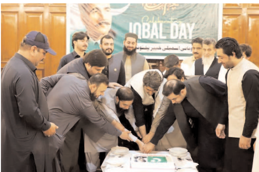
PESHAWAR: Khyber Pakhtunkhwa Assembly Speaker Babar Saleem Swati with others cutting a cake to celebrate Iqbal’s Day.

PESHAWAR (APP): The Higher Education Department, Khyber Pakhtunkhwa following directives from the Home Department has issued a high security alert to the educational institutions in Dera Ismail Khan and Waziristan. A notification on Saturday directed the educational institutions in these districts for ensuring extra security measures in the wake of possible security threats. It said that the authorities of institutions concerned should extend complete cooperation to the district administration and law enforcers in ensuring extra security, adding that educational institutions could also demand extra security cover for their respective institutions. The notification was issued to Government Degree College No-2, Government Degree College Paharpur and Purwa. In Waziristan, the notification issued a security alert to government degree colleges for male and female students in Darandaza, Wana and Jandola.