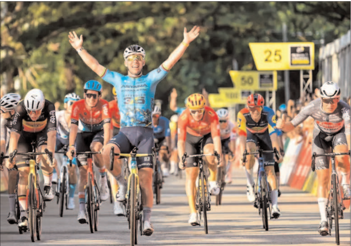
SINGAPORE: Mark Cavendish of The United Kingdom and Astana Qazaqstan Team celebrates at finish line as race winner.