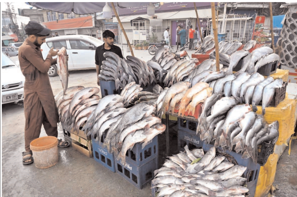
ISLAMABAD: A young vendor displaying fish to attract customers at his roadside setup.

With a focus on providing relief at the taxpayer's doorstep, the FTO office is committed to enhancing taxpayer satisfaction, promoting compliance, and ultimately contributing to a more efficient tax system.