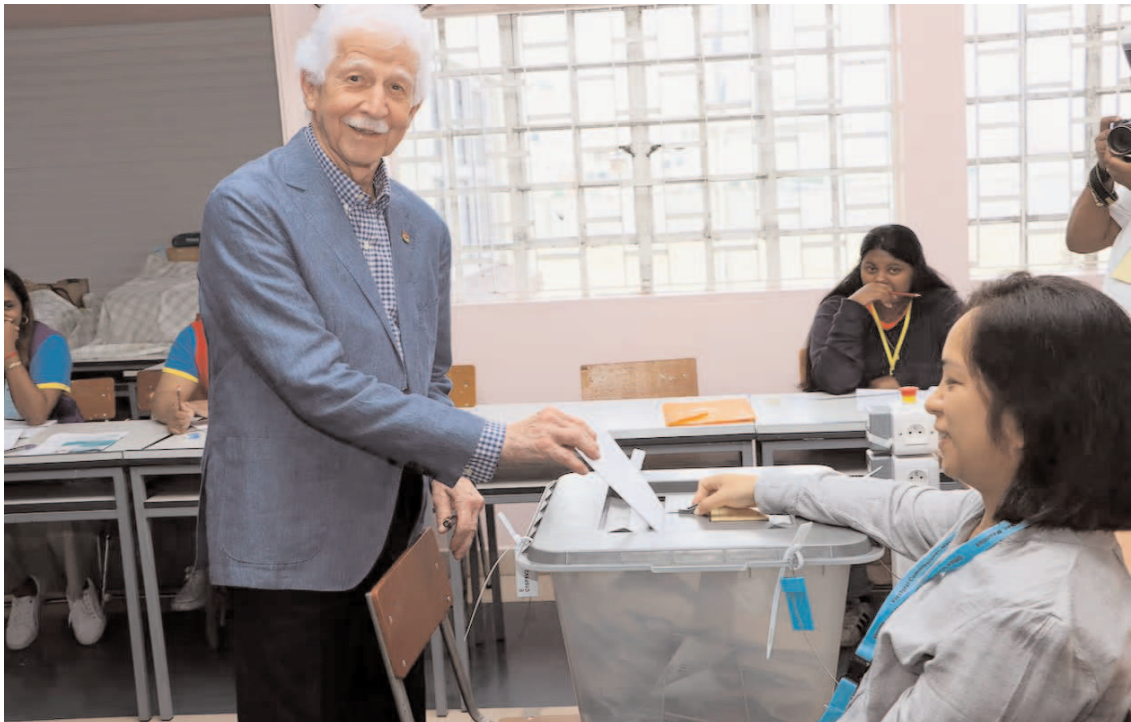
PORT LOUIS: Former Prime Minister and leader of the Mouvement Militant Mauricien (MMM) party Paul Berenger casts his ballot at a polling centre during the Mauritian general election in Vacoas/Floreal, Mauritius, on Sunday.

Israeli Foreign Minister Gideon Saar, who made a last-minute trip to the Netherlands due to the unrest, met Schoof and his Dutch counterpart, Caspar Veldkamp, on Saturday. Saar held talks with Justice Minister David van Weel and far-right leader Geert Wilders when he arrived on Friday. At least five people were injured during the unrest involving fans of the visiting Maccabi Tel Aviv soccer team who lost 5-0 to Ajax in the Europa League.