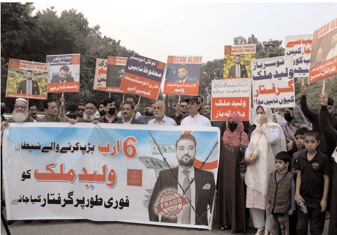
ISLAMABAD: Victims of Al Muraj Group square Nine are protesting outside NPC for their demands.

RAWALPINDI (APP): The Directorate General (DG) Punjab Food Authority (PFA) conducted inspections of food outlets on Murree Road, and imposed fine two food outlets totaling Rs. 250,000 due to poor hygiene and over cleanliness arrangements. PFA spokesman informed. During the inspection, PFA teams also destroyed approximately 100 kilograms of ice cream after finding human hair in the product. The fines were imposed in response to inadequate cleaning and sanitation measures observed at outlets. However, the well-known Pizza Hut in the commercial market was appreciated for maintaining high standards of cleanliness. Additionally, three food points were issued notices, advising them to improve their hygiene standards. DG Food Authority emphasized that "cleanliness is half of faith" and urged all food businesses to prioritize hygiene to ensure the safety of the consumers. He made it clear that such businesses would be closed down involved in malpractices. Strict action would be continued against the violators without any discrimination, he added.