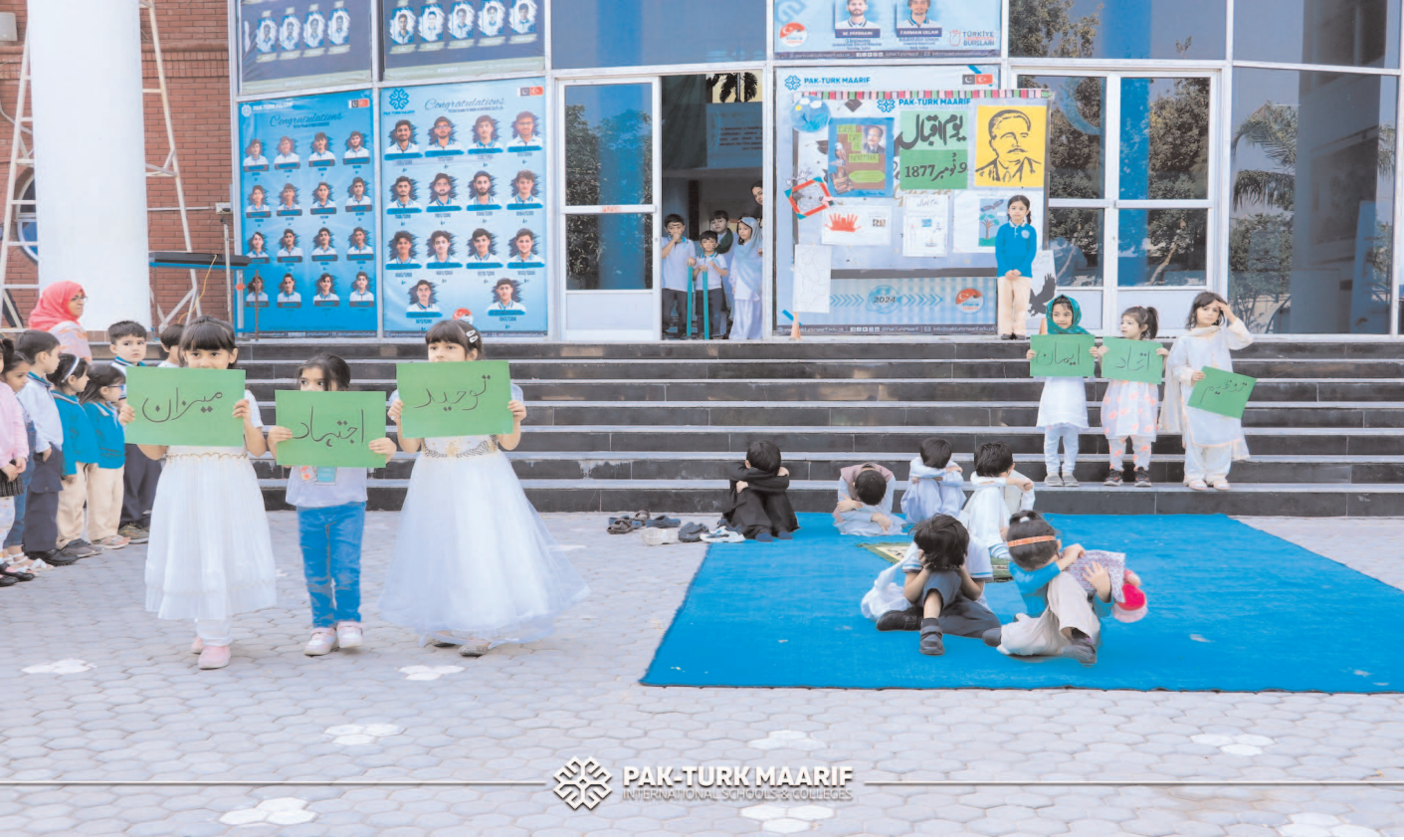
Students in school uniforms holding green signs with Urdu text, standing in front of a building with posters of world leaders.

PESHAWAR: For two brotherly countries; Türkiye and Pakistan, education holds a critical importance not only for their future through the new generation but also for bringing them closer. The strategy and approach in academic development target the highest possible quality and standard in our programs. To embed the philosophy of “Two Nations, One Future”, Pak-Turk Maarif International Schools and Colleges provide inspirational, value integrated and progressive learning environments to students who are also encouraged to participate in National & International Competitions and celebrate the accomplishment of the teachers for their efforts. To embed the philosophy of “Two Nations, One Future”, Pak-Turk Maarif International Schools and Colleges provide inspirational, value integrated and progressive learning environments to students who