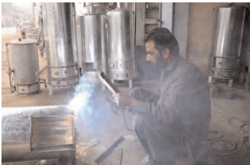
SARGODHA: A worker busy in making geyser at selawli road.

In the said program, prominent literary figures presented their papers and speeches on the occasion, which were highly appreciated by the audience.