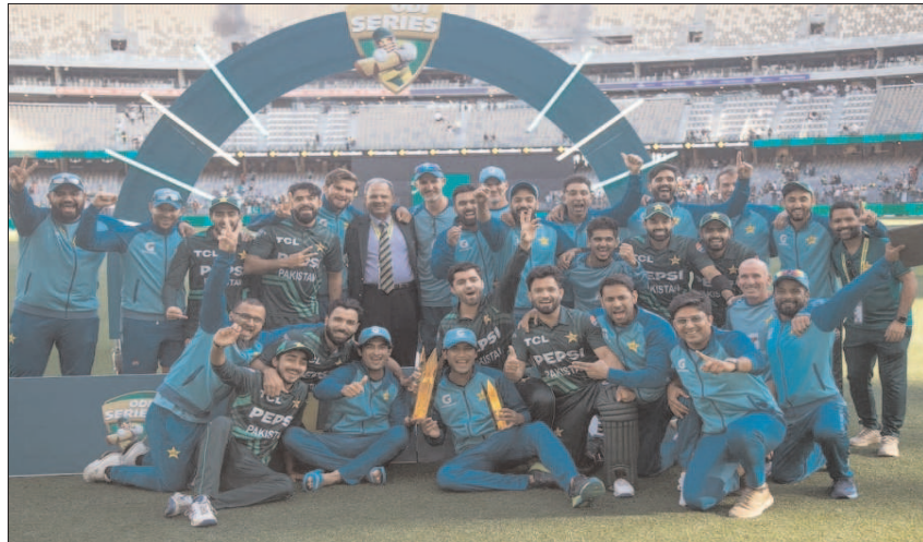
PERTH: Pakistan players and team officials celebrating the series win over Australia.

They begin a three-match T20 series on Thursday in Brisbane.