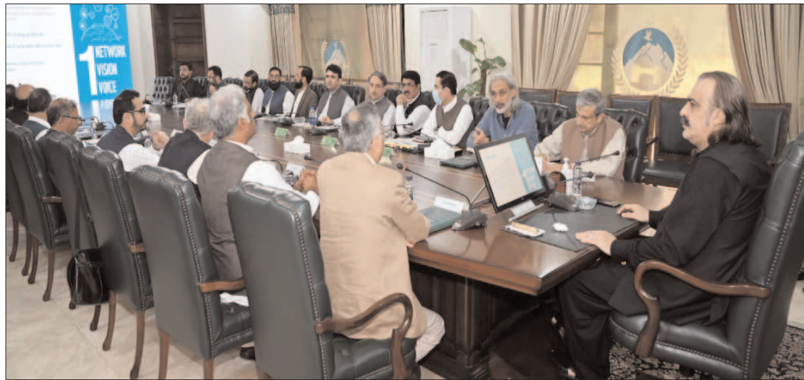
PESHAWAR: Khyber Pakhtunkhwa Chief Minister Ali Amin Khan Gandapur talking to a delegation of World Wildlife Fund (WWF).

He assured full support for international organizations working in these fields and directed relevant department officials to coordinate with WWF Pakistan to finalize an action plan for the program's implementation.