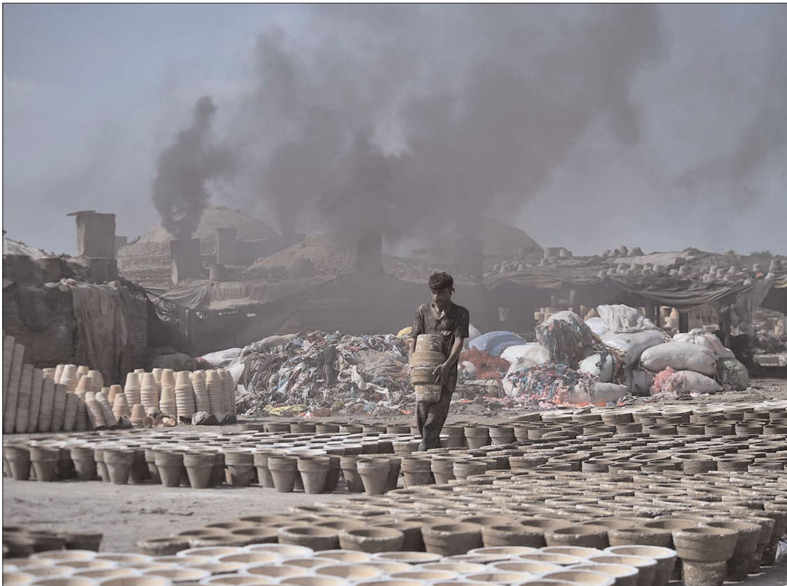
KARACHI: A craftsman is busy creating traditional wooden chick curtains, a sustainable and effective solution to filter out dust and pollutants from homes in Karachi.