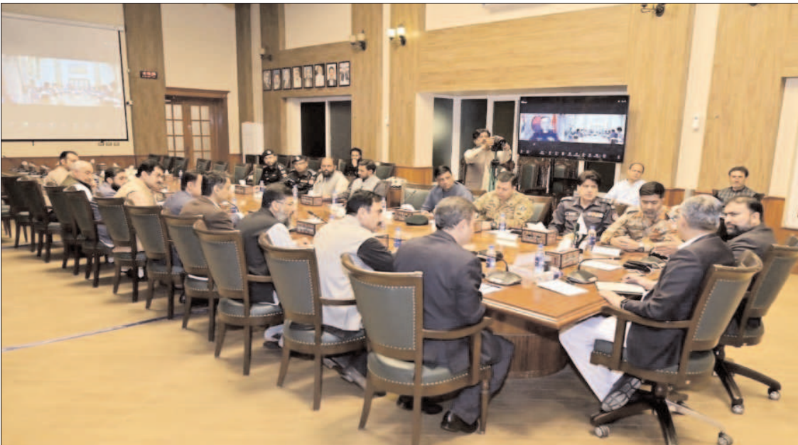
QUETTA: Federal Interior Minister Mohsin Naqvi along with Chief Minister Balochistan Sarfraz Bugti chairing an emergency meeting on law and order situation in the province.

fire exchange, two Khwarij were sent to hell. In another incident, movement of a group of khwarij, who were trying to infiltrate through Pakistan-Afghanistan border, was picked up by the security forces in general area Spinwam, North Waziristan District. Own troops effectively engaged and thwarted their attempt to infiltrate. Resultantly, two khwarij were sent to hell, while two khwarij got injured. PM pays tribute to security forces Prime Minister Muhammad Shehbaz Sharif on Sunday paid tribute to the security forces for killing four Fitna al-Khawarij terrorists in Spinwam area of North Waziristan and injuring two others who were subsequently arrested. The prime minister praised the officers and personnel of security forces for their successful operation against Fitna-al-Khawarij in Spinwam, North Waziristan.