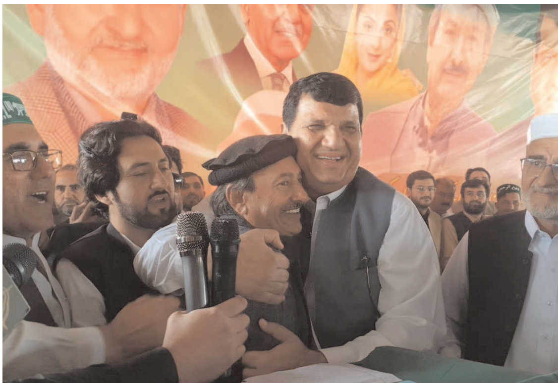
DIR: Minister for State and Frontier Regions (SAFRON) and Kashmir Affairs Engineer Amir Muqam welcoming Senator Zahid Khan, former Secratry Information ANP on joining PML-N

LODHRAN (INP): Lodhran Deputy Commissioner Abdul Rauf Mehr has ordered for establishment of smog awareness camps across the district. He issued a high alert detailing protective measures against the harmful impact of smog two days ago. The awareness camps aimed to create awareness among the public about the dangers of smog and encourage active participation in measures to mitigate its effects. Highlighting the seriousness of the issue, the DC described smog as a dangerous environmental threat, stressing the need for collective action from all citizens to combat it. Special anti-smog squads have been deployed across the district. These squads are actively working to curb air pollution through various interventions. Municipal committees are conducting regular water sprinkling to reduce dust level. The Punjab government has enforced strict ban on activities contributing to smog, such as the burning of crop residue, emissions from industrial waste, and the incineration of municipal waste, tires, and plastic materials.