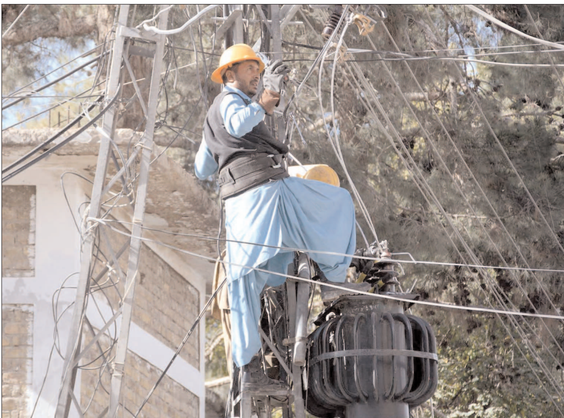
QUETTA: A worker of Quetta Electric Supply Company repairing transformer at Adalat Road.