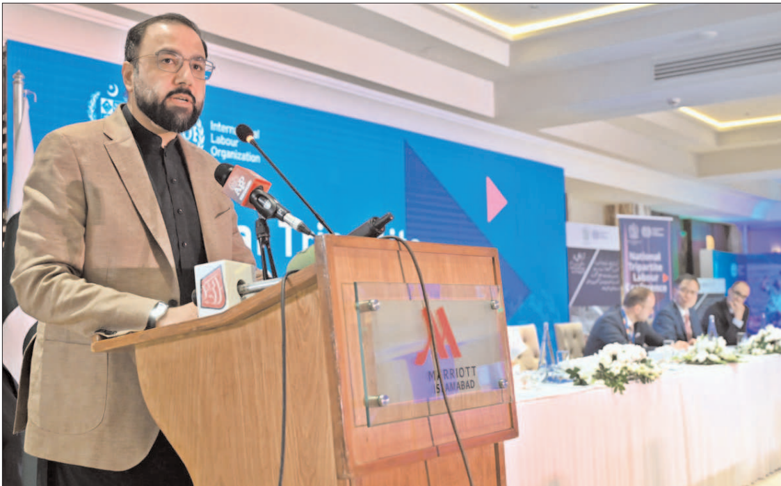
ISLAMABAD: Federal Minister for Overseas Pakistanis and Human Resource Development Chaudhry Salik Hussain addressing two-day Pakistan's National Tripartite Labour Conference.