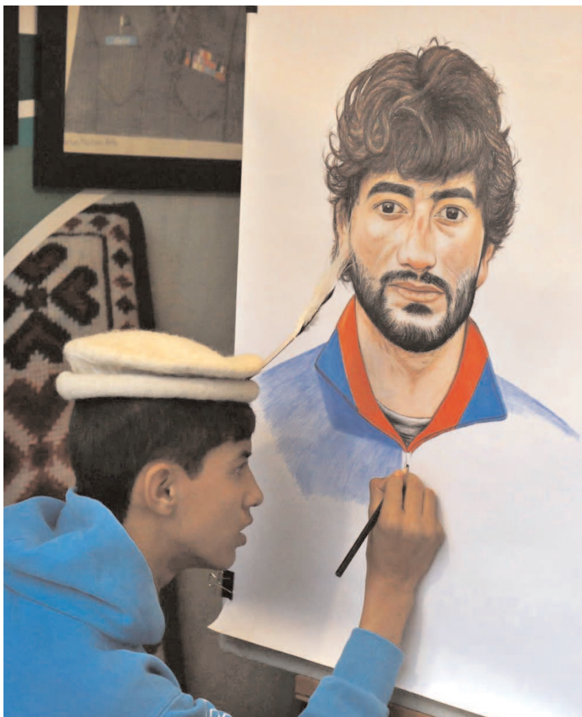
ISLAMABAD: A young artist sketches at his stall, showcasing his talent to attract customers during Lok Mela, the Folk Festival at Lok Virsa.

A highly diversified cohort of mid-career officers from the federal parliament and provincial assemblies, as well as Legislative Assemblies of Azad Jammu and Kashmir and Gilgit Baltistan and the Parliament, is participating in the course.