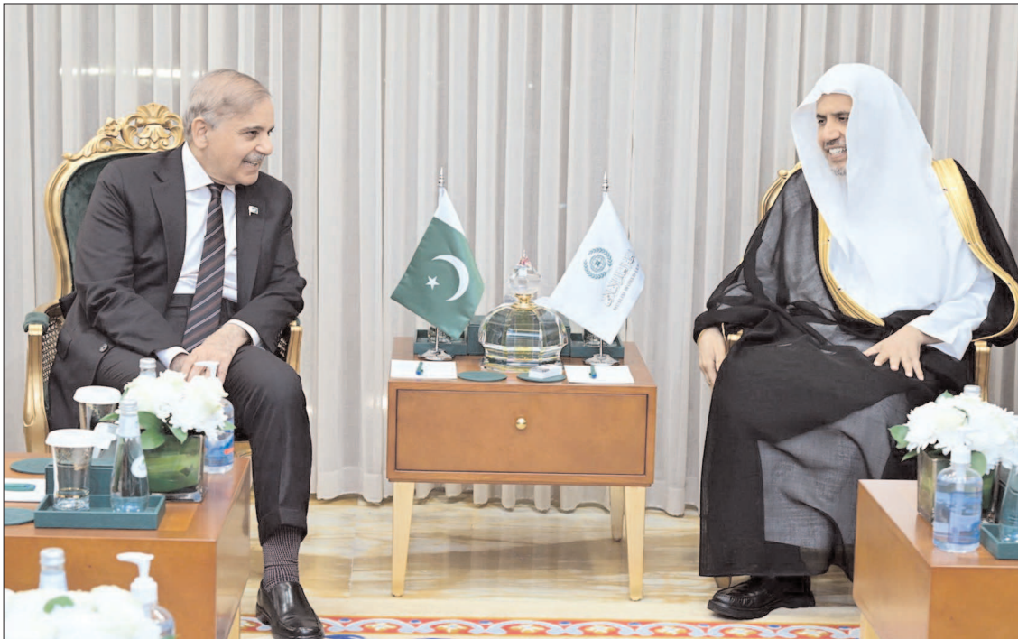
RIYADH: Prime Minister Shehbaz Sharif meeting with Secretary General of World Muslim League, Sheikh Dr. Mohammad bin Issa on the sidelines of Arab-Islamic Extraordinary Summit.