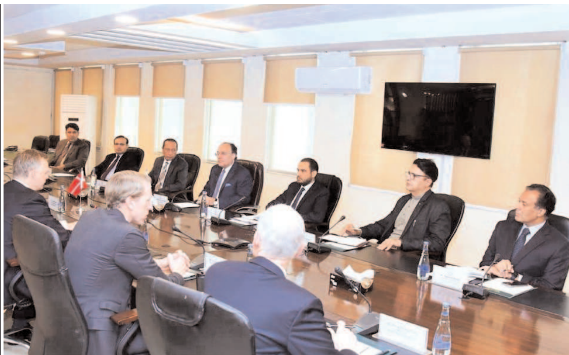
ISLAMABAD: Federal Minister for Finance and Revenue Senator Muhammad Aurangzeb chairing a meeting with delegation from APM Terminals led by CEO Keith Svendsen.

The price of gold in the international market declined by $13 to $2,670 from $2,683, the Association reported.