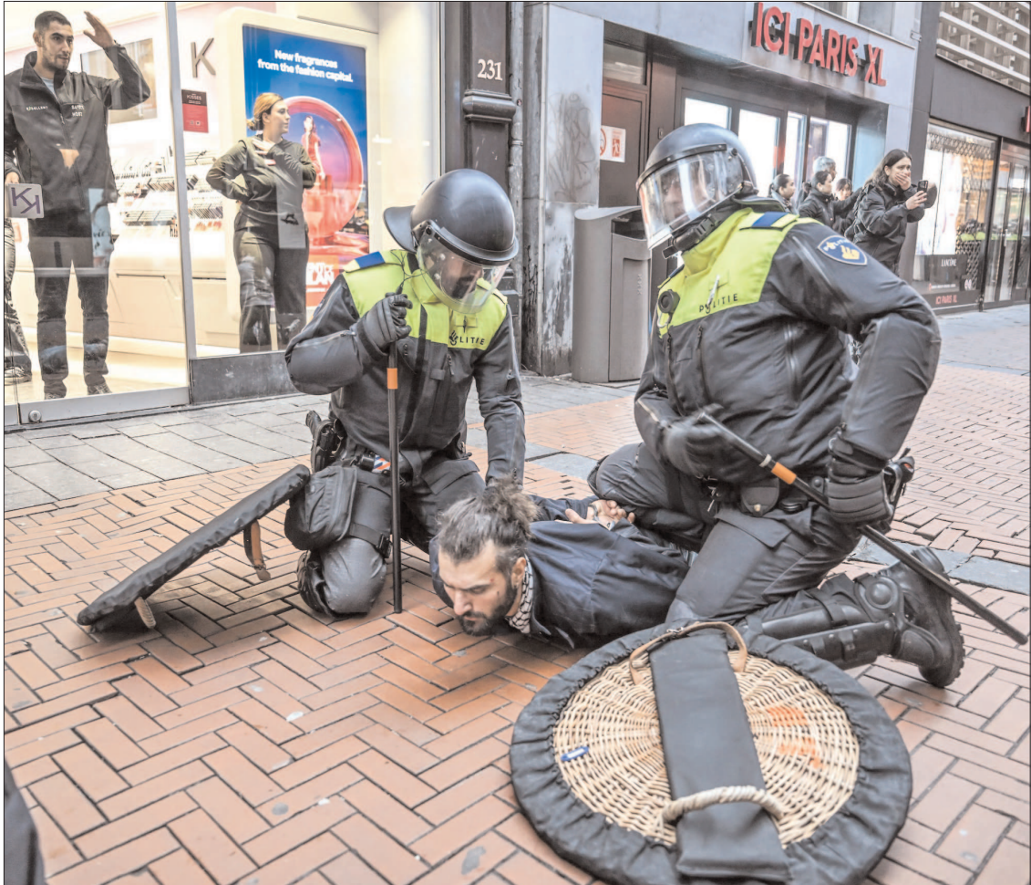
AMSTERDAM: Police officials arresting a pro-Palestinian protester during a demonstration against Israeli attack on Gaza.