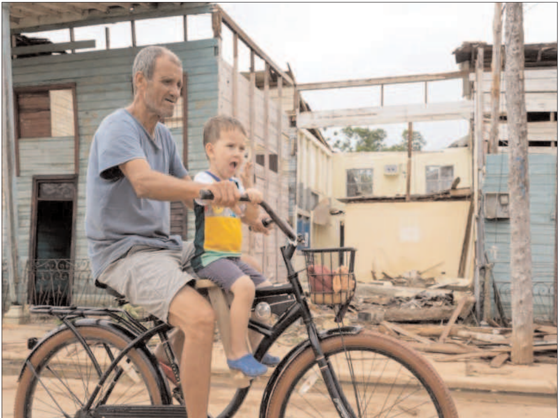
HAVANA: Residents cycle past homes damaged when Hurricane Rafael passed through Batabano, Cuba.