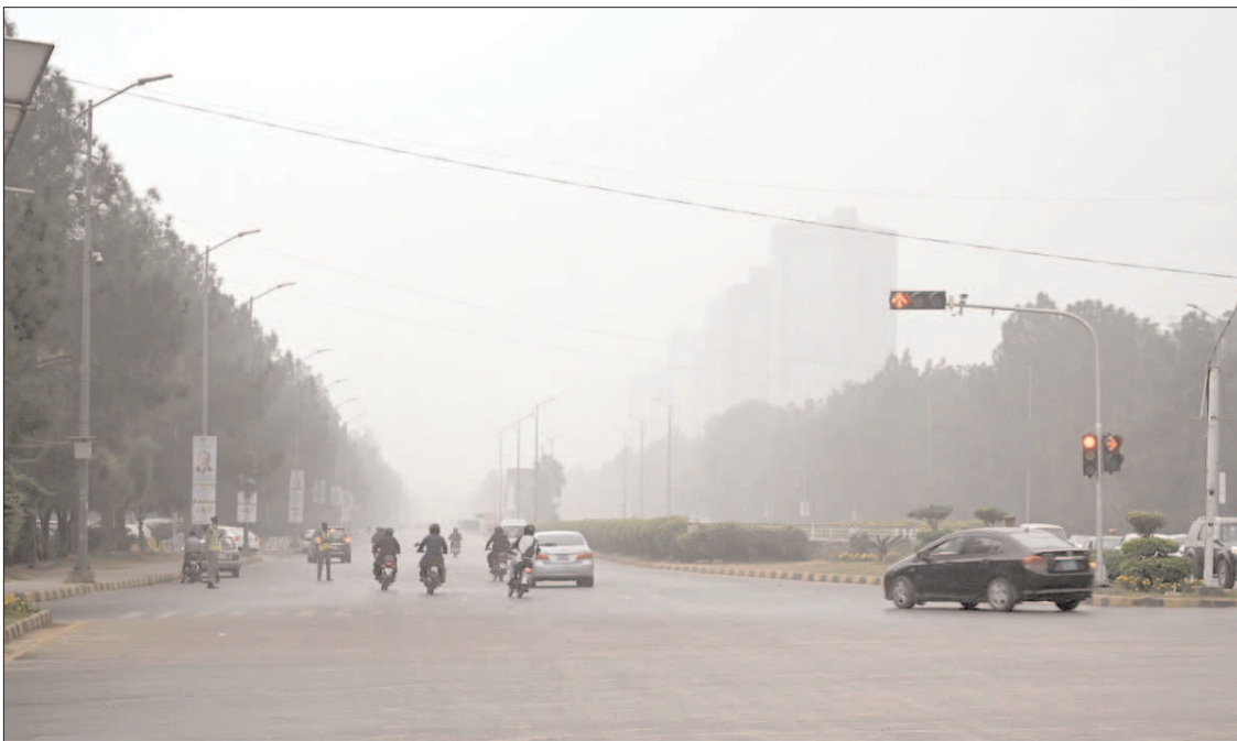
ISLAMABAD: A view of thick fog creating low visibility in the Federal Capital.

Cases under the Anti-Narcotics Act have been registered against the arrested accused and further investigations are under process.