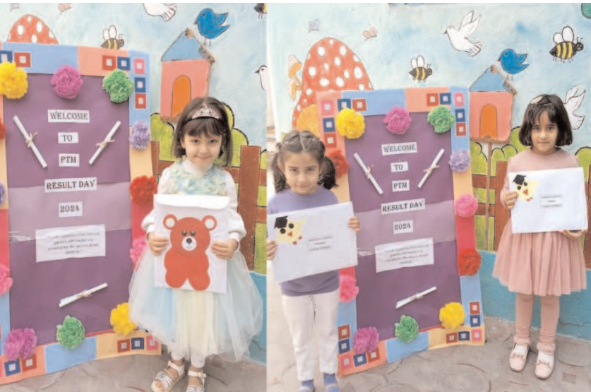
PESHAWAR: Position holder students of The Smart School with their certificates during the Result Day.