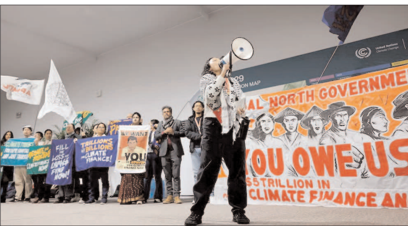
BAKU: An activist speaks into a megaphone at a protest during the United Nations Climate Change Conference (COP29), in Azerbaijan.

Emphasizing the importance of women's empowerment, the Chief Minister asked parents to invest in their daughters' education and to guide their children toward fields aligned with their interests for better career prospects. Addressing the youth, he urged them to set ambitious goals and work diligently, stating, "Success and recognition in life demand hard work, which has no substitute."