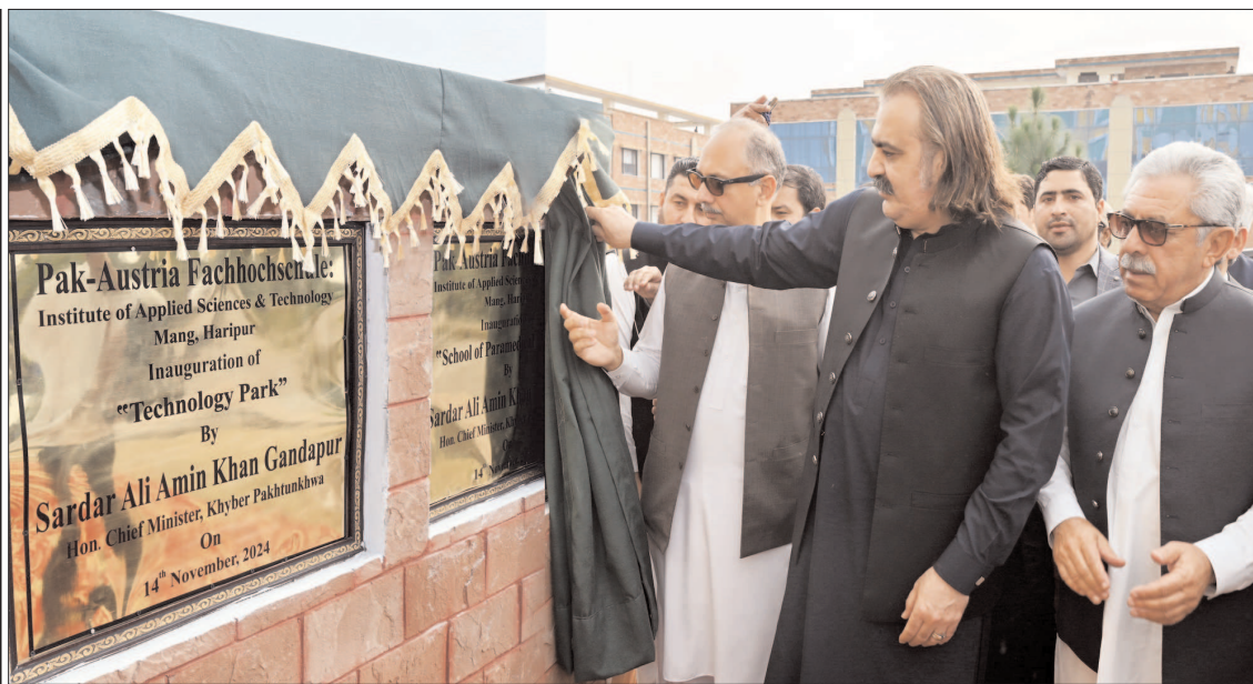
HARIPUR: Chief Minister of Khyber Pakhtunkhwa, Ali Amin Gandapur School of Paramedical Sciences and Technology Park.

He said that we were elected Members Parliament on the tickets of Imran Khan with votes of the people of Hafizabad and people of Hafizabad were our power. MPA said that some elements were blaming and making falls propaganda to support in 26th constitutional amendment. He said that we were standing with Imran Khan firmly and would not bow before present government at all.