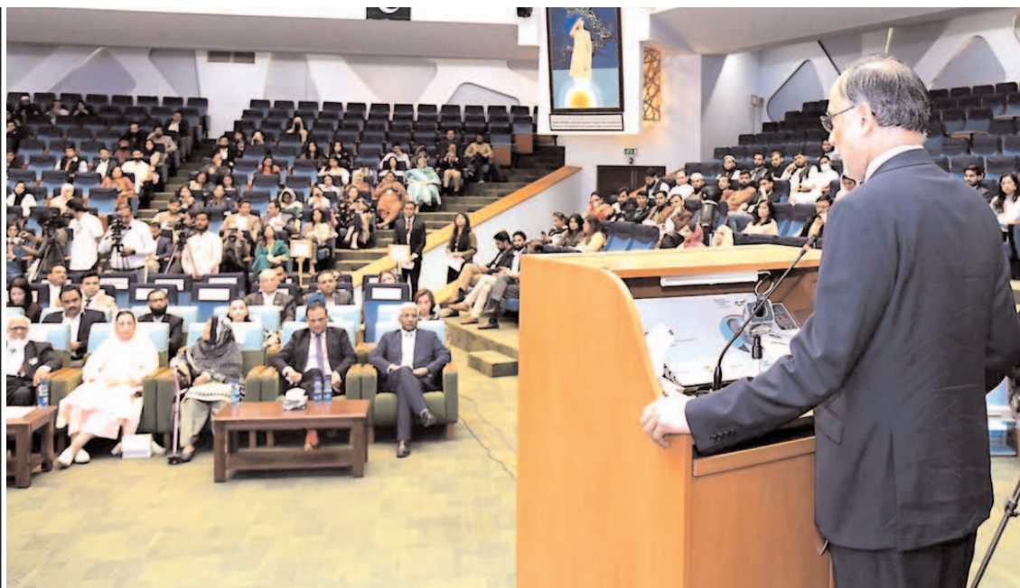
ISLAMABAD: Federal Minister for Planning, Development and Special Initiatives Ahsan Iqbal delivering a keynote address at WECON2024 Conference at NUST.