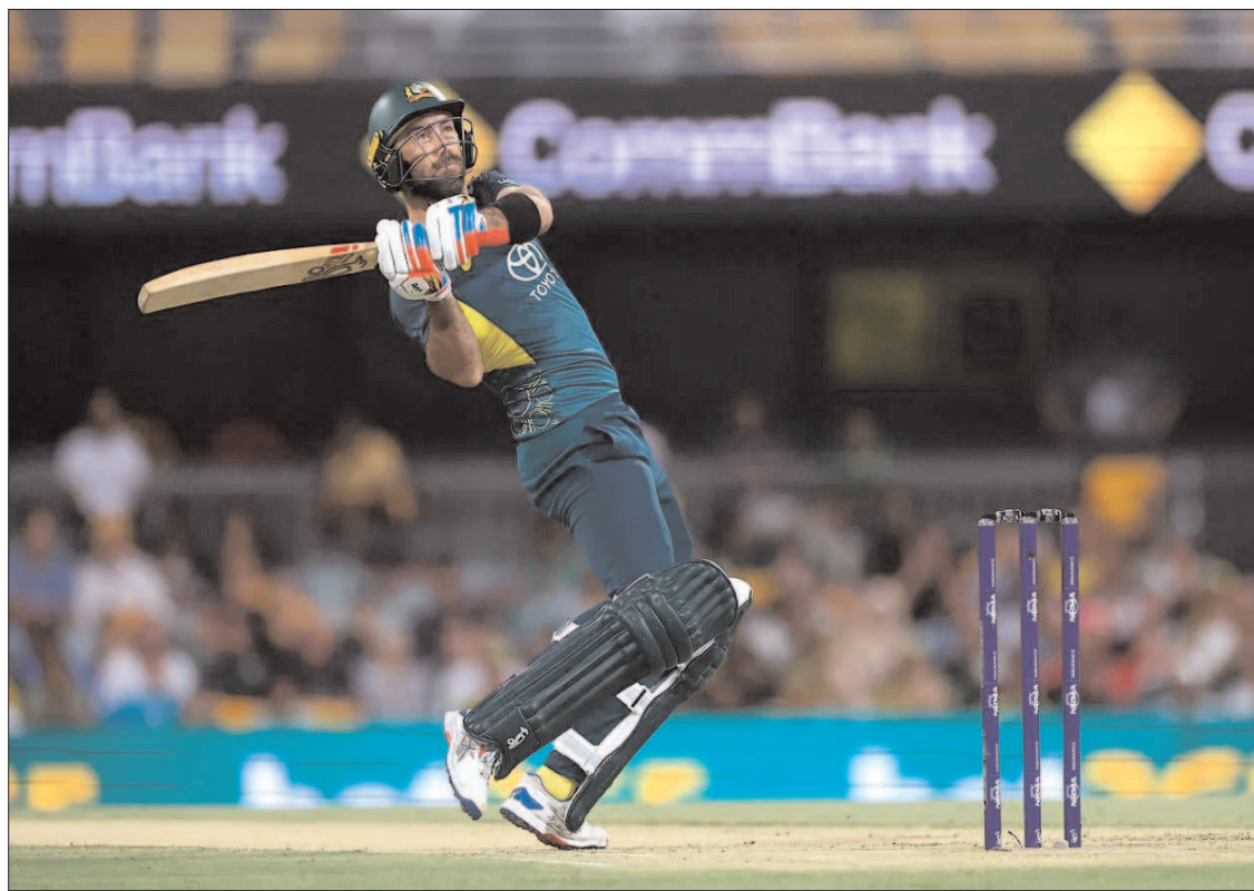
BRISBANE: Glenn Maxwell plays a reverse shot during the first T20 international against Pakistan.

When Adam Zampa came in to bowl the final over, Shaheen managed to smear one over long-on for six, but in an innings characterised by clumps of wickets falling quickly, that Zampa signed off with consecutive wickets of his final two balls was a fitting end.