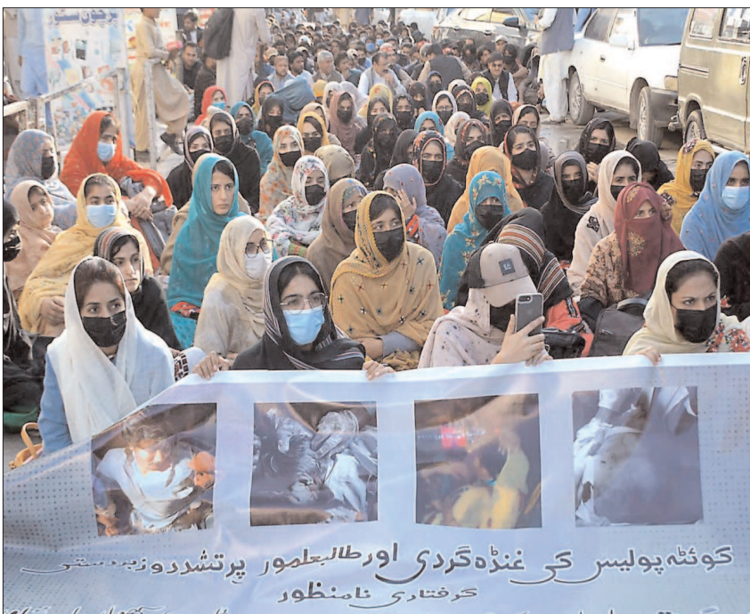
QUETTA: Activists of Balochistan Students Organization holding a protest for acceptance of their demands.