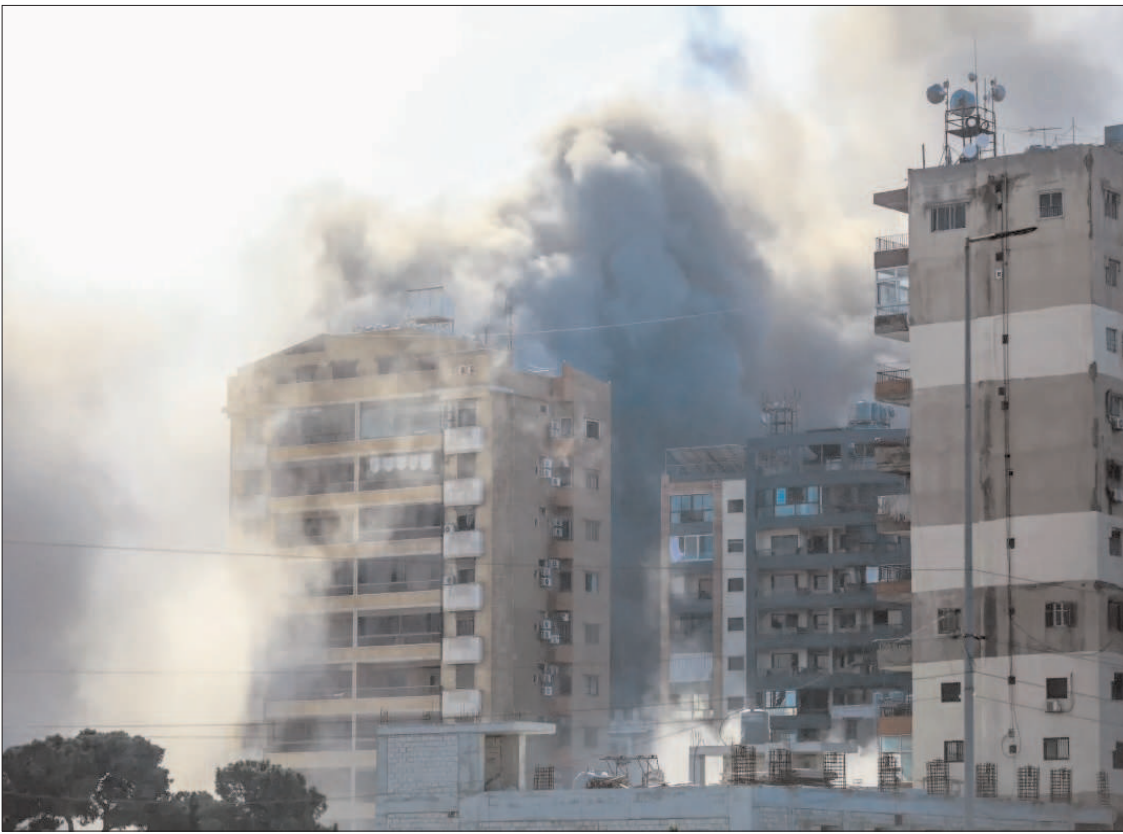
BEIRUT: Smoke rises from the site of an Israeli air raid on the Ghobeiry neighbourhood, Lebanon.