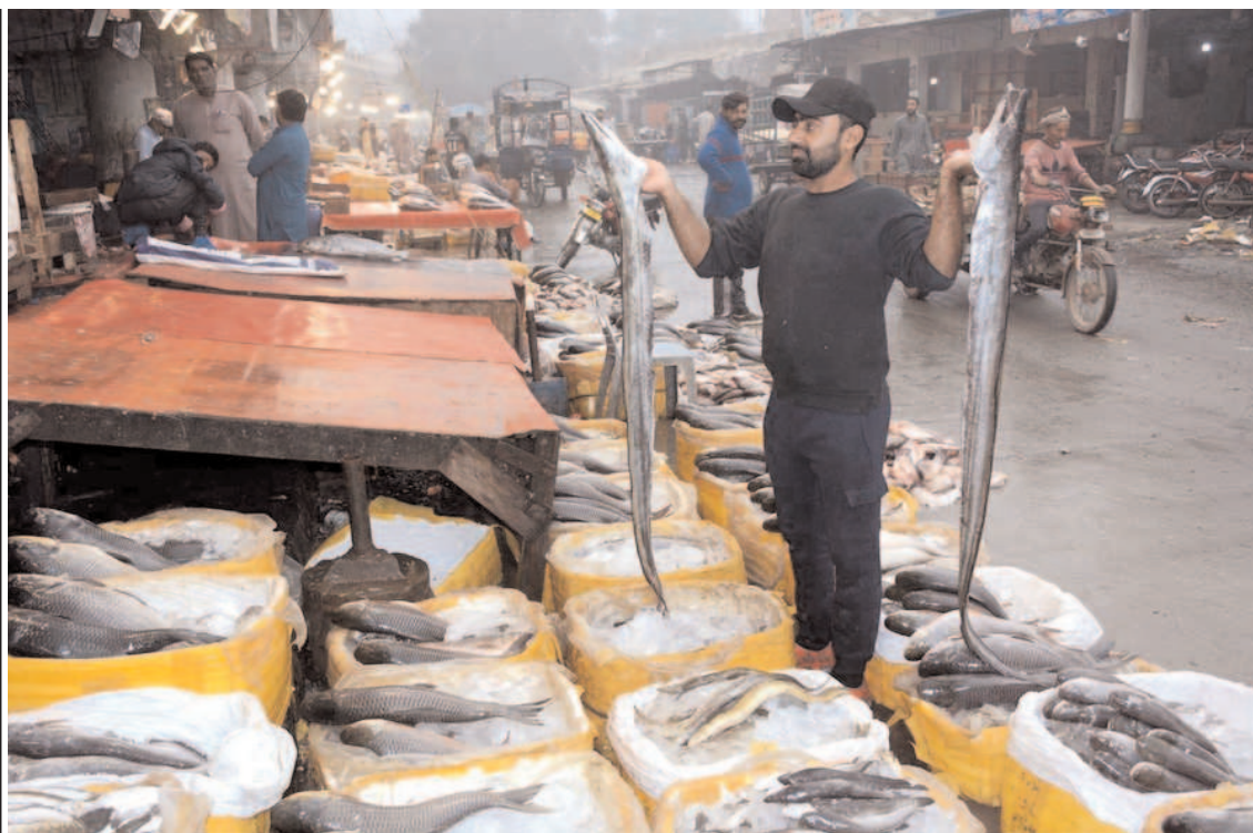
FAISALABAD: A vendor displaying fish to attract customers at Novelty Bridge Fish Market.

The exchange rate of the Emirates Dirham and the Saudi Riyal decreased by 03 paise each to close at Rs75.61 and Rs73.92, respectively.