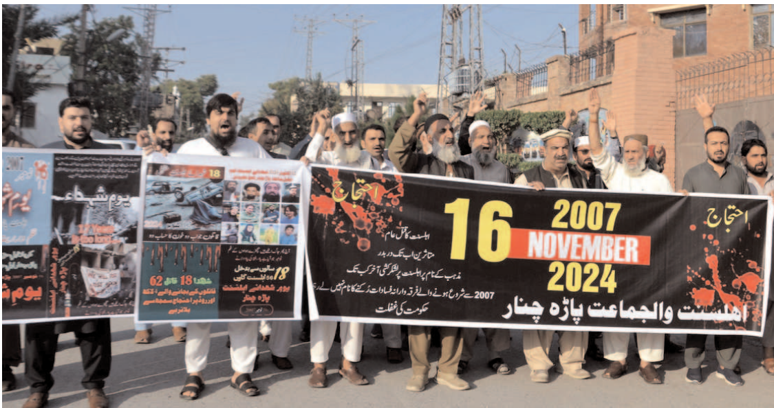
PESHAWAR: Activists of Jamaat Ahle Sunnat chanting slogans during a protest rally.