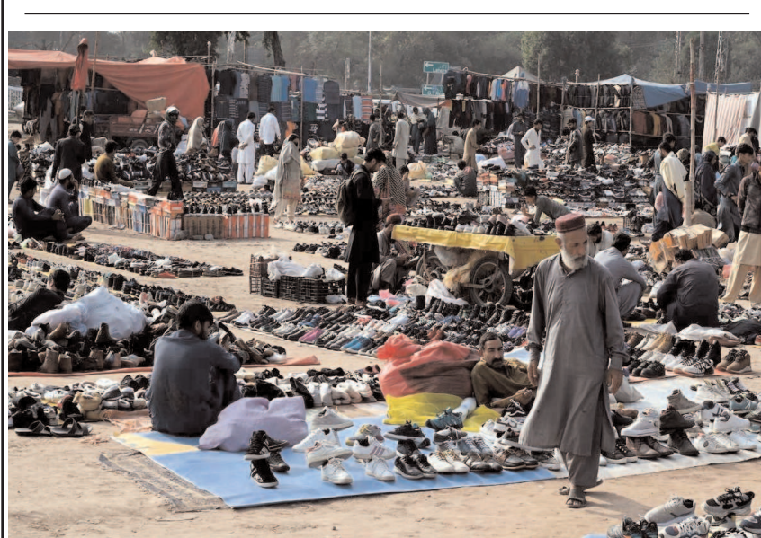
ISLAMABAD: People selecting and purchasing second-hand shoes from Landa Bazaar at Zia Masjid Stop along Expressway.