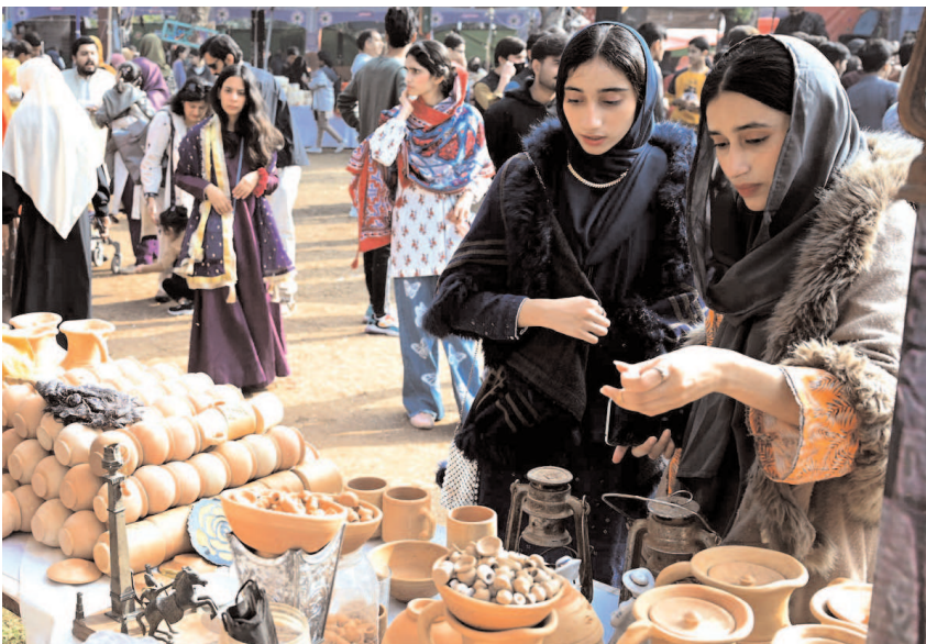
ISLAMABAD: Visitors visiting stalls during the 10-Day "Folk Festival Lok Mela 2024" at Lok Virsa in the Federal Capital.

Cases under the Anti-Narcotics Act have been registered against the arrested accused and further investigations are under process.