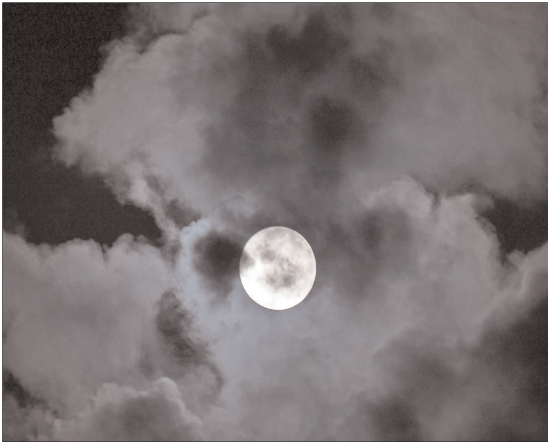
ISLAMABAD: A stunning view of super moon during dark cloudy weather.

In the weeks leading up to Trump's re-election, Iranian officials have signalled a willingness to resolve issues with the West. Iran and the United States cut diplomatic ties shortly after the 1979 Islamic revolution that toppled the US-backed Shah of Iran, Mohammed Reza Pahlavi. Since then, both countries have communicated through the Swiss embassy in Tehran and the Sultanate of Oman.