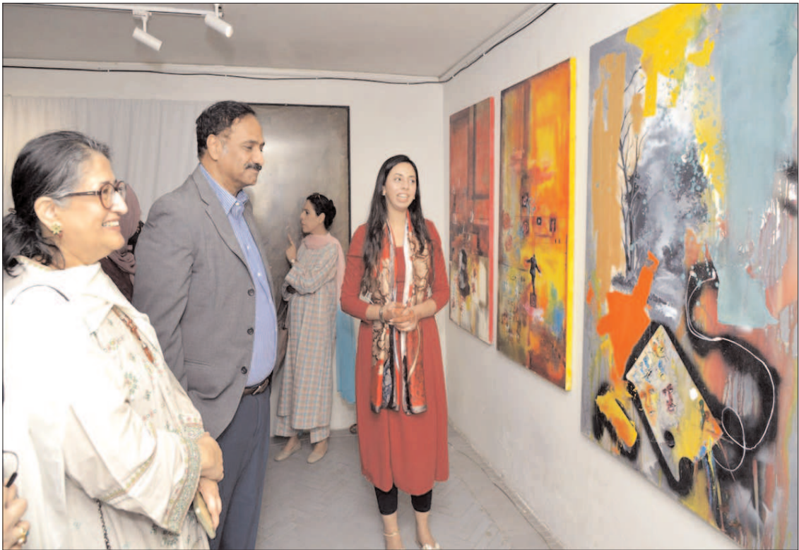
LAHORE: Visitors admire paintings at an exhibition organized by PNCA and LCWU at Shakir Ali Museum.