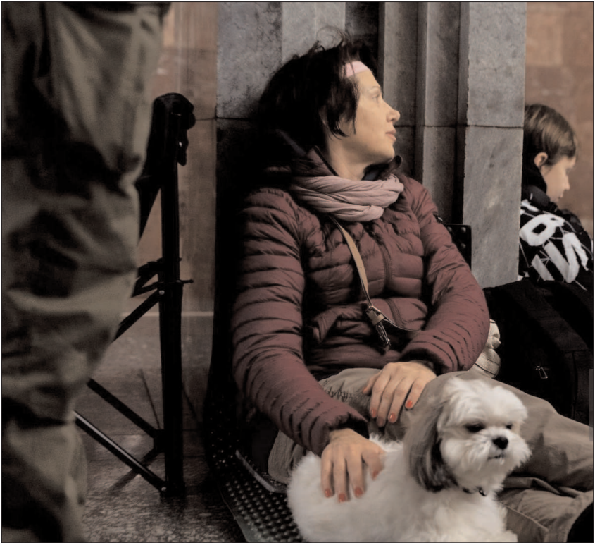
KYIV, UKRAINE: A woman with a dog shelters at the Taras Shevchenko subway station amid a Russian air strike on Sunday.

Ukrainian troops are meanwhile trying to hold an area of land that they seized in Russia's Kursk region in August, something Kyiv has said could one day be a bargaining chip.