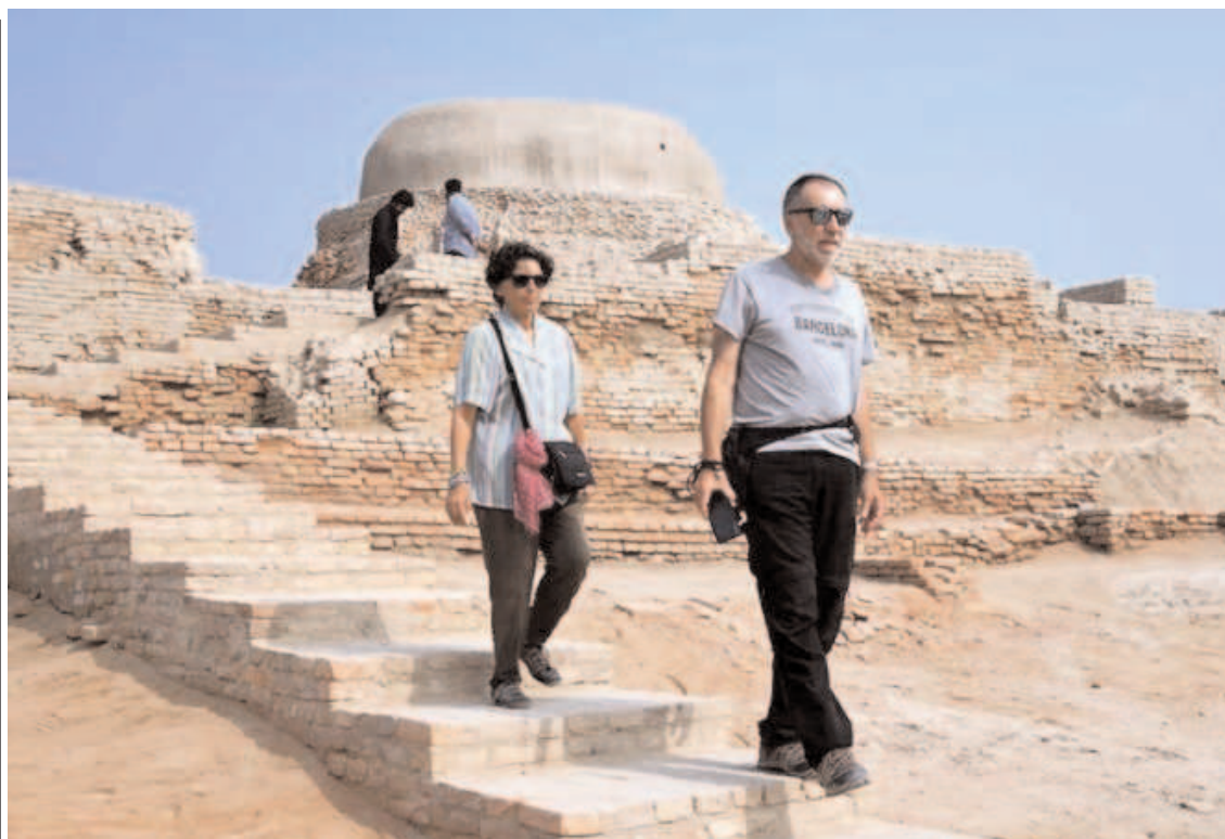
LARKANA: Foreigner visitor visiting the world famous archeological site of Mohen-Jo-Daro.