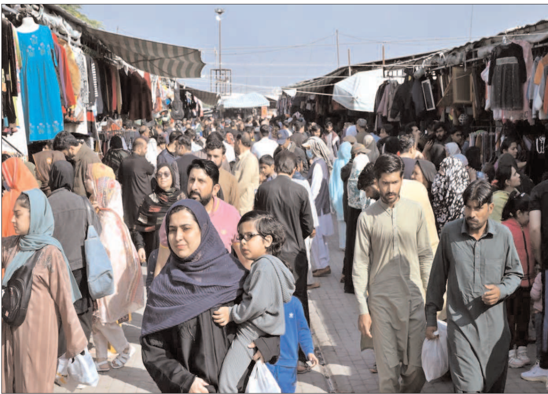
ISLAMABAD: A large number of people busy in shopping at weekly Bazaar in the Federal Capital.