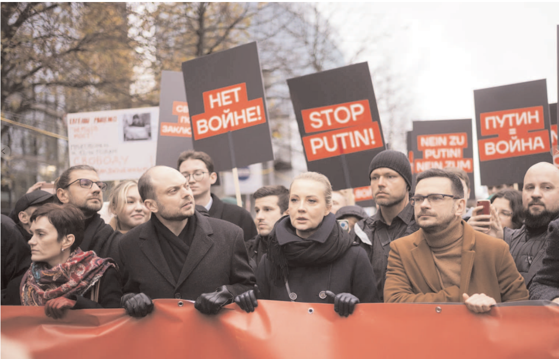
BERLIN: Yulia Navalnaya, center, with Russian opposition politician Vladimir Kara-Murza, center left, and Ilya Yashin, center right, lead a demonstration under the slogan “Stop Putin! Stop the War! Freedom for Political Prisoners!” in Berlin, Germany, Sunday.

prisoner swap in August freed key dissidents and promised to reinvigorate a movement unmoored by the death in prison of Navalny, a charismatic anti-corruption campaigner and arch-Kremlin foe. Instead, tensions have spiked in recent months, as Navalny’s allies and other prominent dissidents swapped accusations that appeared to dash any hopes of a united anti-Kremlin front. Many opposition-minded Russians have voiced deep frustration with the infighting, and with what some view as efforts by rivaling groups to discredit and wrest influence from one another.