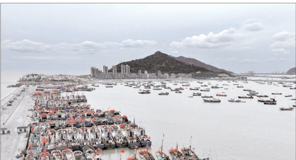
LIANYUNGANG, CHINA: Aerial view of fishing boats moored at the Liandao Central Fishing Port to take shelter from wind and waves brought by cold wave on Sunday in Lianyungang, Jiangsu Province of China.

The deteriorating law and order situation is also affecting our economy badly, he added.