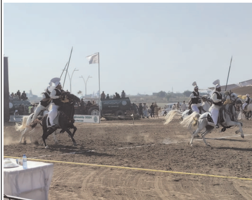
ATTOCK: Horsemen moving towards their target during the tent pegging Championship held in Attock.