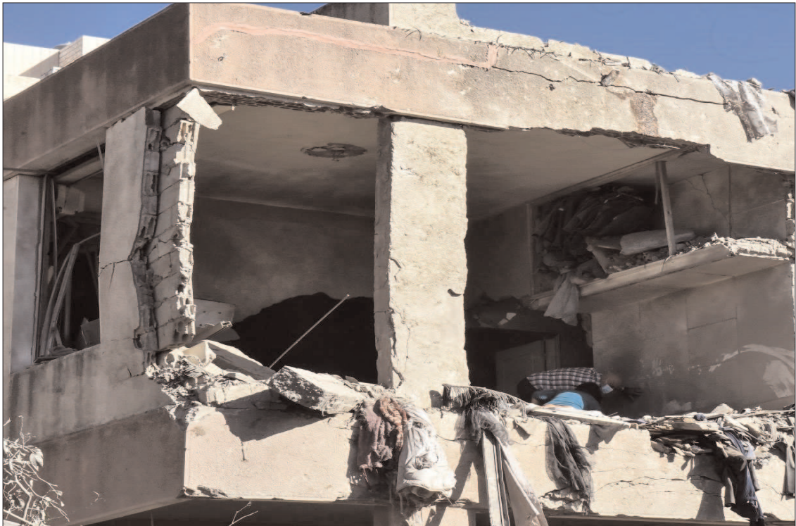
BEIRUT: A view of damaged buildings in the Al Hadath neighborhood after an Israeli airstrike in the Dahieh region of Beirut, Lebanon, on Sunday.