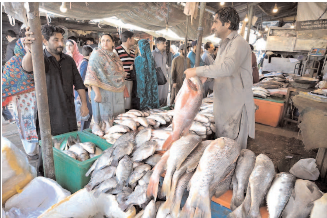
ISLAMABAD: Vendor displaying fish to attract customers at Weekly Bazaar.

The United Nations General Assembly has declared 2025 the International Year of Glacier Preservation, while Tajikistan will host the International Conference on Glaciers' Preservation in Dushanbe next year.