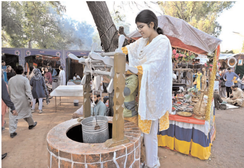
ISLAMABAD: A girl is fetching water at a stall during the 10-Day 'Folk Festival (Lok Mela) 2024'.

She said the Prime Minister's Free Laptop Scheme was playing important role in enhancing access to digital tools. She said work is underway on the Smartphones for All Policy.