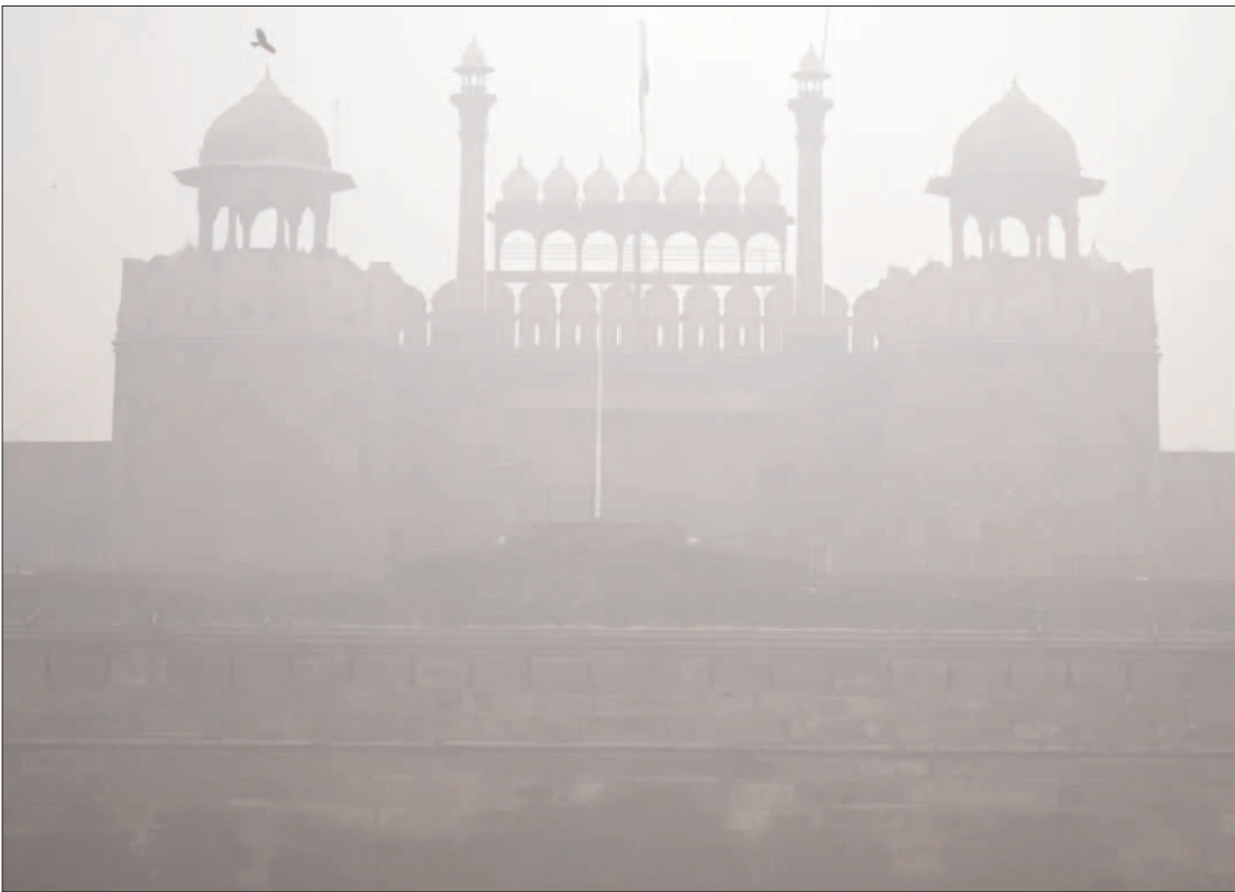
NEW DELHI: Thick smog engulfs the Mughal-era Red Fort in the Indian capital.

Austin's visit is his fourth to the Southeast Asian country and likely his last before he relinquishes his post in January when former President Donald Trump returns to the White House. In a brief statement posted on X, Austin said the US and the Philippines are "committed to deepening our alliance, strengthening regional security, and upholding our shared values in the Indo-Pacific". Teodoro did not make any remarks at the signing ceremony, but the DND said the deal was "a critical step to enhance information sharing and deepen interoperability between the Philippines and the US". Security engagements between Manila and Washington have deepened under US President Joe Biden and his Philippine counterpart, Ferdinand Marcos Jr, with both leaders eager to counter what they see as China's aggressive policies in the South China Sea and near Taiwan. — Aljazeera