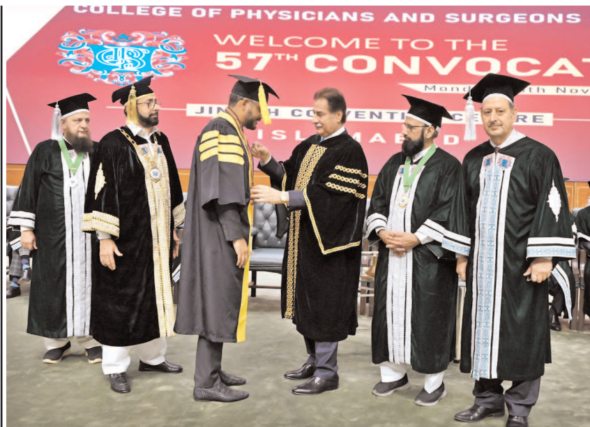
ISLAMABAD: Speaker National Assembly awarding Gold Medal to distinguished achievers at 57th Convocation of College of Physicians and Surgeons of Pakistan.

SSP Operations said that the Islamabad Police is actively working to ensure the safety of citizens' lives and property in the federal capital, emphasizing that no elements will be allowed to disrupt citizens' peace. Protecting the lives, property, and dignity of citizens is the Islamabad Police's top priority.