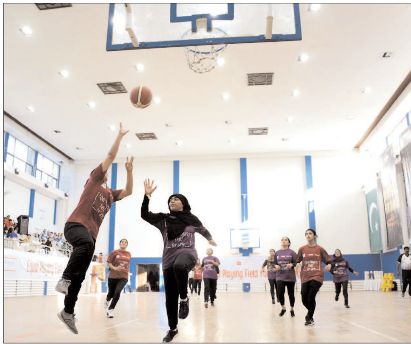
ISLAMABAD: A view of basketball match during girls basketball tournament.

England will find out their World Cup qualifying opponents on 13 December, with the first games scheduled to take place in March.