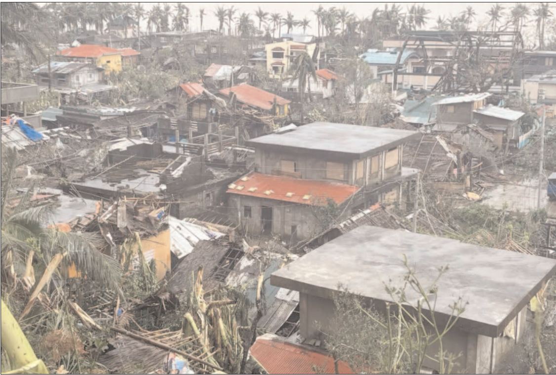
MANILA: Houses damaged by Typhoon Man-yi in Viga, Catanduanes province, Philippines.

Her protest last month drew immediate ire from across the political aisle, as well as from some prominent Aboriginal and Torres Strait Islander leaders. But it also drew praise from some activists who argued that it highlighted the plight of Australia's first inhabitants, who endured colonial violence and still face acute disadvantages in terms of health, wealth, education, and life expectancy compared to non-Indigenous Australians.