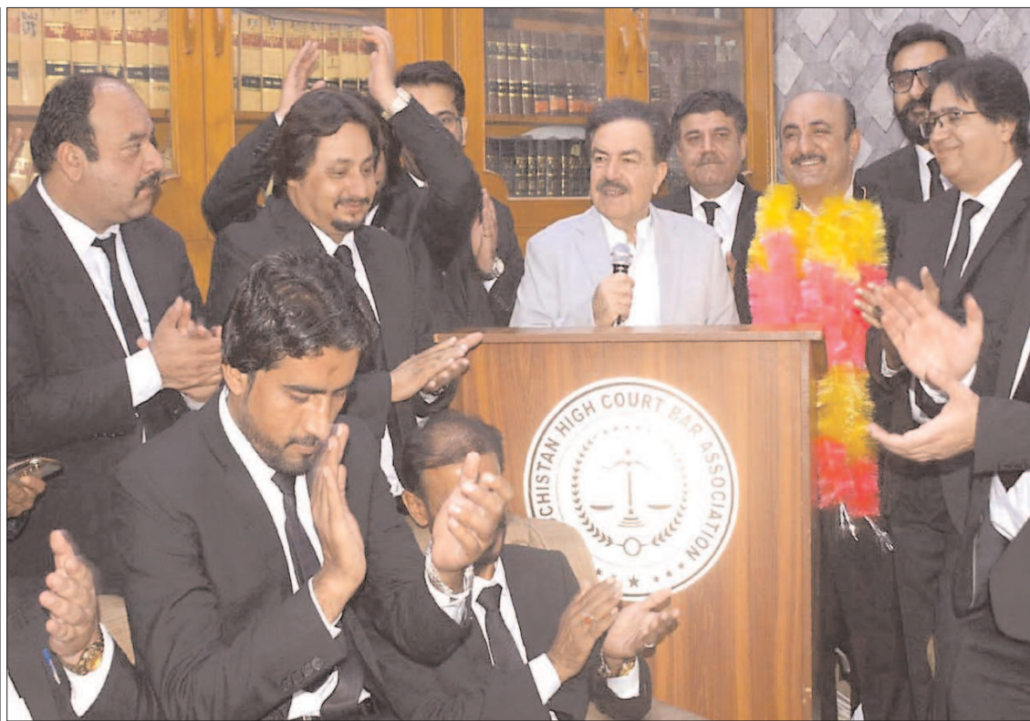
QUETTA: Governor Balochistan, Jafar Khan Mandukhel speaking during a ceremony at High Court Bar.

Mir Ali Hassan Zehri once again expressed his determination that we will not rest until the scourge of terrorism is uprooted. He also paid tribute to the security forces and assured that just as our brave forces and other security forces are protecting the homeland day and night in the war against terrorism, the entire nation is standing by the side of the security forces too.