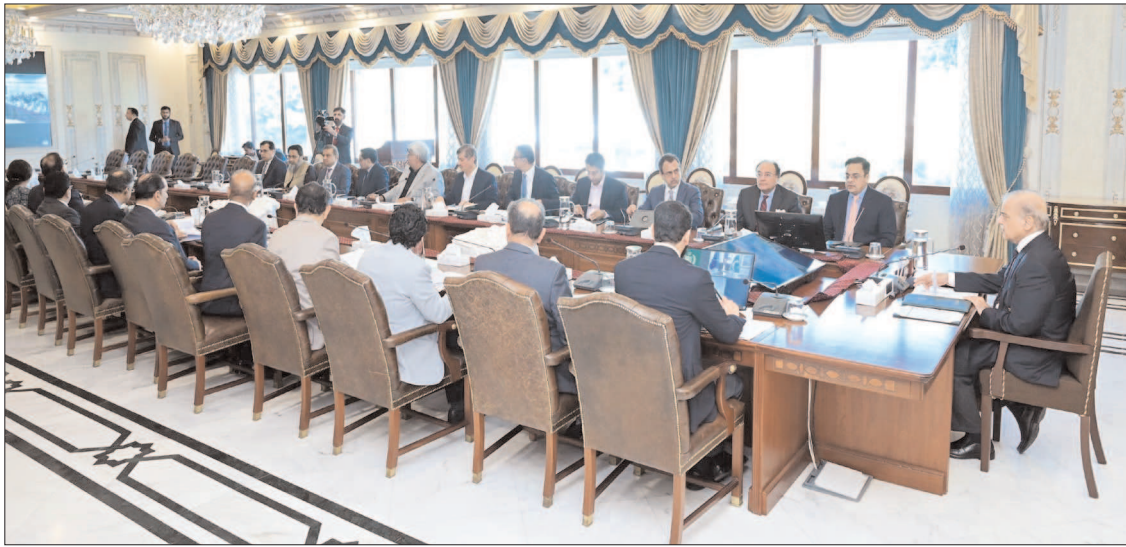
ISLAMABAD: Prime Minister Shehbaz Sharif receiving a briefing from the Ministry of Finance regarding country's economy and meeting with IMF delegation.

Meanwhile, at least two people including a minor girl were critically injured when a blast occurred inside a house in South Waziristan on Monday. Police said the incident occurred in Laddha tehsil of South Waziristan where a minor girl and a man were critically injured in an explosion inside their house. The injured were rushed to the district headquarters hospital for treatment.