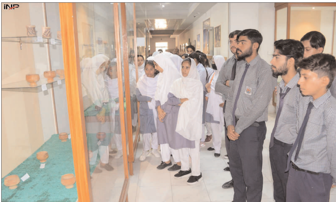
QUETTA: Students of Don Bosco School Quetta visiting Mehrgarh Museum.