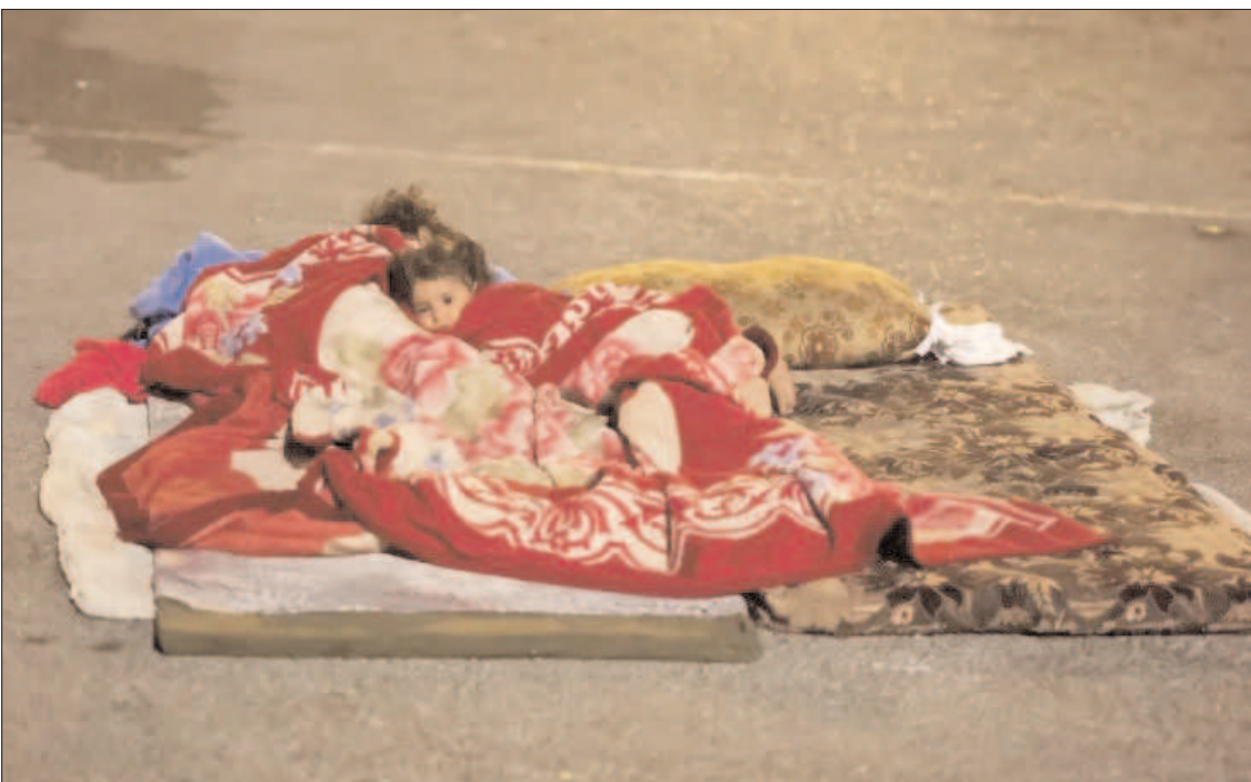
BEIRUT: Children in Lebanon have disrupted sleep, are haunted by nightmares, and struggle with headaches and loss of appetite.