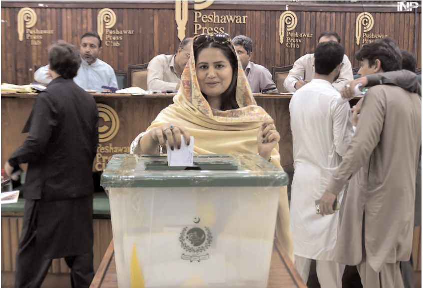
PESHAWAR: Female journalist casting vote during election of Khyber Union of Journalist at PPC.