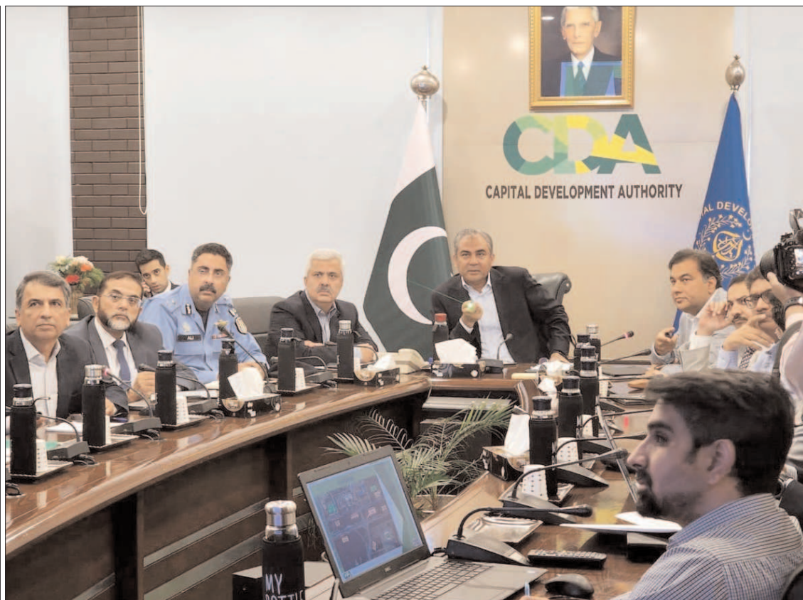
ISLAMABAD: Federal Minister for Interior Mohsin Naqvi chairing a meeting in CDA Headquarters Islamabad.

Additionally, concerns over water contamination at Khanpur Dam were raised, and urgent steps are being planned to make drinking water safe for Islamabad residents. The meeting concluded with a commitment from all stakeholders to resolve outstanding issues collaboratively and work toward a sustainable water supply for Islamabad.