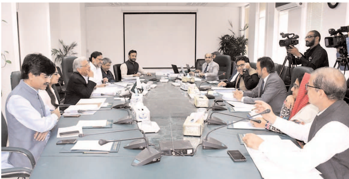
ISLAMABAD: Federal Minister for Industries and Production Rana Tanveer Hussain chairing 22nd Board of Directors meeting of SMEDA.

The price of gold in the international market decreased by $25 to $2,752 from $2,777, the Association reported.