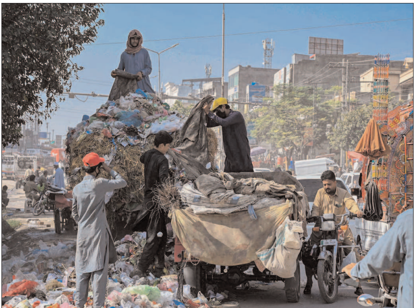
ISLAMABAD: Gypsy men searching valuables from garbage dump at Khanna Pul.

115 grams heroin was recovered from an Afghan national arrested near Torkham border. Cases under the Anti-Narcotics Act have been registered against the arrested accused and further investigations are under process.