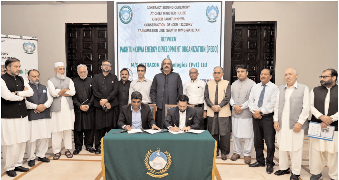
PESHAWAR: Chief Minister Khyber Pakhtunkhwa Ali Amin Khan Gandapur witnessing signing ceremony of power transmission line project at CM's House.

Addressing concerns about mismanagement, Kundi urged the provincial government not to use security as an excuse for inefficiencies. He emphasized the need to increase exports and expressed his intention to hold a meeting of the Special Investment Facilitation Council (SIFC) in Peshawar, as the province's interests have not received adequate attention. He highlighted the significance of the Chashma Lift Canal project, financed by Islamic banks, and shared his efforts to strengthen ties between Khyber Pakhtunkhwa traders and Saudi investors during the upcoming visit of a Saudi delegation next month. Kundi also stressed the importance of trade with Central Asia and called for initiatives to enhance business access through the Wakhan Corridor. He mentioned plans for the Governor of Tajikistan's Khatlon Province to visit Khyber Pakhtunkhwa to explore business opportunities. Furthermore, he announced efforts to expand health facilities similar to those available in Sindh and Punjab to Khyber Pakhtunkhwa, beginning with discussions among the provincial chief secretaries. The business community commended Governor Kundi for his dedication and efforts to address their concerns and improve the economic landscape of Khyber Pakhtunkhwa.