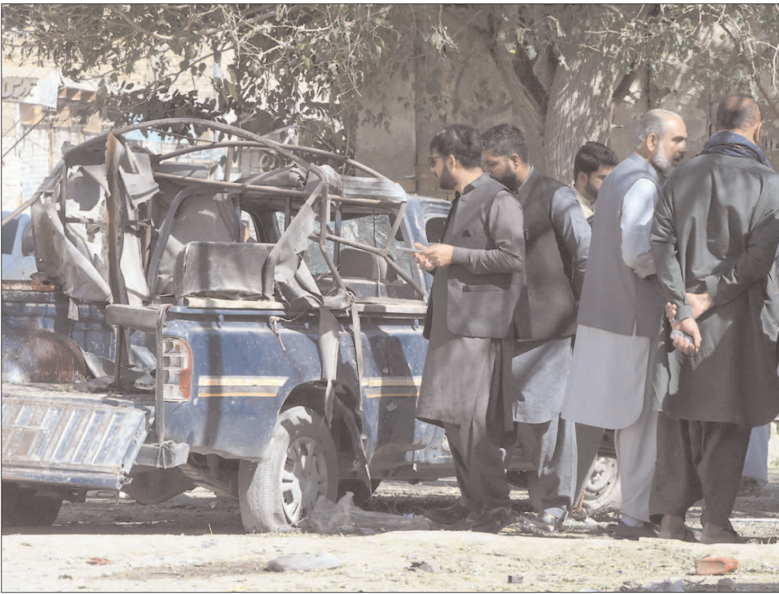
MASTUNG: Officials inspecting a damaged vehicle after bomb blast.

Borrell and Iwaya also shared "grave concern" about Russia's deepening military cooperation with North Korea, including the North's troop deployment to Russia and arms transfers between the two countries, according to an EU statement. The two officials reiterated their commitment to supporting Ukraine and condemned Russian aggression. Japan, under a new security strategy adopted in 2022, has been rapidly accelerating its military buildup through its alliance with the United States, its only treaty ally, and other partners, including Australia, the United Kingdom and a number of European and Asia Pacific countries, to deter an increasingly assertive China. — Agencies