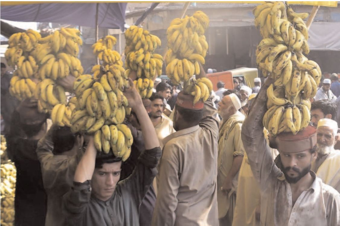
PESHAWAR: Men carrying bananas during a busy hour at Fruit Market.

throw of the elected Govt of Prime Minister Zulfikar Ali Bhutto," he said. The opposition alliance i.e. Pakistan National Alliance (PNA), launched a nationwide agitation claiming electoral fraud after ZA Bhutto's Pakistan Peoples Party won a landslide victory in the 1977 general election. Despite Bhutto's frequent denial of any rigging, the PNA's protests escalated into widespread unrest, leading to overthrowing of an elected Bhutto Govt on July 5, 1977, marking the beginning of the third dictatorship in the country. He said the cycle of political intolerance continued into the 1980s and 1990s after successive governments of PPP and PMLN were removed on allegations of corruption and electoral manipulations. Dr Hilali said as a result of political chaos, the Govt of former Prime Minister Nawaz Sharif's Government was dismissed and democracy was derailed for the fourth time on October 12, 1999.