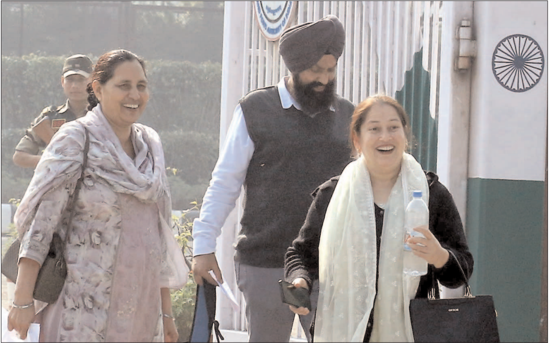
KARTARPUR: Indian Sikh Yatrees arriving at Pakistan-India border to attend birth anniversary celebration of Guru Nanak.