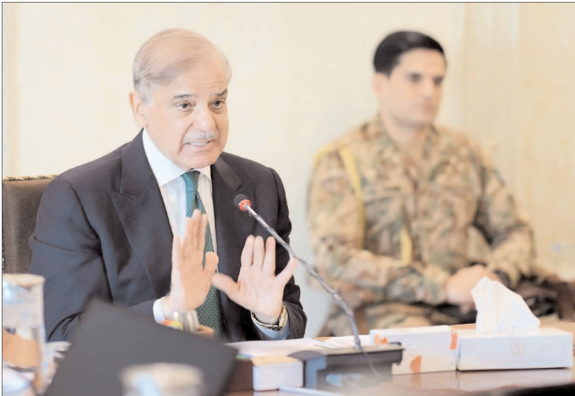
ISLAMABAD: Prime Minister Shehbaz Sharif chairing a meeting of Federal Apex Committee on National Action Plan.