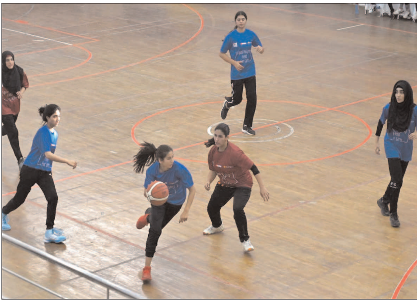
ISLAMABAD: Players of Net Warriors and Islamabadians teams struggling to get hold on ball during Girls Basketball Tournament at Sports Complex.

A total of eight teams from different areas of Islamabad participated in the tournament, which was held under the theme 'Equal Playing Field'.