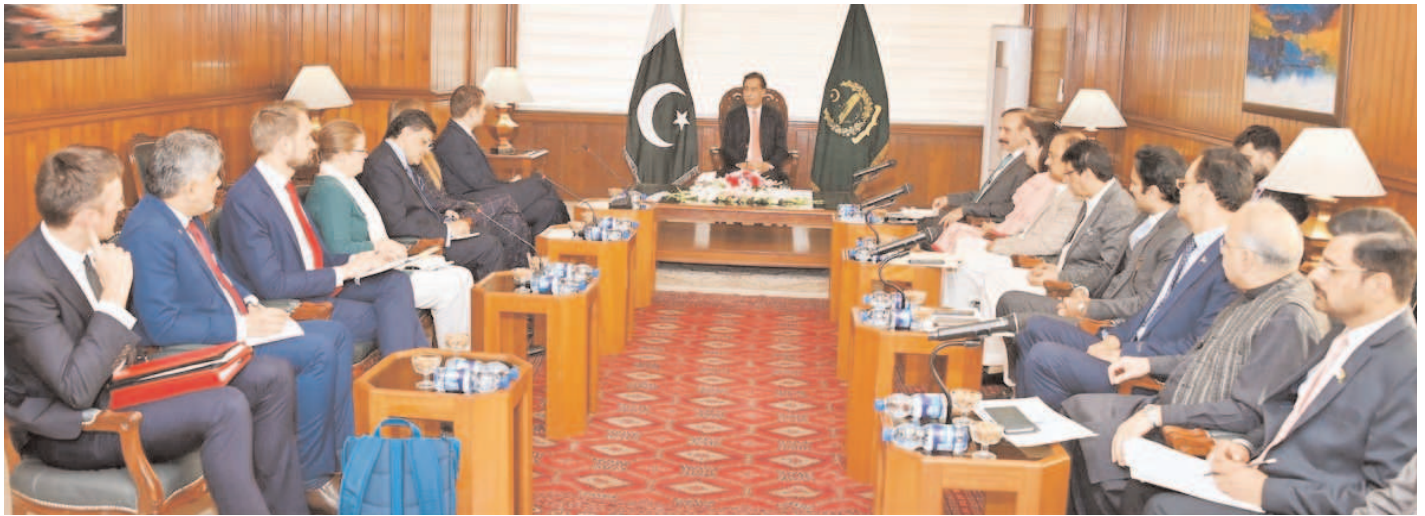
ISLAMABAD: Speaker National Assembly Sardar Ayaz Sadiq in a meeting with Minister/Parliamentary Under-Secretary of State at Foreign, Commonwealth & Development, United Kingdom Mr. Hamish Falconer along with delegation at Parliament House.