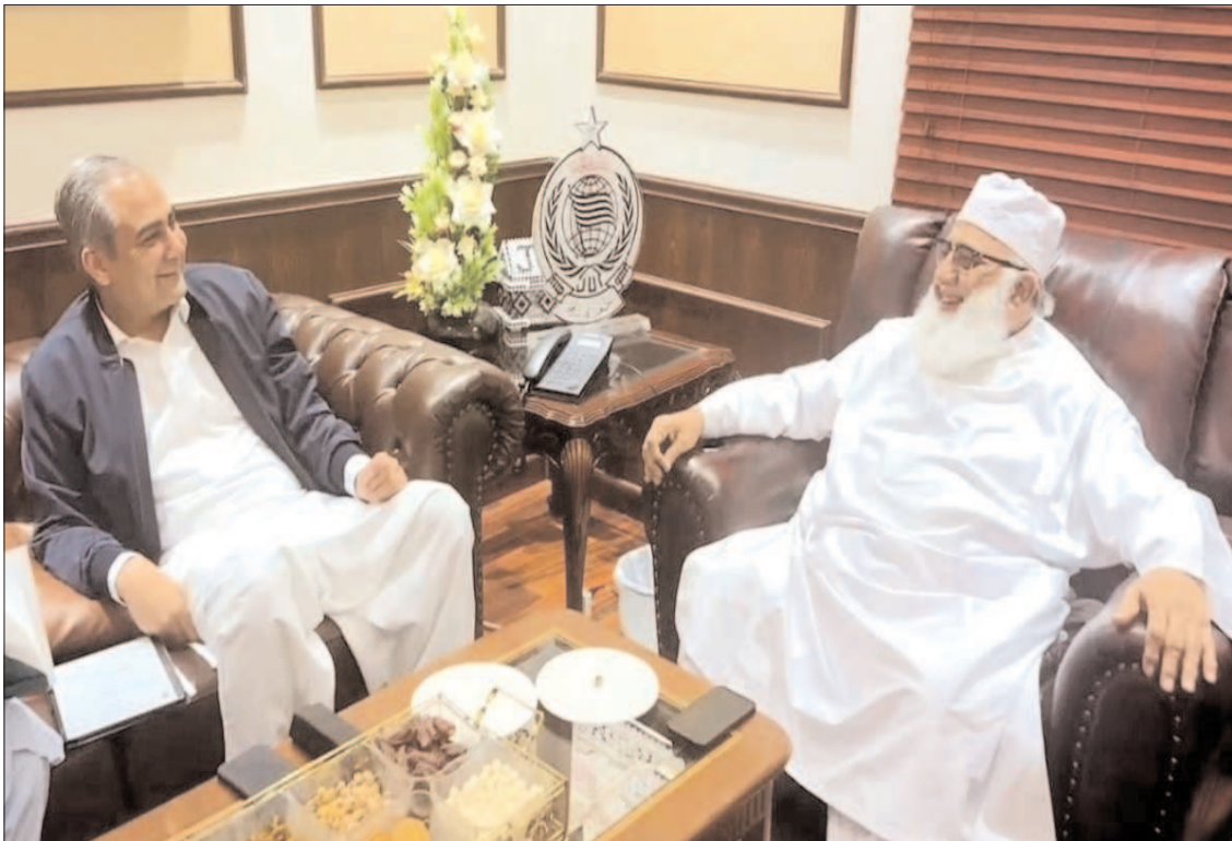
ISLAMABAD: Federal Minister for Interior Mohsin Naqvi in a meeting with JUI Chief Maulana Fazlur Rehman at his residence.